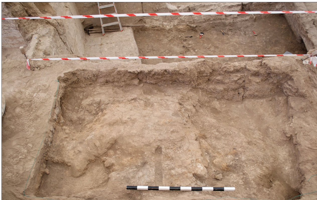
Figure S14.26. West-facing photograph showing section through B.89's southwestern infill quadrant.