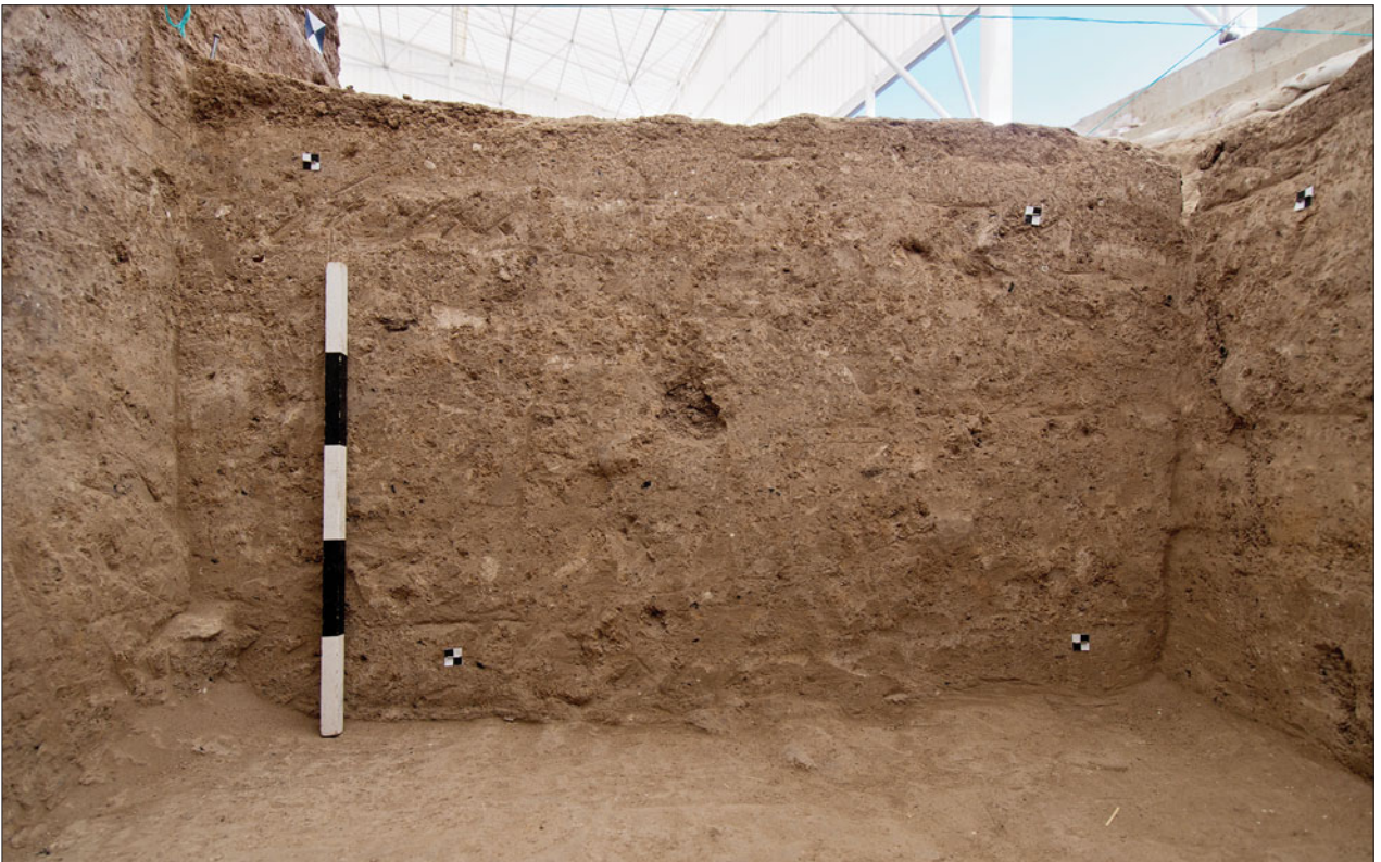
Figure S14.25. West-facing photograph showing section through B.89's northwestern infill quadrant.