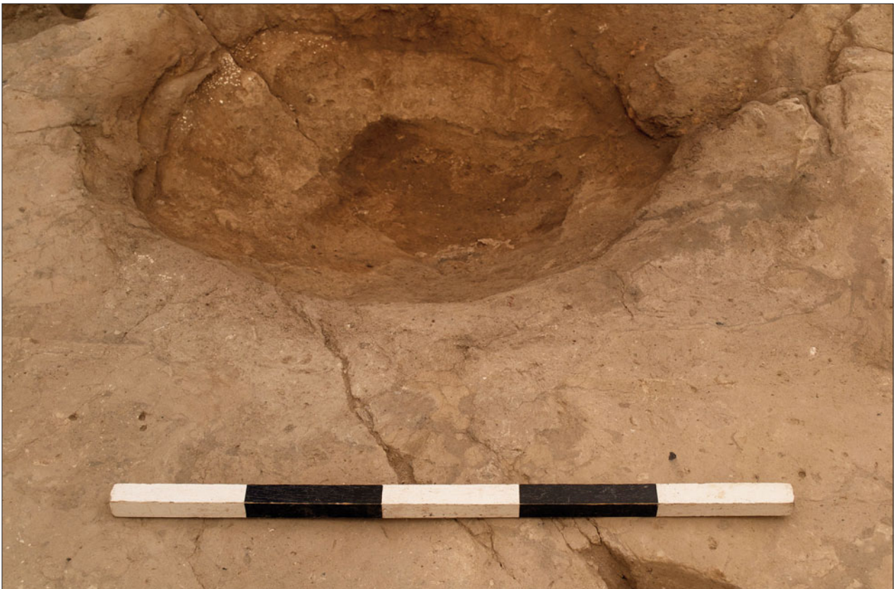
Figure S14.9. South-facing photograph showing hearth repair (21924).