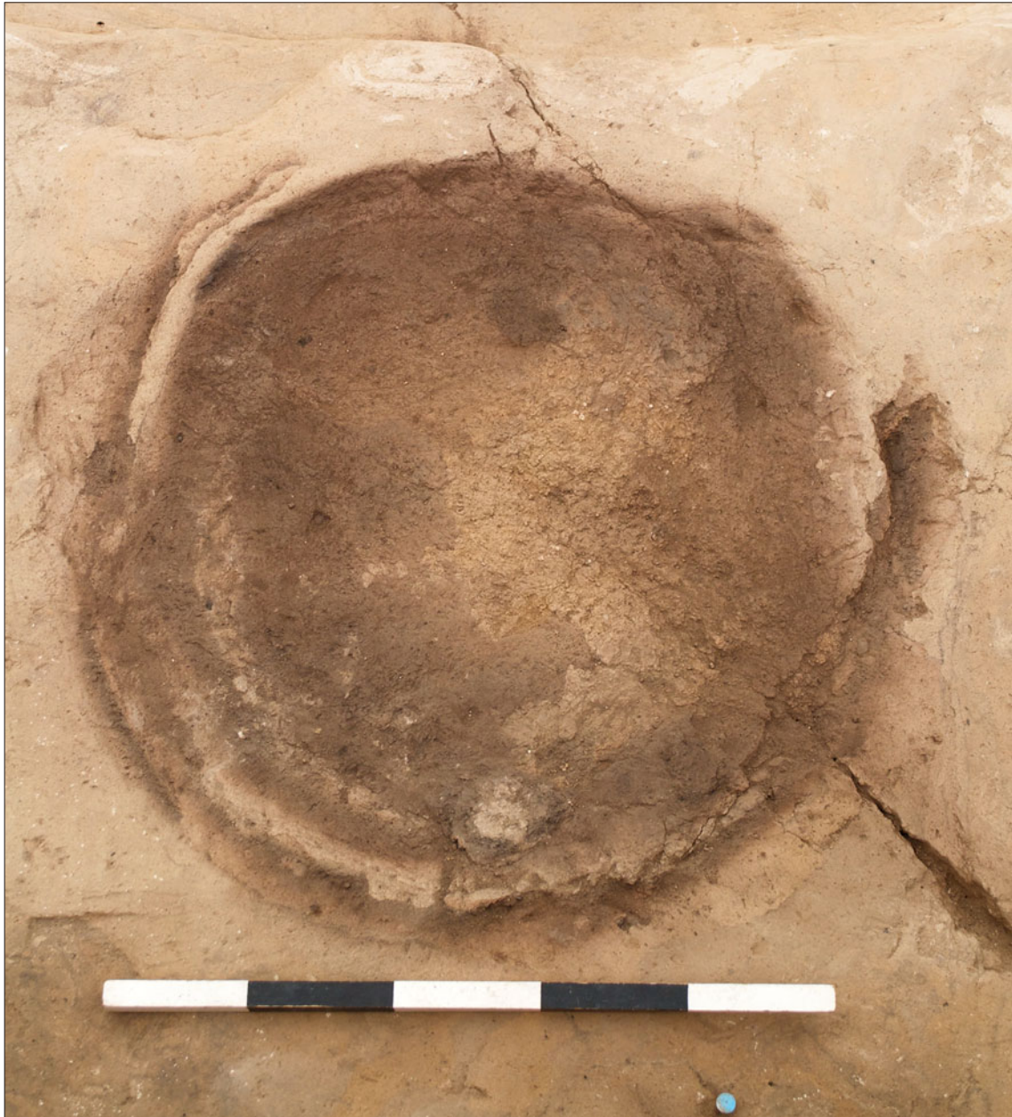
Figure S14.23. North-facing photograph showing the final state of structured hearth (F.3472), prior to closure of B.89.