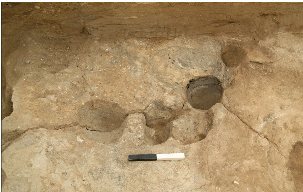
Figure S14.6. South-facing photograph showing cuts (stake holes?) associated with hearth (units: 21961, 21963 and 21966).