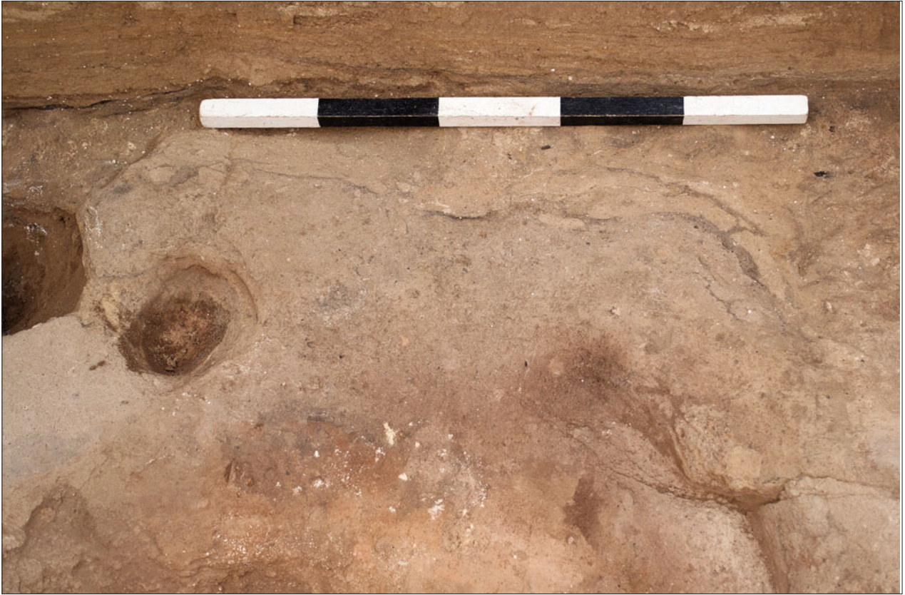
Figure S14.8. South-facing photograph, hearth (units 21995 and 21927).