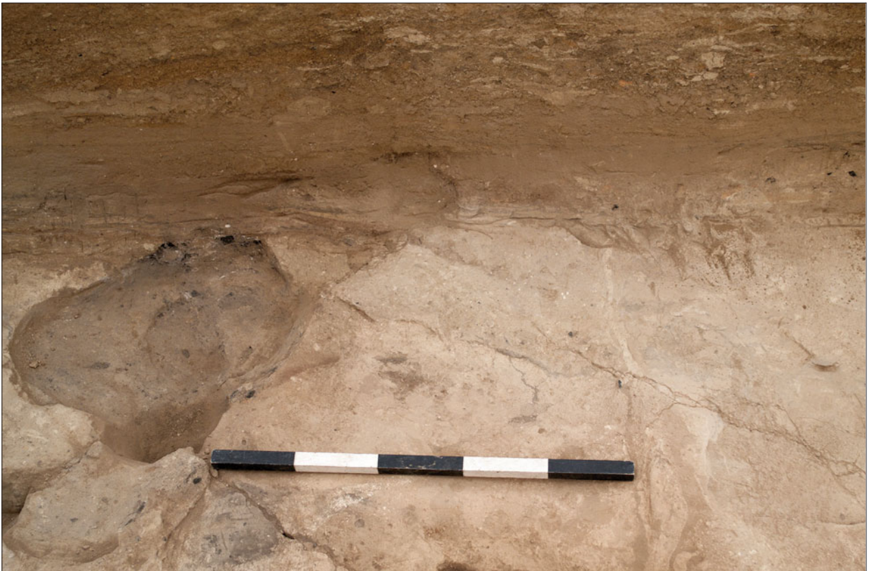
Figure S14.5. South-facing photograph, hearth remodelling (21972).