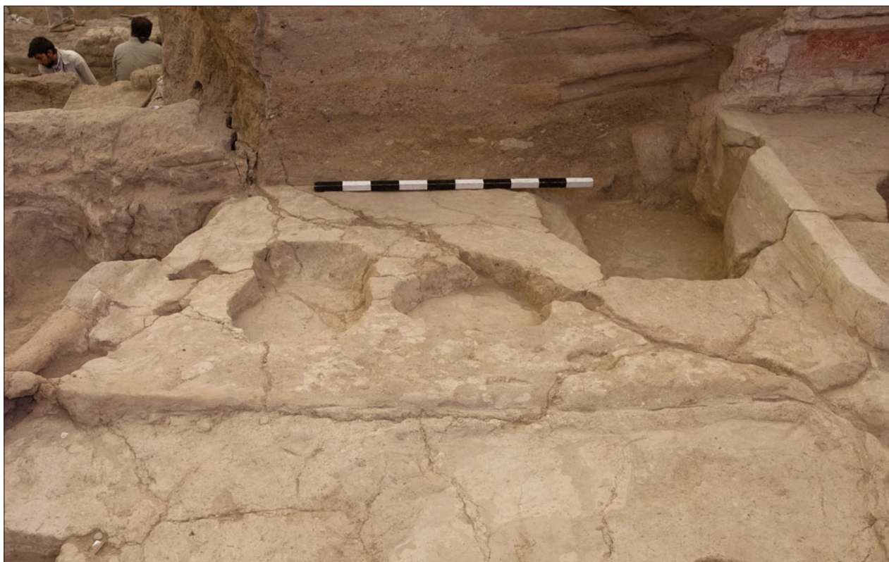
Figure S14.2. North-facing photograph showing platform modification (21974) related to the north central and northeastern platforms in B.89 (photograph by Gesualdo Busacca).