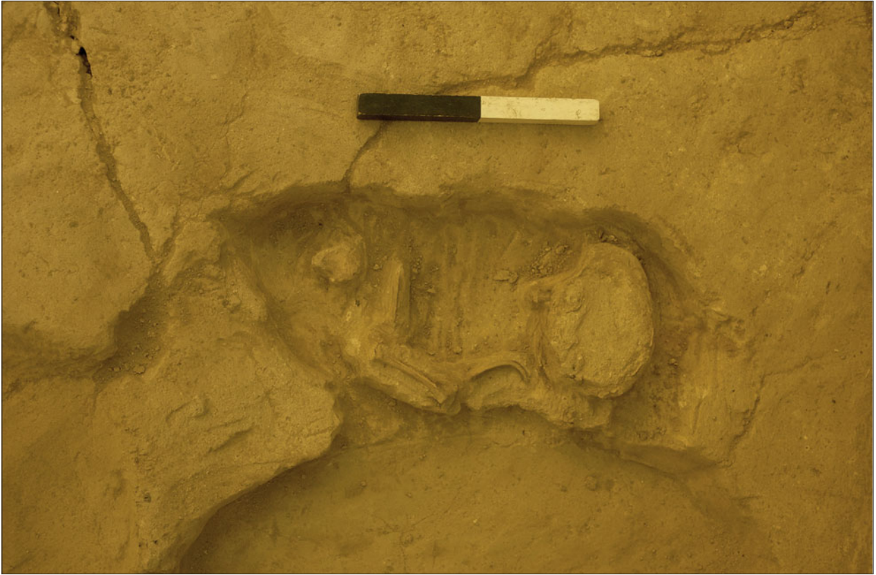
Figure S14.4. East-facing photograph showing skeleton (21977).