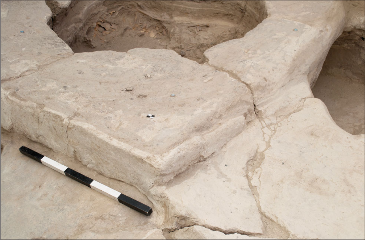
Figure S14.22. Northeast-facing photograph showing plaster (30908) sealing burial sequence.