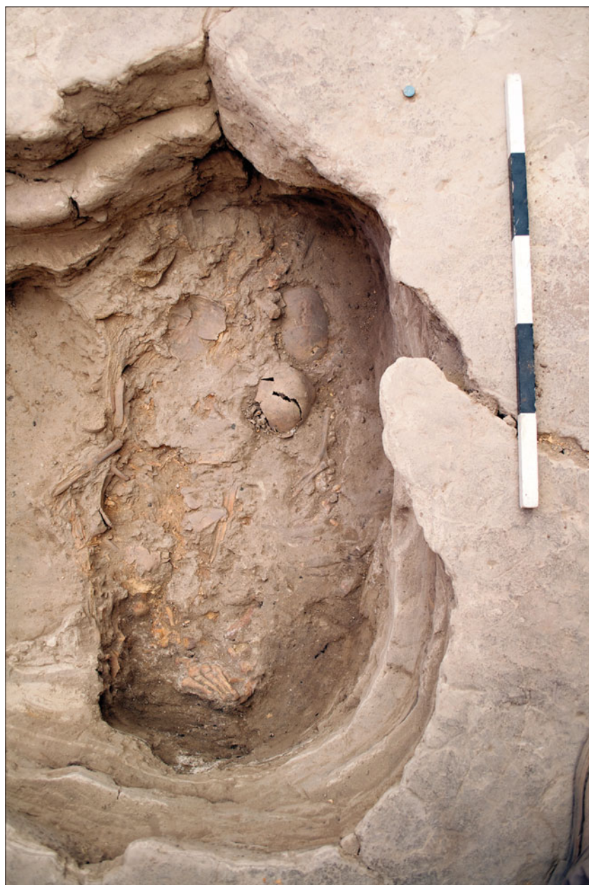
Figure S14.15. North-facing photograph showing cluster (30920).