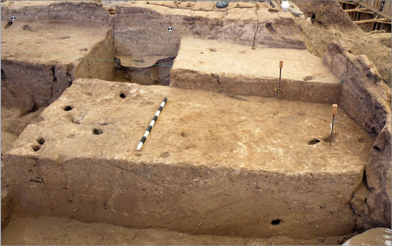
Figure S14.24. Northeast-facing photograph showing the northeast portion of the space at the end of its occupation, including the post-retrieval pits.