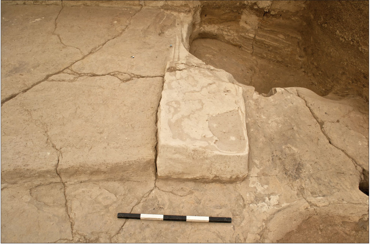
Figure S14.13. East-facing photograph showing bench, F.3476.