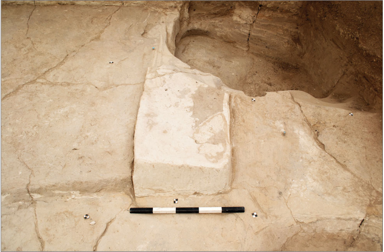
Figure S14.20. East-facing photograph showing bench modification (30918).