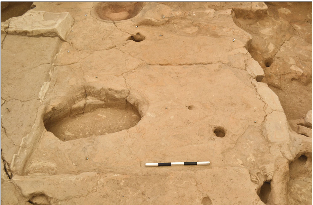
Figure S14.17. South-facing photograph showing central floor (19835) (photograph by Matteo Pilati).