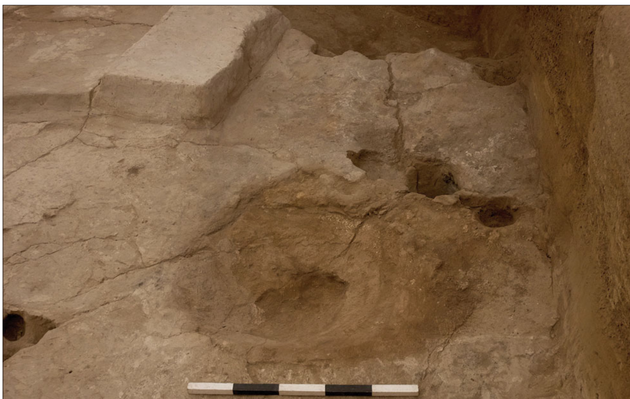
Figure S14.7. East-facing photograph showing dirty floor (21957) and fire-spot (21923).