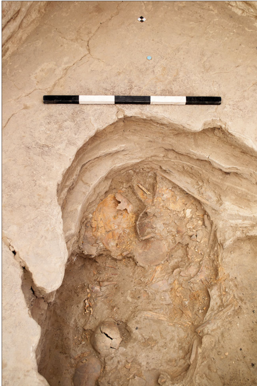
Figure S14.14. North-facing photograph showing cluster (30914).