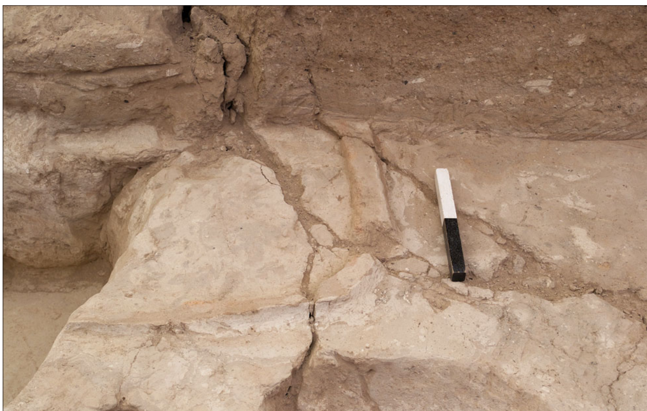
Figure S14.3. North-facing photograph showing bin (21951).