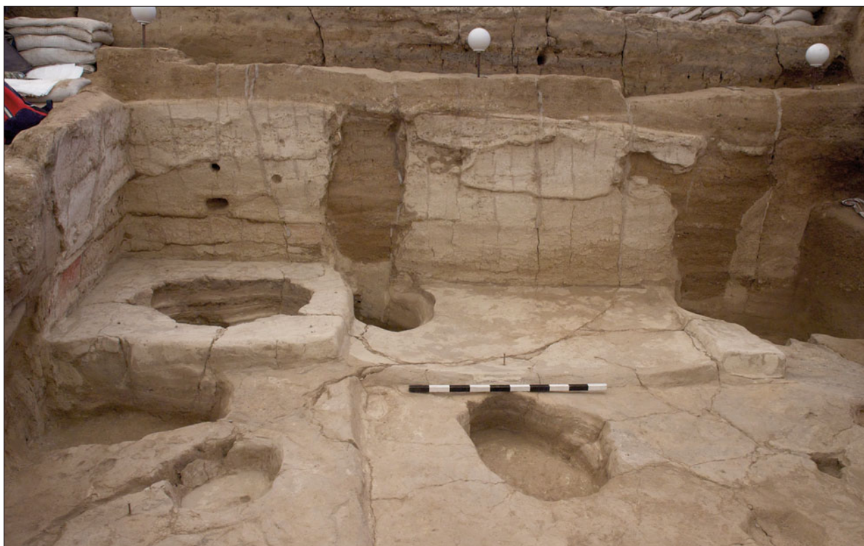
Figure S14.12. East-facing photograph showing surface (21910) of east central platform; note the pit cut in the north central platform (bottom left).