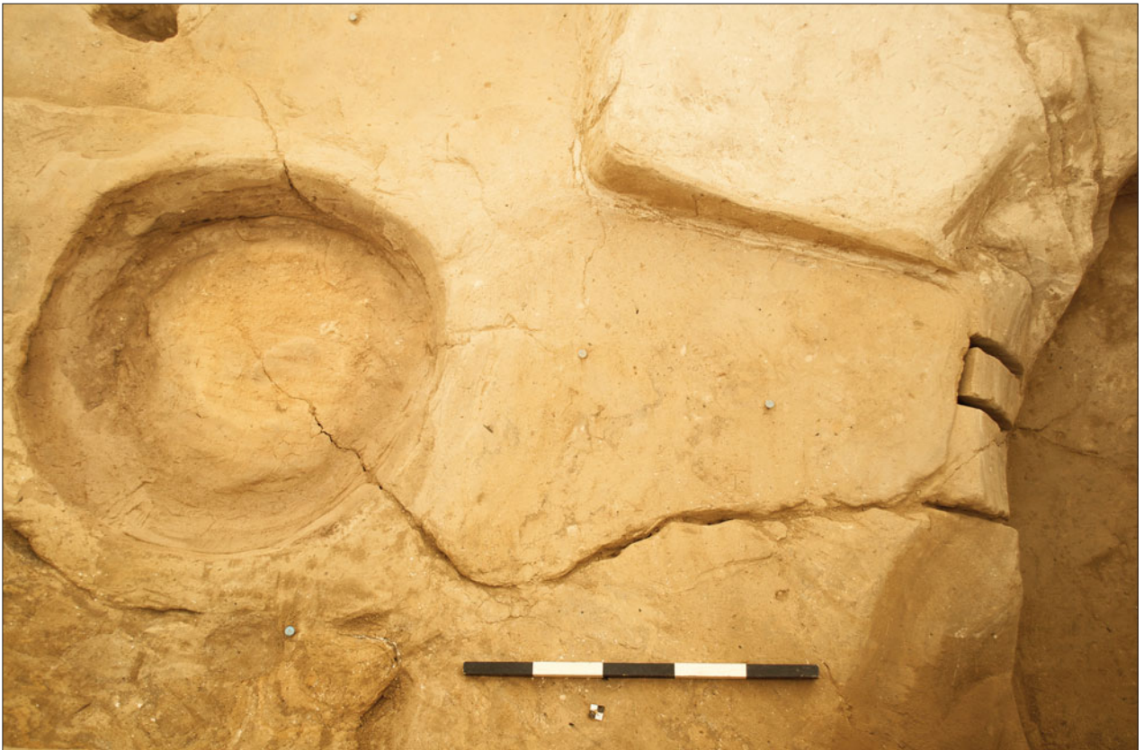
Figure S14.21. North-facing photograph showing latest dirty floor (19885).