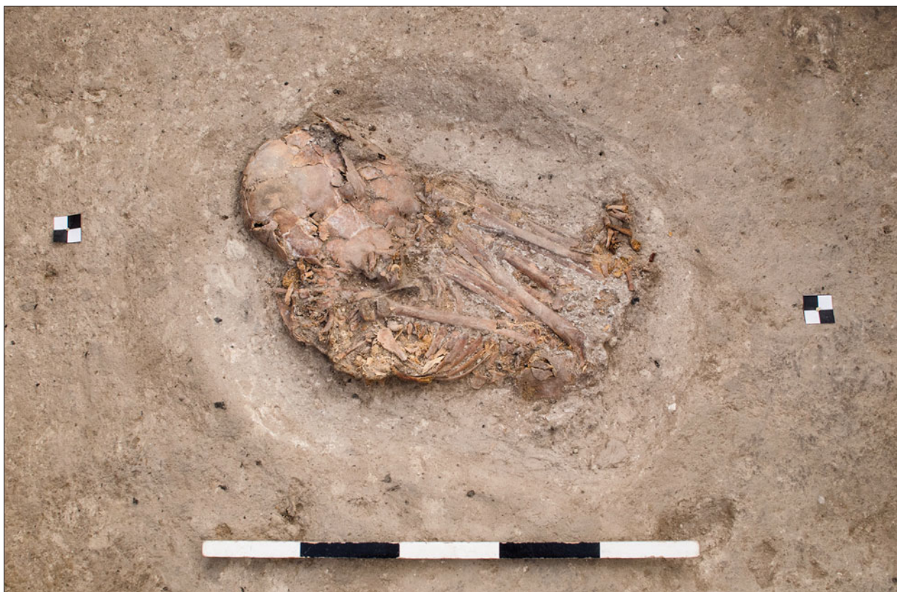
Figure S14.27. North-facing photograph showing burial F.8008.