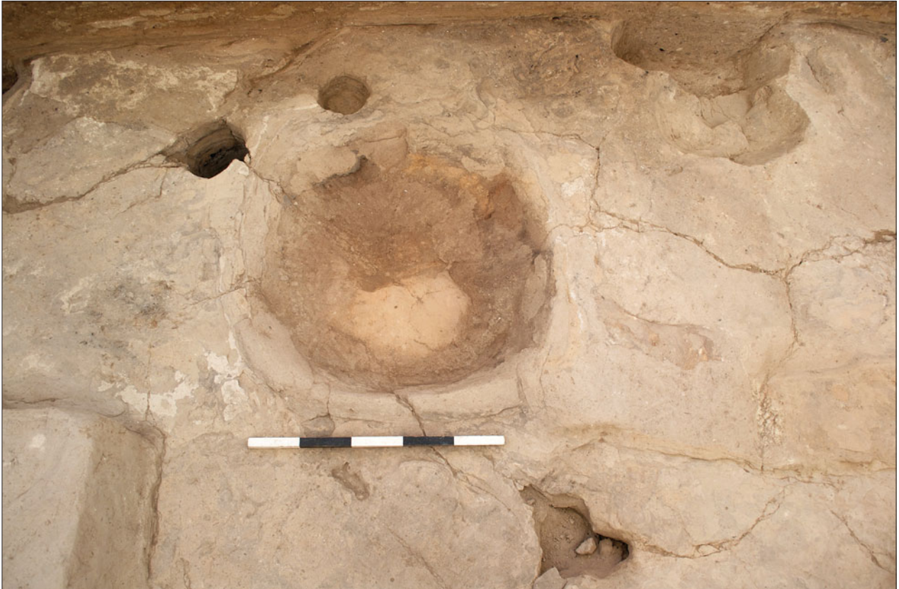
Figure S14.16. South-facing photograph showing hearth structure (30964).