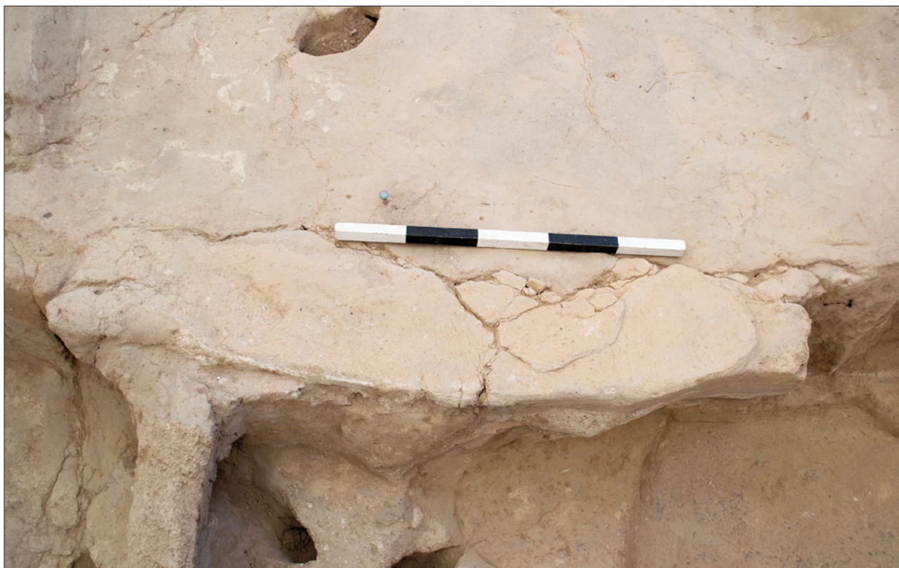
Figure S14.11. East-facing photograph showing partition wall (30971) (photograph by Maurizio Forte).