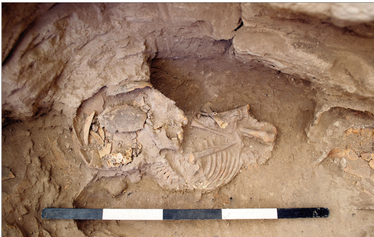
Figure S14.18. North-facing photograph showing incomplete burial F.3478.