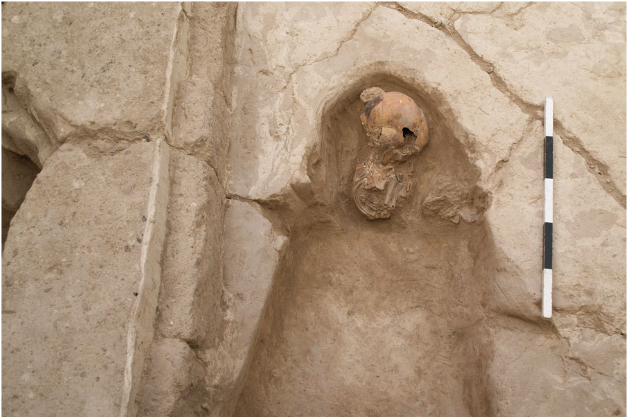
Figure S14.1. West-facing photograph showing burial cut (21985) and skeleton (21981).