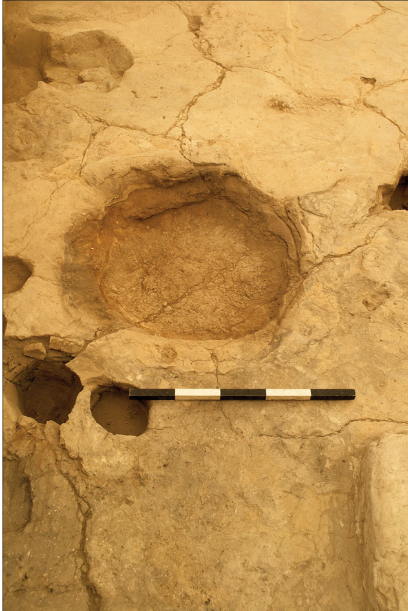
Figure S14.10. West-facing photograph showing hearth cut and structured rim (21900).