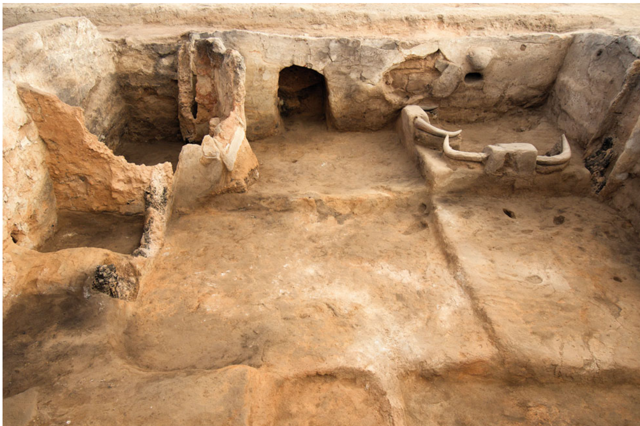
Figure 22.4. North-facing view of main room (Sp.336) of B.77 in 2008.