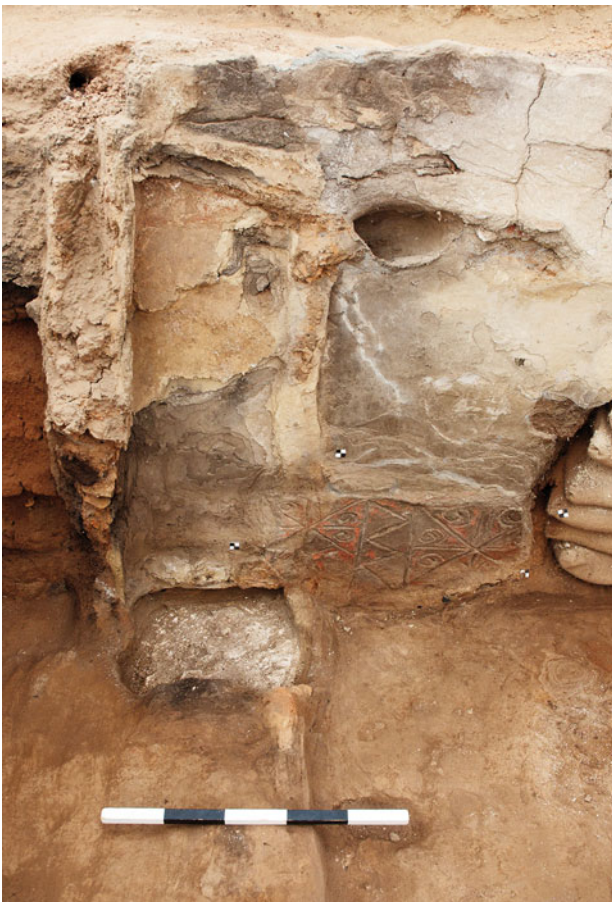
Figure 22.23. Bin F.3613. Notice how the construction of the bin seals the incised panel. The feature was later incorporated into F.6050.