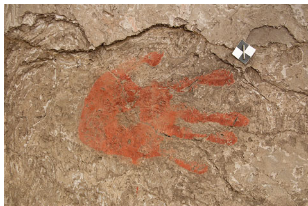
Figure 22.27. Single red hand from the three hands found on the eastern wall in 2012.