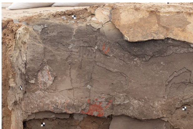
Figure 22.26. Perpendicular handprints on the eastern wall.