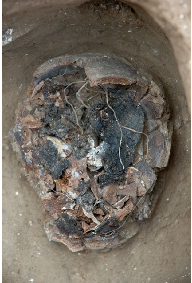
Figure 22.44. Carbonised brain tissue within cranium (19500).