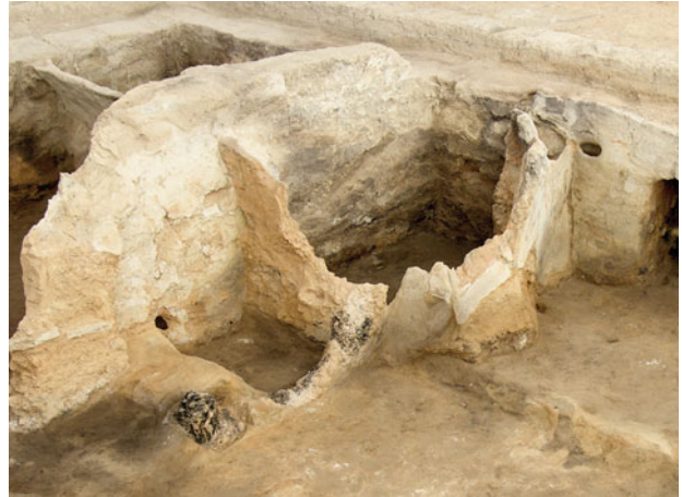
Figure 22.35. 'Bin' F.6050 at the end of the building's life history.