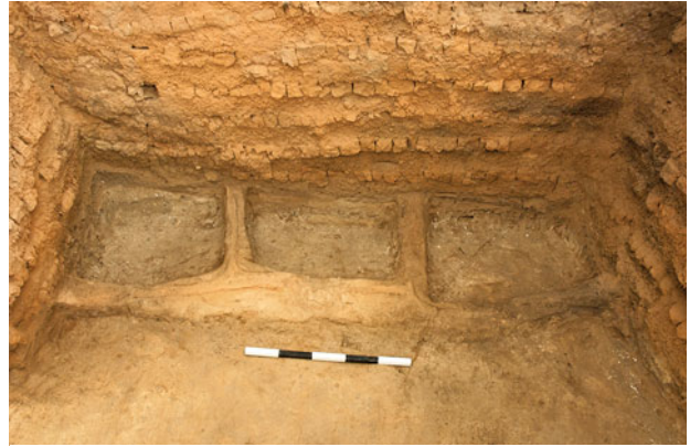
Figure 22.18. The triple basin structure F.3091 prior to its excavation in 2010.