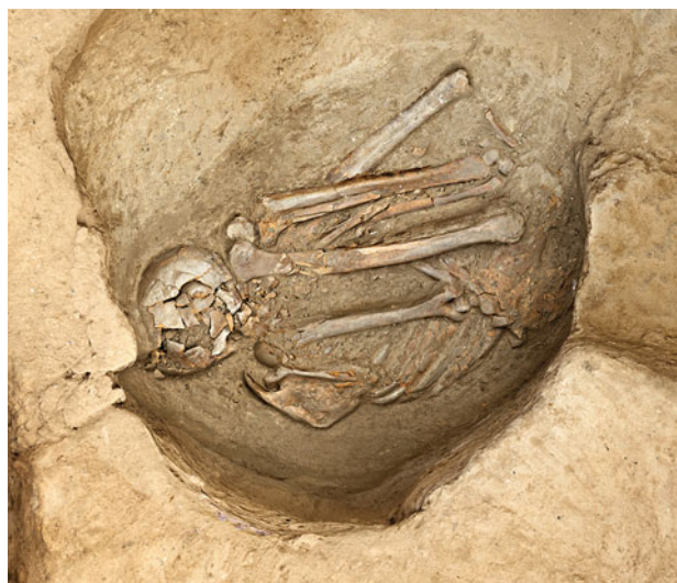
Figure 22.13. Burial F.7309, skeleton (30173) (orthophoto from a 3D model produced by Scott Haddow).