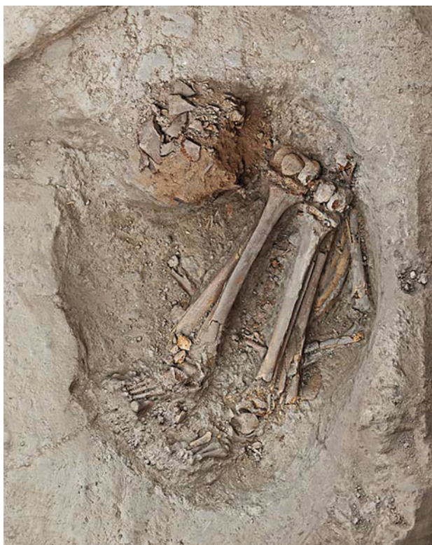
Figure 22.14. Burial F.7133, skeleton (20685) (orthophoto from a 3D model produced by Scott Haddow).