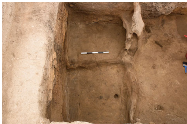
Figure 22.16. East-facing view of double bin F.3092 prior to its excavation in 2010 (photograph by Max Rosefigura).