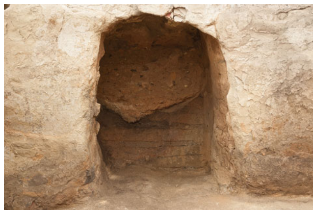
Figure 22.39. Niche F.6063, carved into the northern wall of B.77, in 2008, immediately after its exposure.