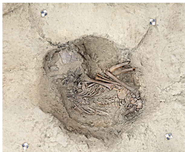
Figure 22.11. Burial F.7609, skeleton (21602). Facing north (orthophoto from a 3D model produced by Scott Haddow).