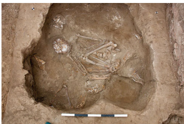
Figure 22.41. Female adult skeleton (20683) in burial F.3687.