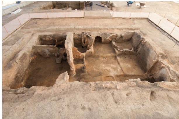
Figure 22.1. Building 77 in 2008, facing north.