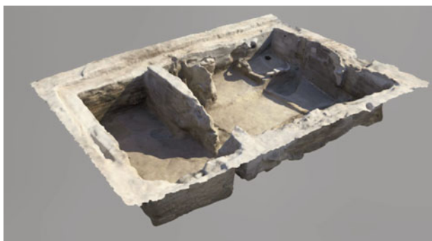
Figure 22.5. Image-based 3D model of B.77 midway through its excavation (model built by Maurizio Forte and Nicola Lercari).