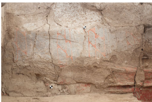
Figure 22.31. Geometric design F.8148, as first uncovered in 2010 by the eastern platform on the lower half of the surviving wall.