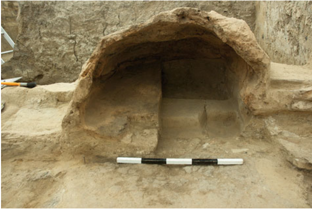
Figure 22.34. Oven (F.7108) superstructure and earliest floor. Note that wall F.3096 was excavated before the oven was revealed.