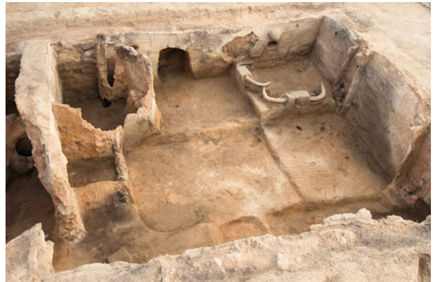
Figure 22.47. North-facing overview of northern and eastern activity areas in Sp.336 in the final phase of B.77.