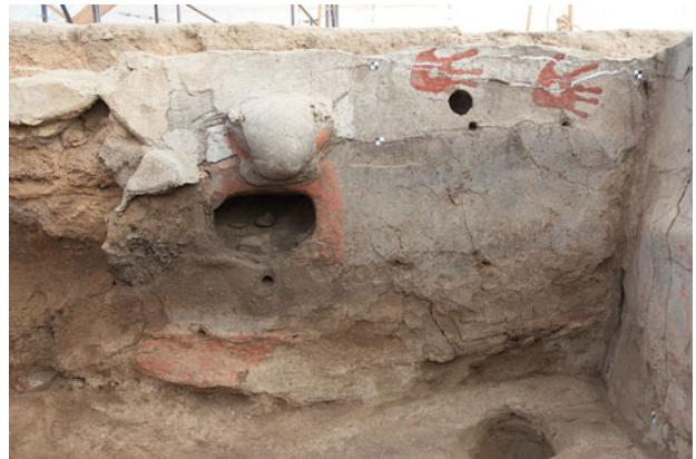
Figure 22.24. The first two prints discovered in 2010. The prints are in fact much earlier than the bucranium, which remains out of phase in this photograph.