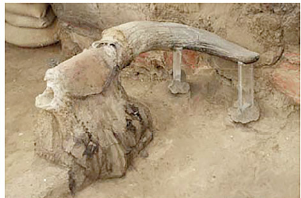
Figure 22.37. The cores of the horned pedestals.