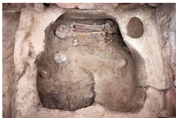
Figure 22.42. Carefully arranged skeleton (19541) and cranium (19544) to the east of the context within burial F.3697. Facing north.