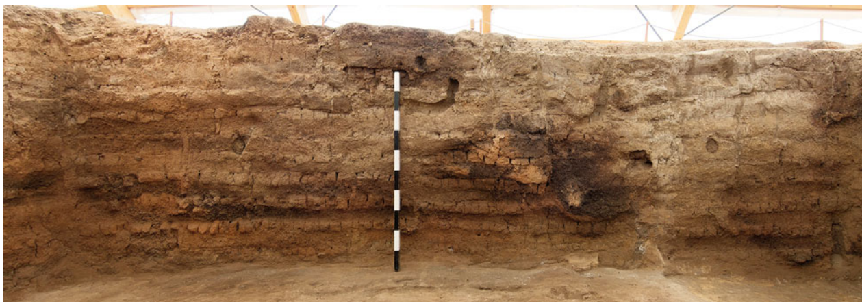
Figure 22.6. Western wall (F.3097) of B.77. Facing west.