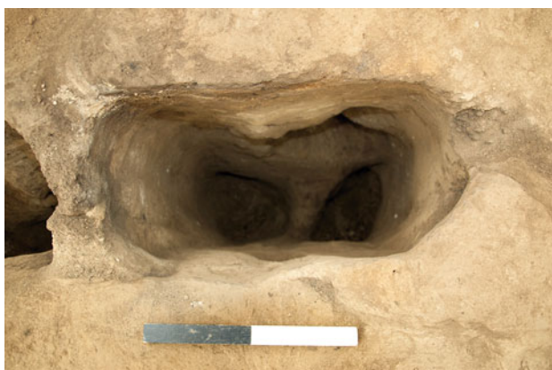
Figure 22.9. The double-based post cut (19599) for post F.7593, facing west.