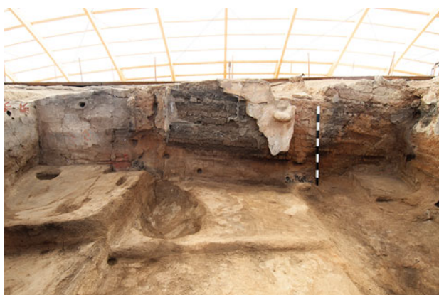
Figure 22.7. Eastern wall F.3095, with engaged posts F.6055 to the north and F.6056 to the south. Facing east.