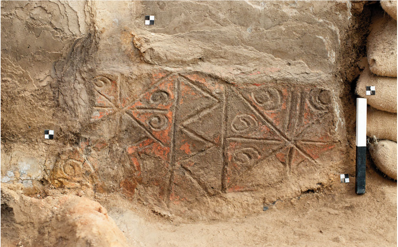
Figure 22.21. Incised panel F.8133.