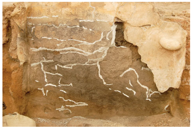
Figure 22.20. Moulding F.6070, conserved and reconstructed in 2009.