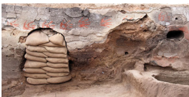
Figure 22.28. The red hand panel as discovered in 2011. It is clear from this image that the prints are contemporary with the red paint that covered niche F.6057.