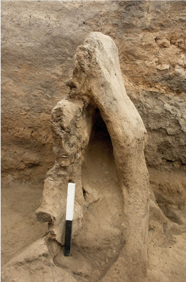
Figure 22.17. Secondary support wall to F.3092, through which the bins may have also been accessed.