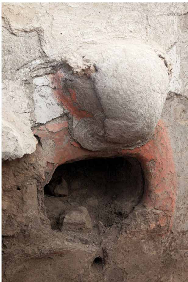
Figure 22.38. Bucranium F.6063 on the northern wall of B.77.