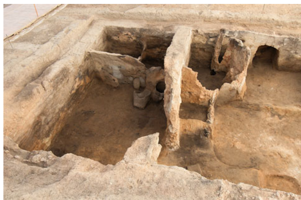
Figure 22.15. North-facing overview of side room Sp.337 (left side of image) in 2008. A clay funnel sits in front of bin complex F.3092 (upper left). This piece may have been the mouthpiece for one of the compartments.