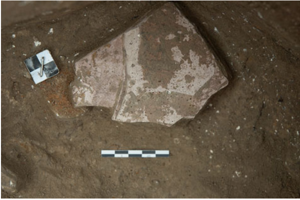
Figure 22.43. Stone palette found immediately beneath cranium (19500).