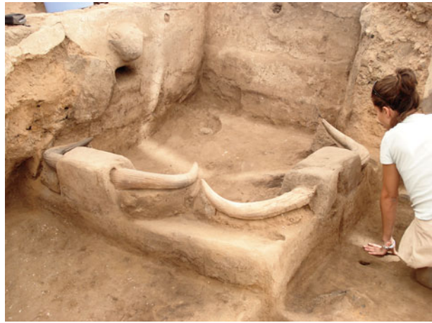
Figure 22.36. The horned pedestals soon after they were exposed in 2008.