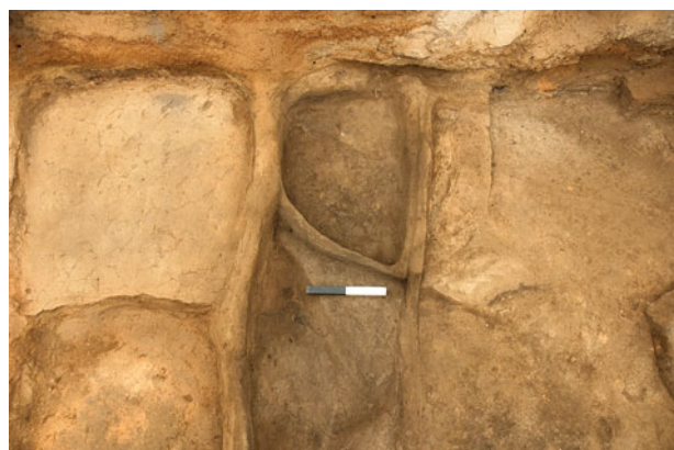
Figure 22.40. Basin F.3605.