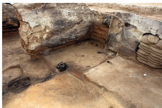
Figure 22.30. Northwest-facing overview of the north-western platform F.3611 at the end of phase B.77.5. Traces of red paint adorn the southern and eastern edges of the platform.