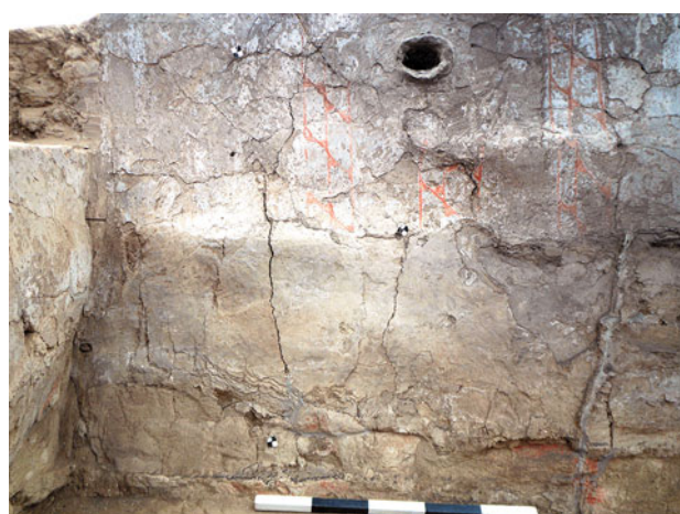
Figure 22.32. Upper part of the geometric design (19469), F.8148 on the eastern wall of B.77.