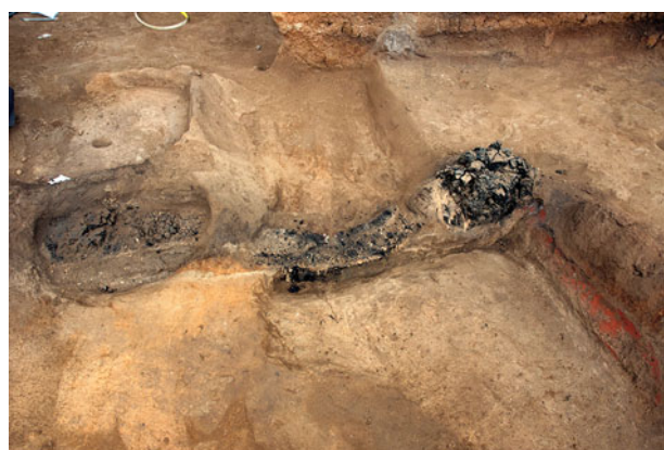
Figure 22.8. Posts F.7593, F.7594 and F.7595 placed parallel to division wall F.3098. West facing.