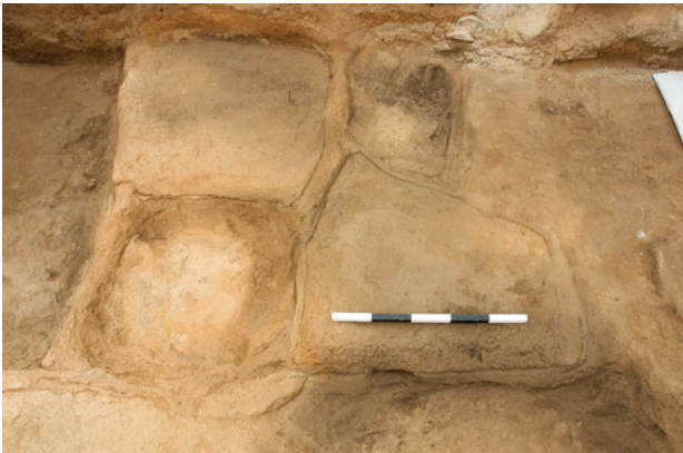
Figure 22.46. Overview of the southern activity area associated with platform F.6060.