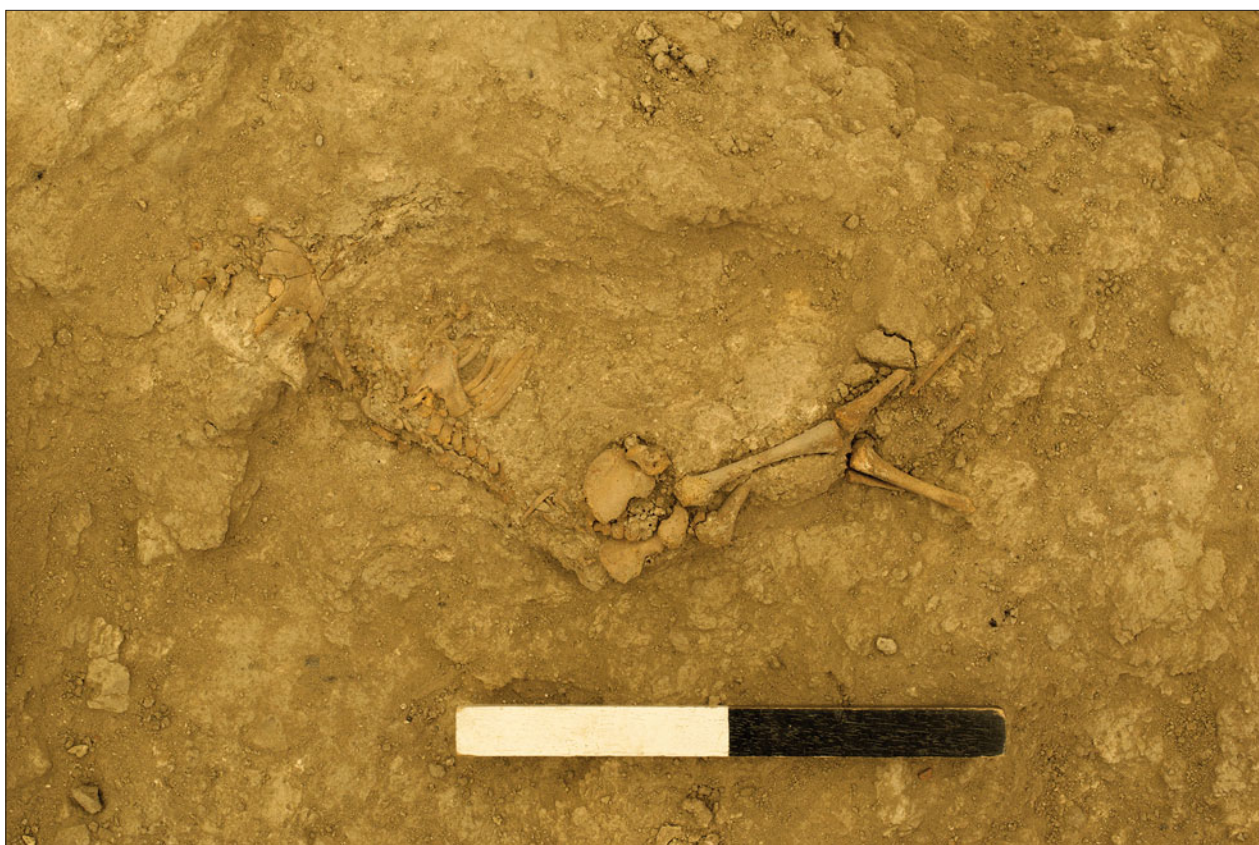
Figure S8.19. North-facing photograph showing burial F.7803.