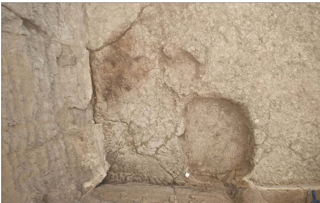
Figure S8.23. North-facing photograph showing burial cut of F.7510 skeleton (30369).