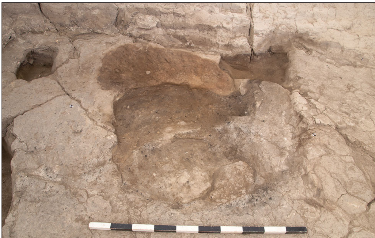
Figure S8.10. South-facing photograph of complete oven (F.7838) and hearth (F.8161).