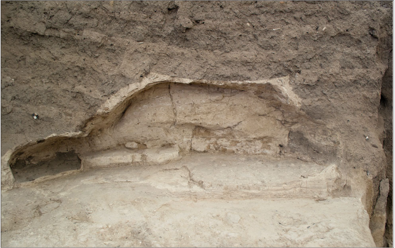
Figure S8.34. East-facing photograph showing modification of the niche (30312).