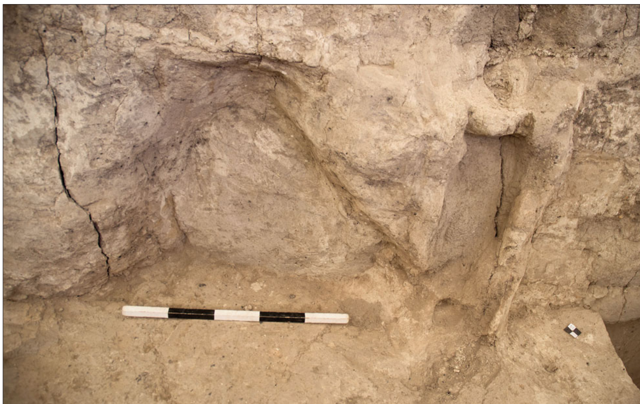
Figure S8.13. North-facing photograph showing niche created from decommissioned oven F.7486.