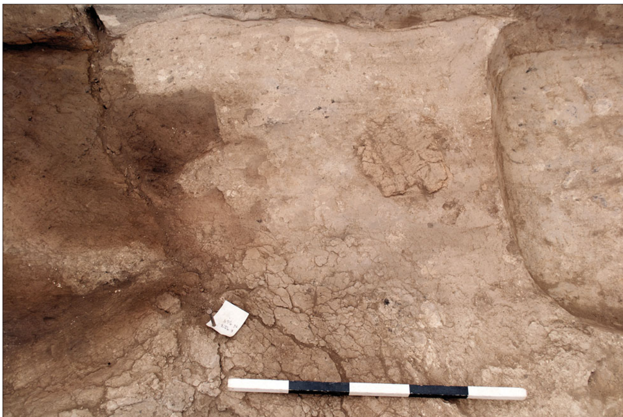
Figure S8.29. South-facing photograph showing make-up deposit (30342).