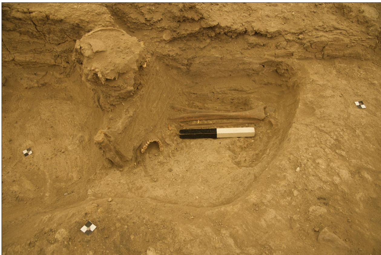
Figure S8.25. North-facing photograph showing burial F.7508.