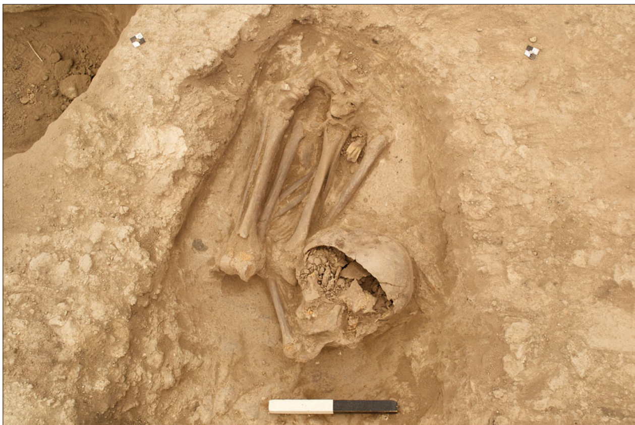
Figure S8.26. South-facing photograph showing burial F.7512.