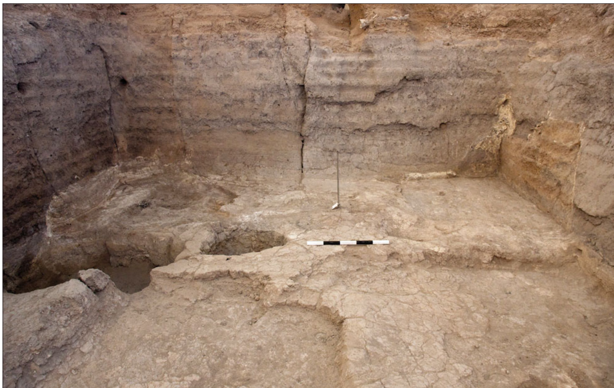
Figure S8.37. South-facing photograph showing patchy floor southern floor surface (10556).