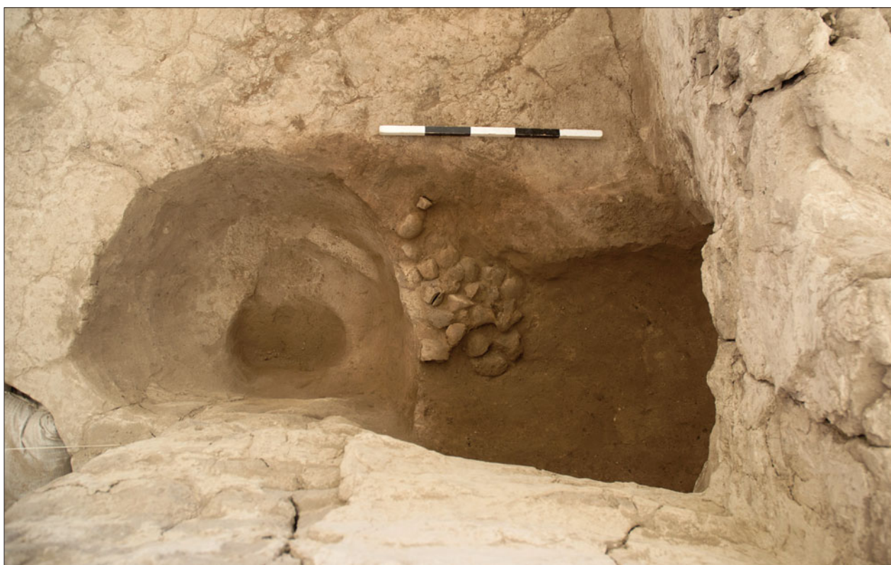
Figure S8.11. West-facing overhead photograph showing mixed cluster associated with possible oven foundation (32467) (photograph by Marek Barański).