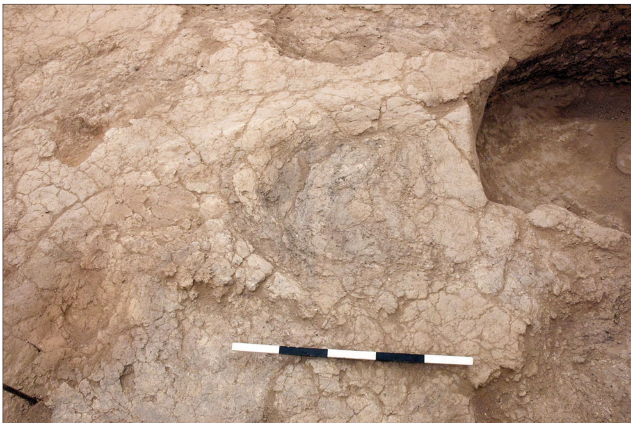
Figure S8.27. North-facing photograph showing hearth F.1864.