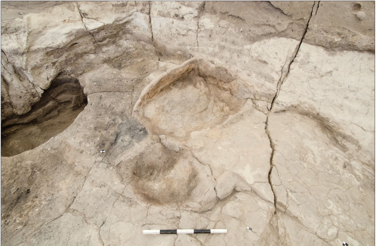
Figure S8.15. Southeast-facing photograph showing oven F.7816 and associated hearth feature F.7817.