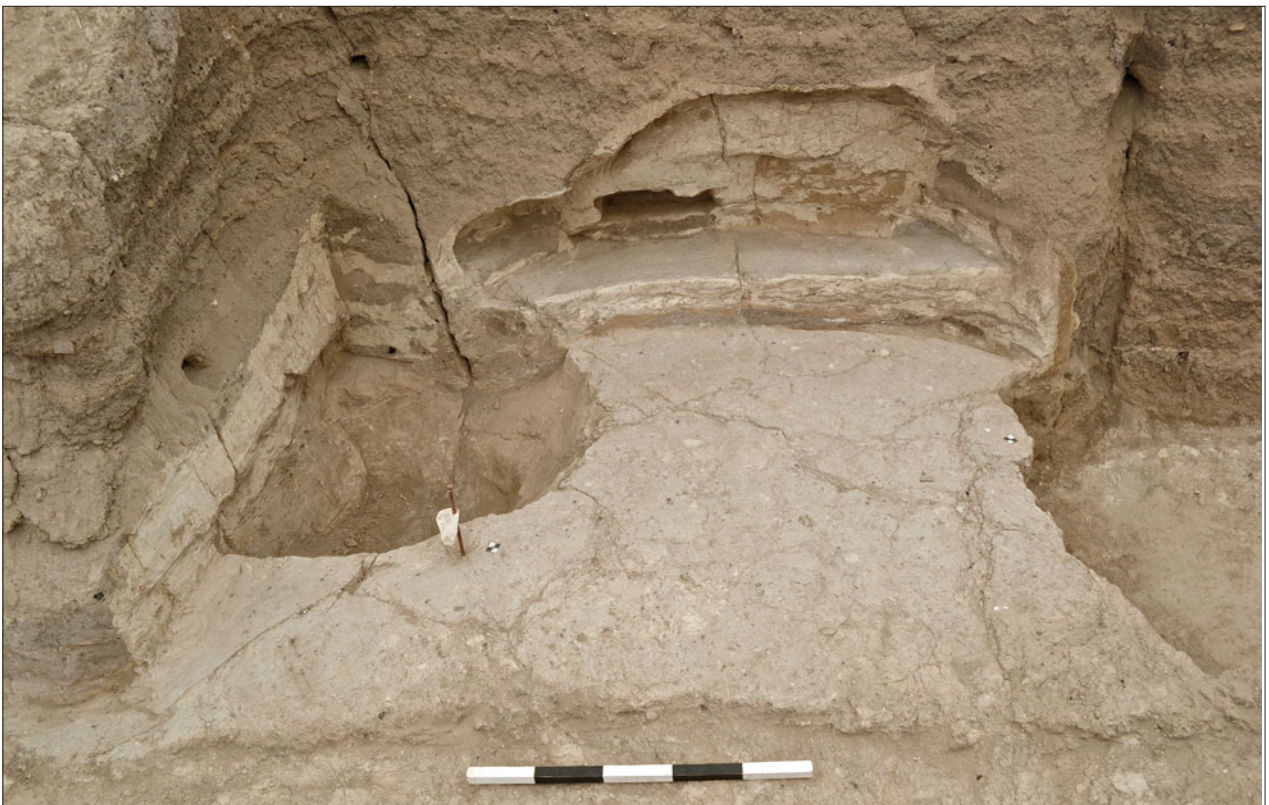
Figure S8.31. East-facing photograph showing detail of niche F.1865 and associated platform F.1851 in foreground (note possible post-retrieval cut (30322) at the northern left side of the platform).