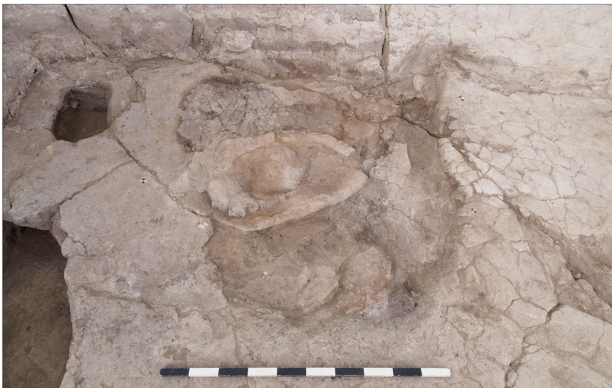
Figure S8.12. South-facing photograph showing detail of hearth F.7837, including quern fragment (32450.x1).