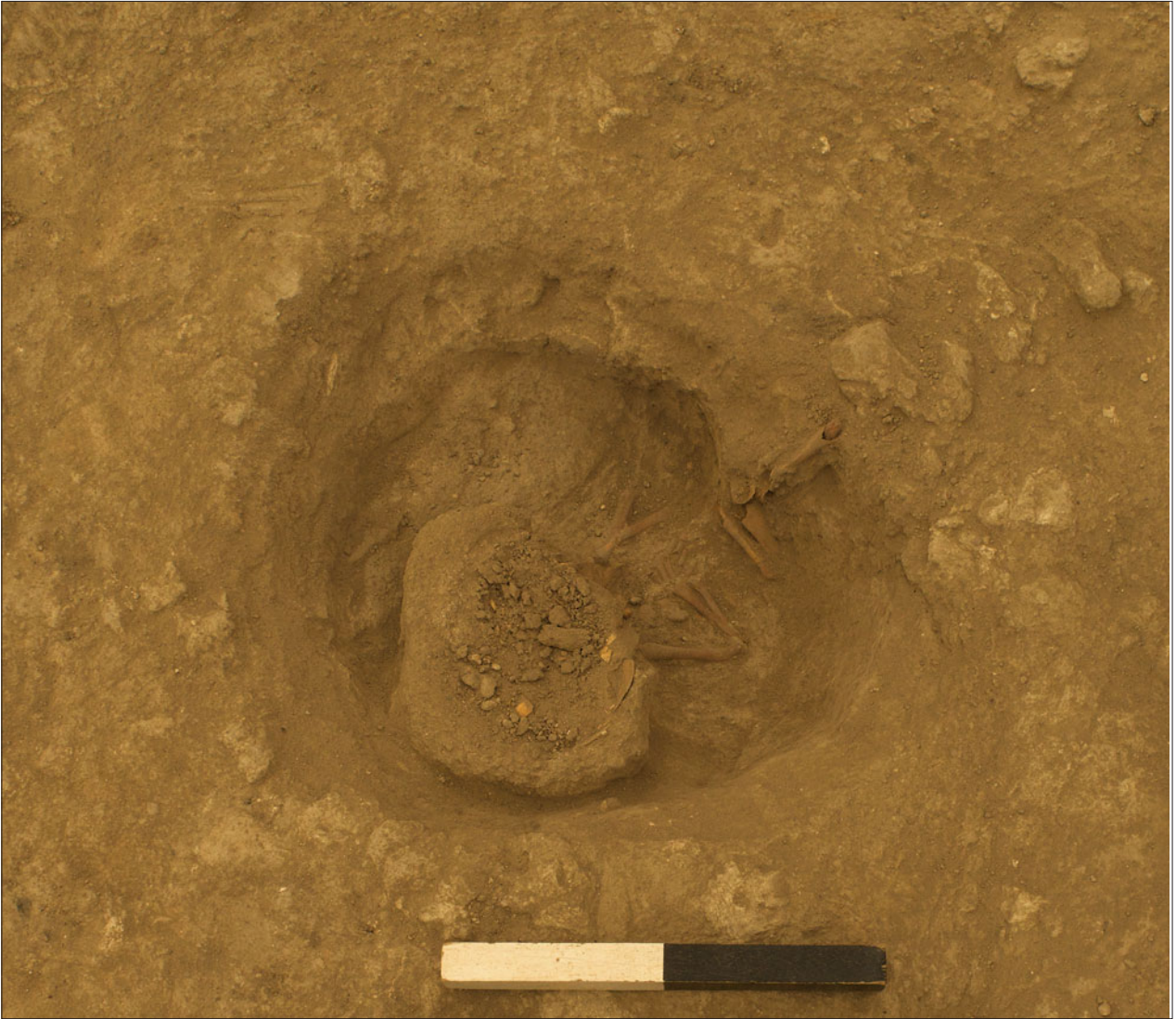
Figure S8.17. North-facing photograph showing burial F.7800.