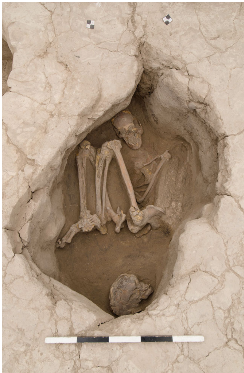
Figure S8.16. West-facing photograph showing burial F.7828 skeleton (32437) and F.7848 skeleton (32447).