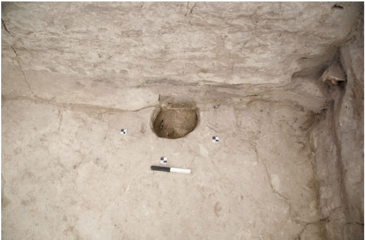
Figure S8.5. West-facing photograph showing pot-retrieval pit F.8174.