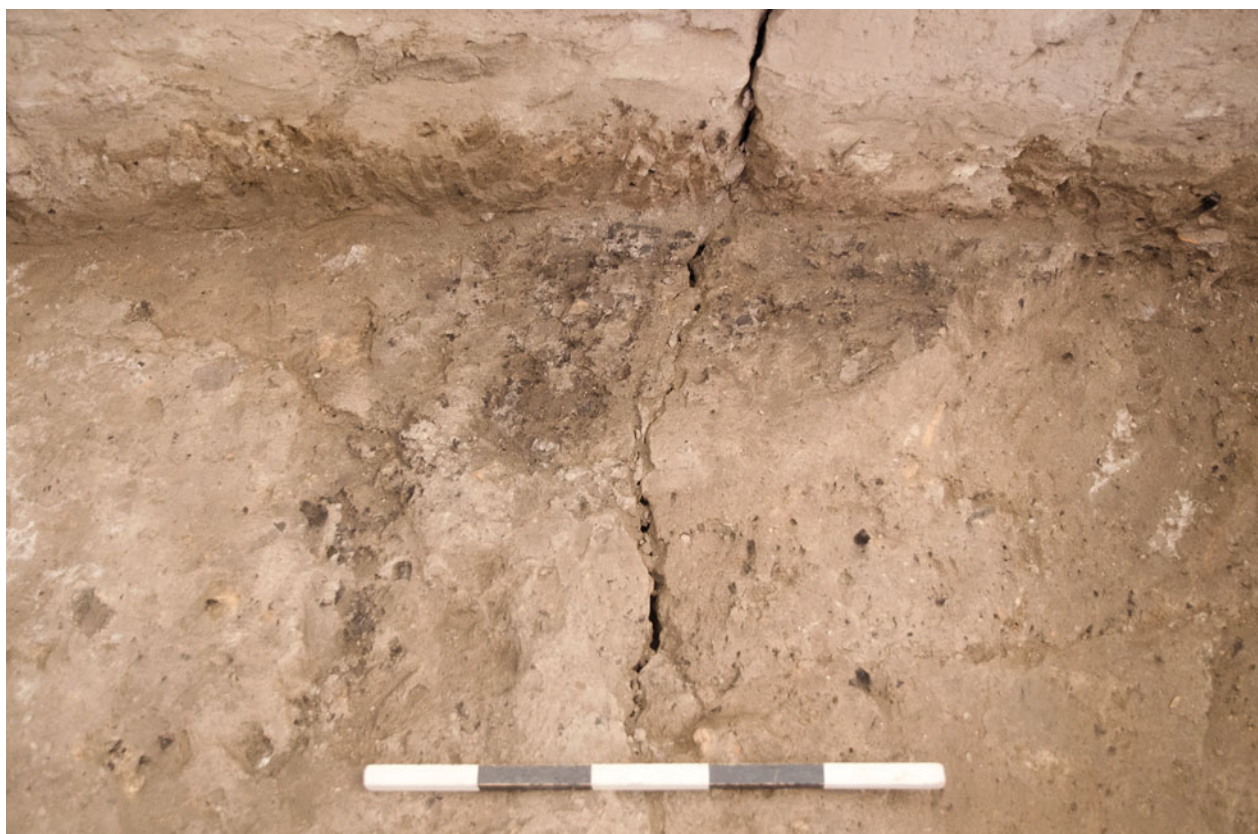
Figure S8.3. North-facing photograph showing fire spot (32699).