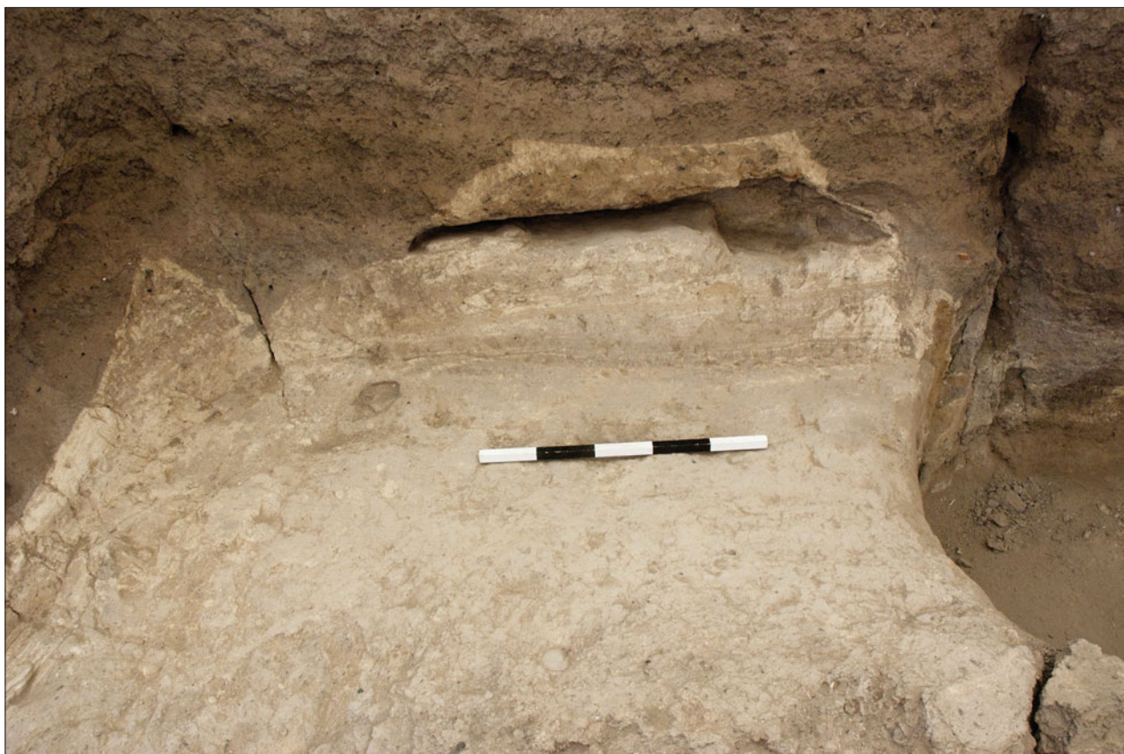
Figure S8.38. East-facing photograph showing the latest phase of niche F.1865 and associated truncated deposits.