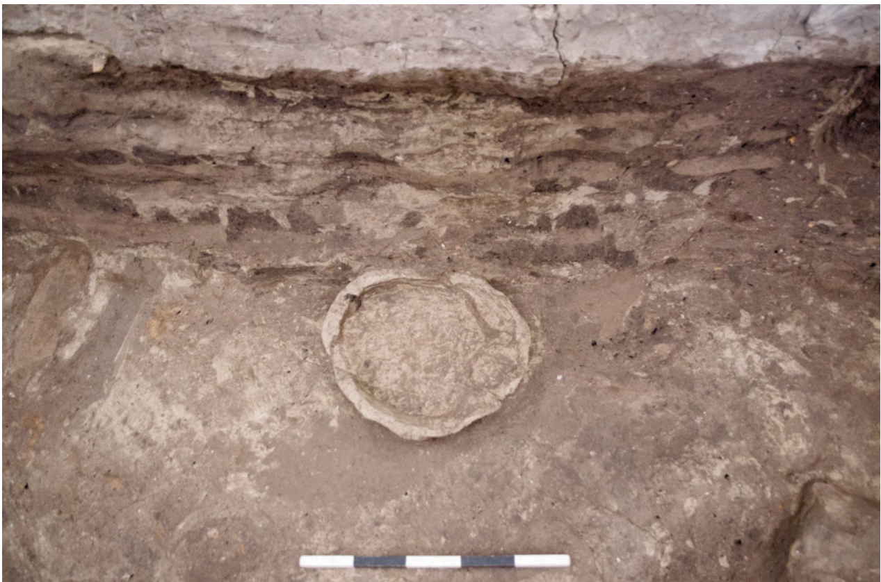
Figure S8.1. East-facing photograph showing detail of bin (32683).