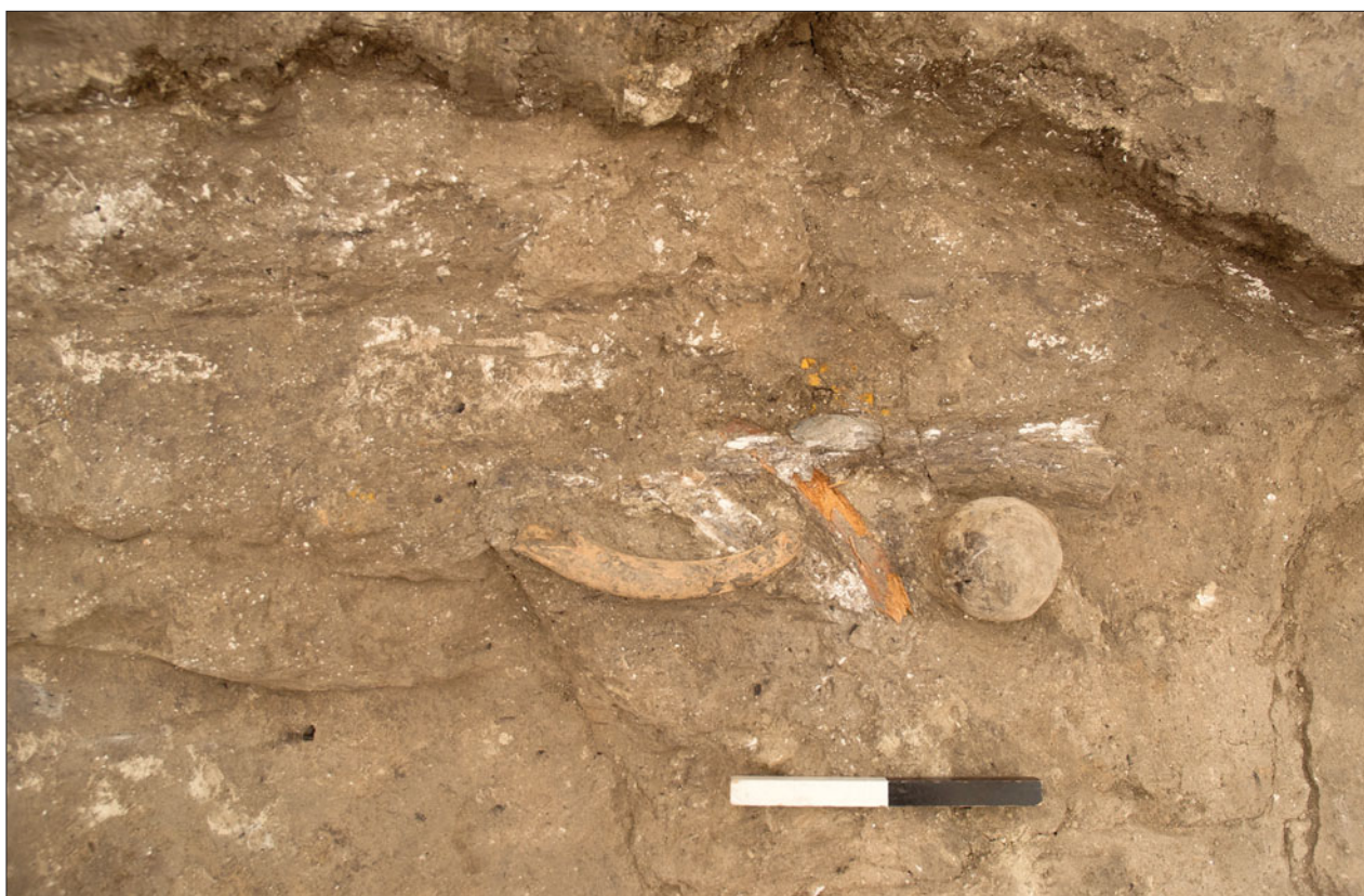
Figure S8.8. North-facing photograph showing in situ cluster associated with northern wall reinforcement (32600).