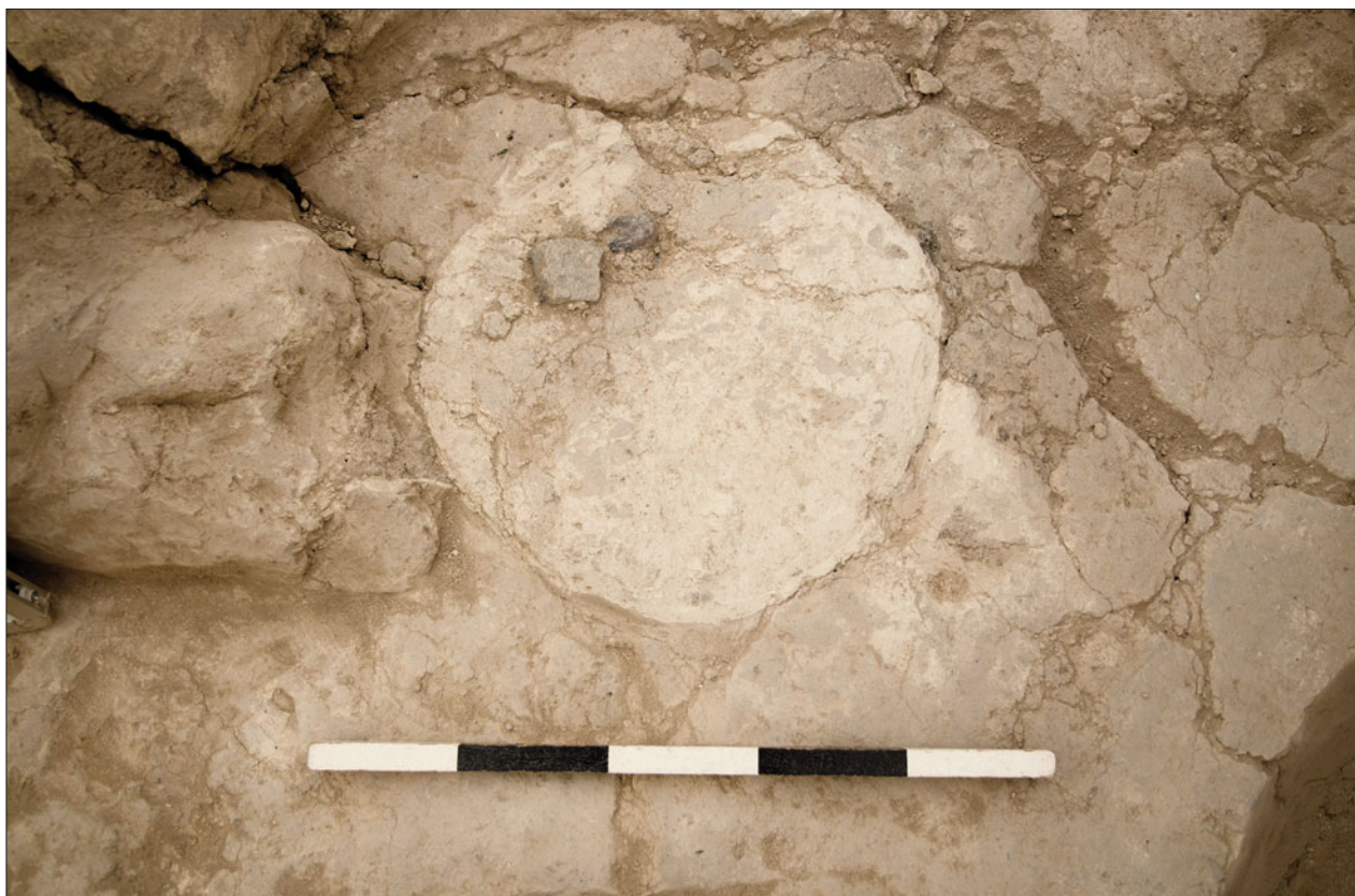
Figure S8.7. North-facing photograph showing detail of white plaster (32651/32655) associated with hearth F.8170 and oven F.8160.