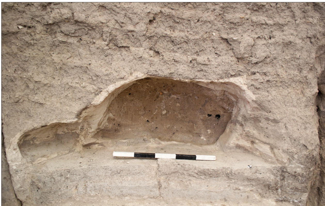
Figure S8.20. East-facing photograph showing detail of crawl-hole niche F.1865.