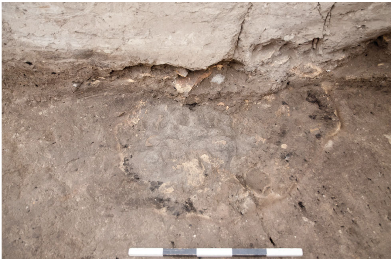
Figure S8.2. North-facing photograph showing detail of fire spot (32675).