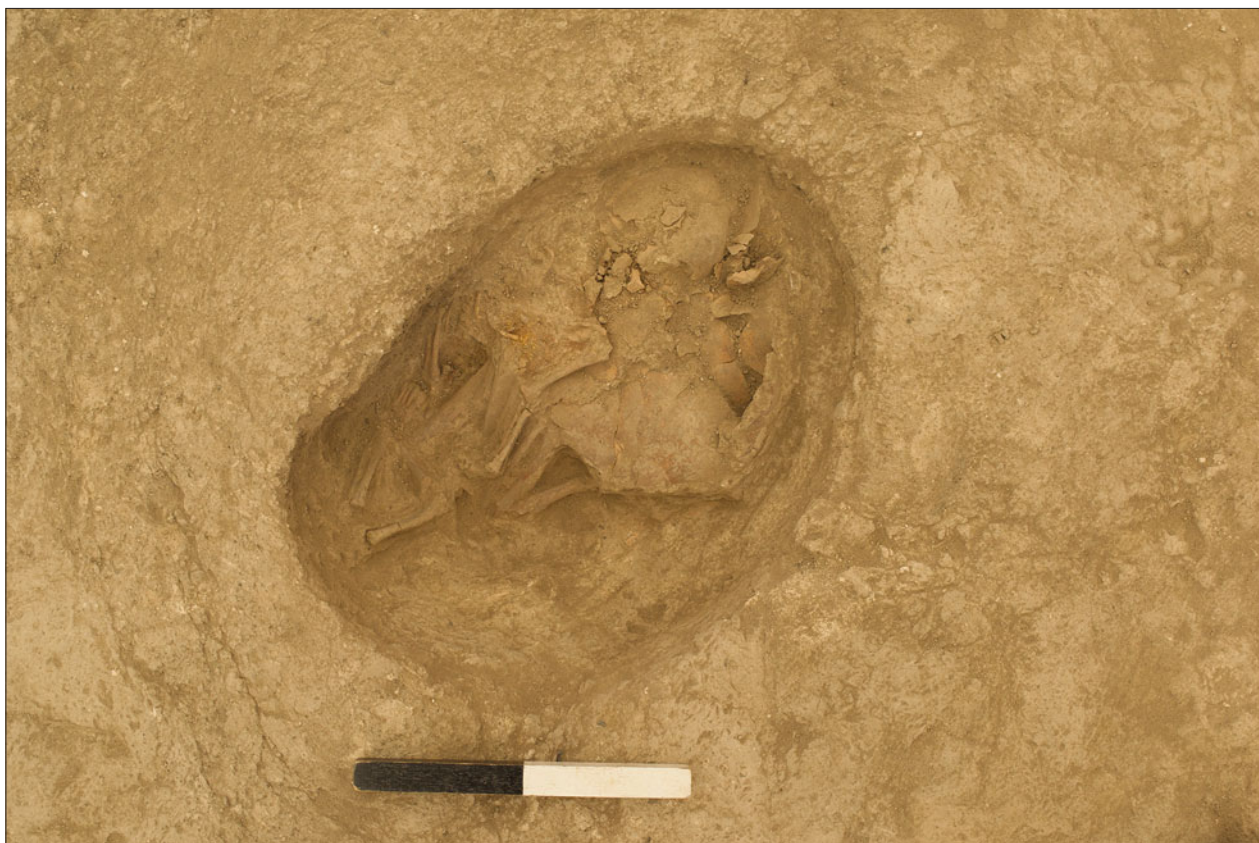
Figure S8.18. North-facing photograph showing burial F.7802.