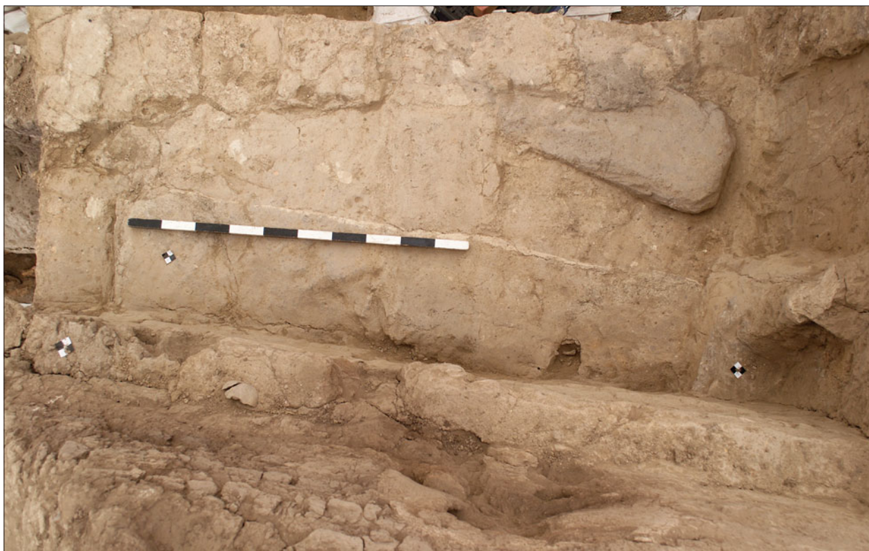
Figure S8.22. North-facing photograph showing wall F.8807 in situ below remaining room fill of Sp.563.