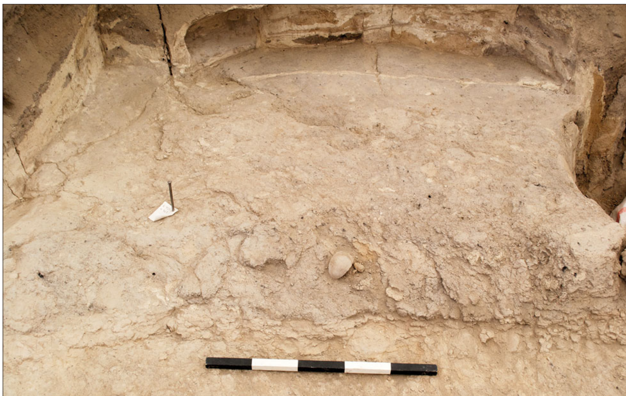
Figure S8.32. East-facing photograph showing platform F.1851 makeup deposit (30318) sealing earlier pit (30322).