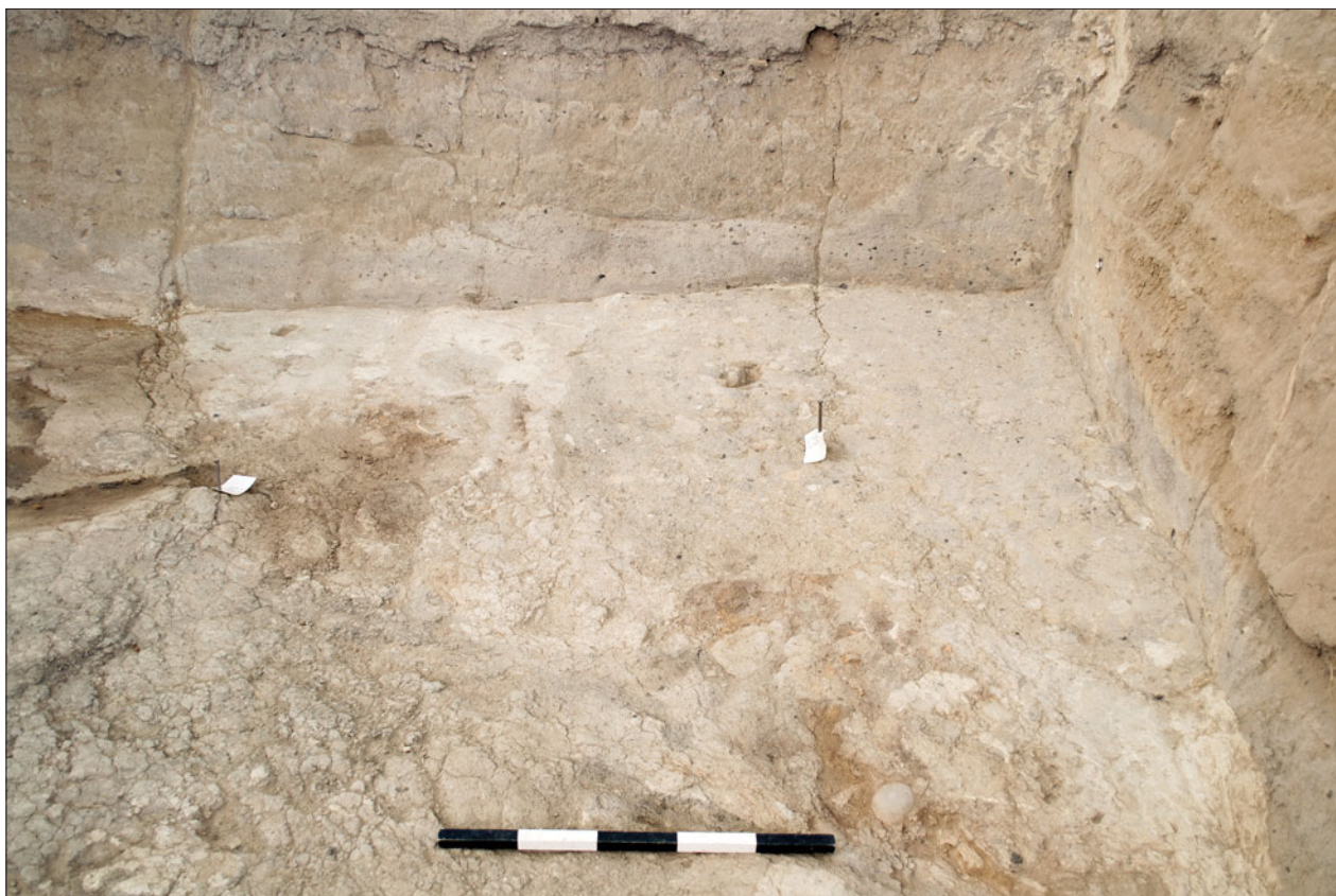
Figure S8.40. West-facing photograph showing post-retrieval pit (10521; left) and burial F.1860 (right).