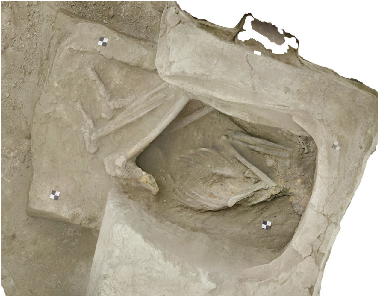
Figure S8.14. North-facing orthophoto showing burial F.7821 cut into platform F.7820 (image created by Scott Haddow).