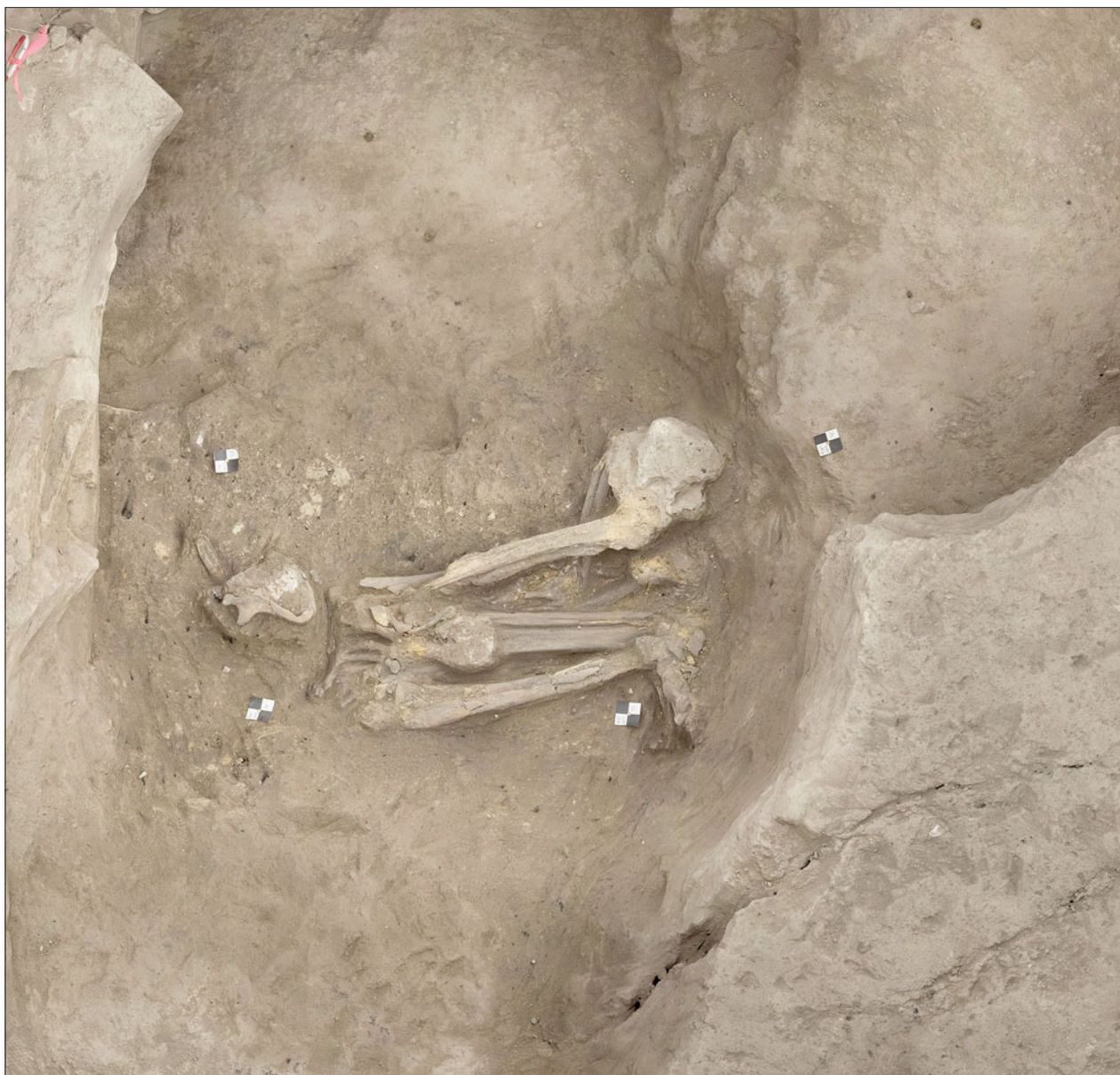
Figure S8.6. West-facing orthophoto showing skeleton (32674) in burial F.8176 (photograph by Çatalhöyük Research Project Human Remains Team)).