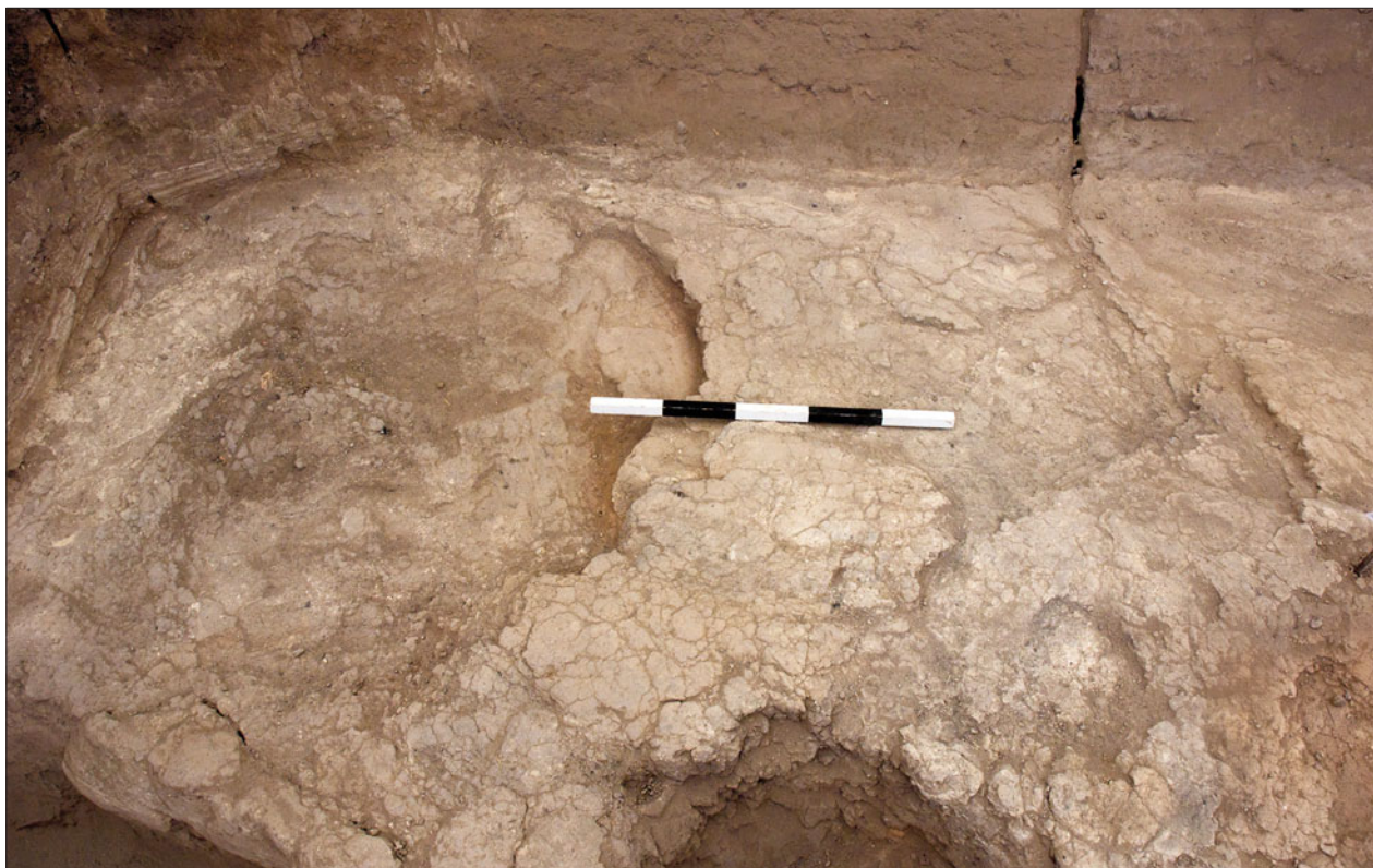
Figure S8.39. South-facing photograph showing patchy make-up deposits (10551; similar to 10552 and 10554) (photograph by Antonia James).