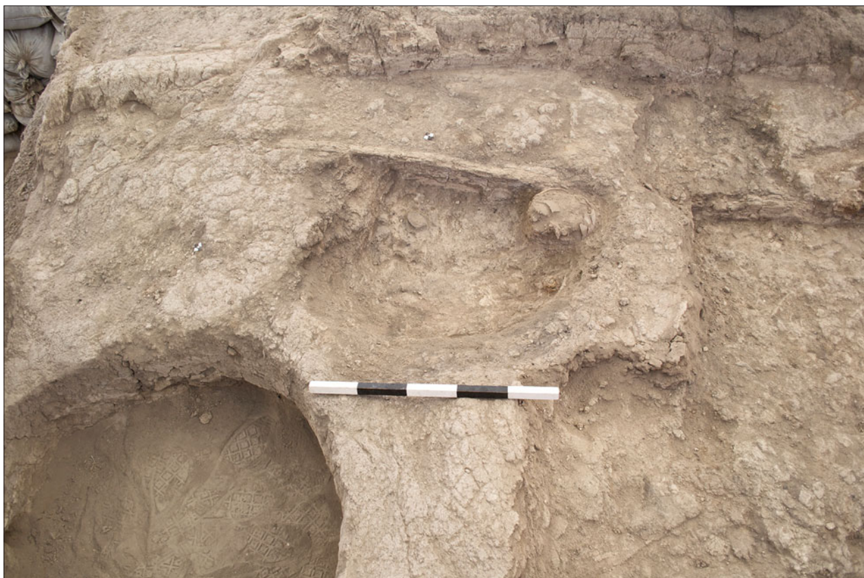
Figure S8.24. North-facing photograph showing pit F.7506.