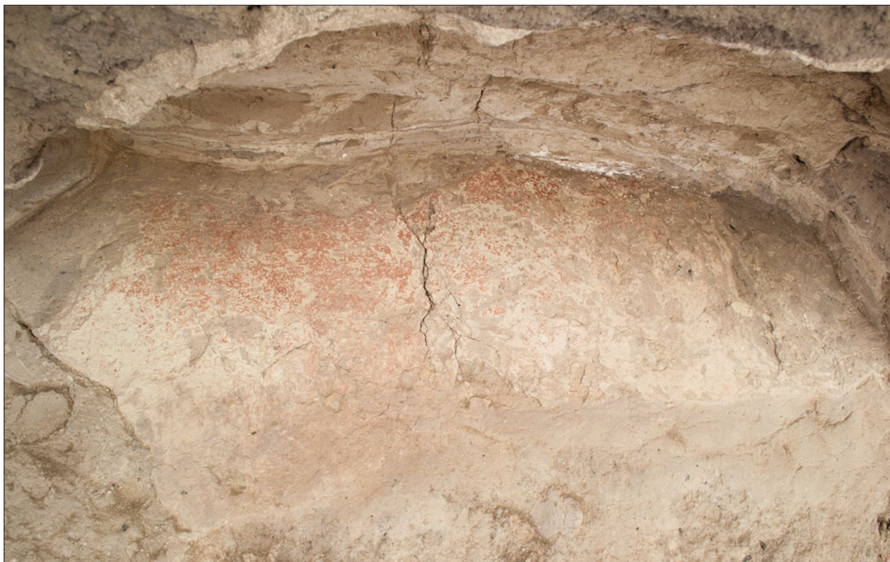
Figure S8.33. East-facing photograph showing red painted floor (30315), part of a sequence of compound floors and makeup on platform (including 30303, 30313, 30314 and 30316) (photograph Çatalhöyük Research Project).