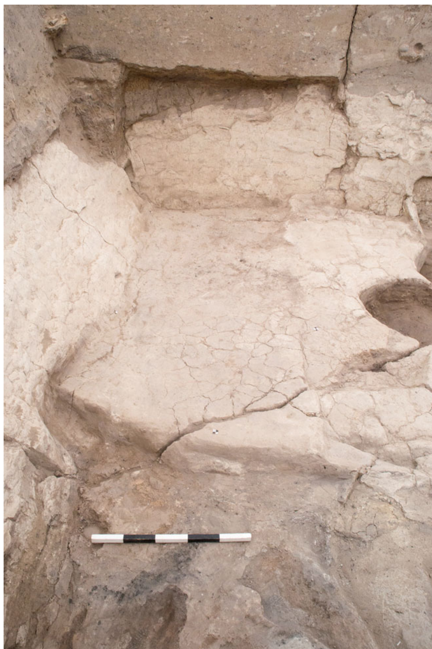
Figure S8.9. West-facing photograph showing truncated platform F.7834.