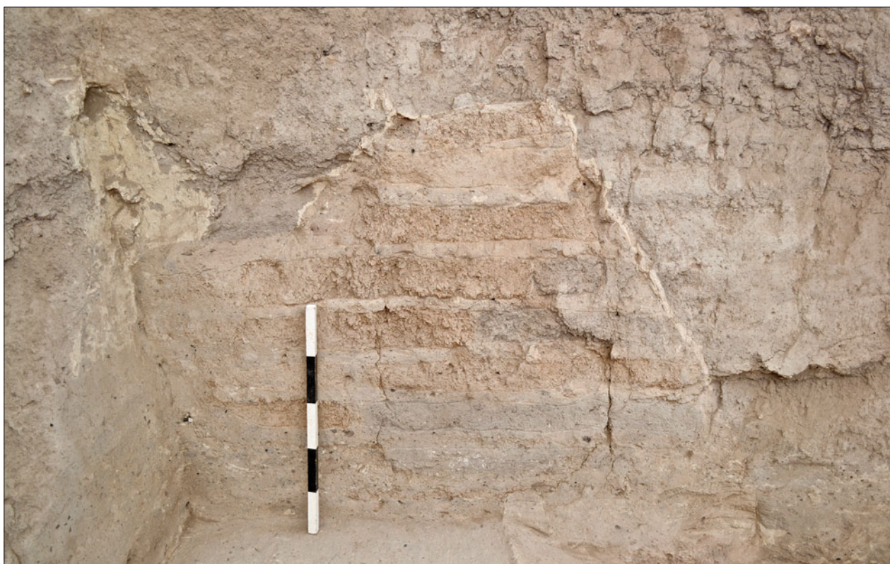
Figure S8.21. West-facing view of the west side of B.43. Note crawl-hole F.7507 on the southern end.