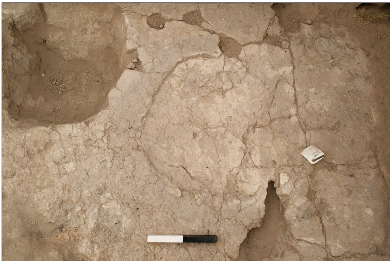
Figure S8.28. North-facing photograph showing detail of bin structure (30310).