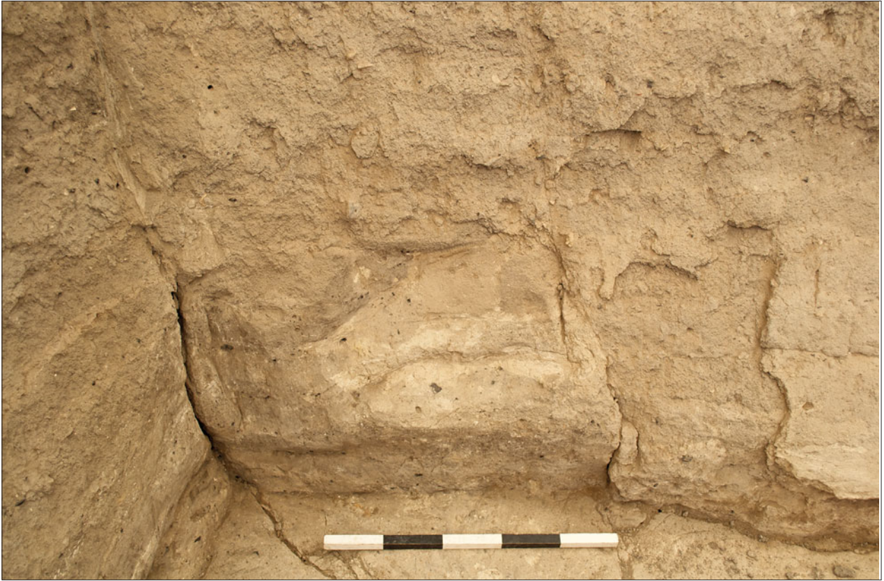
Figure S8.30. South-facing photograph showing blocking event of niche (30385).