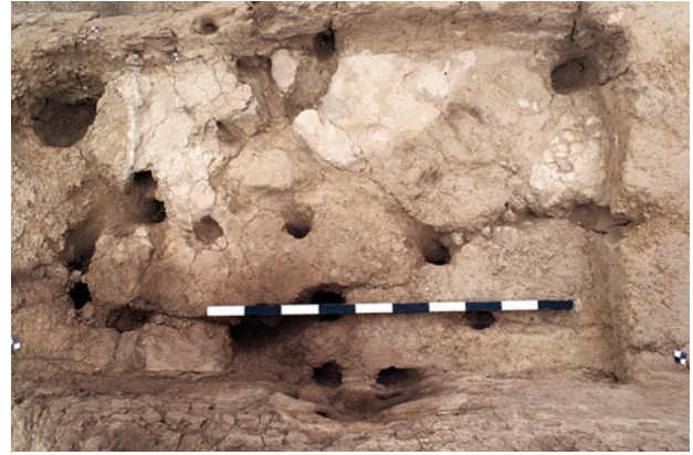
Figure 15.9. East-facing photograph of Space 444 with remnant bins (F.8000 and F.8001) visible at north end.