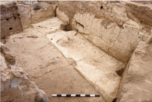
Figure 15.4. Northeast-facing photograph showing the eastern and northeastern platforms, F.3508 and F.3507 respectively.