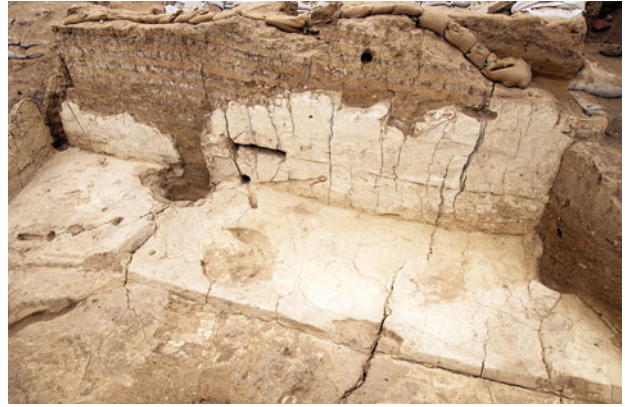
Figure 15.17. Northeast-facing photograph showing white plaster floor surfaces ((19714) and (19713)) on the platform and across the central part of Space 370.