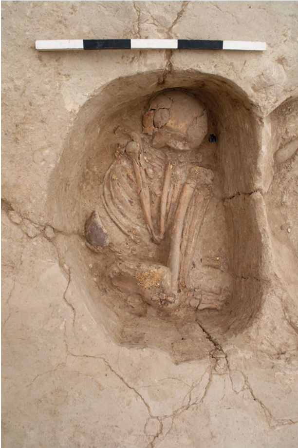
Figure 15.15. West-facing photograph of burial F.7003.