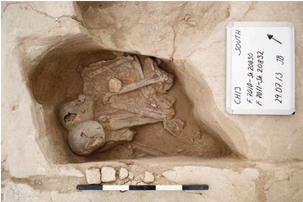
Figure 15.12. West-facing photograph of burials F.7010 and F.7011.