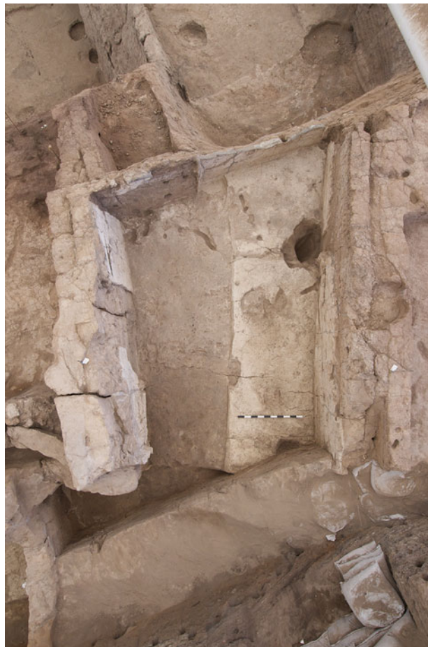
Figure 15.1. North-facing photograph showing overview of Building 96, Sp.370.