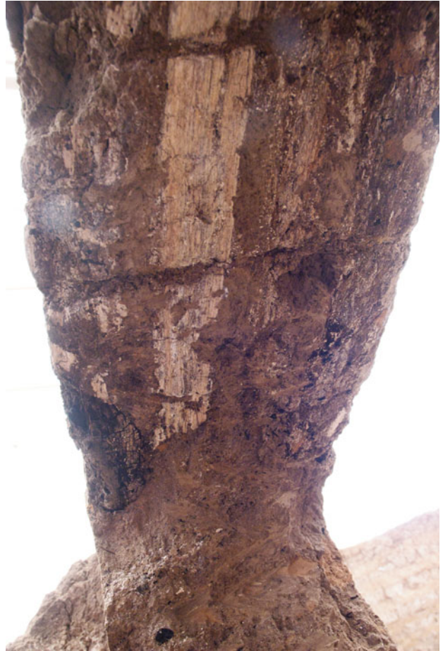
Figure 15.6. Upward (west)-facing photograph showing internal detail of the Building 96 crawl-hole (F.3504).