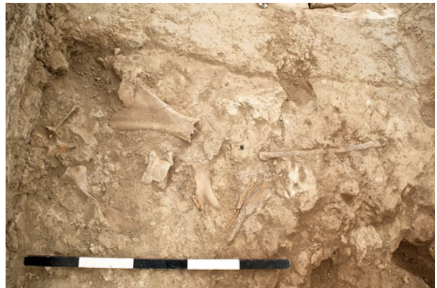
Figure 15.18. West-facing photograph showing animal bone cluster in Space 444 (20883).