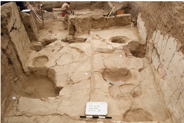
Figure 15.19. North-facing overview of the north end of Space 370, showing post-retrieval pits (F.3500, F3506 and F3510).