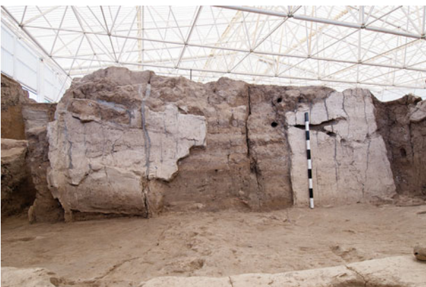
Figure 15.5. West-facing photograph showing detail of the break in the plaster on the internal face of the western wall (F.4090).