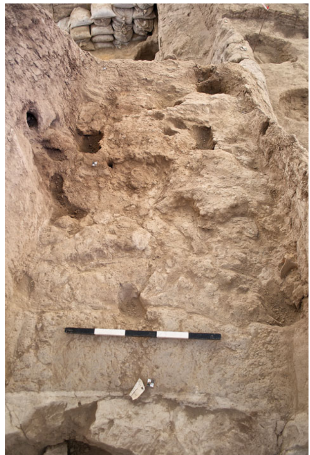
Figure 15.22. North-facing photograph showing the latest burnt infill deposits associated with northern Space 444.