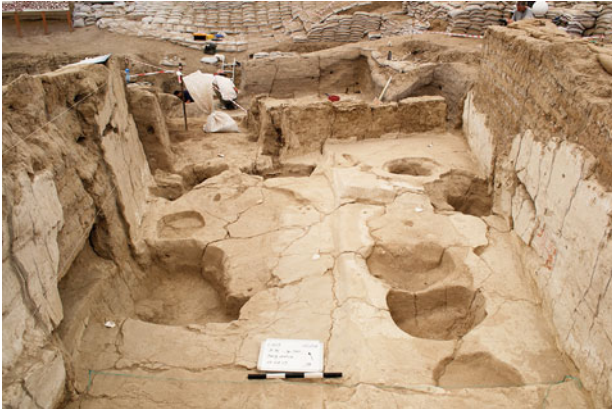
Figure 15.8. North-facing daily sketch photograph of earliest excavated plaster floors in Space 370 ((20855), (20857) and (20866)).