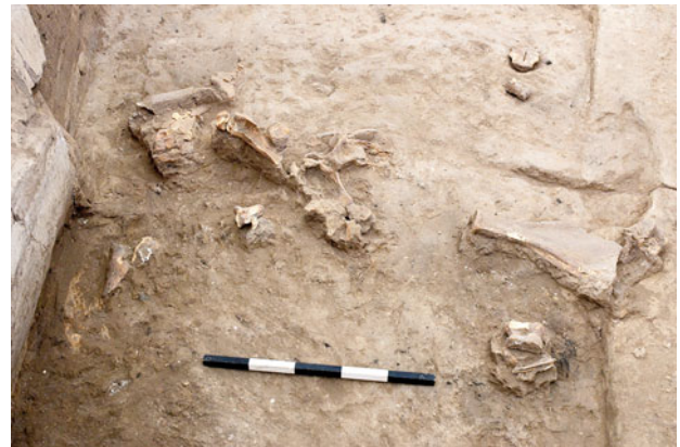
Figure 15.21. North-facing photograph showing primary infill of Space 370 (19227) and a cluster of animal bone, which may be associated with the large abandonment pit F.7000 and possibly linked to other bone concentrations throughout the primary fills of Space 370.