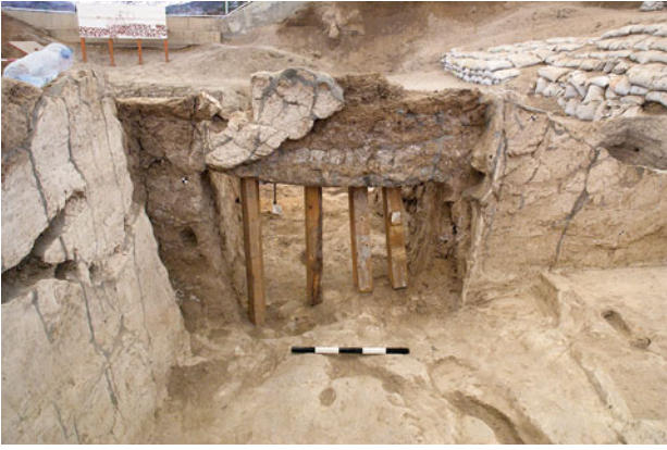
Figure 15.3. North-facing photograph showing northern end of Building 96, including the intact crawl-hole and associated post holes.