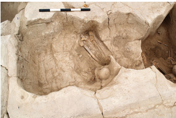
Figure 15.14. East-facing photograph of burial F.7008 and the cut for F.7007.