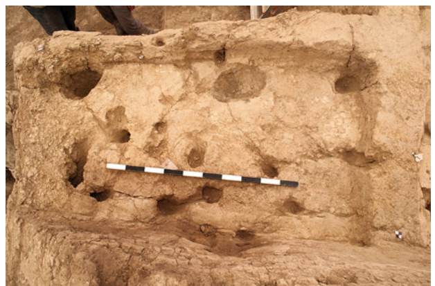
Figure 15.7. East-facing photograph showing the earliest surface in Space 444 (20890).