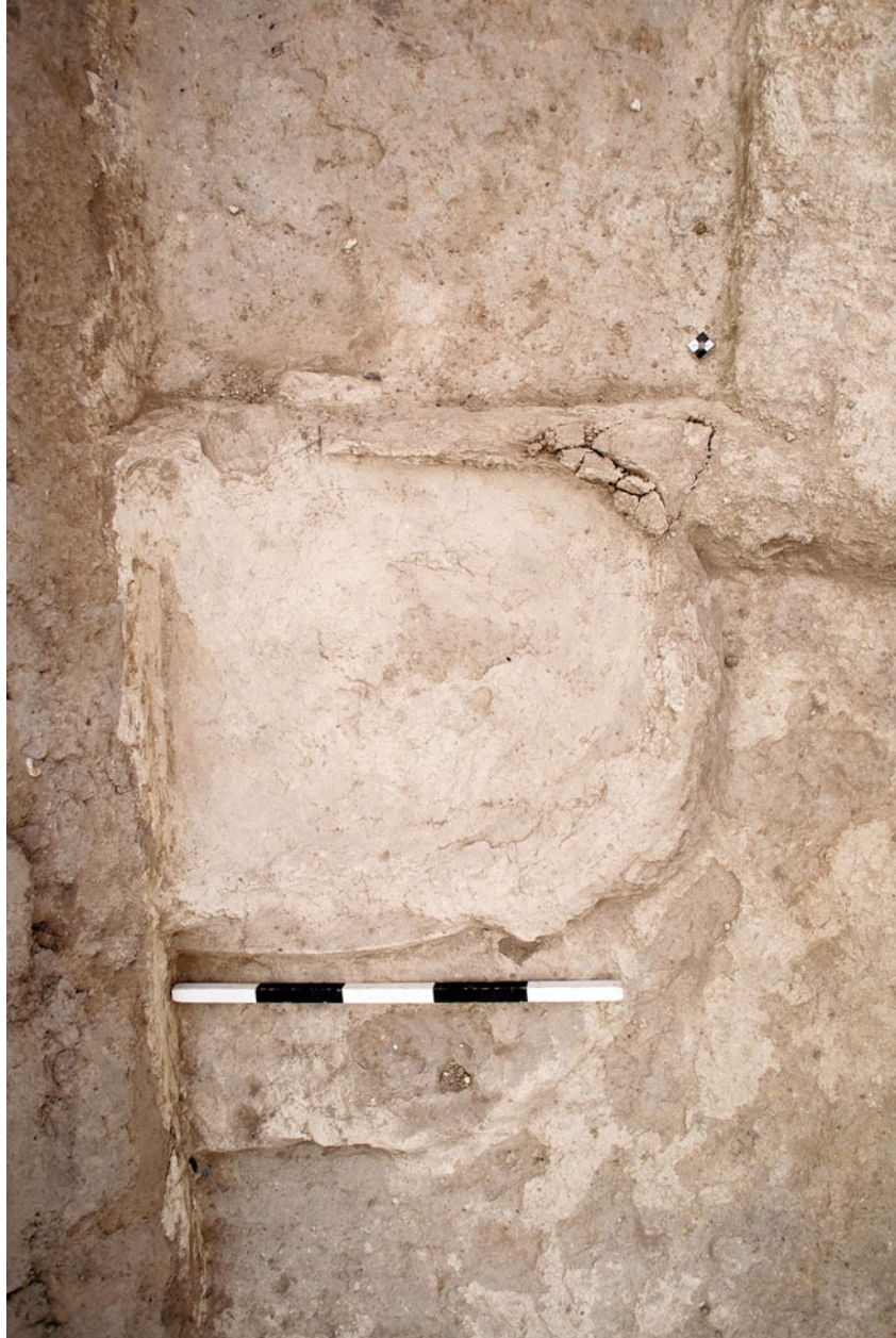
Figure S17.2. West-facing photograph showing detail of bin F.7201.