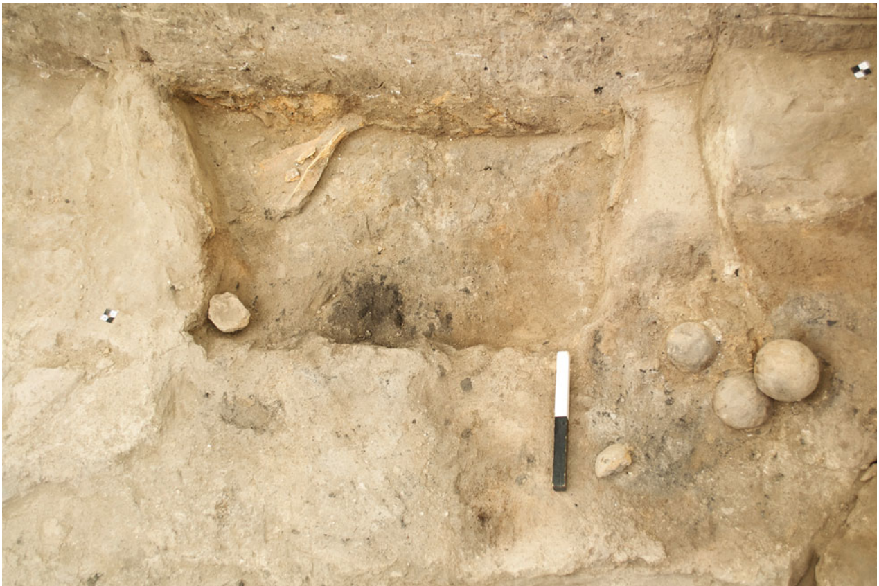
Figure S17.1. South-facing photograph showing detail of clay ball cluster (30630) against oven (F.7202), and dirty floors (30652) to the north.