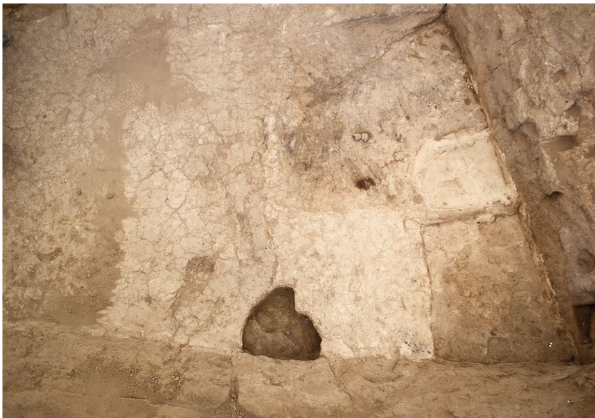
Figure S17.5. South-facing photograph of the west end of B.118 showing post retrieval pit (30612).