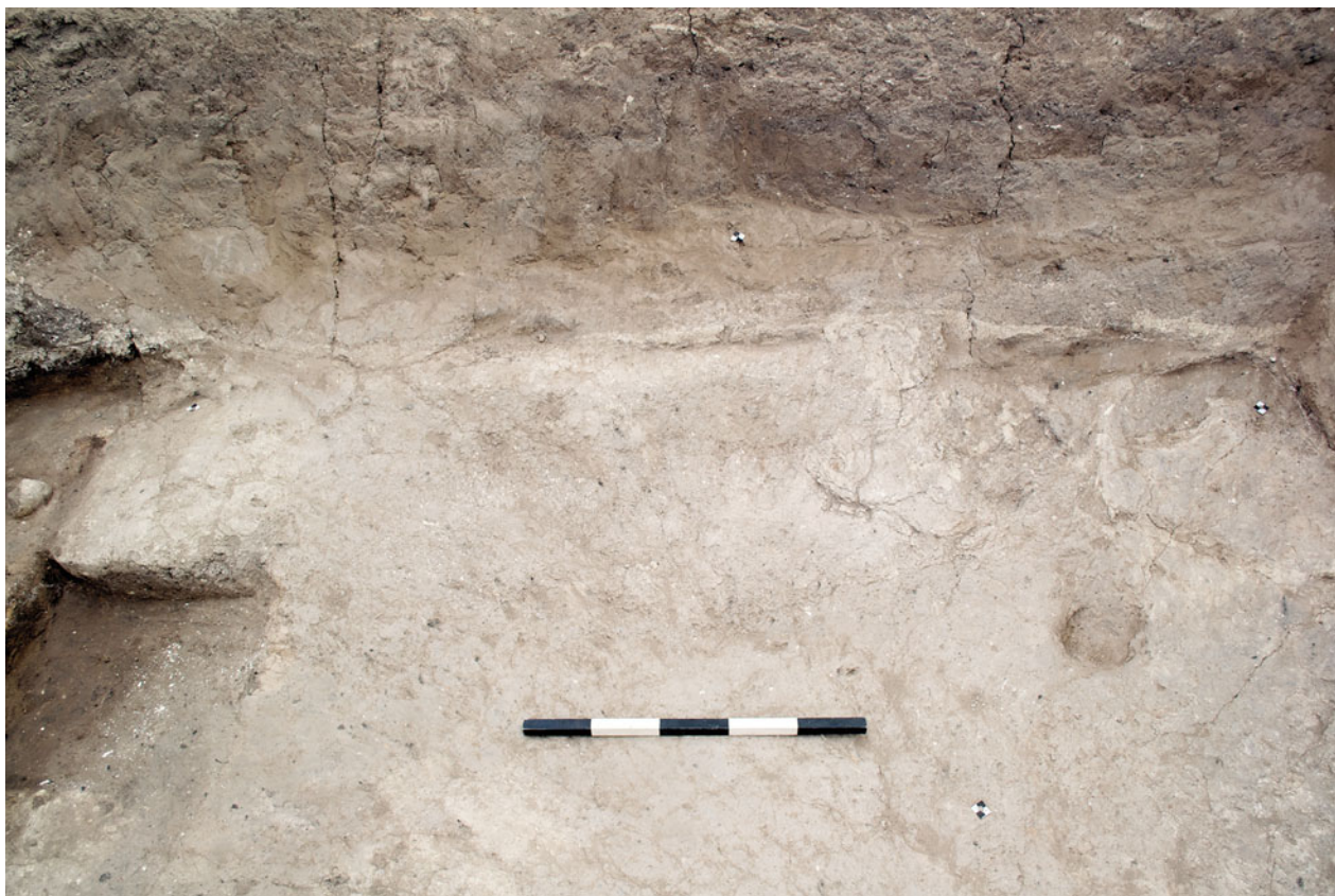
Figure S17.4. East-facing photograph showing ramp F.7204 and bench F.7212.