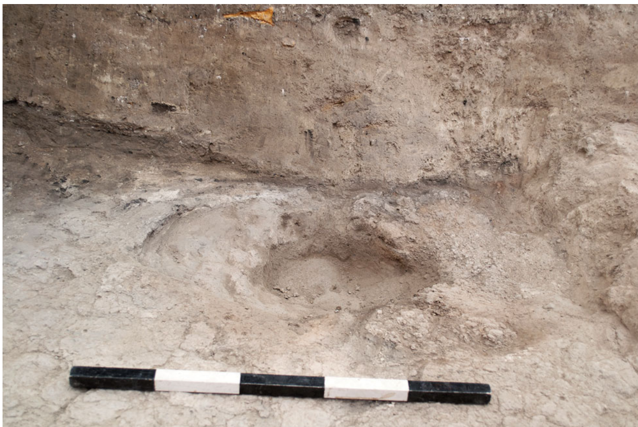
Figure S17.3. South-facing photograph showing detail of hearth F.7205.