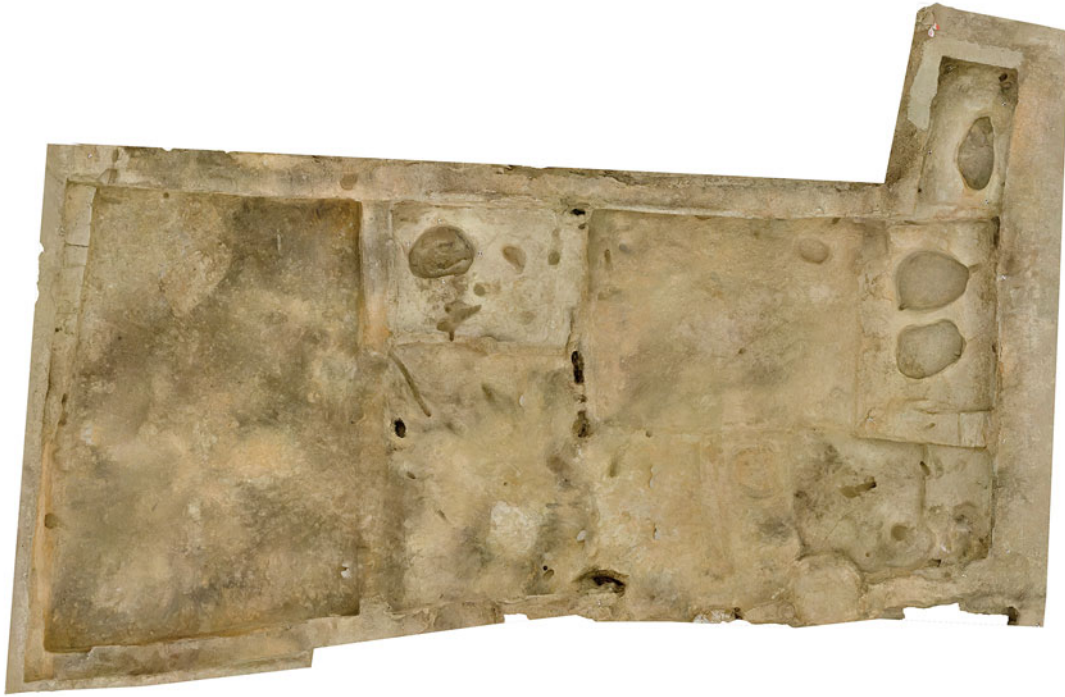
Figure 30.3. Orthophoto of B.131 (orthophoto from a model created by Jason Quinlan).