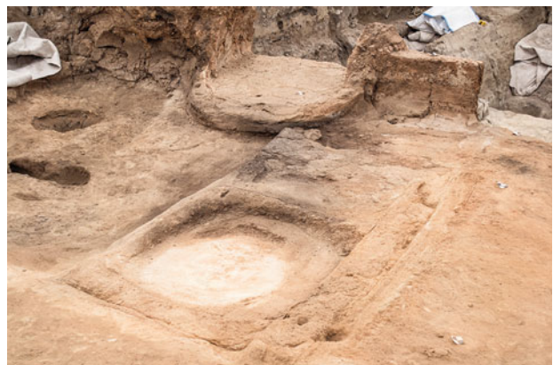
Figure 30.29. Overview of hearth F.7957, oven F.7953 and platform F.7981 in the southeastern activity area (photograph by David Fallon).