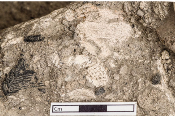
Figure 30.37. Examples of preserved textile and cordage within burial F.7977.