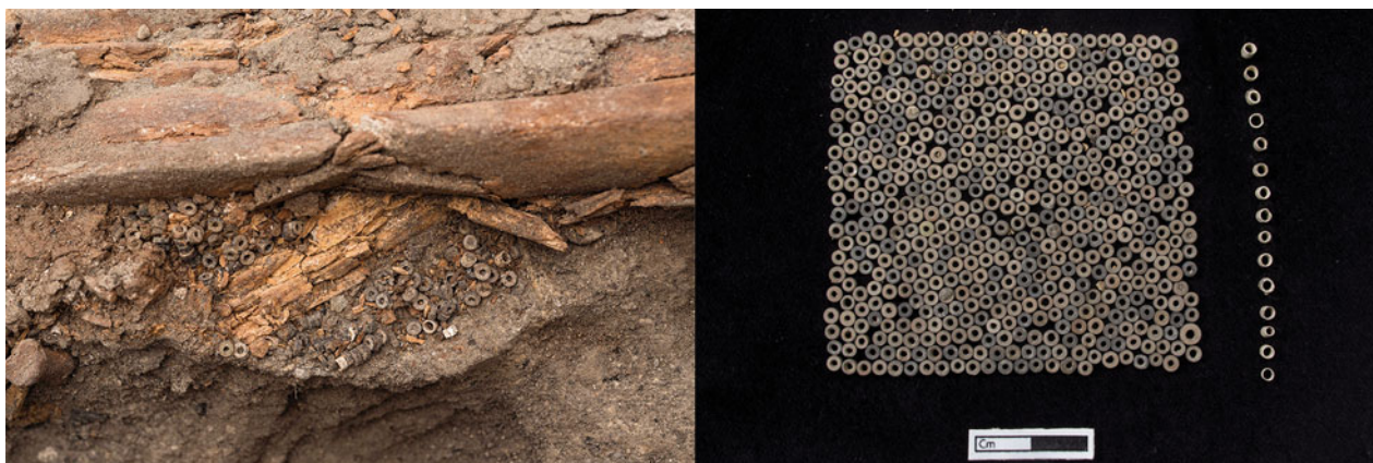
Figure 30.30. Left: rows of black disc beads interspersed with dentalium and other beads, found in situ. Right: some examples of the black disc beads and dentalium beads found within burial F.7961.