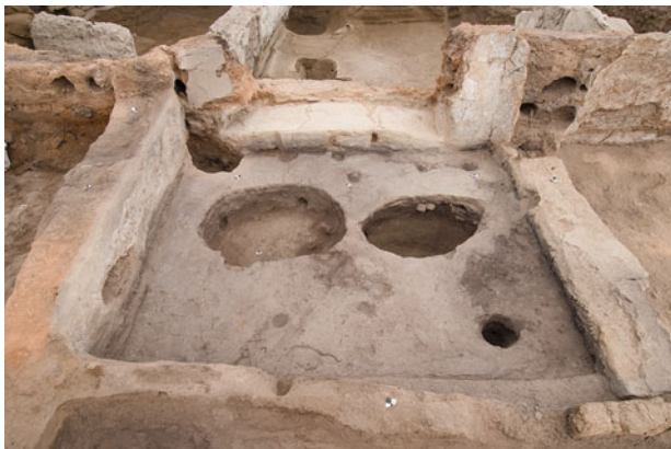
Figure 30.15. North-facing view of plaster surface (32381) on platform F.7950 and mudbrick construction (32350) of bench/division F.7994.