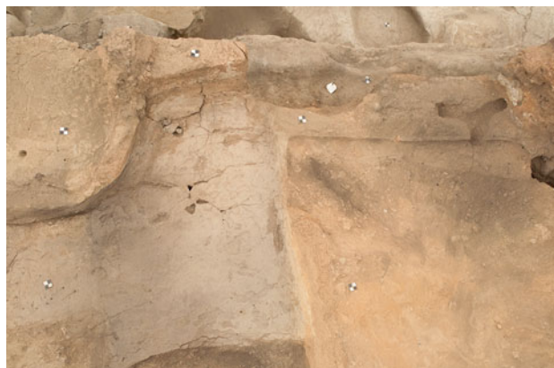
Figure 30.8. South-facing view of niche F.4109.