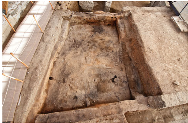
Figure 30.26. North-facing view of Sp.504 at the end of the 2014 excavation season. Bin F.7641 dominates the space.