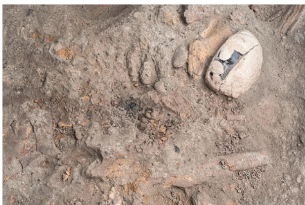
Figure 30.31. Obsidian mirror 30039.x3, in situ within the fill (30039) of burial F.7961.