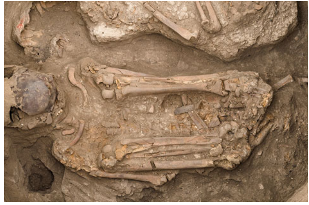
Figure 30.24. North-facing view of skeleton (30044) within burial F.7963. Note to the immediate north skeleton (32330) with its skull painted red. Chert blade 30044.x1 is located by the forearm.