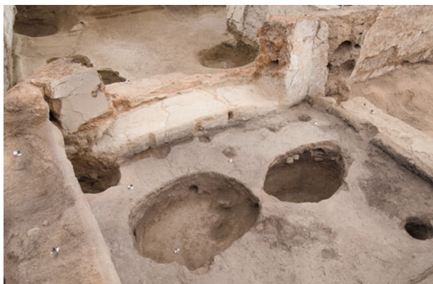
Figure 30.10. Northeast-facing view of niche F.7986 during the earliest occupation of B.131. Wall F.7707 had to be excavated, as it was collapsing; therefore, the top break of the cut cannot be seen in this photograph.