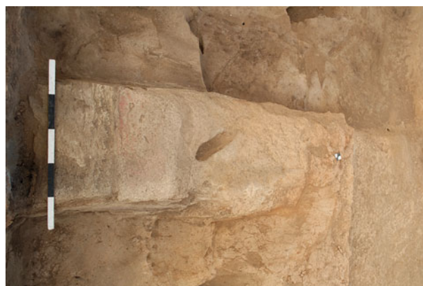
Figure 30.32. Bench F.7966 with platform F.7965.