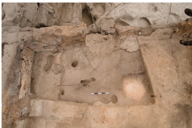
Figure 30.17. South-facing view of the southeastern activity area covered with (23024). Notice the shift in the placement of the entry ladder through time. The earlier cut (23012) is the cut to the west, in alignment with the entry step.