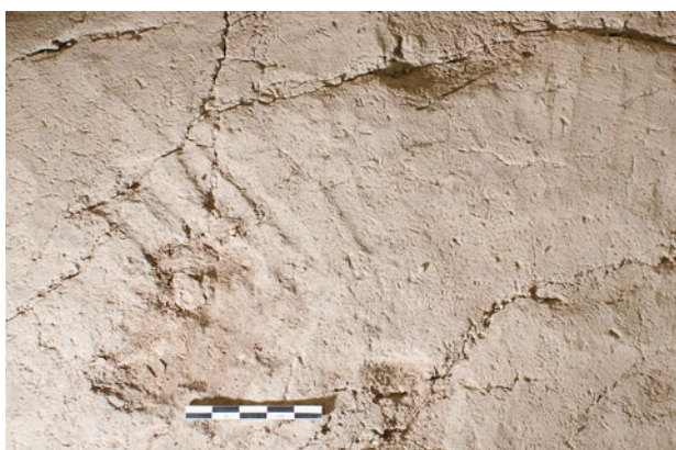
Figure 30.22. South-facing view of fingerprints, fanned across (32366).