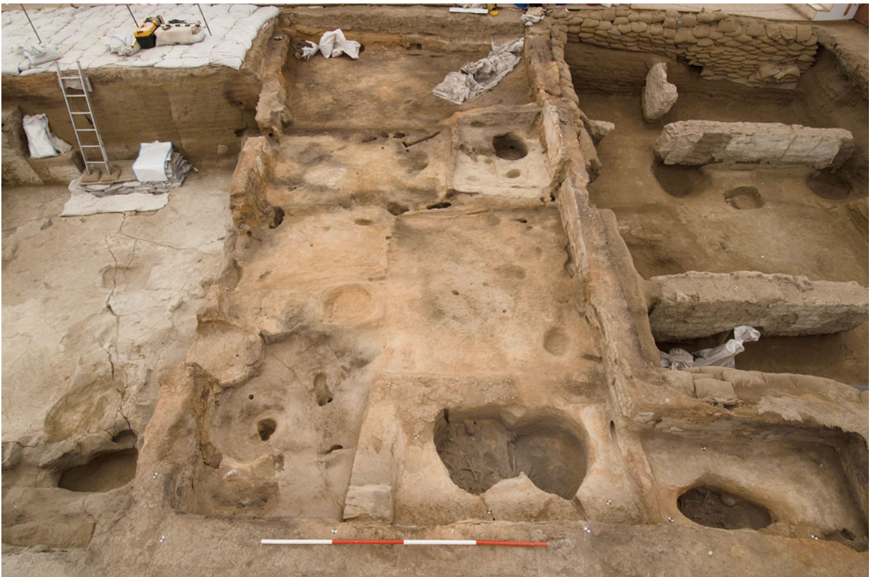
Figure 30.2. West-facing overview of Sp.500 and Sp.556. To the right of B.131 in the photograph is B.1 and to the left, B.132.