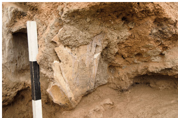
Figure 30.11. 23074.x2 within niche F.7986.