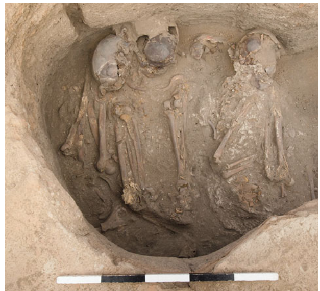
Figure 30.36. West-facing view of skeleton (30040) within burial F.7977, located at the right of this photograph. To the very left is burial F.7963, and the painted red skull (32330) of burial F.8708 can also be seen between skeletons (30040) and (30044).