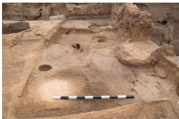
Figure 30.21. East-facing overview of horizon (30096) across the southeastern activity area, gently lipping up to oven F.7953. To the right of the photograph, immediately west of oven F.7953 is make-up (32366).