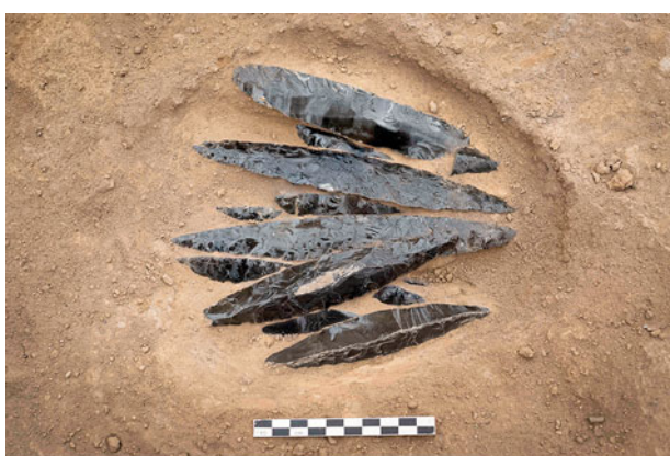
Figure 30.13. Pit F.8359, filled with 24 obsidian blades.