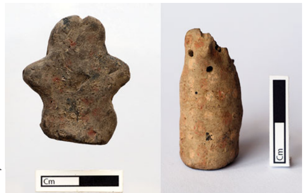
Figure 30.39. Two figurines found within the fill of B.131.