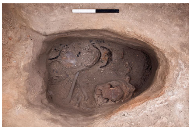
Figure 30.33. West-facing view of some of the wooden bowls found in situ within burial F.7962.