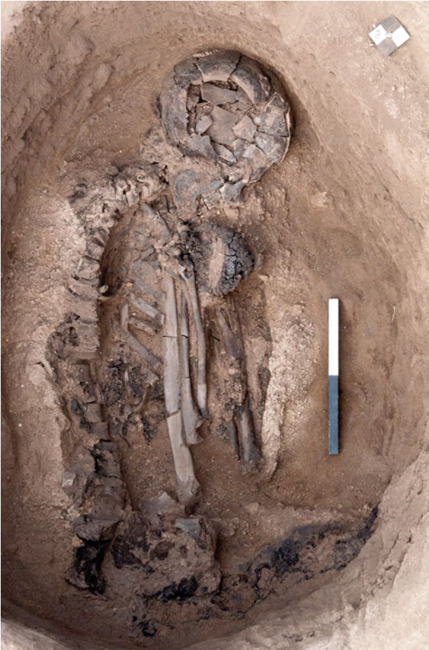
Figure 30.34. West-facing view of burial F.7956, skeleton (22661), with wooden bowl 22641.x1.