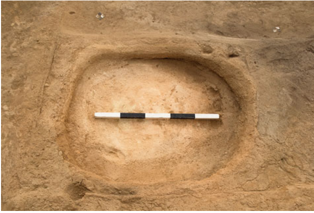
Figure 30.23. East-facing view of hearth F.7957 with superstructure (30060) and (30057). Notice the rectangular stake holes (30066) and (30067) on the northeastern corner of the hearth.