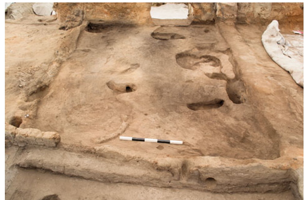
Figure 30.16. South-facing view of floors (32533) covering the southwestern activity area. Note the many truncations that occurred through later activities in the area. Oven F.4106 is faintly visible at the southwestern corner of the area.