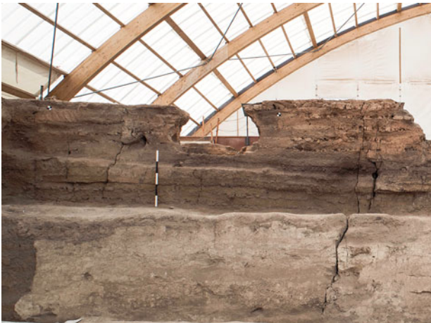
Figure 30.5. North-facing view of the outer face of the southern wall (in the upper part of the photograph) of B.131, F.7705. Notice the circular cut for oven F.4103. The cut was made right above the southern wall of B.139, which is only partially seen. The photograph was taken from Sp.630, so the white plastered wall in the lower part of the image is the northern wall of B.132 which abutted the southern wall of B.139.