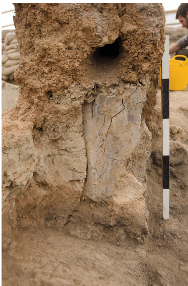
Figure 30.12. 23074.x1 within niche F.7986.