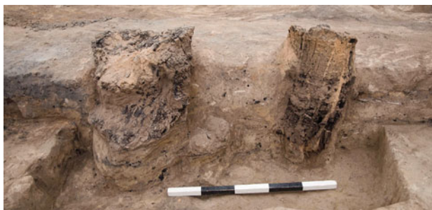
Figure 30.7. West-facing view of timbers (23025) and (23026) within Sp.504.