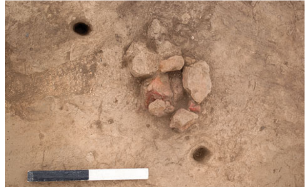
Figure 30.35. A cluster of ochre stones in the middle of the southwestern activity area.