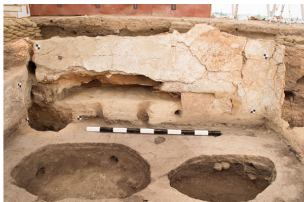
Figure 30.19. North-facing view of niche F.7986, with ground stone blocking its eastern end. Notice posthole F.7991 cutting floor (32371) at the northwestern corner of the activity area.