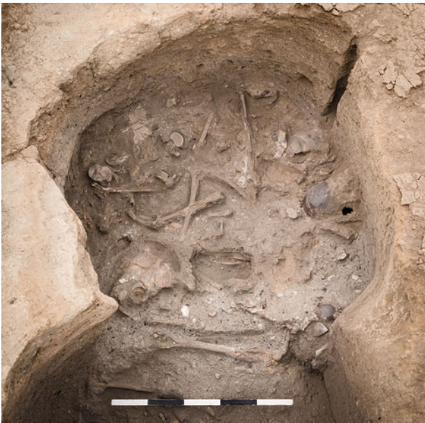
Figure 30.25. South-facing overview of the top fill of burial F.7963, along with burial F.7977 to its north. Cranium (30043) with the carbonised brain remains is immediately south of the skull of (30044). Notice the criss-crossing of various bones, and the complexity of the secondary skeleton elements.