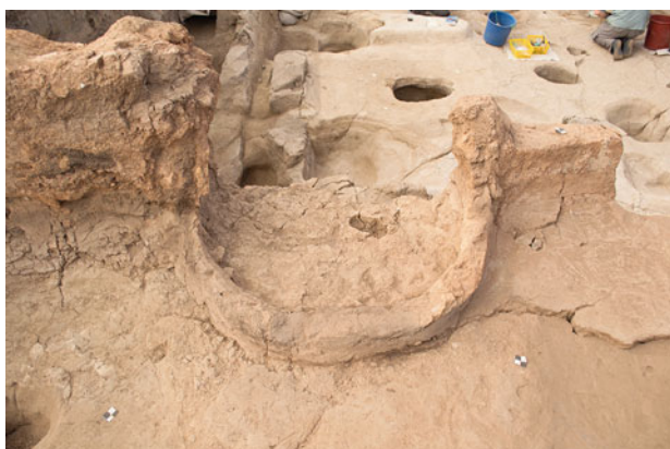
Figure 30.20. South-facing view of oven F.7953 in the southeastern activity area.