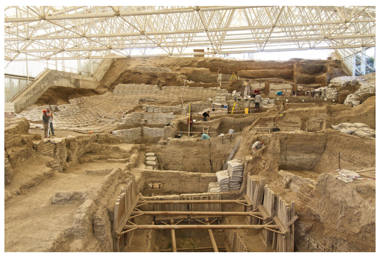
Figure 3.1. South Area excavations in progress showing different houses at different levels.

Shahina Farid, Ian Hodder, James Taylor and Burcu Tung