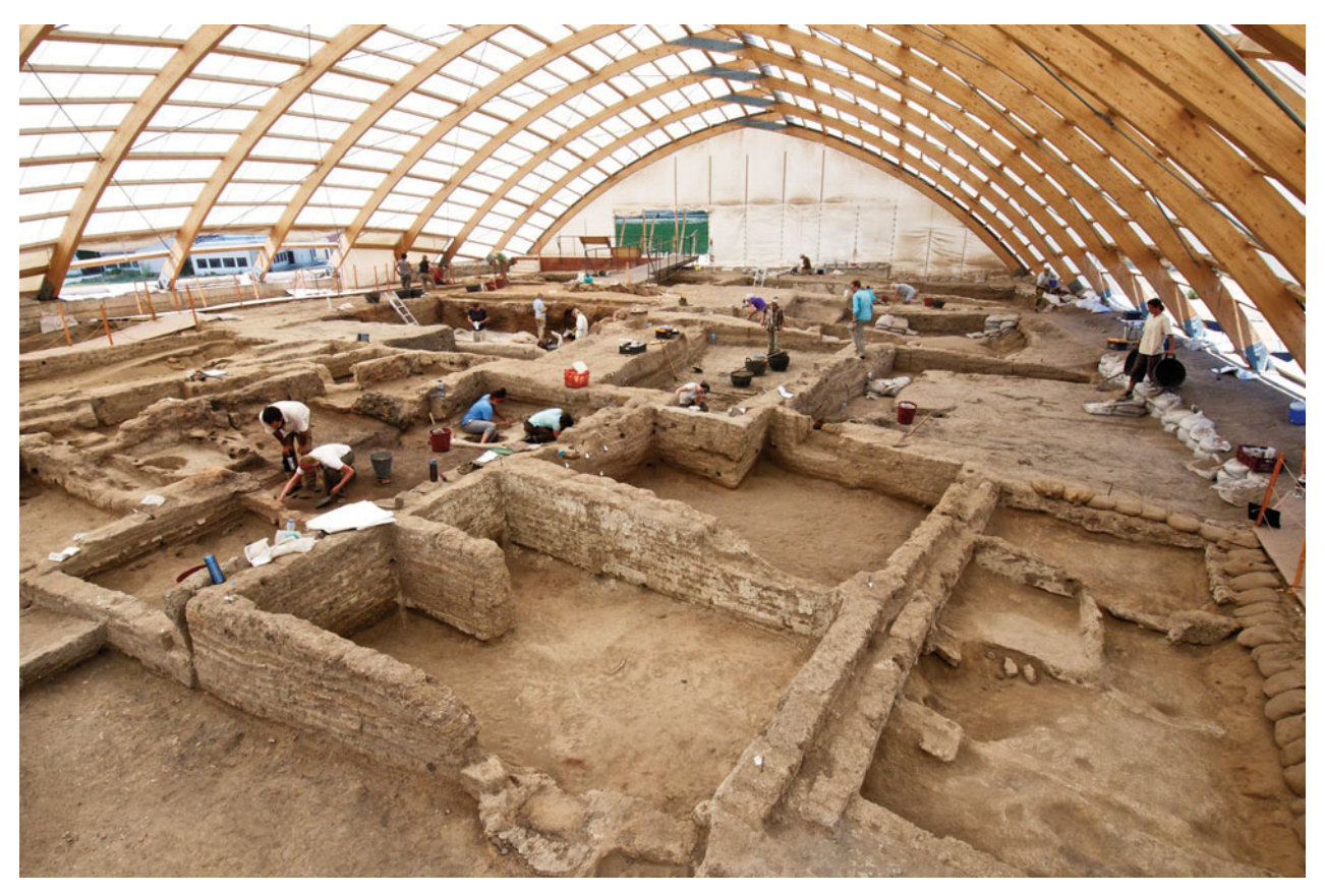
Figure 3.18. View across the northern prominence neighbourhood of buildings in the North Shelter.