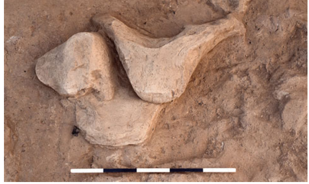
Figure 32.4. One of the zoomorphic plaster heads found on the floor of B.139.