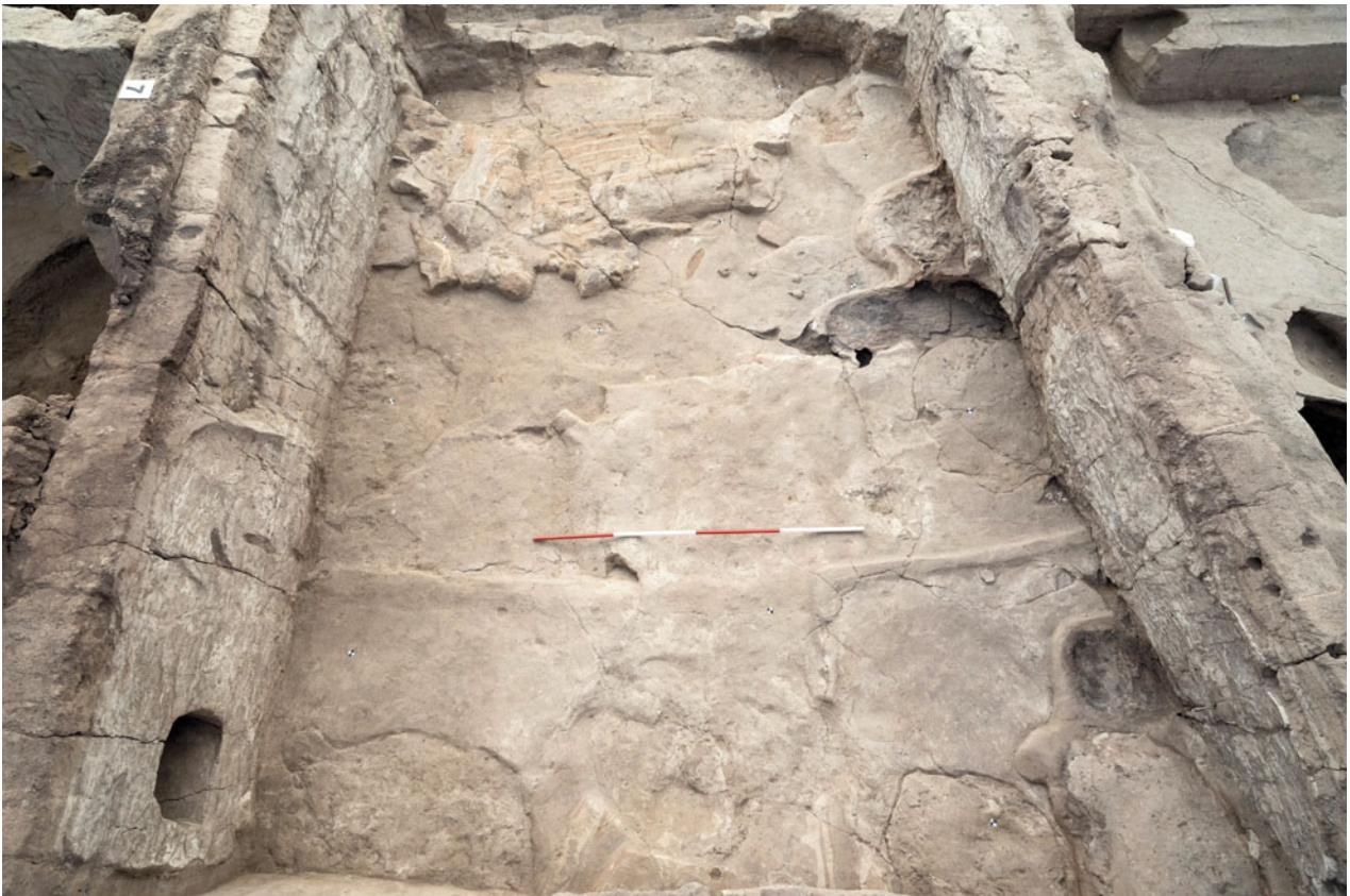
Figure 32.2. West-facing overview of B.139.