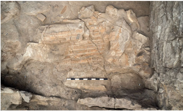
Figure 32.5. Fallen wall at the eastern end of B.139. West to top.