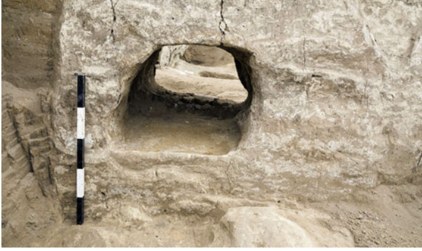
Figure 32.3. Crawl-hole F.8394 going through into Building 5.