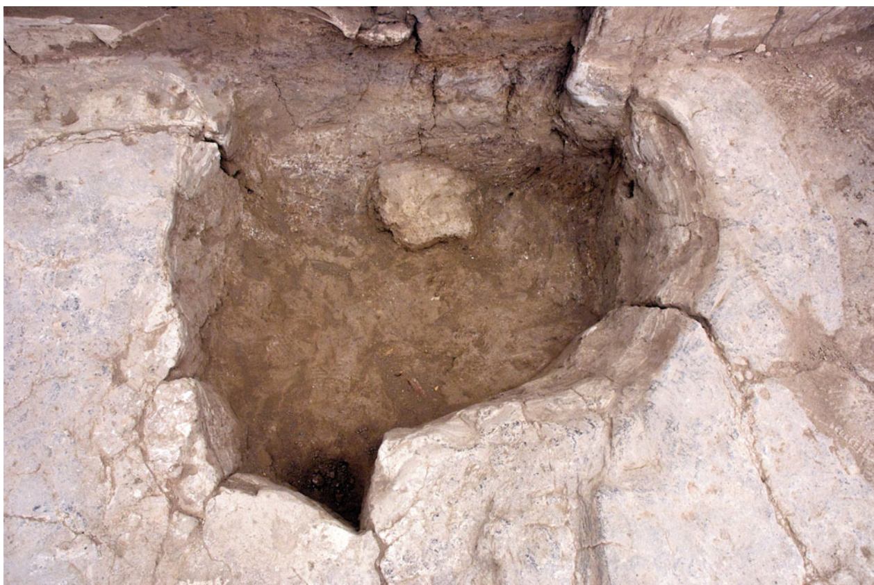
Figure S15.11. West-facing photograph showing large pit adjacent to the western wall (F.7000) (photograph by Agata Czeszewska).