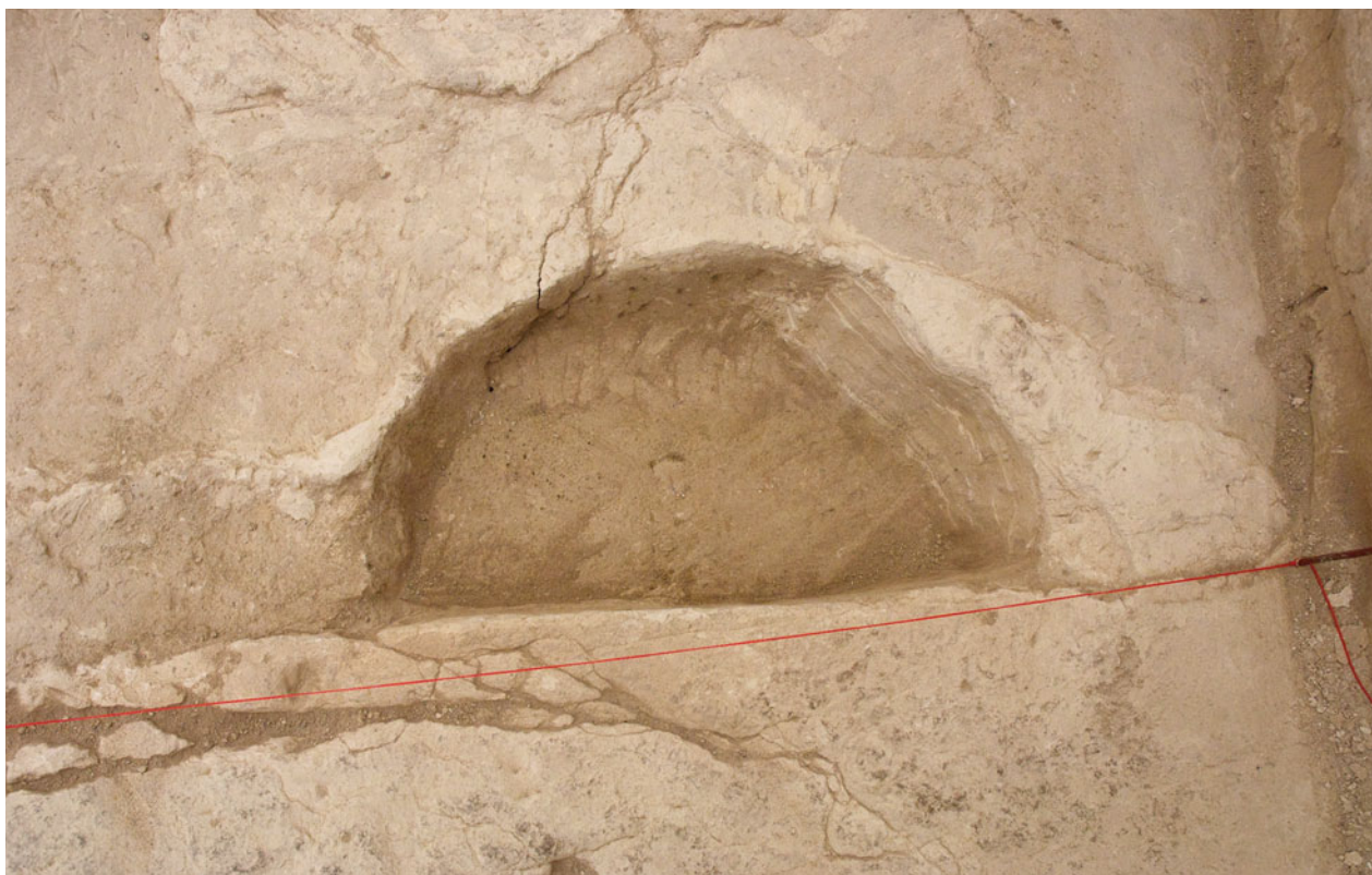
Figure S15.10. North-facing photograph of probable burial cut (19716), with fill (18715) remaining in situ.