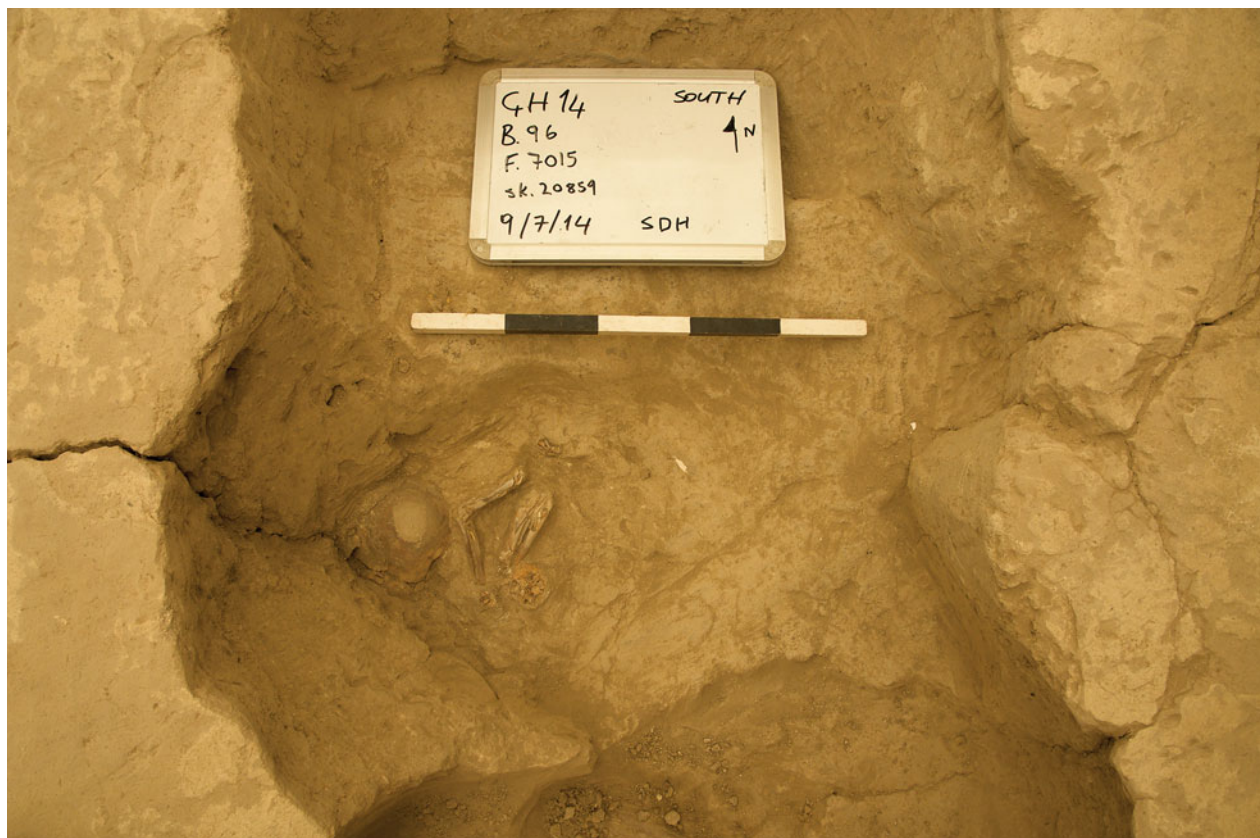
Figure S15.4. North-facing photograph of burial F.7015.