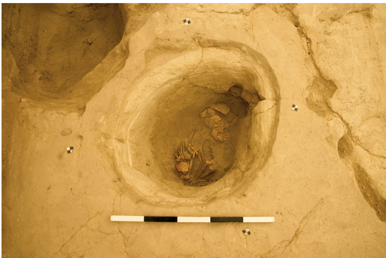
Figure S15.7. North-facing photograph of burial F.7002.