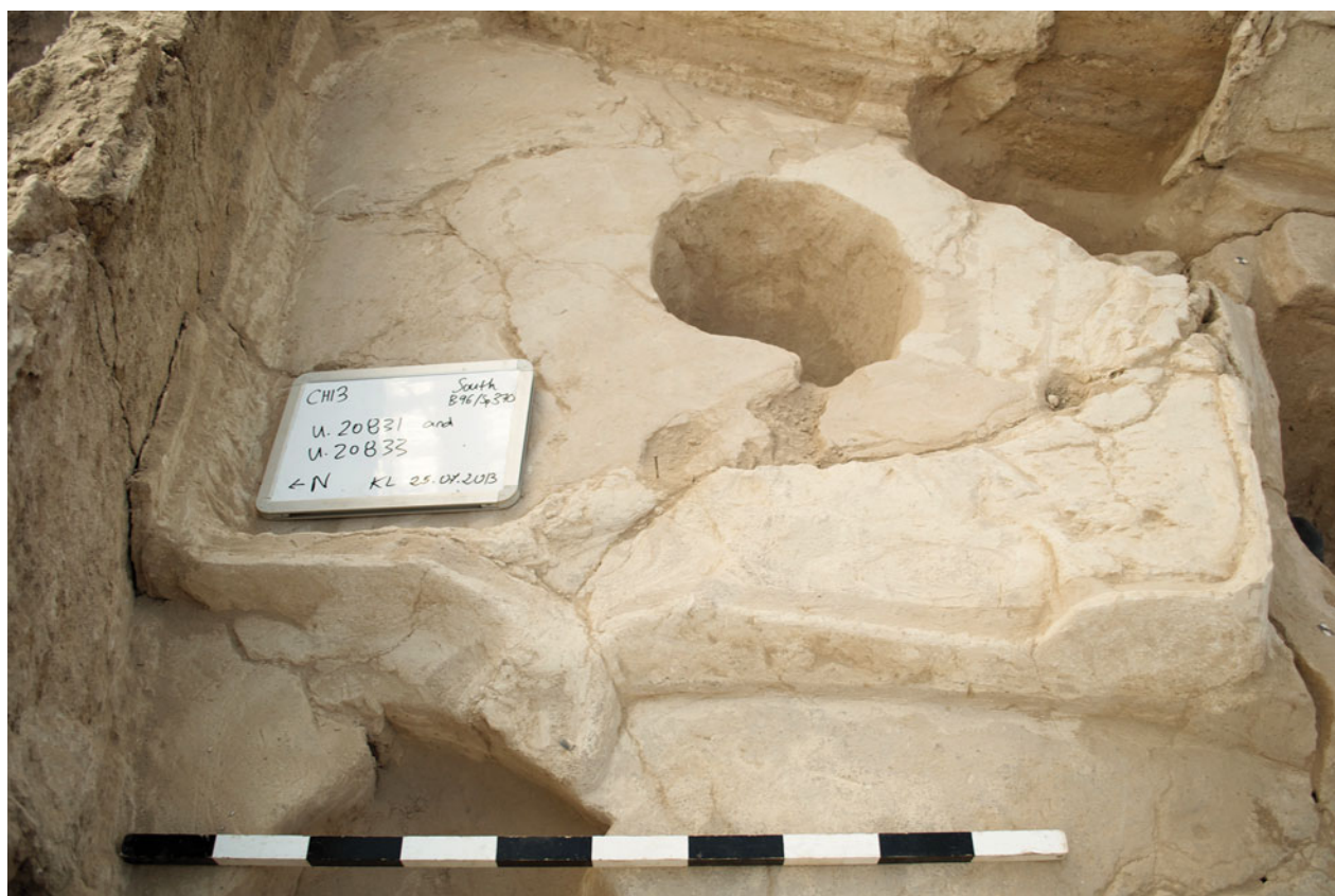
Figure S15.5. East-facing photograph showing floors (20826) and (20833).