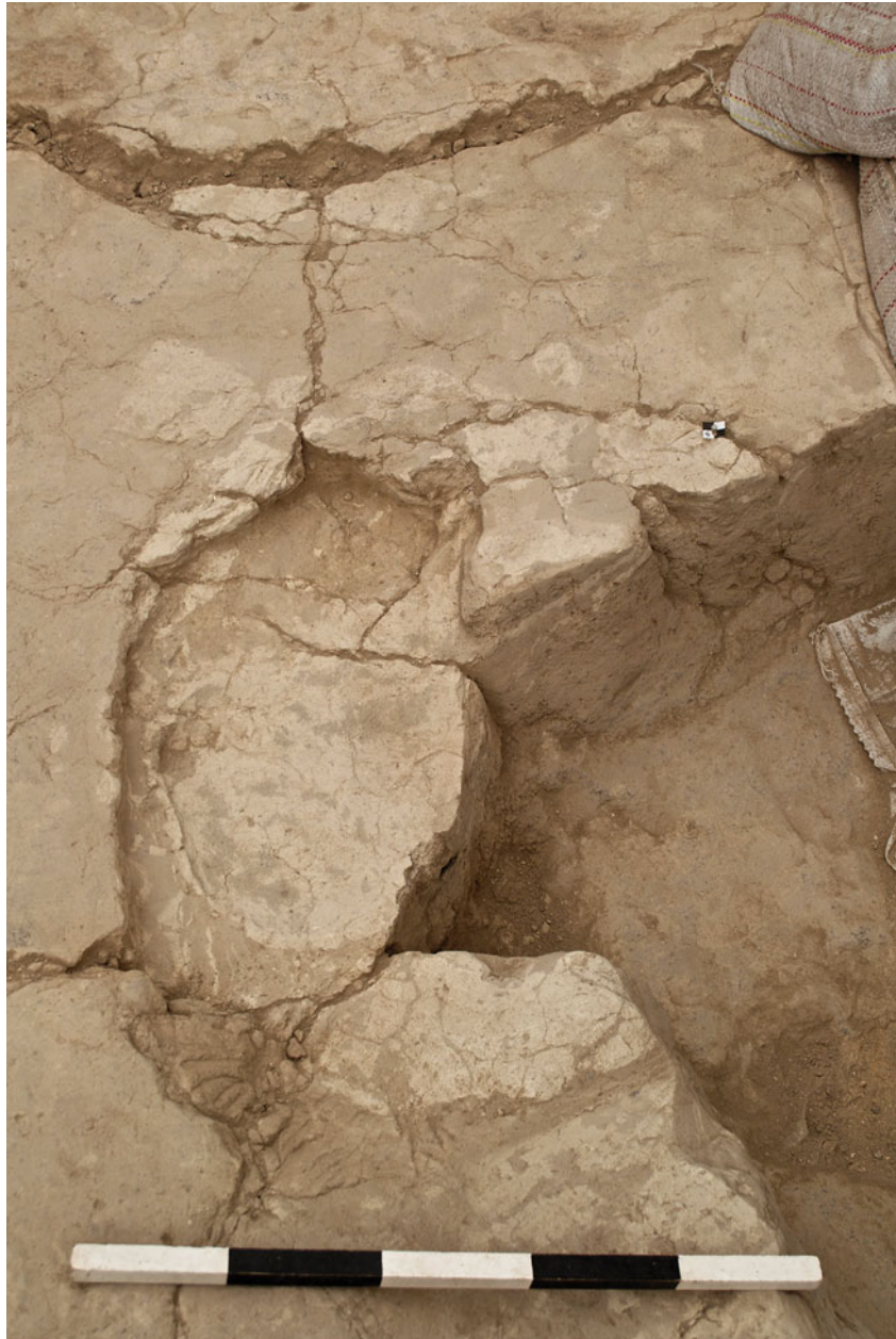
Figure S15.3. South-facing photograph of pit F.7013.