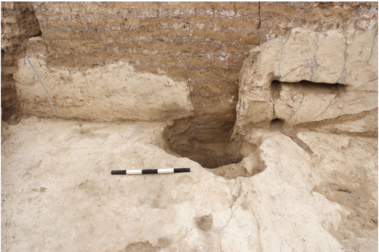
Figure S15.1. East-facing overview of lower part of east wall and post-retrieval pit showing niche F.3511.