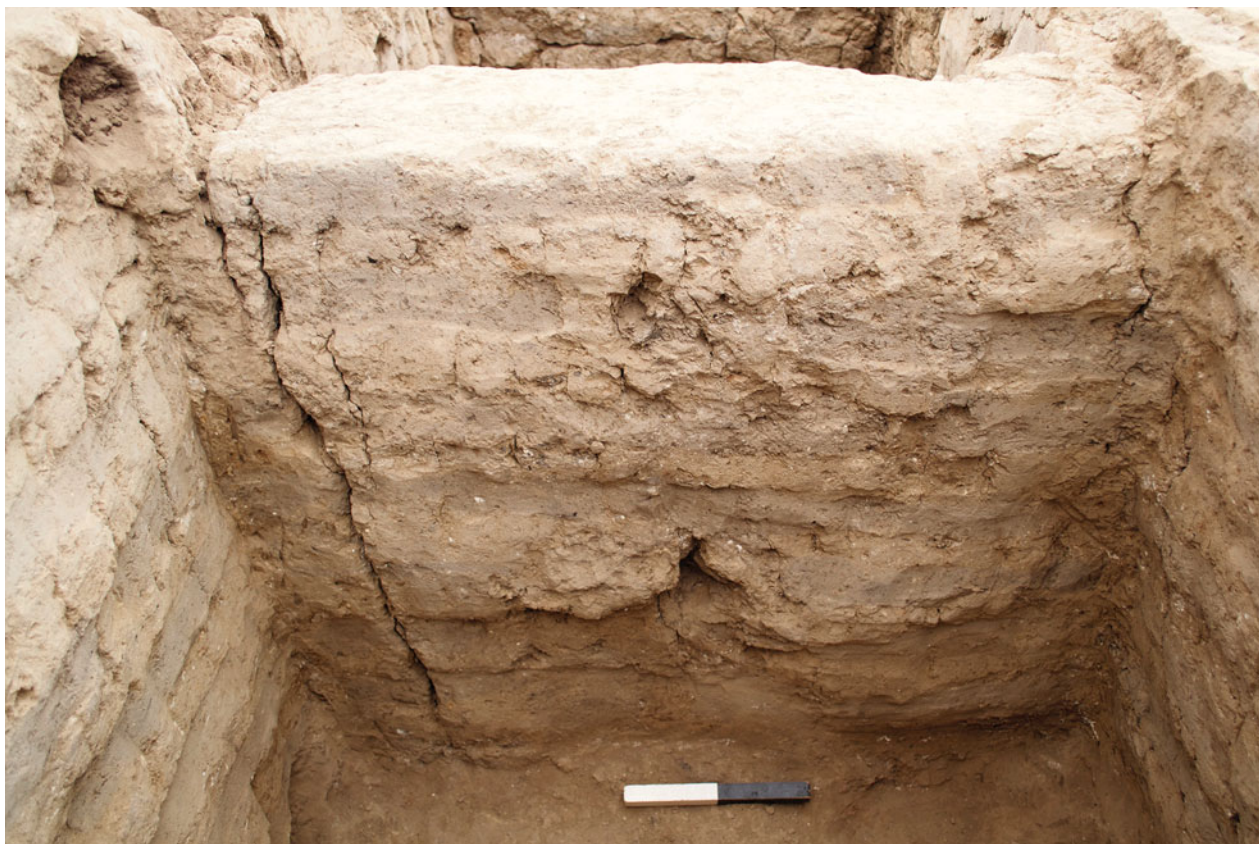
Figure S15.2. 'Box' or 'casement' foundations in Sp.558, to support the construction of Sp.444.