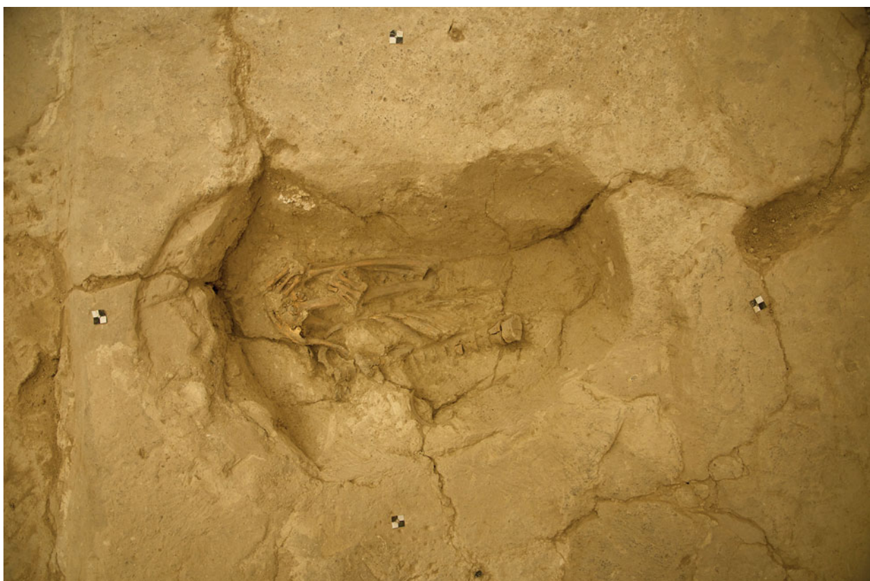
Figure S15.9. North-facing photograph of burial F.7001.