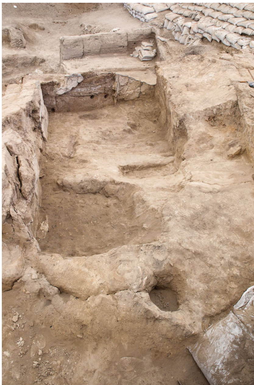
Figure S15.12. North-facing photograph of building infill; note the infilled crawl hole to the north of Sp.370 (infill: 19240).