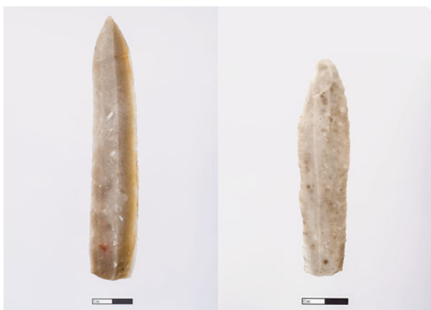
Figure 20.10. Flint blades 22196.x3 and 22196.x4 found under cranium (22196) (photograph by Jason Quinlan).