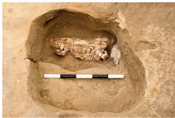
Figure 20.7. The upper level of burial F.3808, with skeleton (22195) placed as a very tight bundle within its cut.