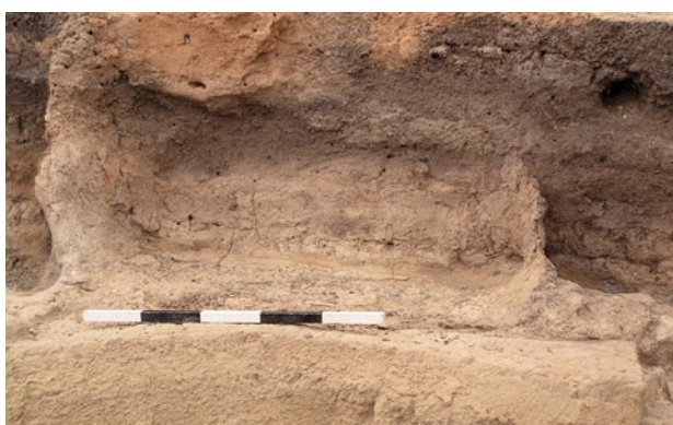
Figure 20.4. Bin F.7716 in Sp.568, including detail of layering against B.131's northern wall.