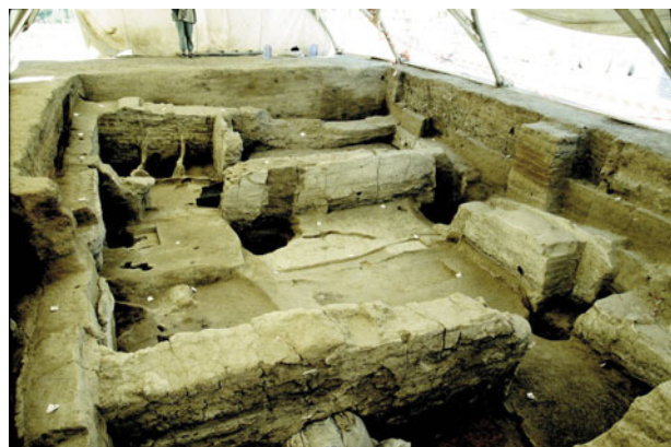
Figure 20.2. West-facing view of Building 5 under excavation during the 1990s showing still-upstanding features.