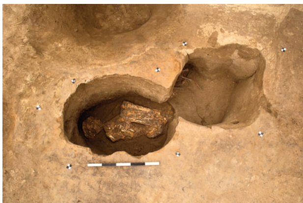
Figure 20.6. Poorly preserved primary skeleton (32205) in burial F.3810 (left) and what remains of disturbed primary skeleton (22197) in burial F.3813.