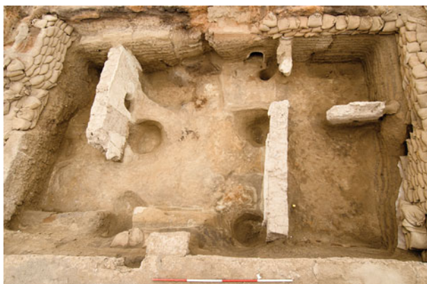
Figure 20.1. South-facing view of Building 5 before the beginning of excavations in 2016. Note the eroded features and floors.