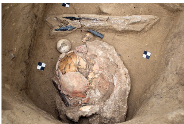
Figure 20.8. Container 22196.x1 with cranium (22196), projectiles 22194.x2, 22194.x3, 22194.x4 and 22194.x5, shell 22194.x6 and 'macehead' 22194.x1.