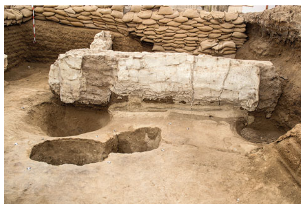
Figure 20.5. The eroded western platforms of B.5 (directly in front of white-plastered wall F.230) during the earlier phases of the excavation in 2016.