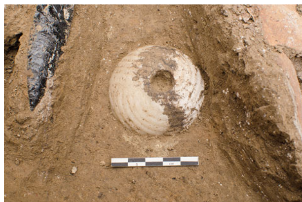
Figure 20.11. Close-up of the perforated sphere 22194.x1 with grooves organised in crossing pattern.