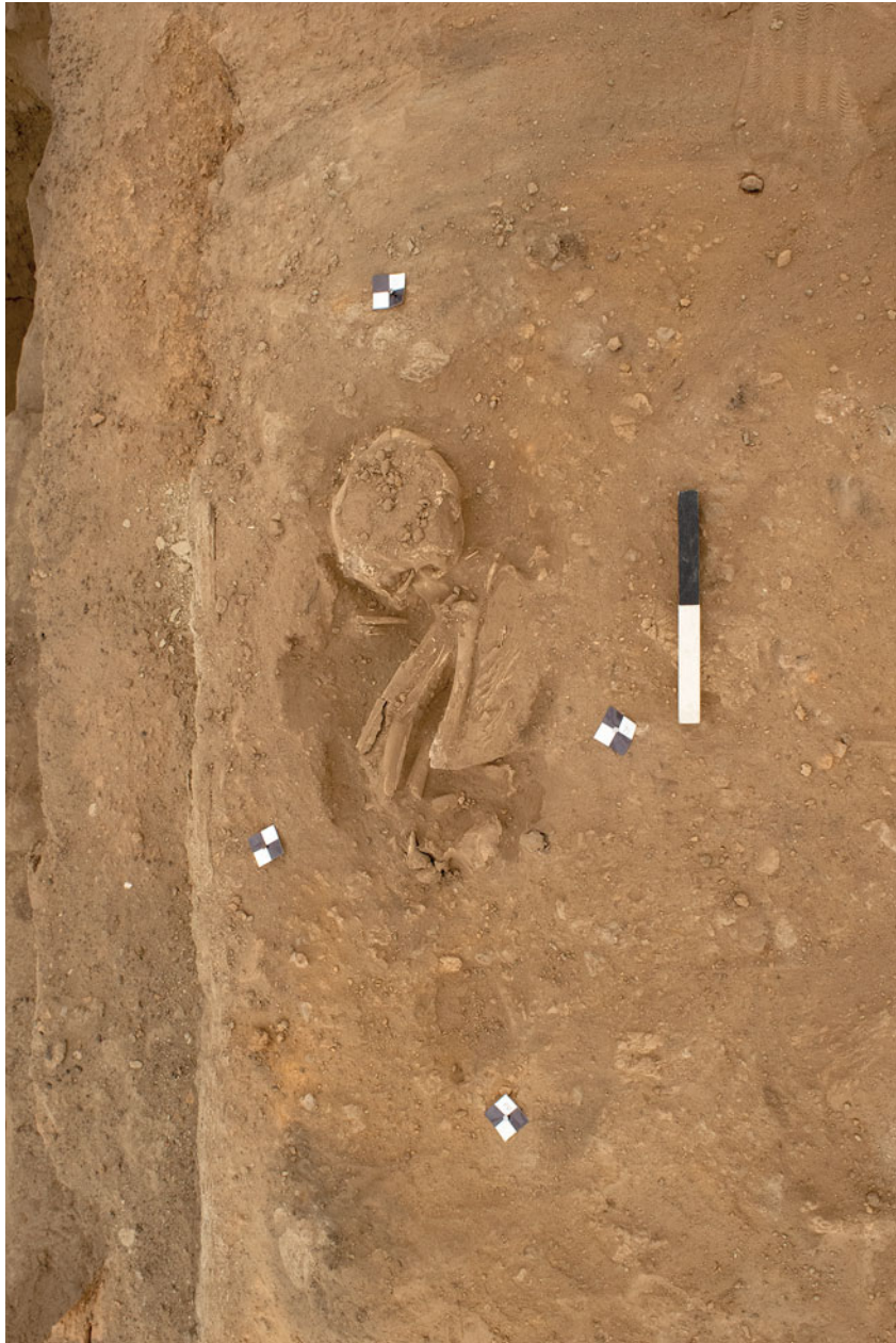
Figure S29.4. East-facing view of burial F.7709, skeleton (22615).