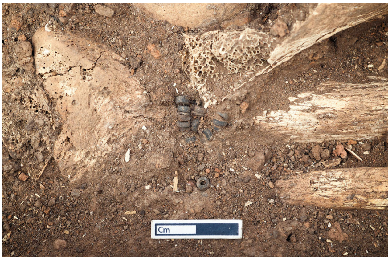
Figure S29.6. Detail of anklet found around the ankle of skeleton (22620), recorded as 22623.x3.