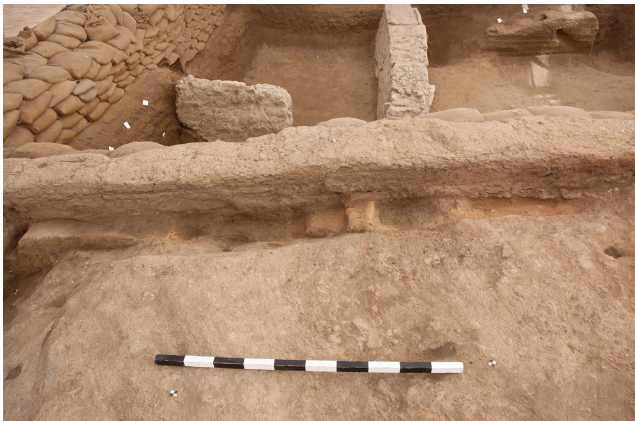
Figure S29.2. Foundation trench F.7563 for the northern wall F.218/7558 of B.129.