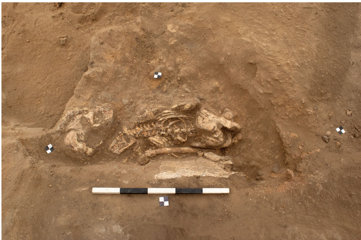
Figure S29.5. West-facing view of skeleton (22620) in burial F.7714.