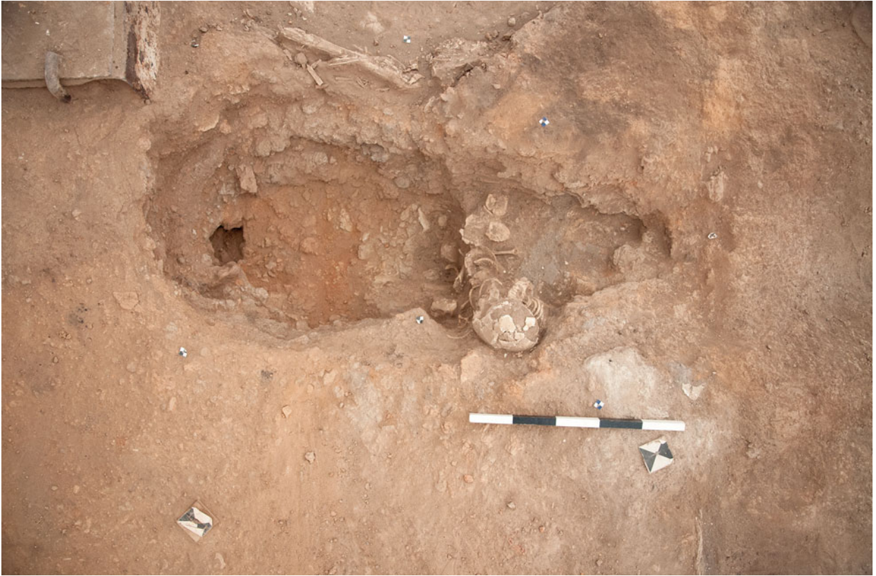
Figure S29.7. North-facing view of primary disturbed skeleton (19541) within burial F.3643.