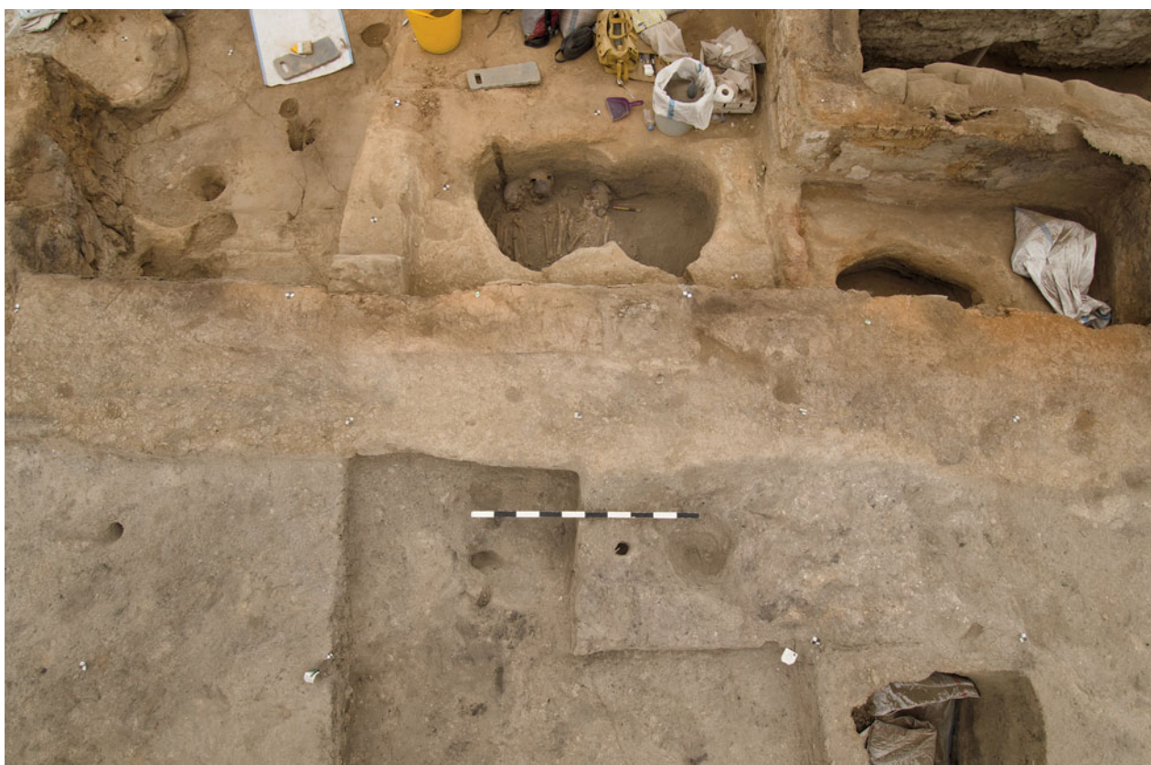
Figure S29.3. West-facing view of remnants of B.129's eastern wall east of B.131's eastern wall. The eastern platforms of B.131 can be seen below to the west.