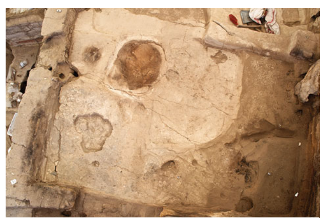
Figure 11.16. North-facing overview of southern part of Space 135, showing re-build of structured hearth F.7402 and construction of new platform F.7423.