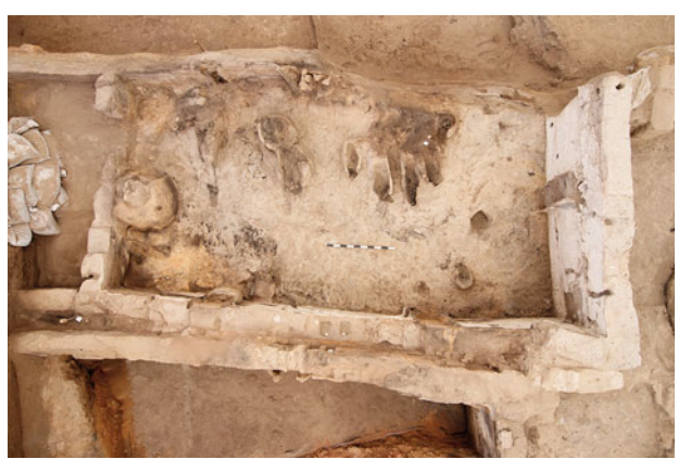
Figure 11.54. West-facing downward overview of backfill clearly showing rows of charred east—west oriented timber remains through the fill deposits.