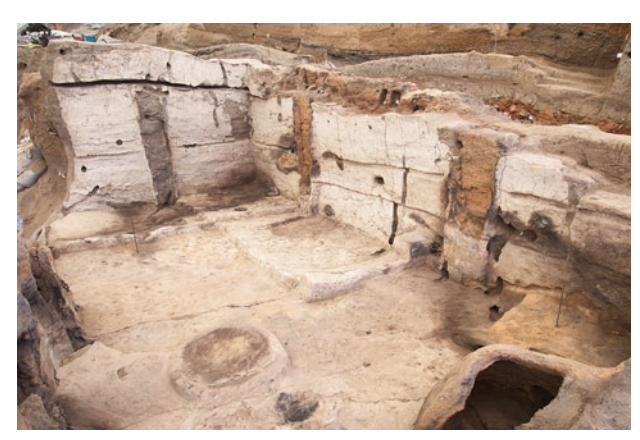
Figure 11.3. Northern end of Building 80 in its latest phase (just pre-fire/abandonment); note the height of the north wall (F.2533), which stood 2.1m high when the fire destroyed the southern part of the building.