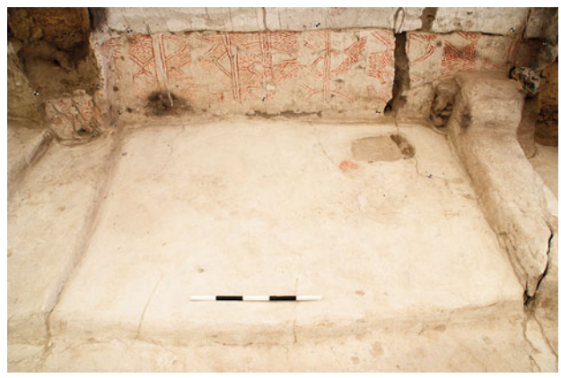
Figure 11.41. East-facing photograph of the red pigment 'spill' (20079) in context on the surface that seals the burial sequence (18989) of the east-central platform.