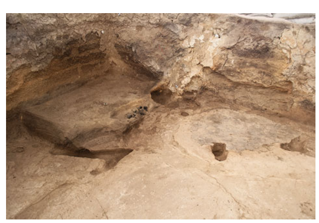
Figure 11.44. Southeast-facing photograph of the southern area of Space 135, showing the oven base (F.5041) and associated ladder platform, with charred in situ wood remains and ladder scar up the southern partition wall.