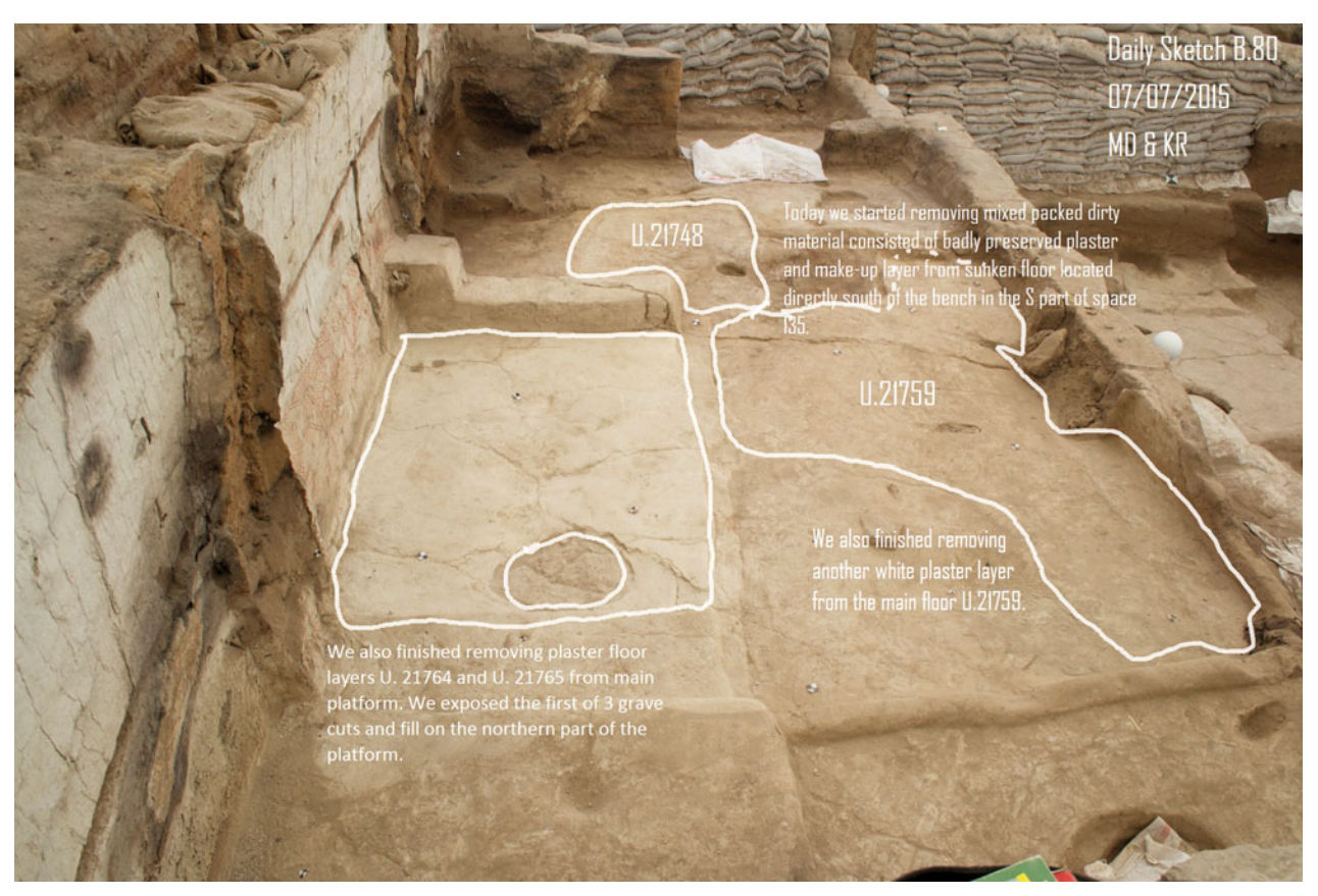
Figure 11.37. Daily sketch by Kate Rose showing floors (21748), (21759), (21764) and (21765) in Building 80.