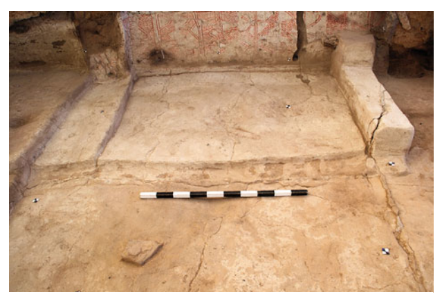
Figure 11.21. East-facing photograph showing embedded quern installation (21767.x2) in situ in the central floor of Space135.