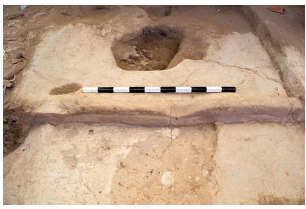
Figure 11.29. North-facing photograph of clay partition (21781).