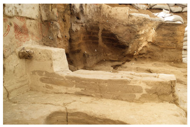
Figure 11.19. Southeast-facing photograph showing bucranium set into bench F.7415 and the brick core (22436) of the original bench structure.