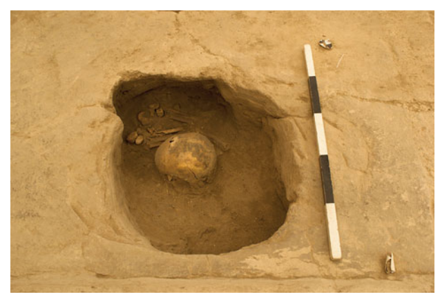
Figure 11.25. South-facing photograph showing burial F.7407.