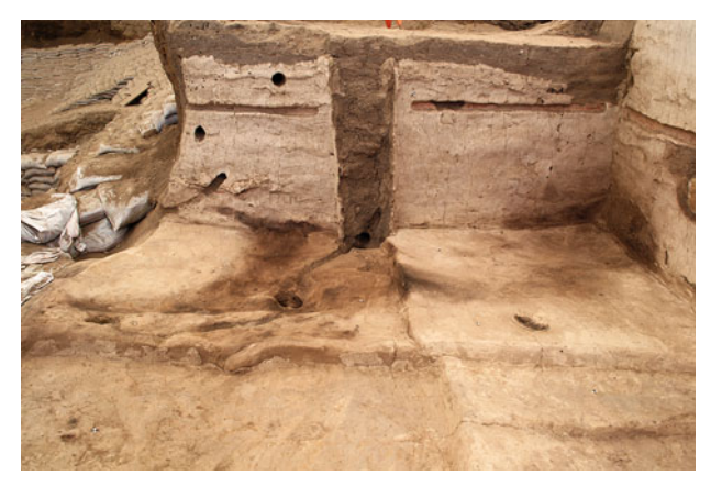
Figure 11.8. North-facing photograph of engaged pillar F.3422 against the northern wall of Space 135.