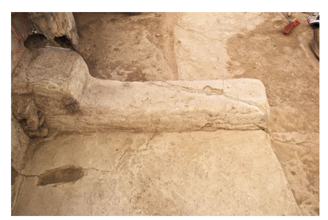
Figure 11.31. South-facing photograph of platform F.7401 and its relationship with bench structure F.3439.