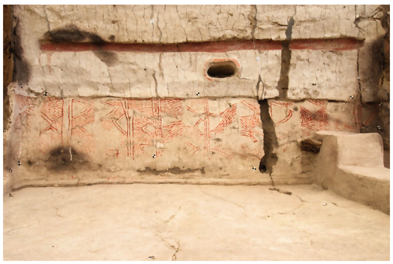
Figure 11.6. East-facing photograph showing the painting (18918) on the east wall of Building 80 (F.5014); note the small niche with a red border in the centre-right of the upper panel, below the linear inset band.