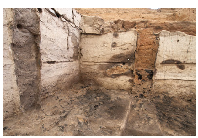
Figure 11.52. Northeast-facing photograph showing charcoal-rich deposit (18948) close to the floor, which could be the remains of a wooden structure.