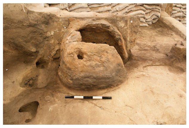
Figure 11.45. South-facing photograph showing almost complete oven F.5041.