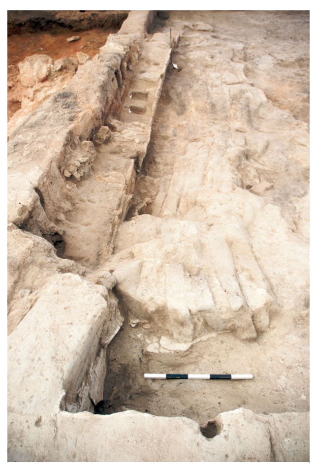
Figure 11.55. South-facing photograph showing detail of sheet-collapsed wall along the eastern part of the backfill, probably associated with the upper part of the eastern wall.