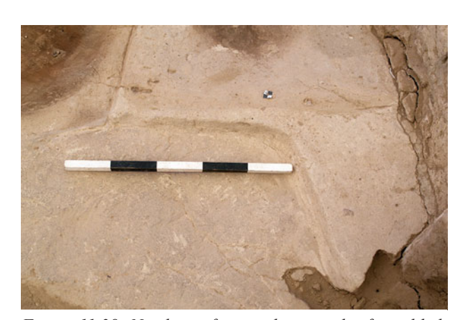
Figure 11.38. Northeast-facing photograph of moulded-clay structure (20088).