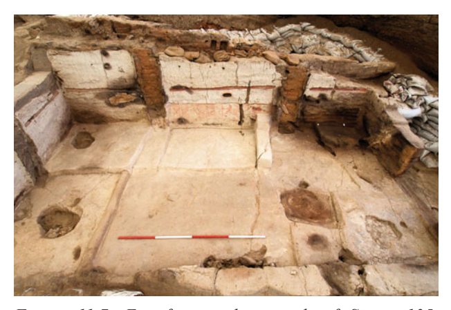
Figure 11.7. East-facing photograph of Space 135, showing early features in the building including engaged posts against the eastern wall of Space 135 (F.3428 and 3429 respectively).