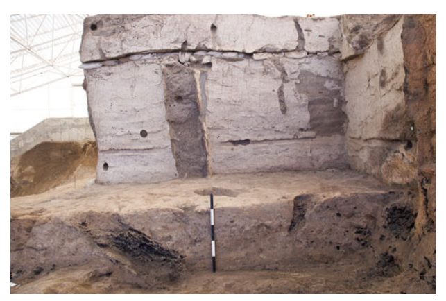
Figure 11.9. North-facing photograph of the same engaged pillar against the northern wall of Space 135 (F.2533), prior to the removal of the upper part of the wall in 2013; note the relationship between the top of the post scar and the upper section of wall, divided by a horizontal timber slot running along the internal face of the wall.