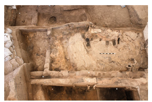
Figure 11.47. Top down (west-facing) photograph showing overview of destruction and abandonment deposits in Building 80 (with Building 79 situated to the east, bottom of image)