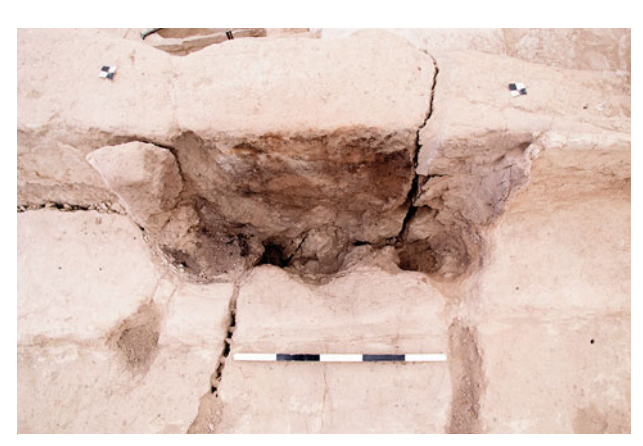
Figure 11.10. West-facing photograph showing triple post installation (F.3433) against the west wall of Space 135 and associated kerb.