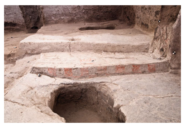
Figure 11.34. North-facing photograph showing red stripes found upon the plaster (21789) on bench structure, F.7410 next to the central platform in Space 135.