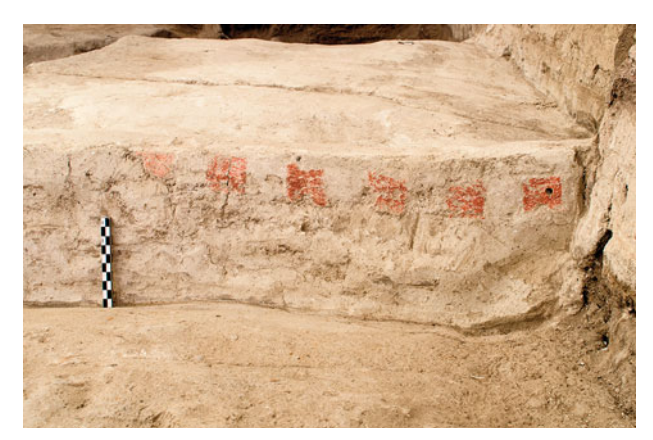
Figure 11.36. North-facing photograph of 'chequer-board' red painting discovered on the edge of platform F.7410.