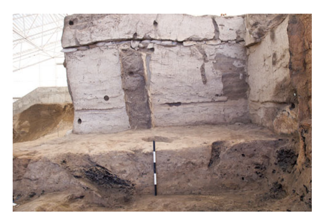
Figure 11.53. North-facing photograph showing elements of charred timber (18538), (18585) and (18586) in section through the backfill of Space 135 (photograph by Roddy Regan).