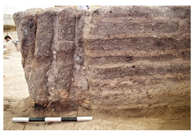
Figure 11.42. North-facing photograph showing southern face of partition wall extension F.7403 with vertical bricks.