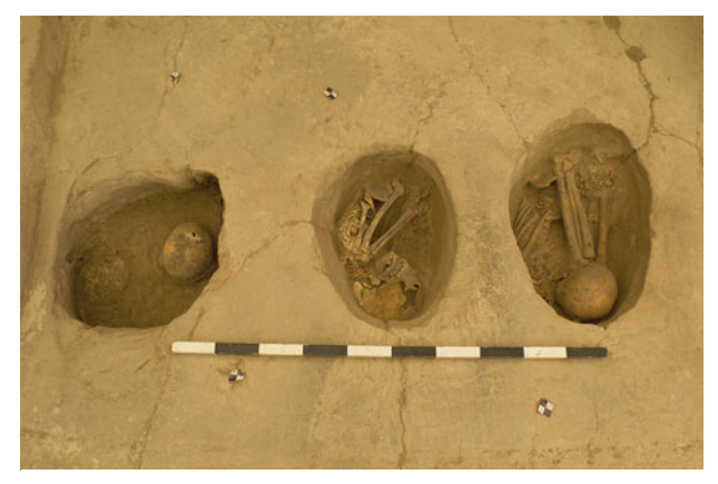
Figure 11.24. East-facing photograph showing three primary child burials in the east-central platform (left to right: F.7407, F.7408 and F.7409).