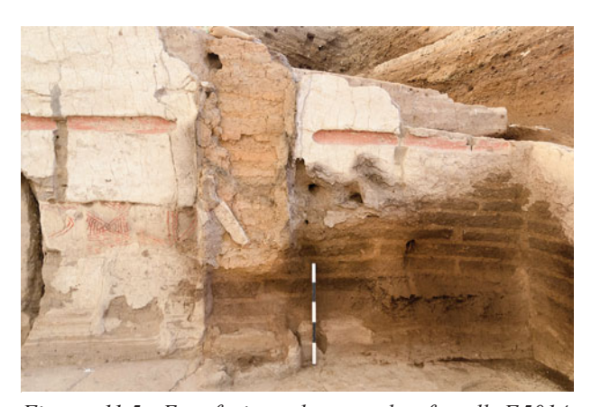
Figure 11.5. East-facing photograph of wall F.5014, showing engaged pillars and the linear inset band (18985).