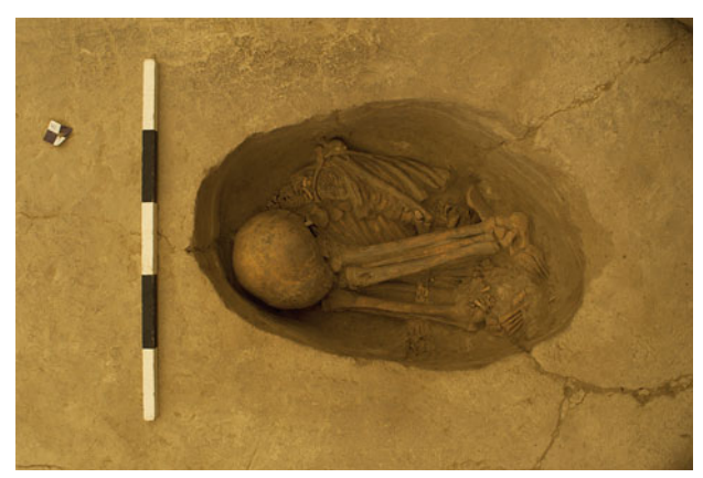
Figure 11.27. North-facing photograph showing burial F.7409.