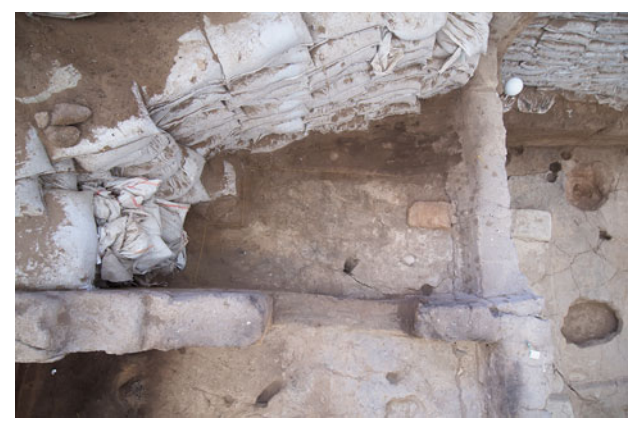
Figure 11.11. South-facing (top down) overview showing accessible limits of Space 373 (photograph by Jason Quinlan).