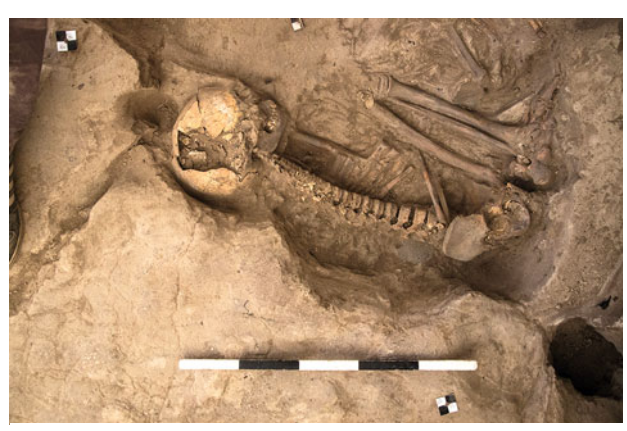
Figure 11.15. North-facing photograph showing burial F.7420.