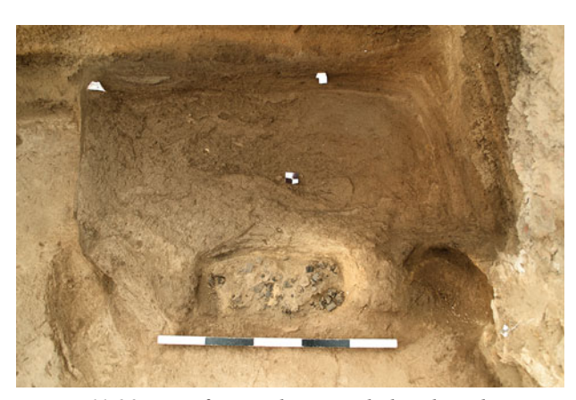
Figure 11.20. East-facing photograph detailing the in situ remains of the burnt wooden ladder (F.7425).