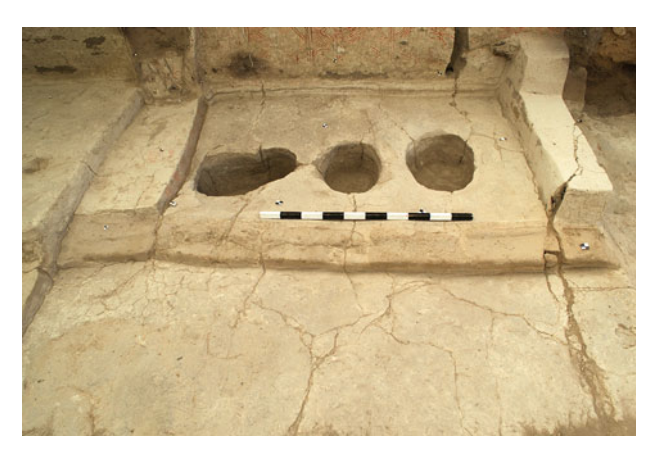
Figure 11.33. East-facing photograph of mudbrick platform modification (22416/22417) (photograph by Mateusz Dembowiak).