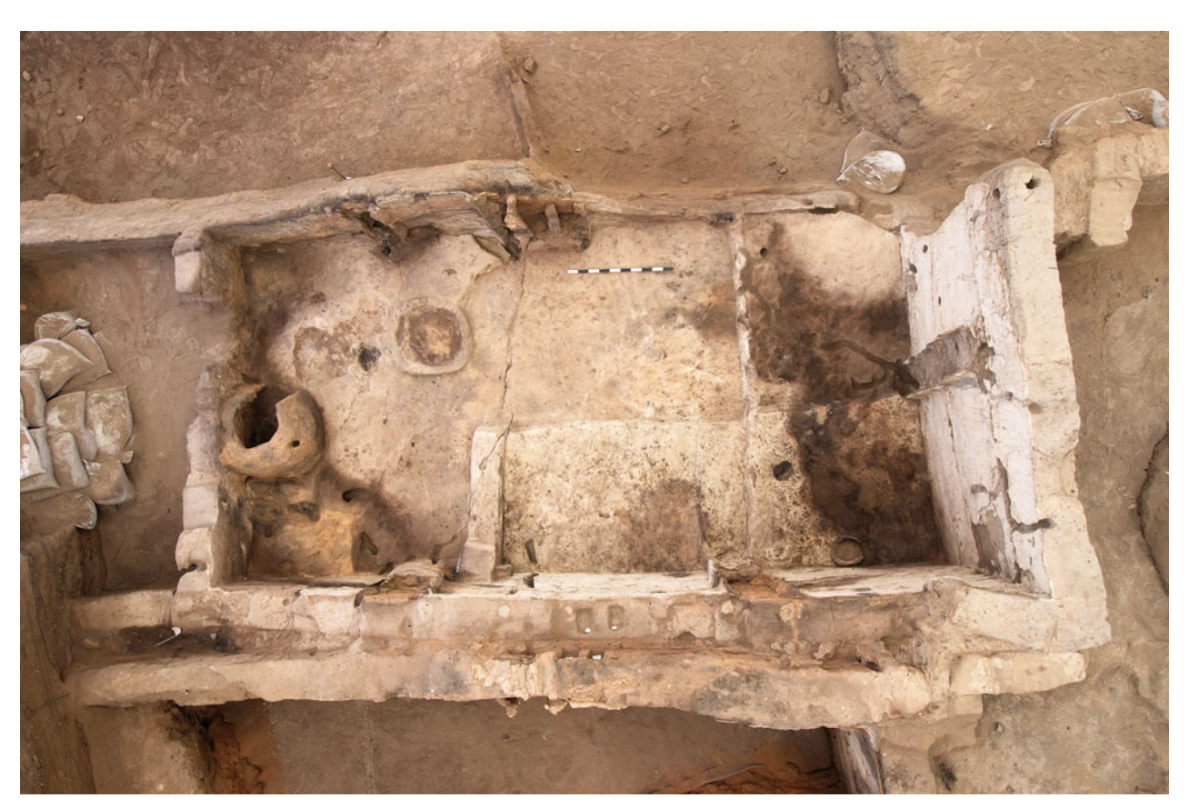
Figure 11.1. West-facing (top down) photograph of Building 80 in its latest phase (just pre-fire/abandonment).