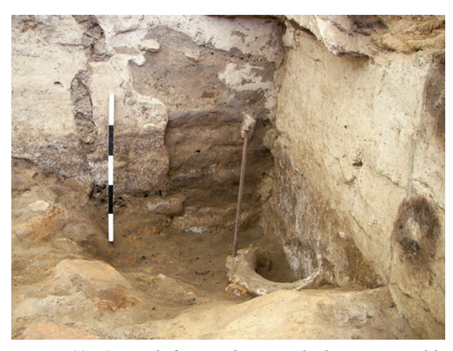
Figure 11.56. North-facing photograph showing possible installation retrieval pit (18563) through the backfill in the northeast corner of Space 135.