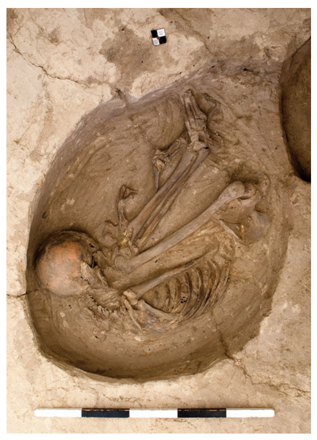
Figure 11.30. North-facing photograph of burial F.7422.