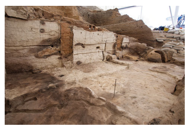
Figure 11.4. Southern end of Building 80 in its latest phase.