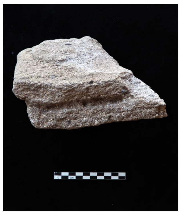
Figure 11.22. Quern (21767.x2).