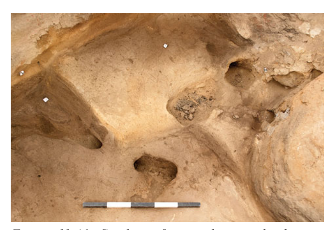
Figure 11.46. Southeast-facing photograph showing compound surface (18976).