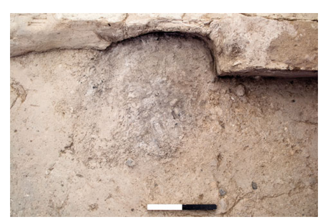
Figure 11.12. North-facing photograph showing fire spot (21235/21272).