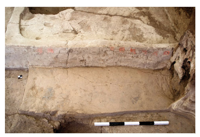
Figure 11.28. North-facing photograph showing bench feature F.7410.