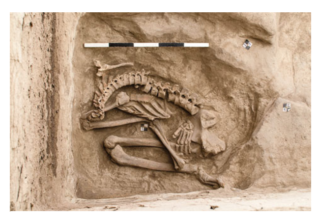
Figure 11.18. South-facing photograph of the burial F.7427 in the northeast corner of the northeast platform of B.80.