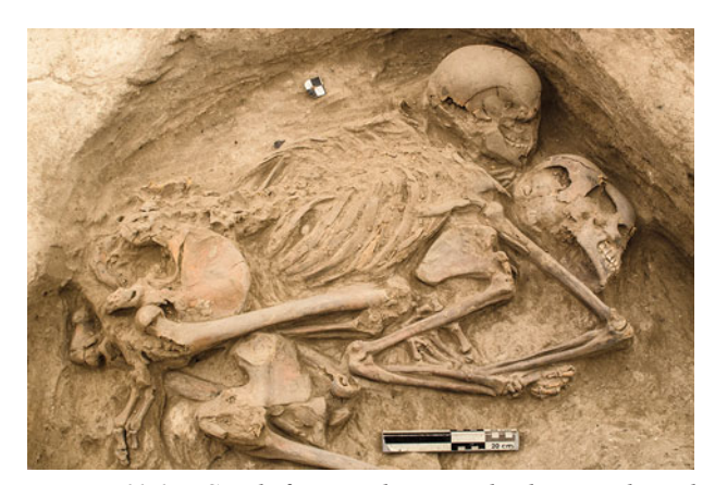
Figure 11.14. South-facing photograph showing burial F.7418.