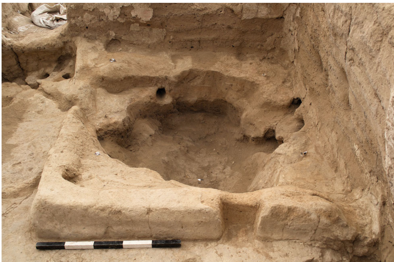
Figure S26.3. Platform F.638 in its early construction.