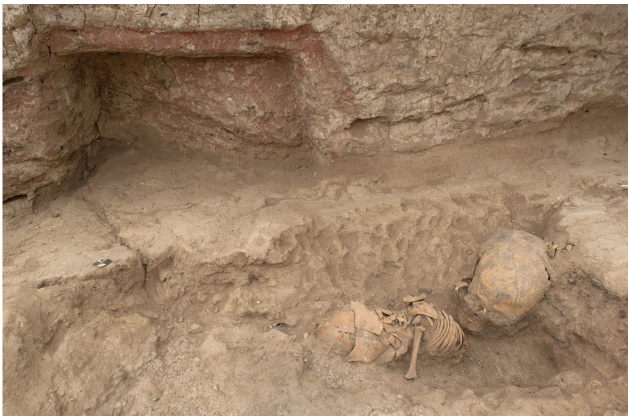
Figure S26.5. South-facing view of burial F.7615, infant (30006). The infant has been placed on the chest of the adult (photograph by Scott Haddow).