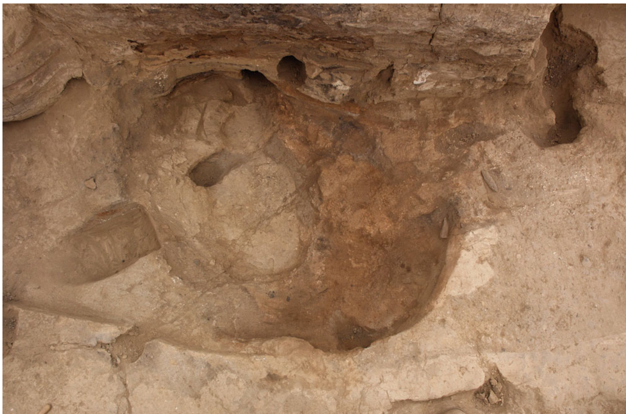
Figure S26.2. Oven F.7607, first floor – both (30014) and (21563).