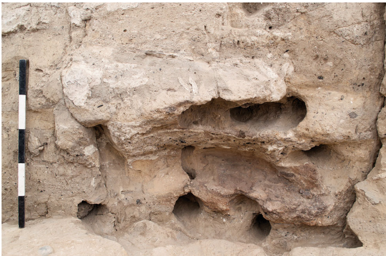
Figure S26.4. Oven F.7607 turned into a niche with plaster (30015).