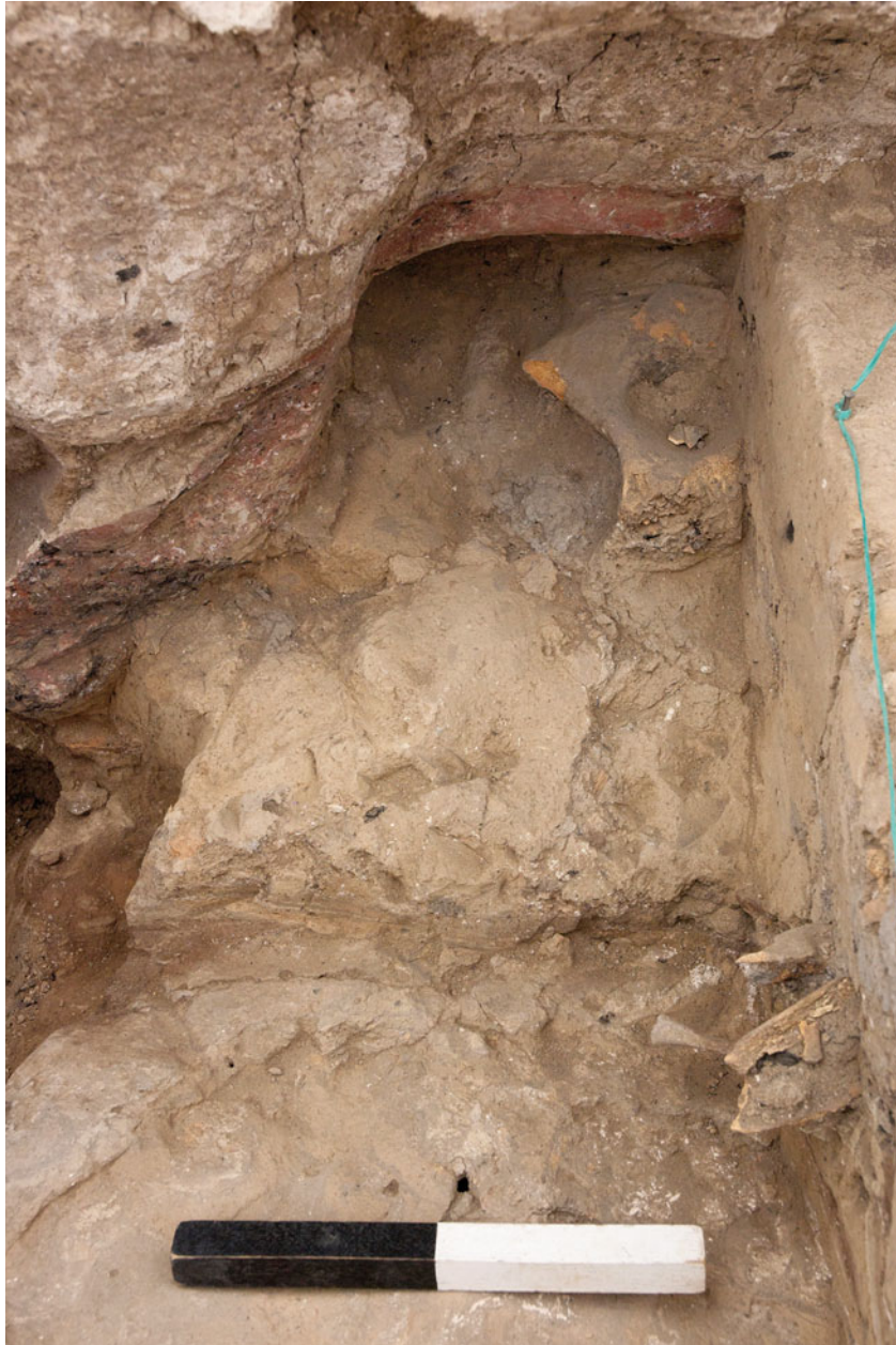
Figure S26.11. Aurochs atlas found in niche F.8143.