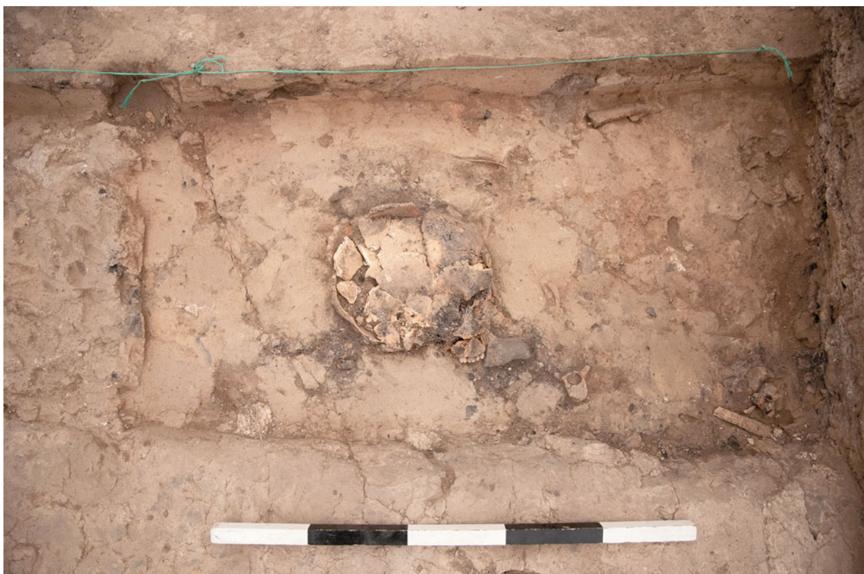
Figure S26.13. Cranium (20682) found within infill (20627).