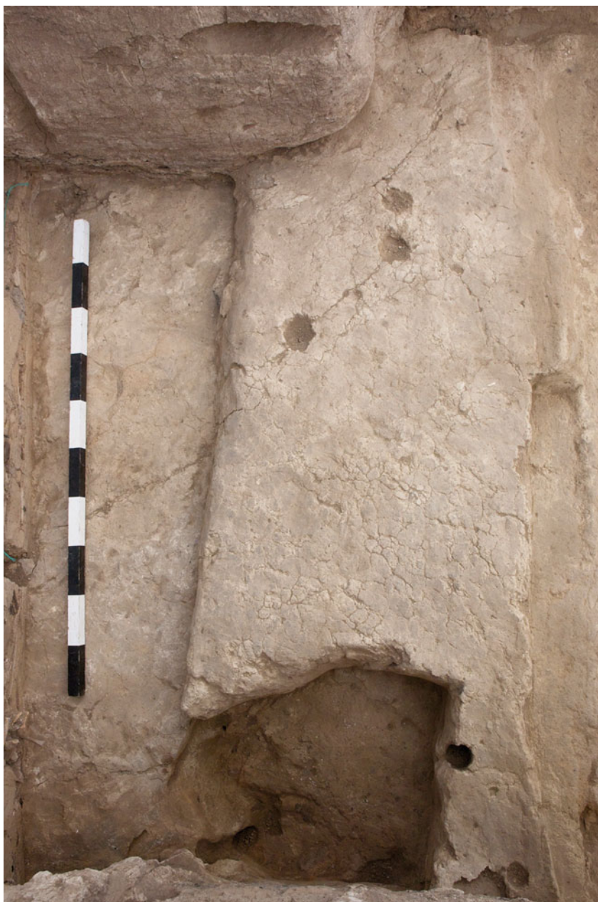
Figure S26.10. North-facing view of platform F.7114, plaster surface (20628).