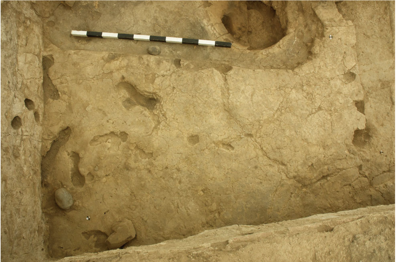
Figure S26.9. Floors (21344) in the southwestern activity area.