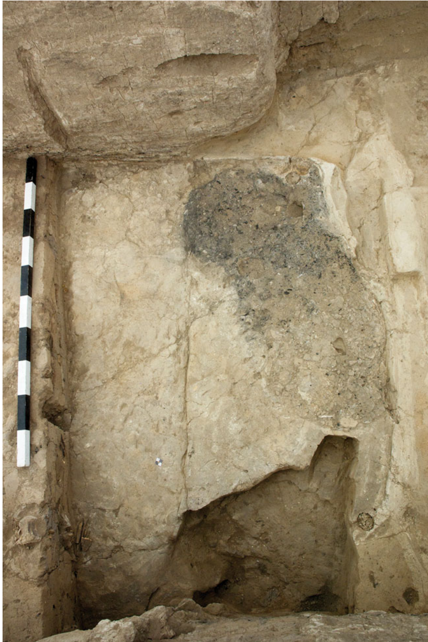
Figure S26.7. North-facing view of context (20961), rich in organic remains within shallow pit F.7129.