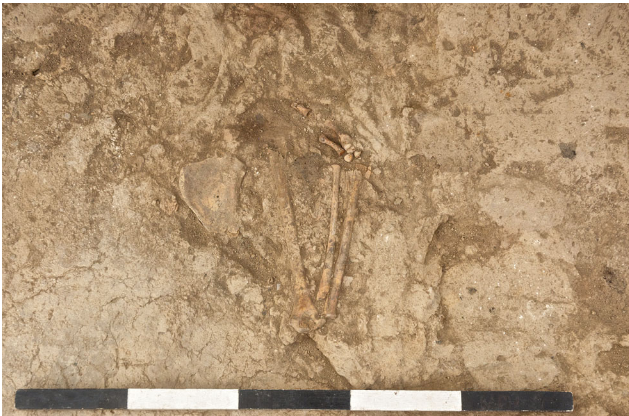
Figure S26.12. Abandonment deposits in B.114. 21113.x24, articulated human arm, including hand and scapula.