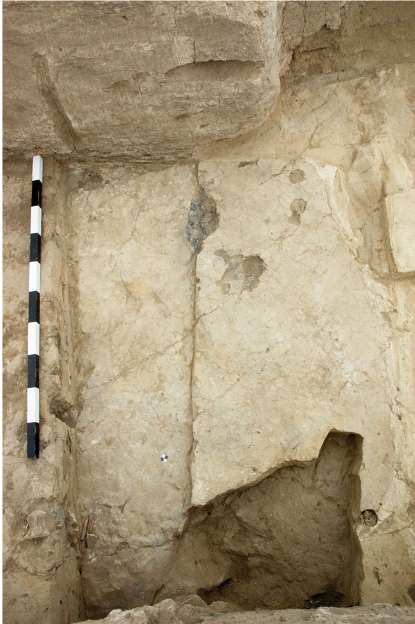
Figure S26.8. North-facing view of floor (20952) sealing shallow pit F.7129.