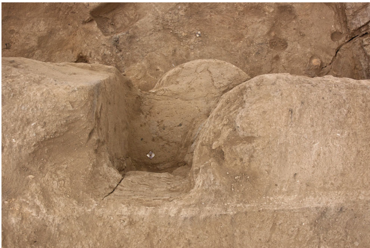
Figure S26.6. Plan view of the cut made for the placement of a ladder upon F.7657. Notice that the step seems to be integrated within the wall, not just abutting it, which made it structurally extremely strong.