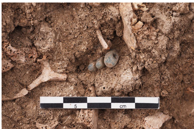
Figure 28.5. Detail shot of beads 20203.x1, associated with skeleton (19484) in burial F.3662.