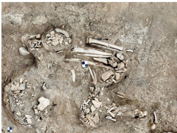
Figure 28.3. Burials F.3663 and F.3664. Burial F.3663, with child (19488) was in better condition than the highly fragmented skeleton (19489) of burial F.3664.