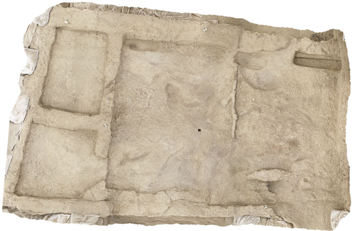
Figure 28.2. Orthophoto of the construction phase of B.128. North to the top.