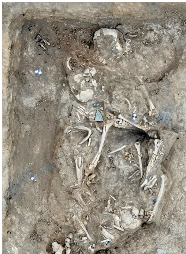
Figure 28.4. Burials F.3665, F.3668 and F.3666. All were interred in the northwestern corner of Space 40. Burial F.3665 was truncated by F.3668, which in turn was truncated by burial F.3666. Bone pins 20400.x1 and x2 can be seen in the northwestern corner.