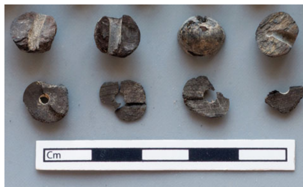
Figure 28.7. Round and flat carbonized wooden beads from burial F.3667, fill (20418).