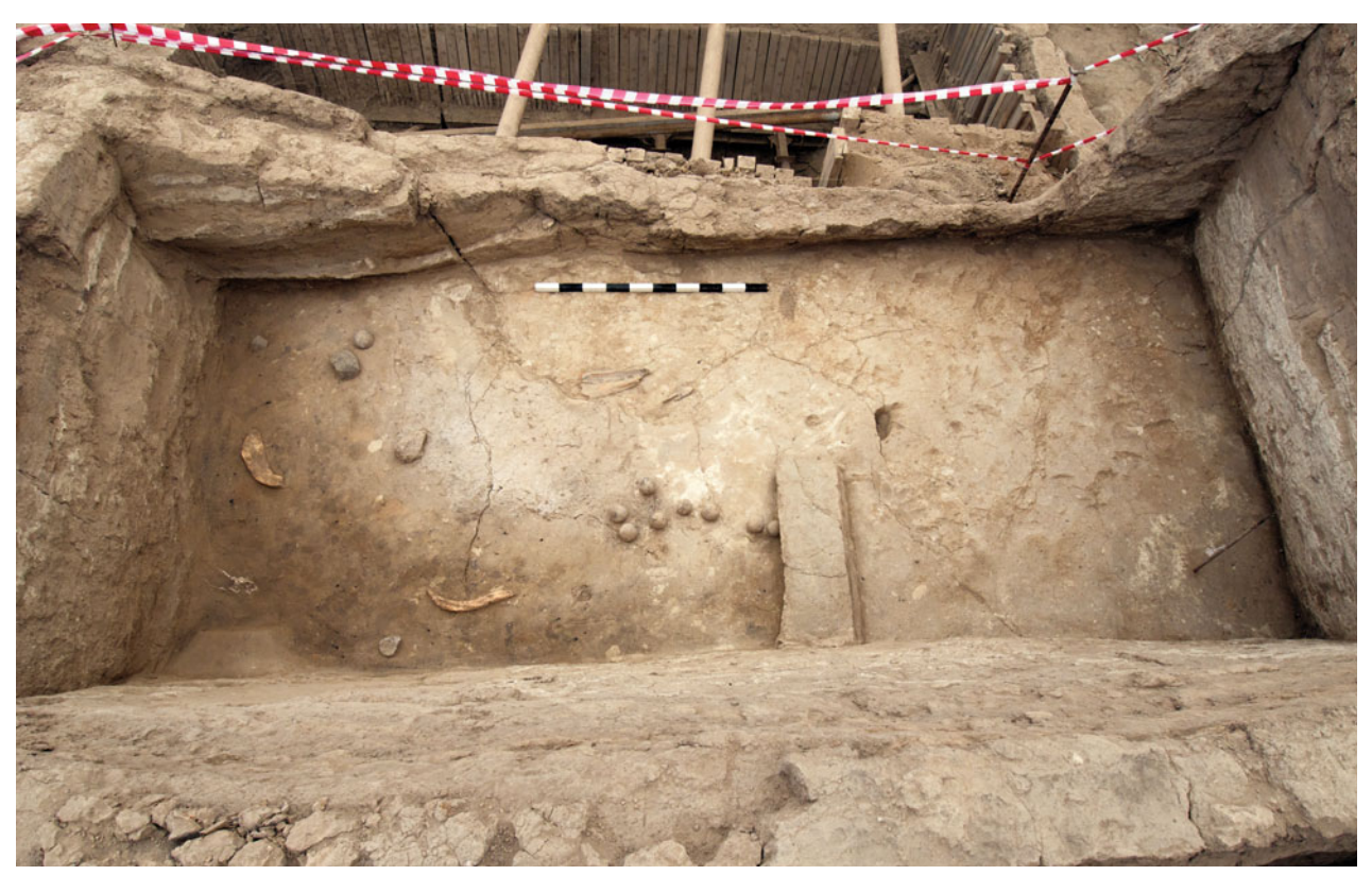
Figure S6.4. North-facing photograph showing cluster of clay balls, ground-stone objects, antler and horn core fragments.