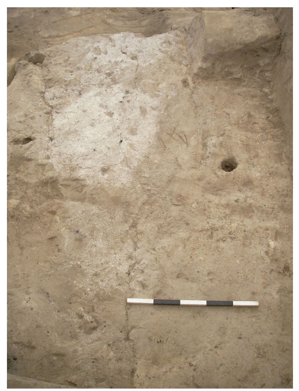
Figure S6.8. East-facing photograph showing phytolith deposit (18610) within dump sequence.