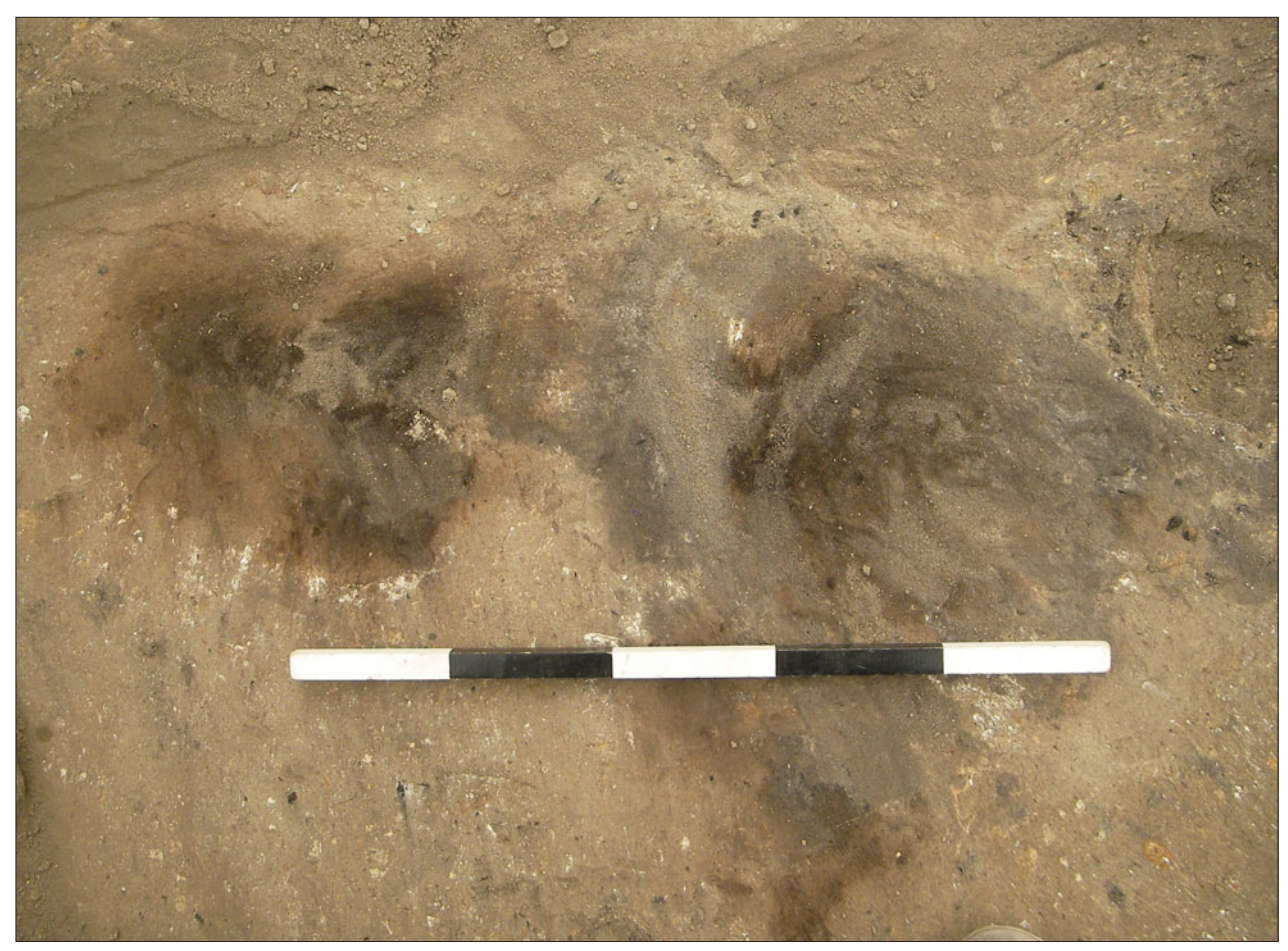
Figure S6.9. West-facing photograph showing fire spot (18608/18614/18181).