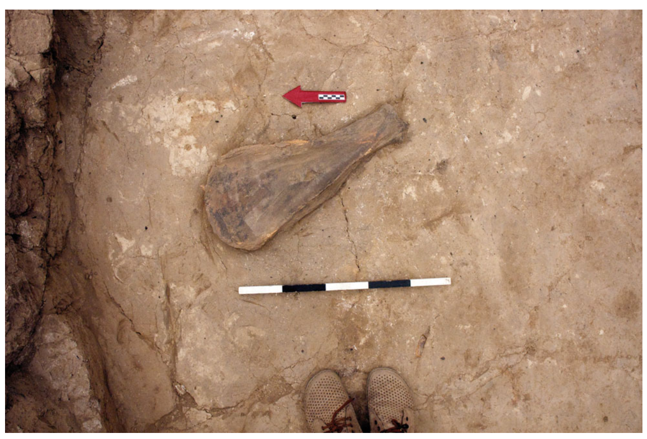
Figure S6.1. East-facing photograph of scapula in fill deposit (19391) of Sp.470 (photograph by Arek Klimowicz).