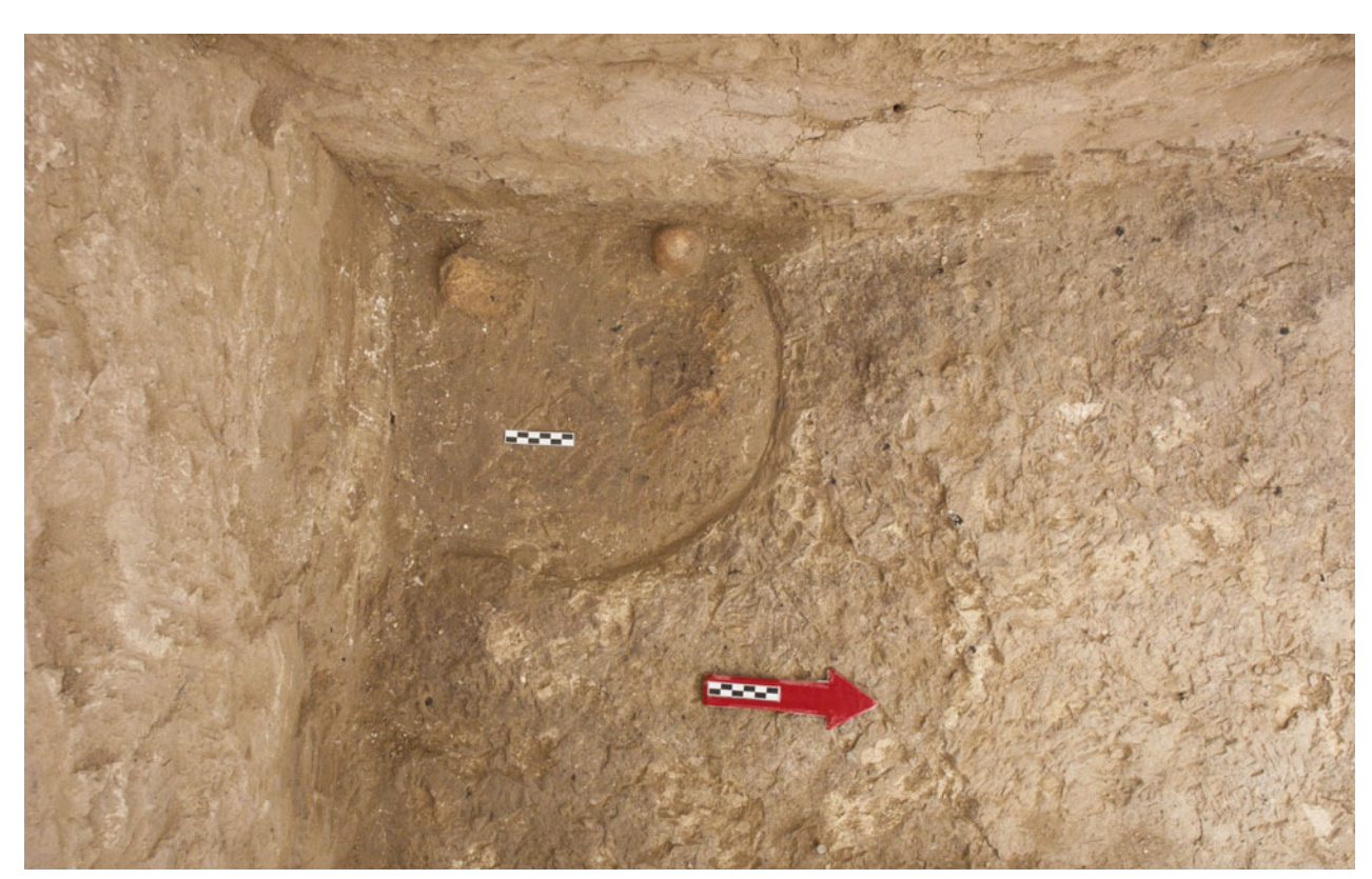
Figure S6.2. West-facing photograph showing detail of pit (20538) situated in the southwestern corner of Sp.470.