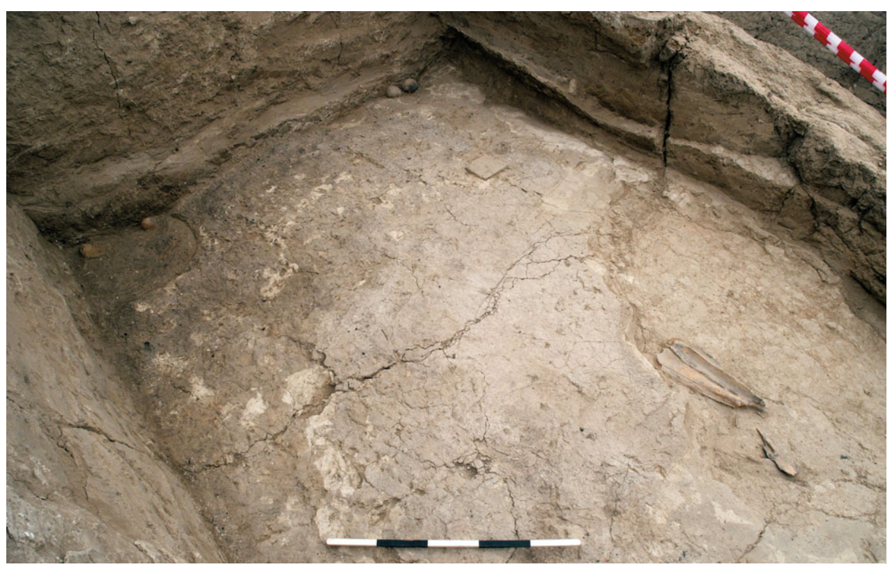
Figure S6.3. Northwest-facing photograph showing a thick spread of phytoliths (19393) sealing the plaster floor surface of Sp.470; note the outline of two pits F.7051 and F.7054.