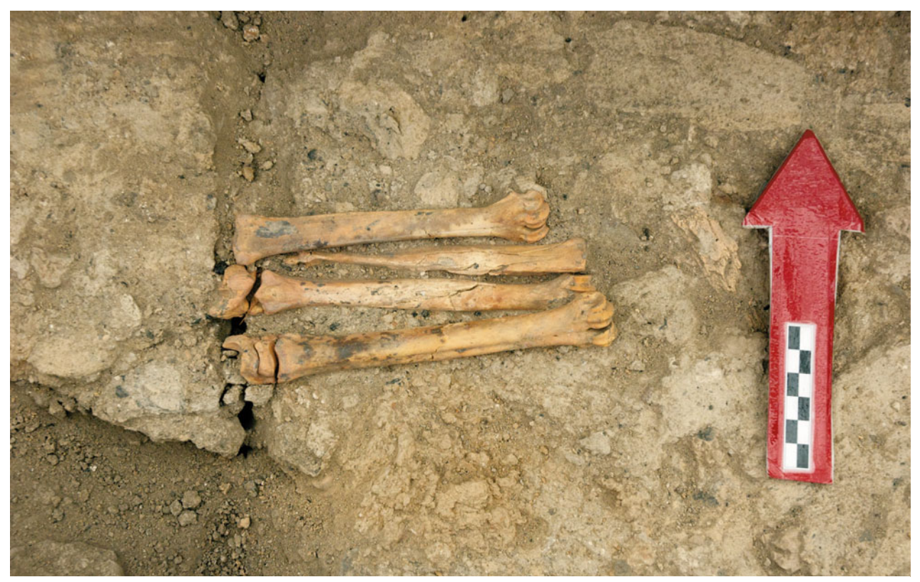
Figure S6.5. North-facing photograph detailing mixed between-wall cluster (19387) and detail of articulated sheep metapodial cluster (19385).