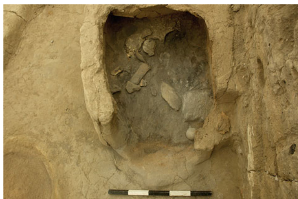
Figure 27.11. East-facing view of cluster (21504) and ashy fill (21370) within oven F.7322.