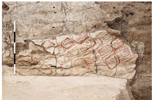
Figure 27.2. Overview of wall painting (21500), (21501).