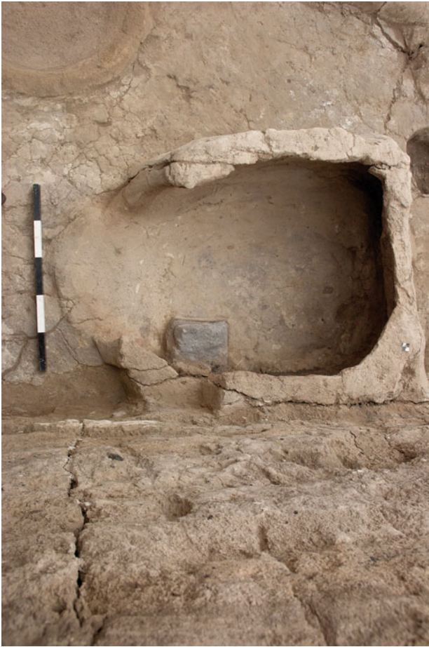
Figure 27.8. North-facing view of oven F.7322, construction (21573). The ground stone by the southwestern corner is actually an abandonment deposit, 21370.x1.