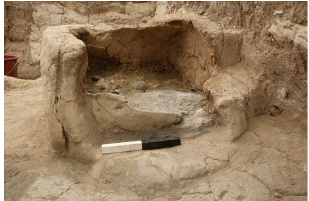
Figure 27.9. East-facing view of oven F.7322 during excavation, showing repair (21562) on the northern wall of the oven as well as the inner coating by its mouth.