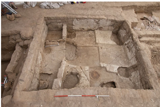
Figure 27.1. North-facing overview of B.119 within the North Shelter.