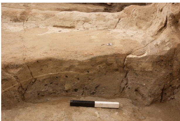
Figure 27.5. South-facing view of section of pit F.7570 showing the accumulation of the central floors. The topmost patchy plaster is (21512) while the thicker orangey-brown make-up is (21539).