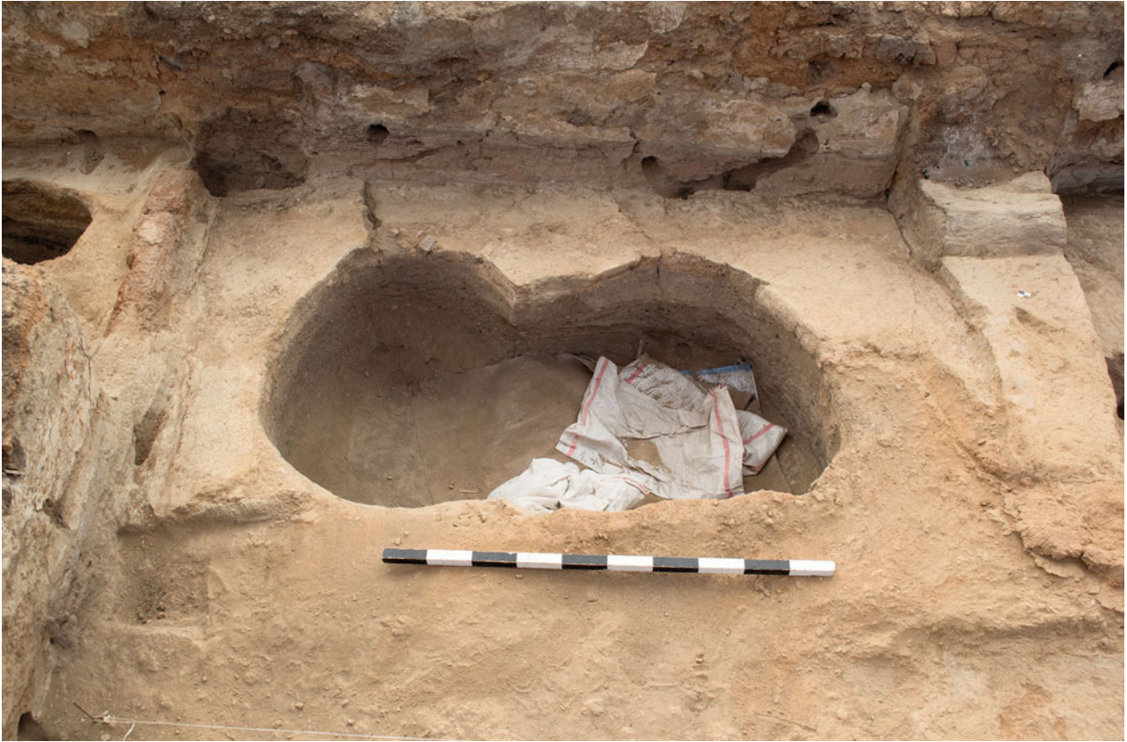
Figure S30.6. East-facing view of engaged post F.7958 and F.7976 within the context of the eastern activity area.