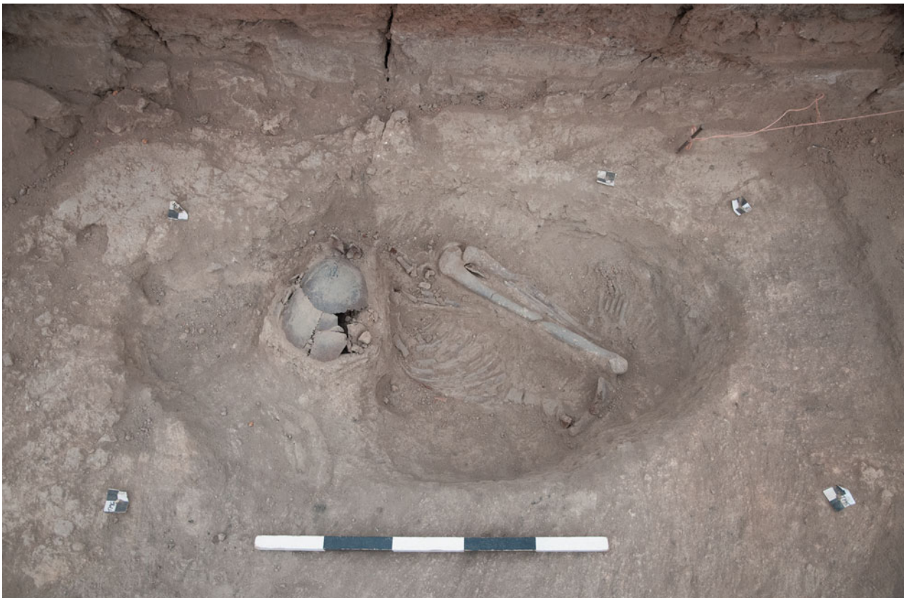
Figure S30.1. North-facing view of burial F.8373, skeleton (23115).