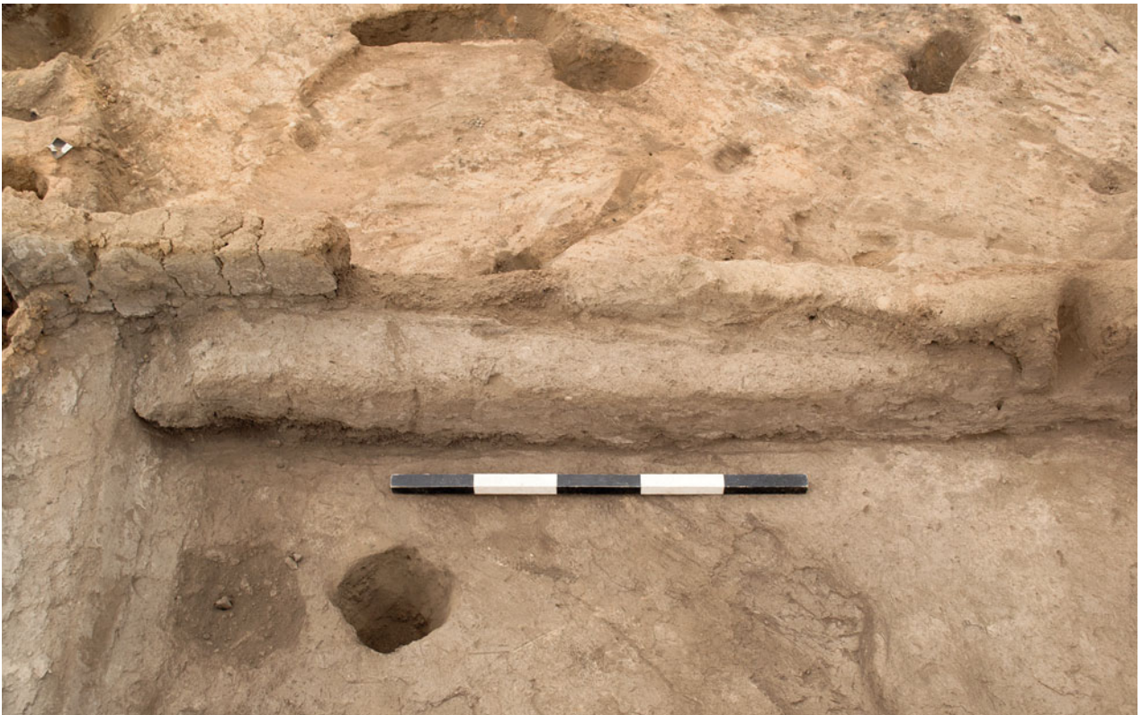
Figure S30.15. South-facing detail of Kerb F.7995. Repair/construction (32542) abuts bench/division construction (32359).