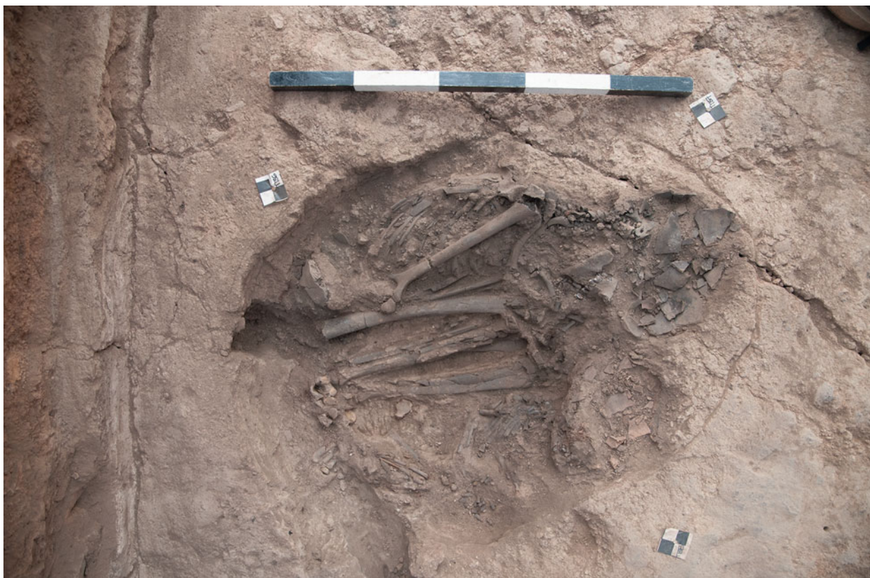
Figure S30.2. East-facing view of burial F.8374, skeleton (23118).