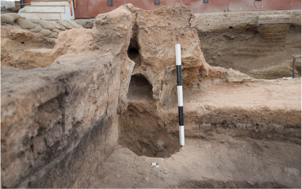
Figure S30.16. North-facing view of niche F.8366 cut into wall F.77077 immediately west of niche F.7986.