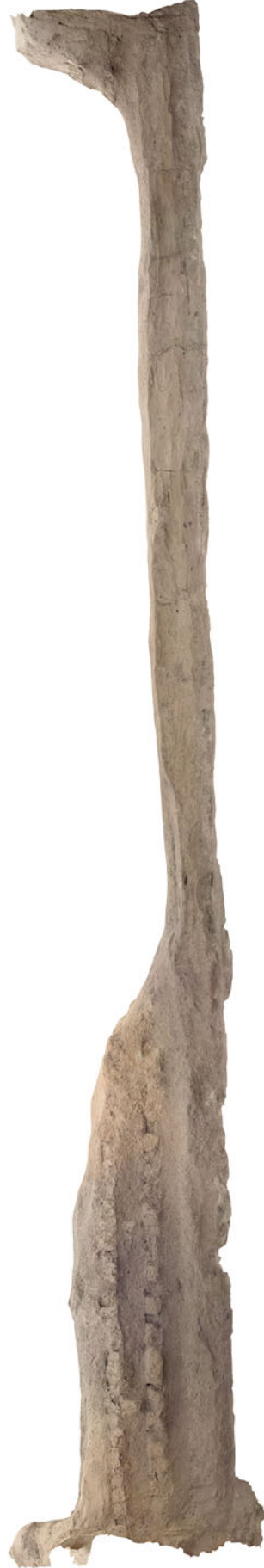
Figure S30.5. West-facing elevation of division wall F.7708 (orthophoto from 3D model created by Jason Quinlan).