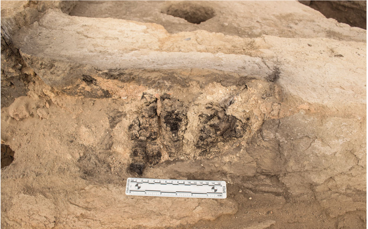
Figure S30.14. Timbers (23095) and (23096) in situ within the bench-like division F.7994. Notice that behind the timbers is construction (32350).