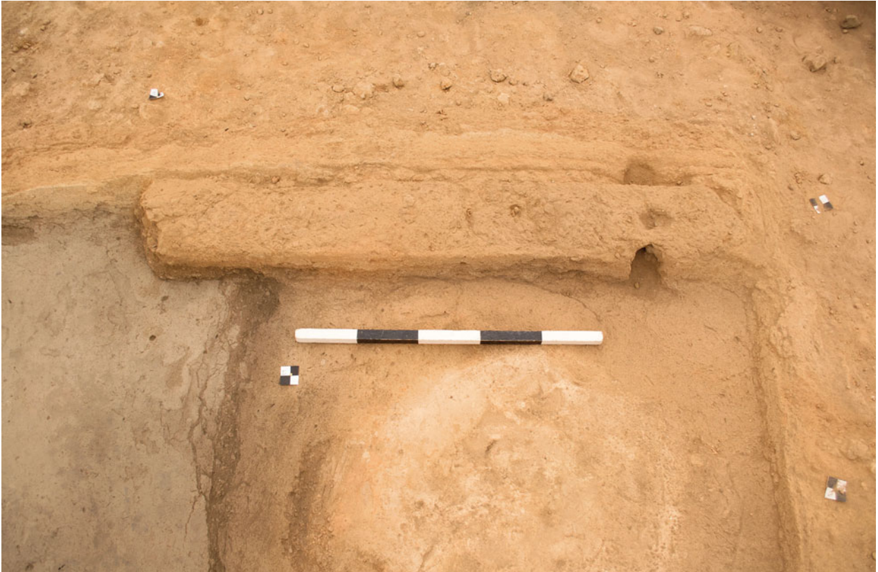
Figure S30.22. Mudbrick (32325) sealing (32337) and defining the western edge of hearth F.7957.