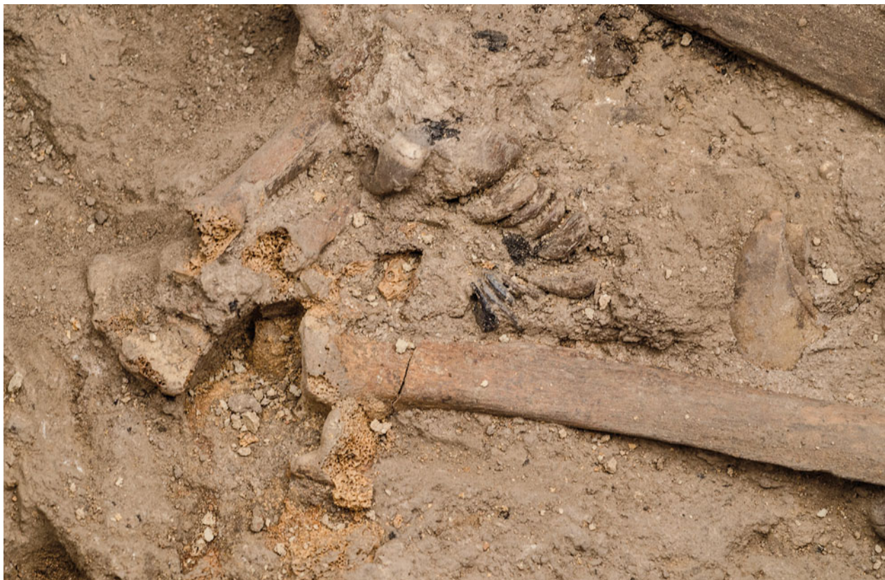
Figure S30.24. Bracelet 30092.x9 around right wrist, in situ.