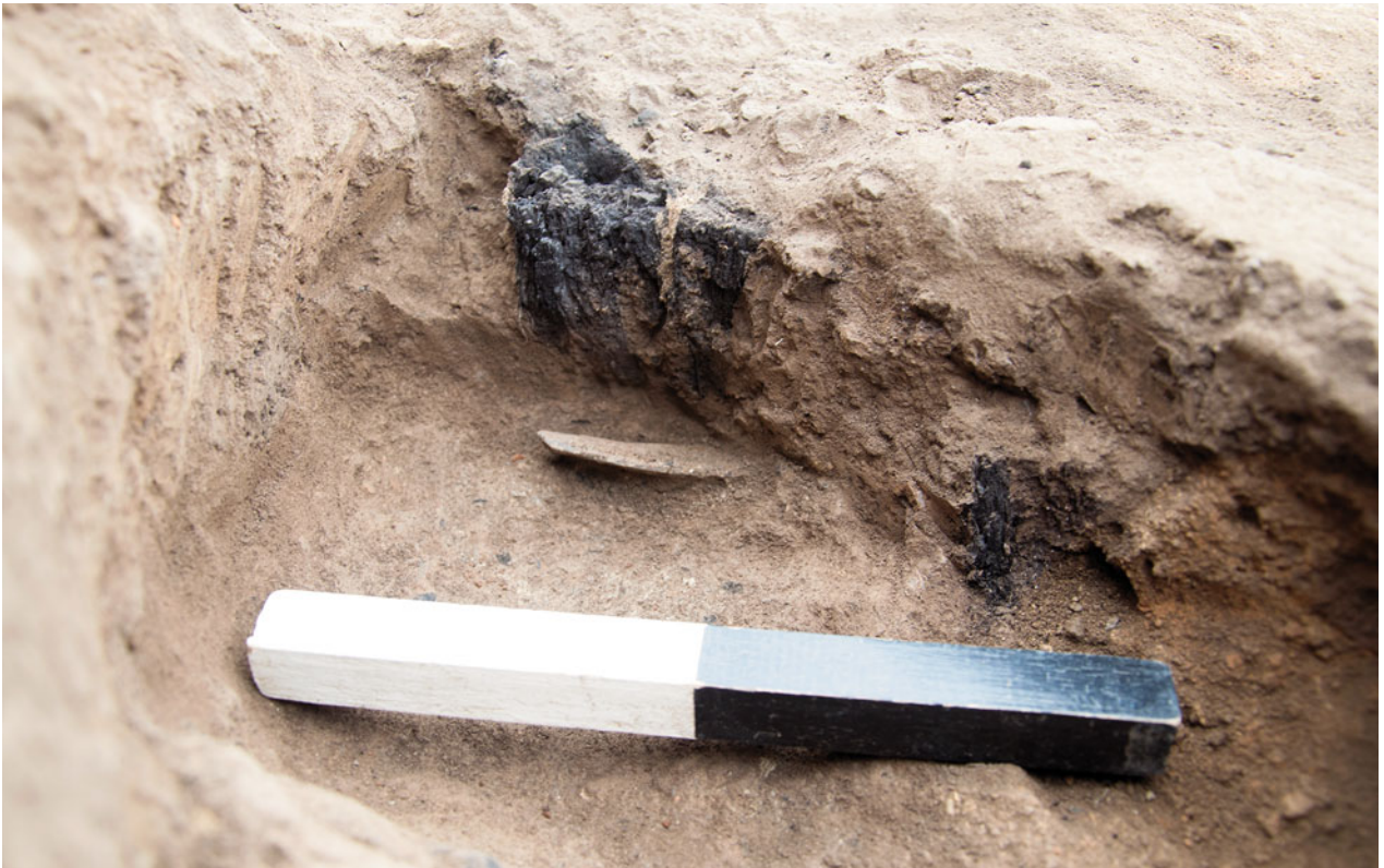
Figure S30.11. Detail of flint pressure blade 23008.x1 found by timber (23036) of post F.8352.