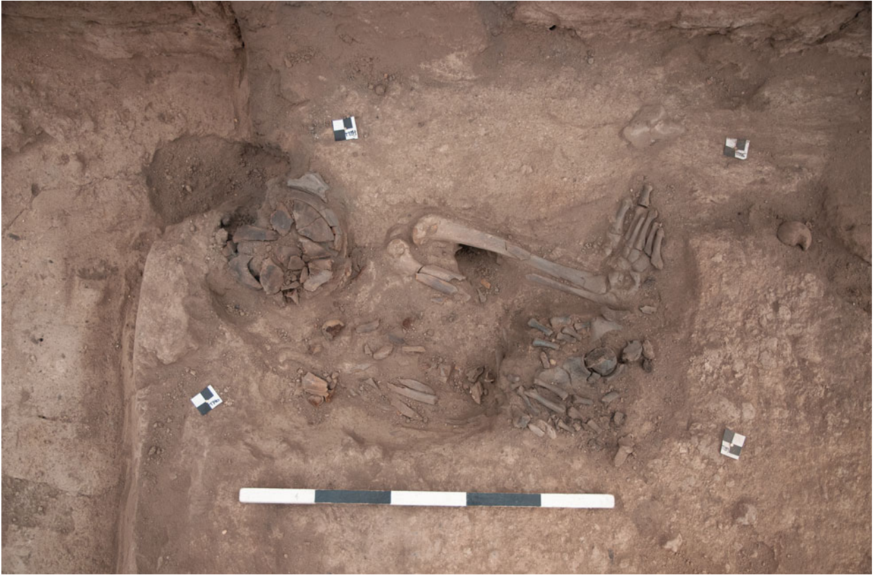
Figure S30.4. South-facing view of burial F.8376, skeleton (23128).