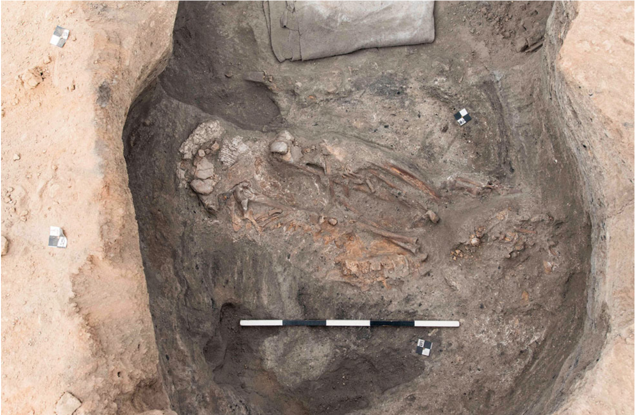
Figure S30.18. North-facing view of skeleton (32330) within burial F.8708. Notice phytolith remnants by head.