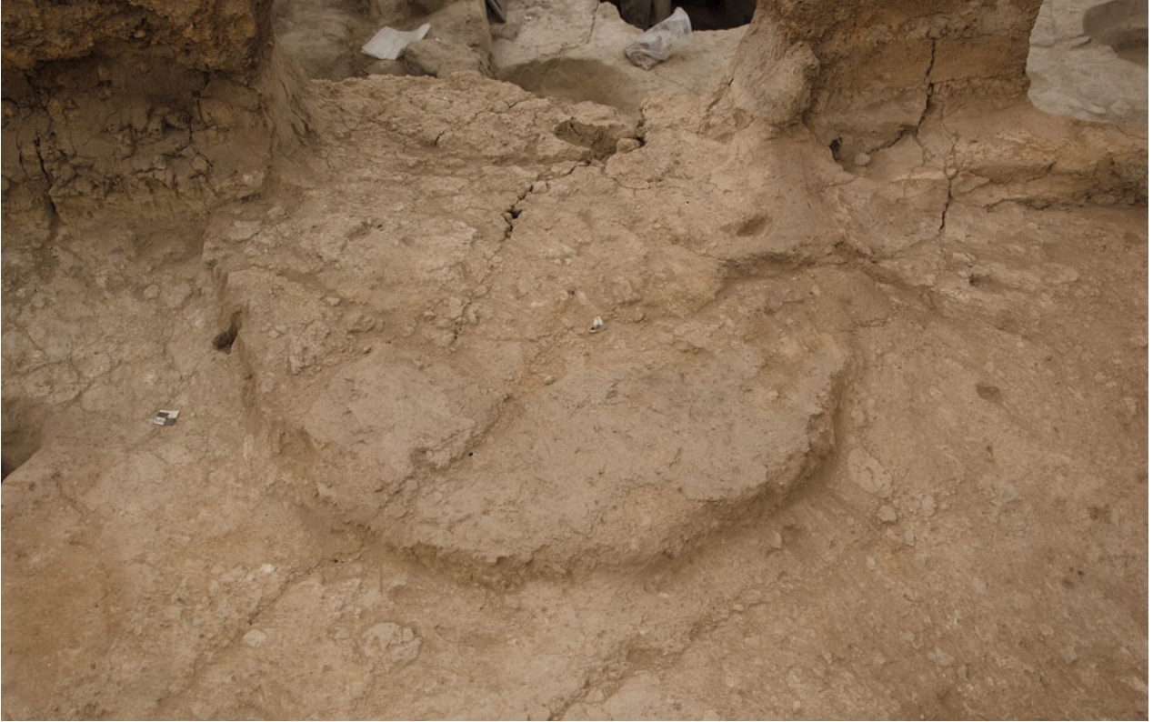
Figure S30.12. Levelling (23111) abutting the southern wall of B.131.