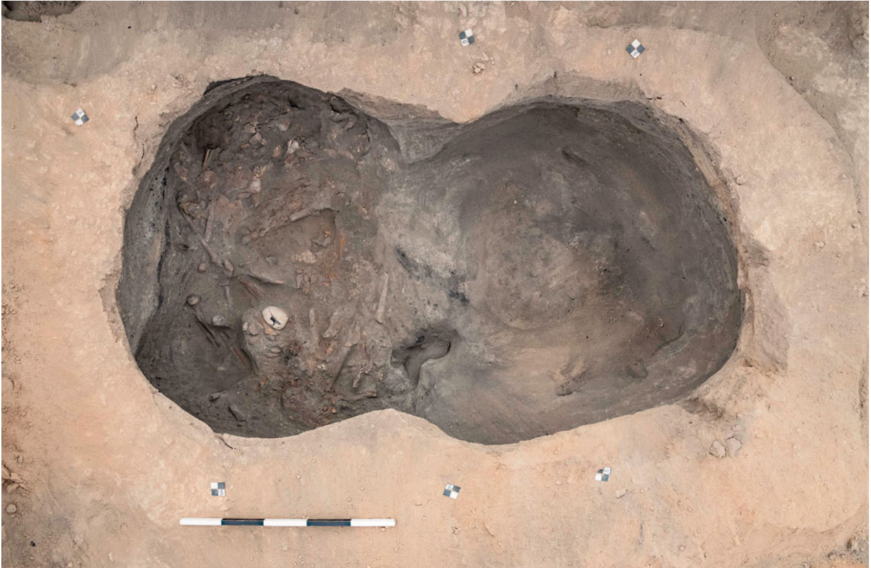
Figure S30.26. Primary skeleton (23126) in burial F.7961.