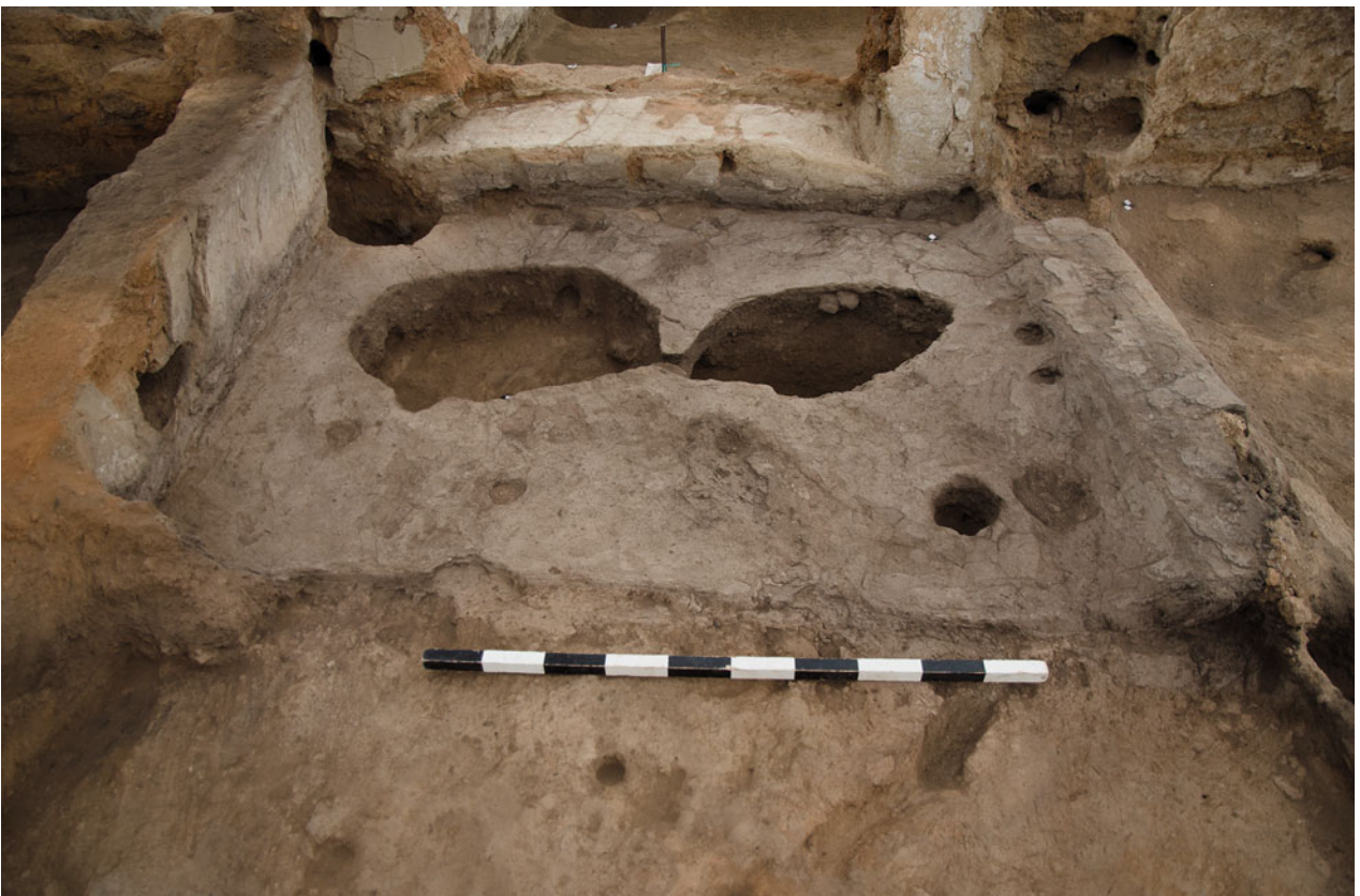
Figure S30.13. The northwestern activity area during B.131 Phase 2. Floors (23051) cover platform F.7959 and lip up upon bench division F.7994. Note that kerb F.7995 was excavated out of sequence in 2016 because it was collapsing due to prolonged exposure.