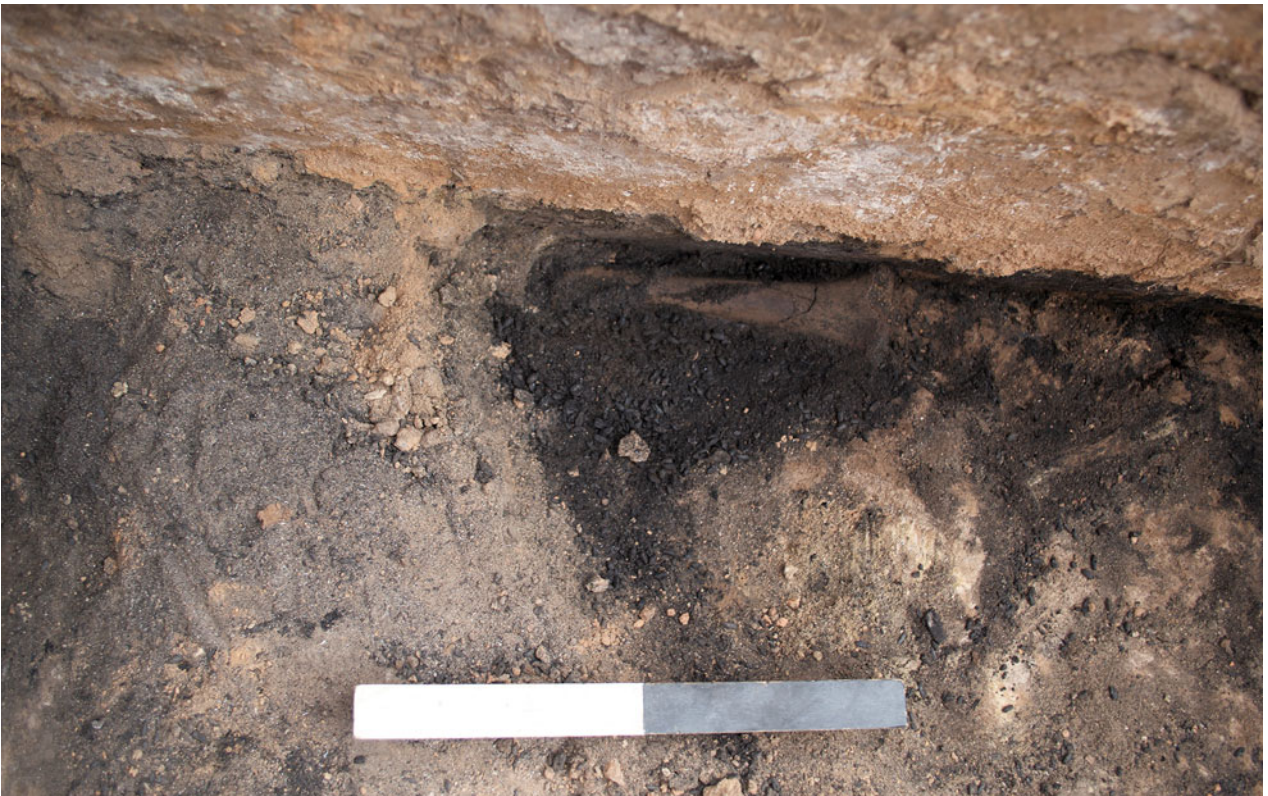
Figure S30.29. North-facing view of human tibia buried under a deposit of new type wheat (22656) within Sp. 556.