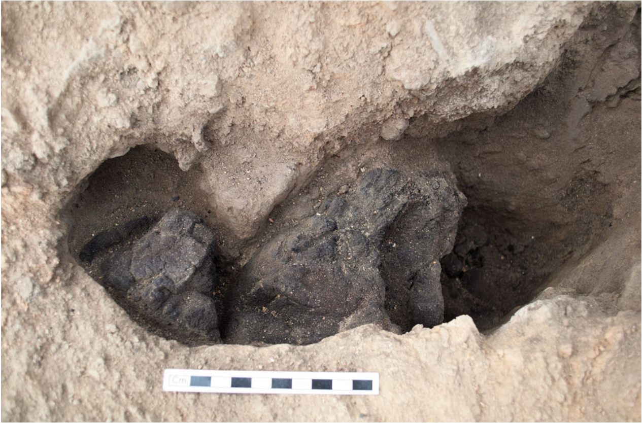
Figure S30.8. Timber (22698) within engaged post F.7972.