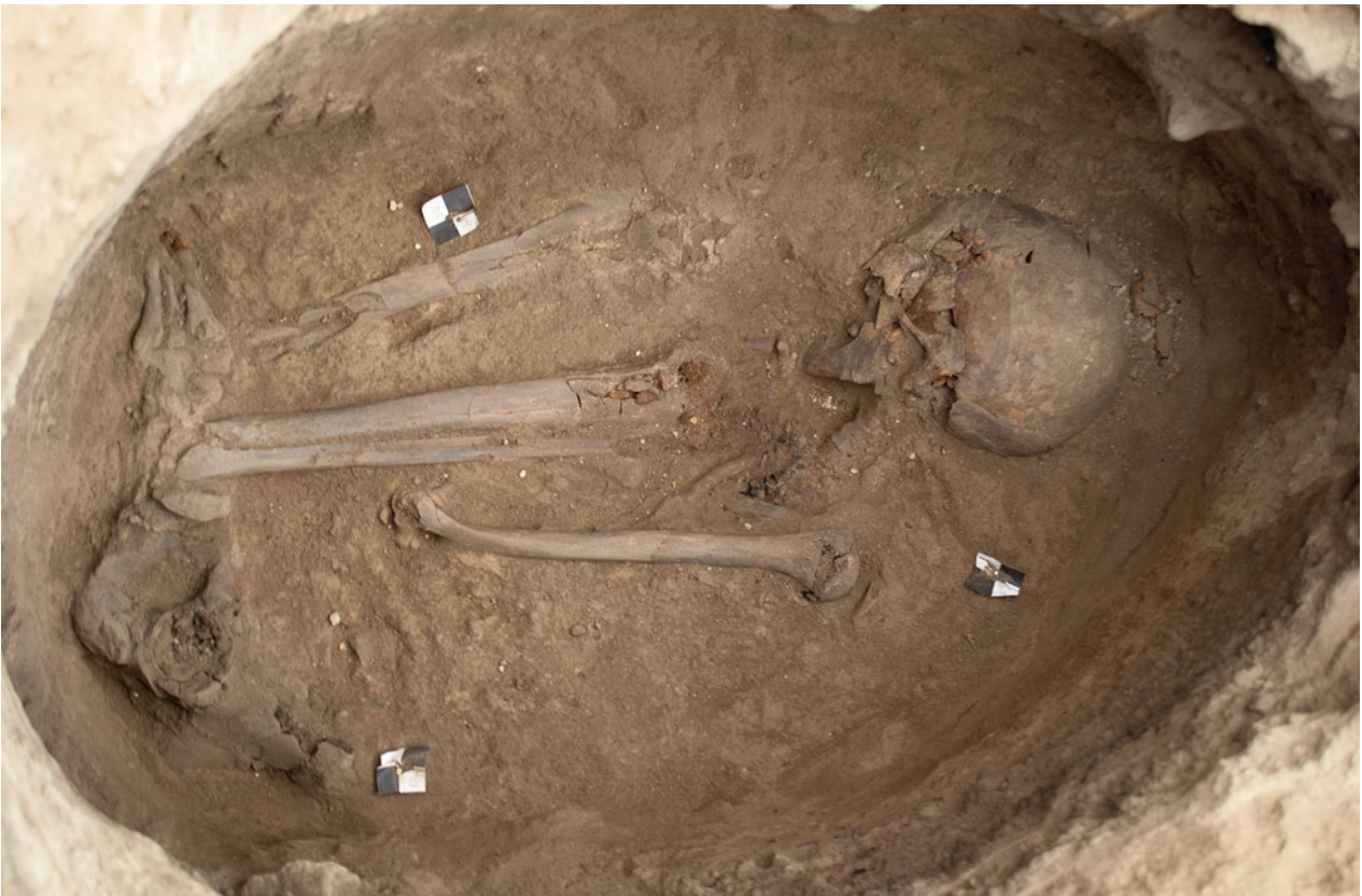
Figure S30.23. North-facing view of burial F.7982, skeleton (30089).