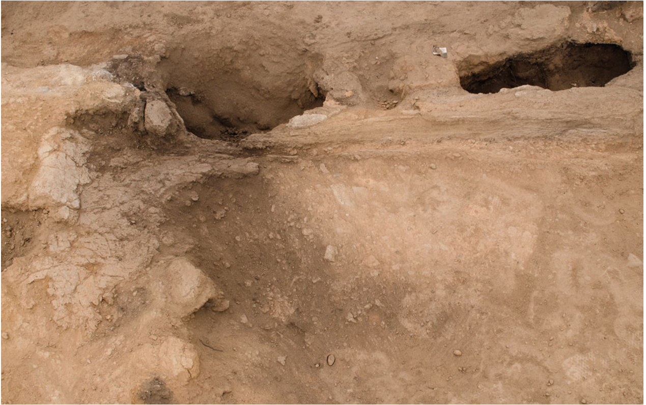
Figure S30.10. West-facing detail of the central section of F.7990, at the junction of the southern and northern activity areas. Notice the truncated layers of plaster that would have been perpendicular to the floor.