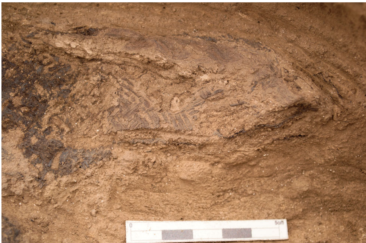
Figure S30.25. Remnants of basket (32373) in the southwestern activity area of B.131.