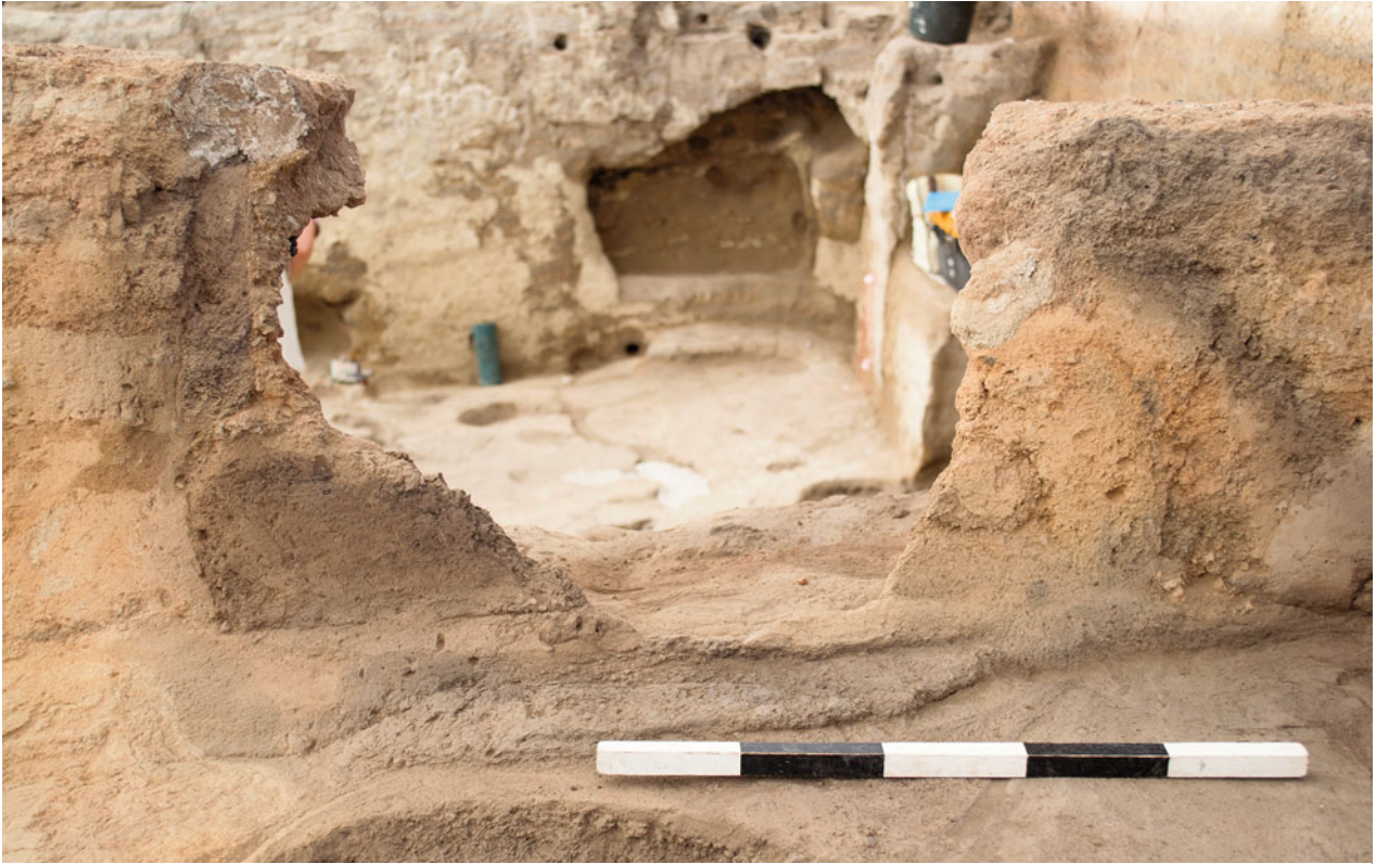
Figure S30.28. South-facing view of blocking (32399) sealing niche F.7968. Notice that the rubble filling the niche was excavated out of sequence.