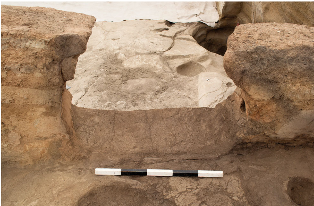
Figure S30.20. South-facing view of cut for oven F.4103 in the southeastern activity area.