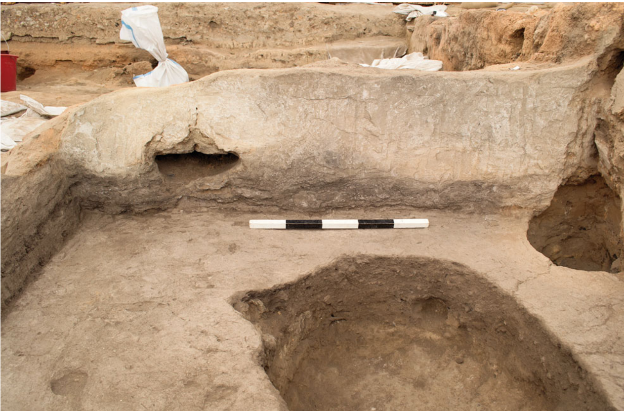
Figure S30.19. West-facing view of niche F.7991, on partition wall F.7708.