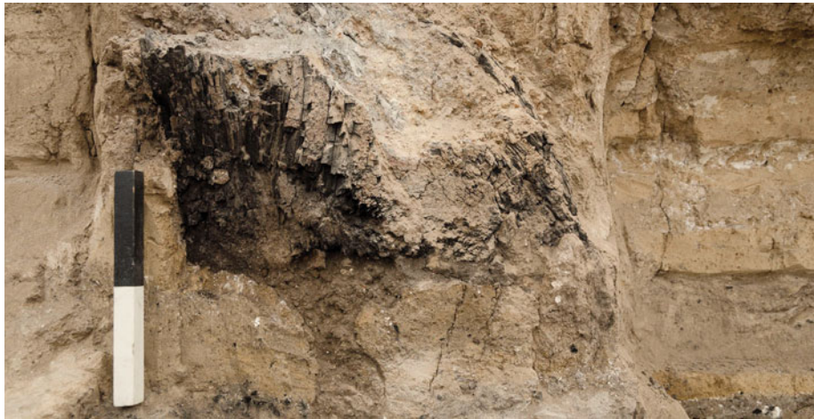
Figure S30.7. East-facing view of timber (23018) within engaged post F.7976.