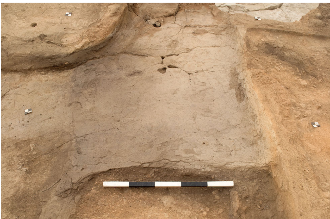
Figure S30.21. South-facing view of plaster lining (32337) defining the extent of what would become a formal hearth platform F.7981 in B131.4.