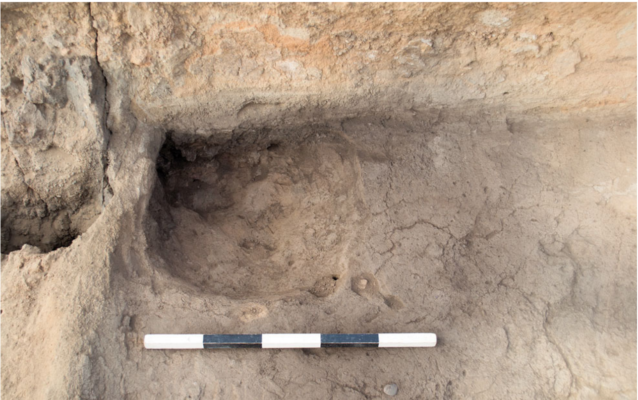
Figure S30.17. The cut (32523) for post-retrieval pit F.4104. Notice the depression made by the post at the corner of the pit.