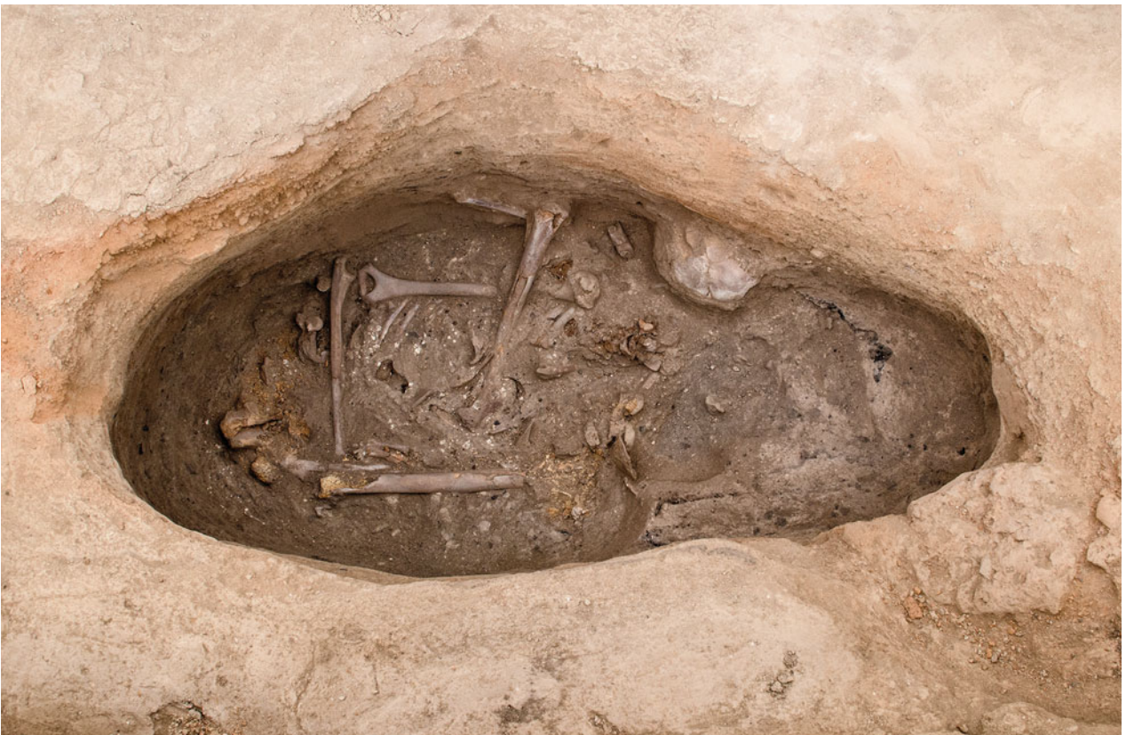
Figure S30.27. West-facing view of burial F.7962, skeleton (31705) and other secondary skeletal elements.