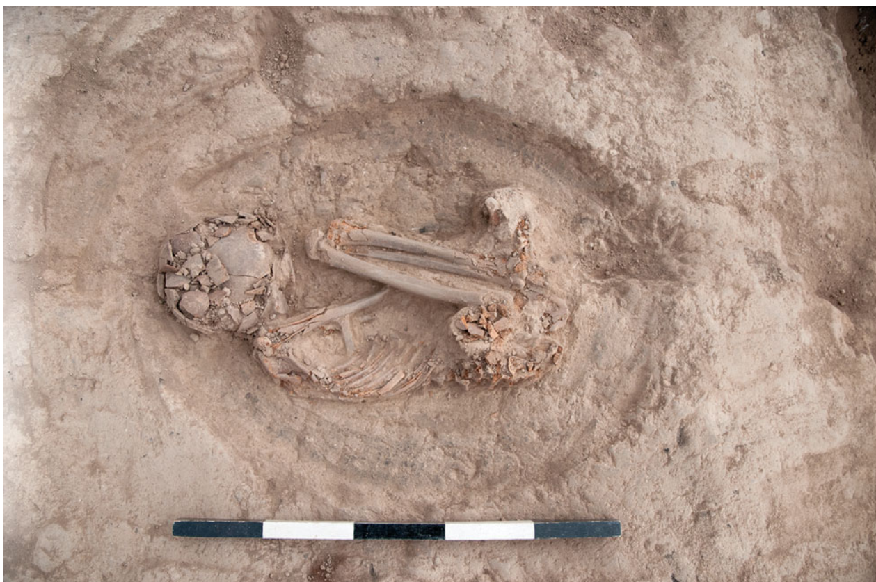
Figure S30.3. North-facing view of burial F.8375, skeleton (23121).