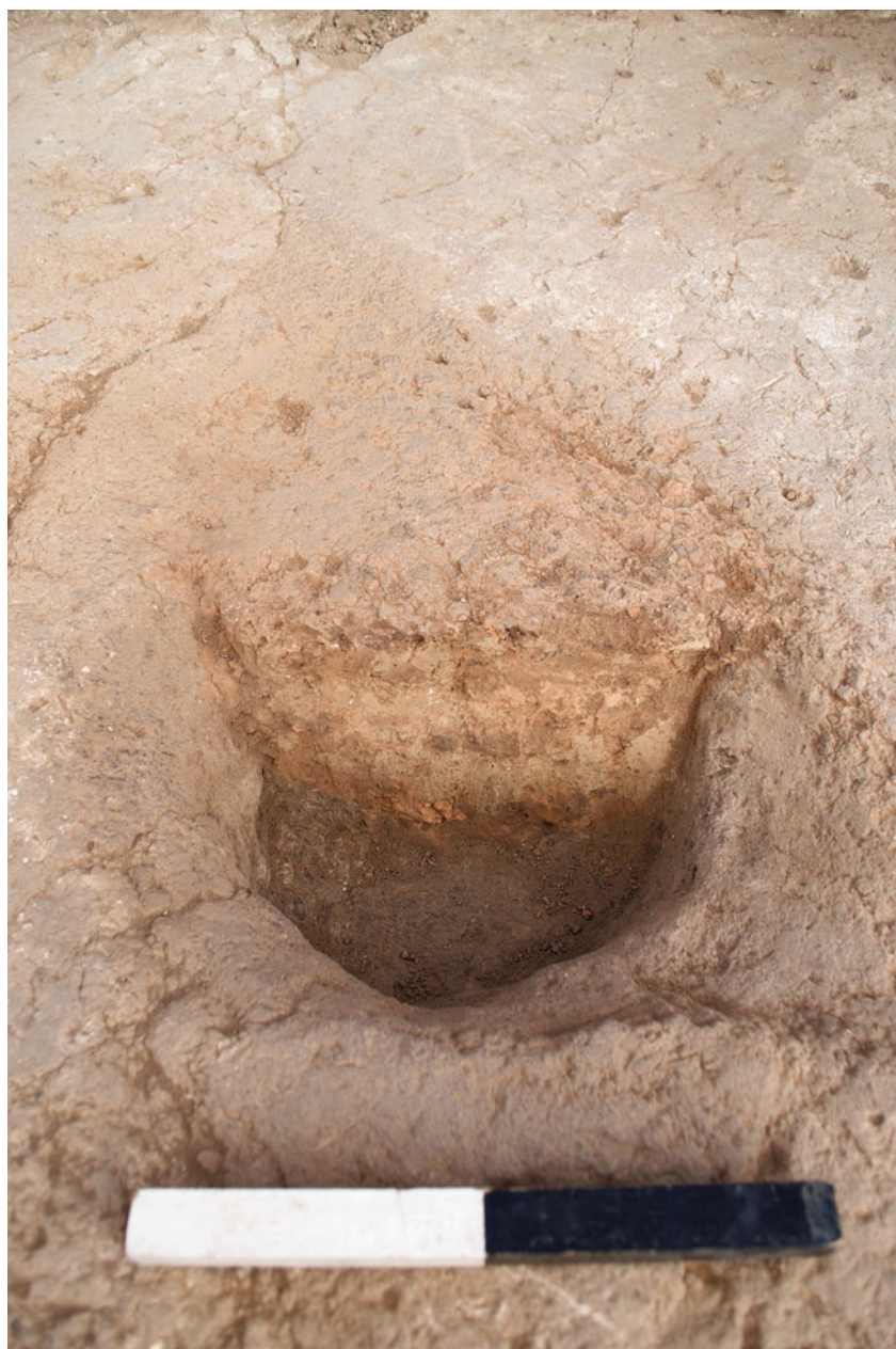
Figure S21.10. Pit F.7778 within platform F.7637, which could have been a cache that was emptied and filled, like a later pit in the same area, F.7555 in Phase B52.5.