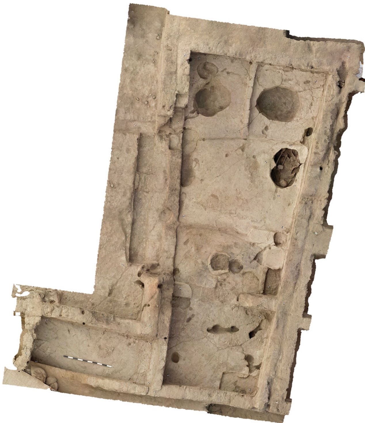
Figure S21.2. Orthophoto of B.167.