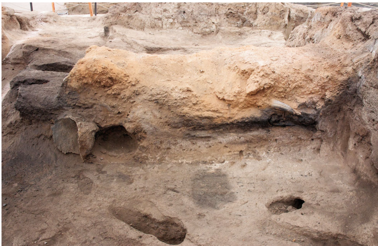
Figure S21.22. Core of bench F.2021, sealing F.7118, facing south. One of the horns from F.7118 can be seen through core (17997).