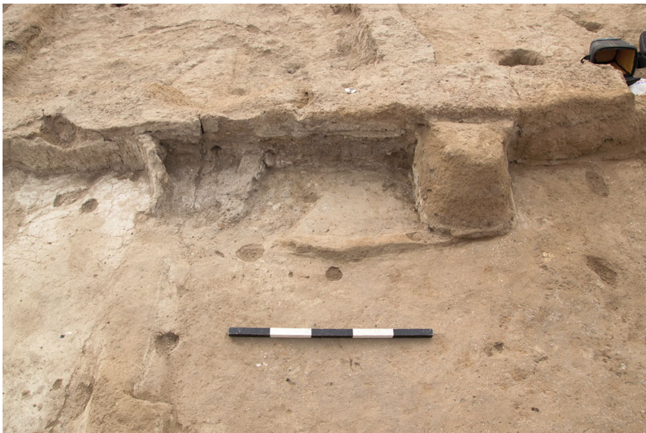
Figure S21.8. Features abutting the eastern face of wall F.2106. Facing west.