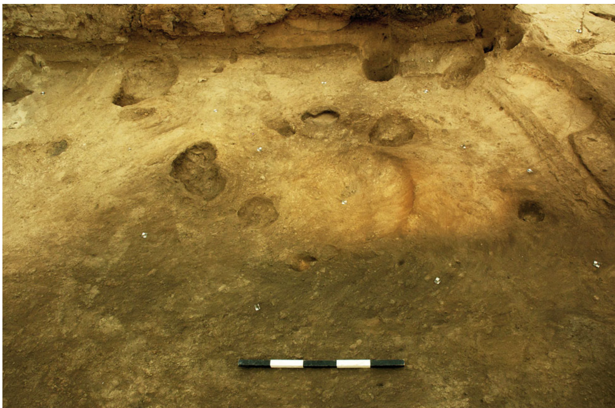
Figure S21.18. Overview of the southern activity area within Sp.94, specifically the constellation of scoops and the imprint of hearth F.1482. Facing south.