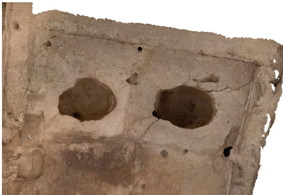
Figure S21.6. North-facing orthophoto of northern activity area with platforms F.7617 and F.7605.