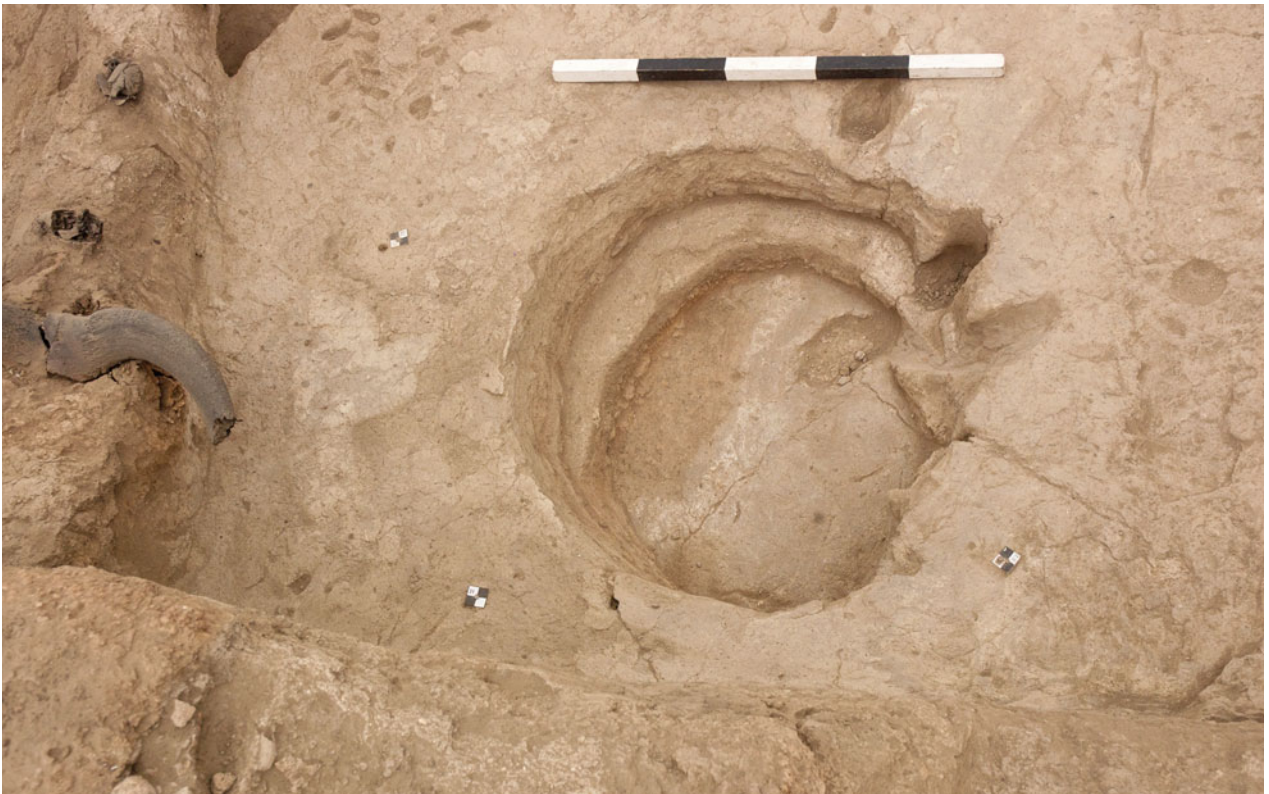
Figure S21.21. Pit F.7555 facing east, with its two distinct cuts within platform F.2177, west of horned bench F.7118.