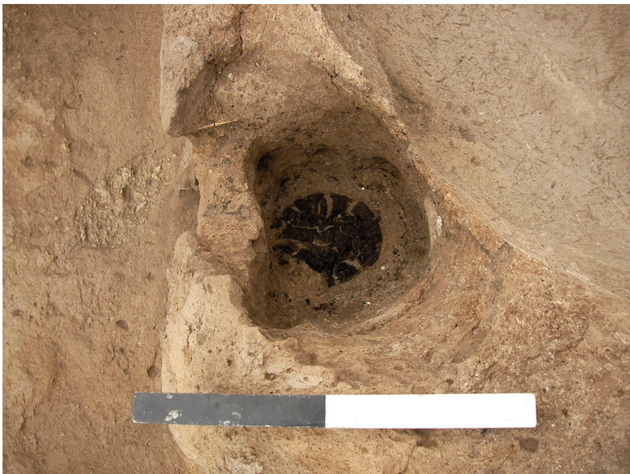
Figure S21.9. Post (16578) within the wall of bin F.2003, (11922).