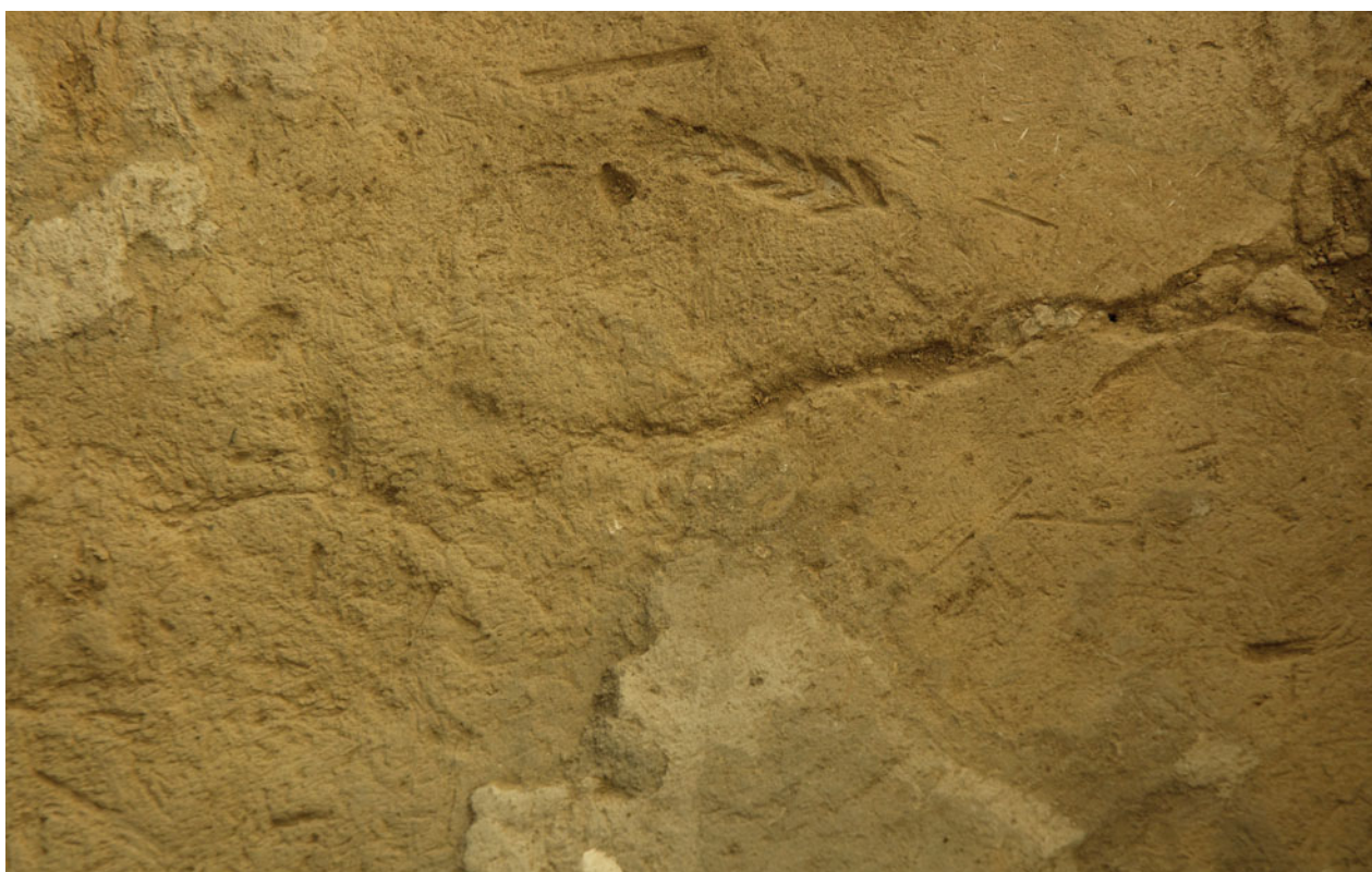
Figure S21.19. Plant imprints within floors (30519) in Building 52.