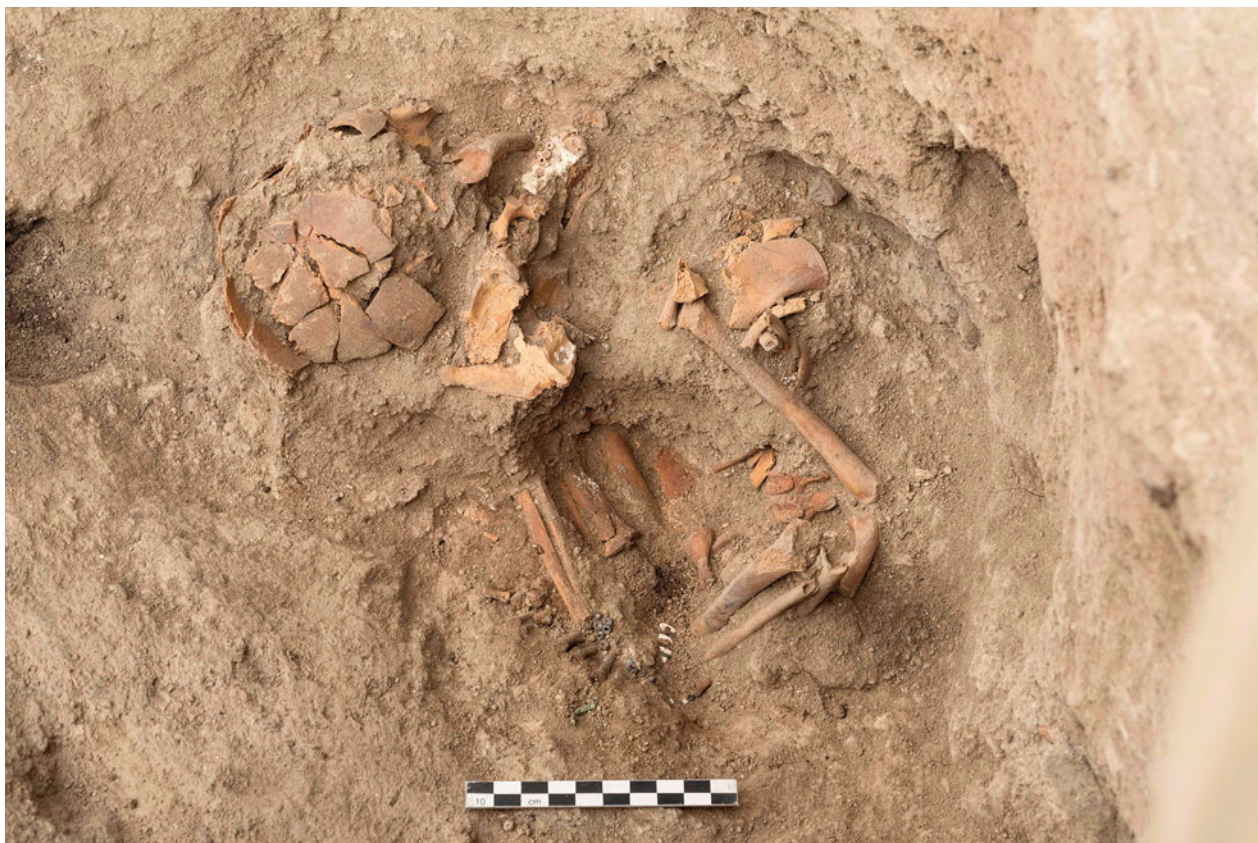
Figure S21.4. Burial F.8516, Sk. (23805) within platform F.8524, facing south.