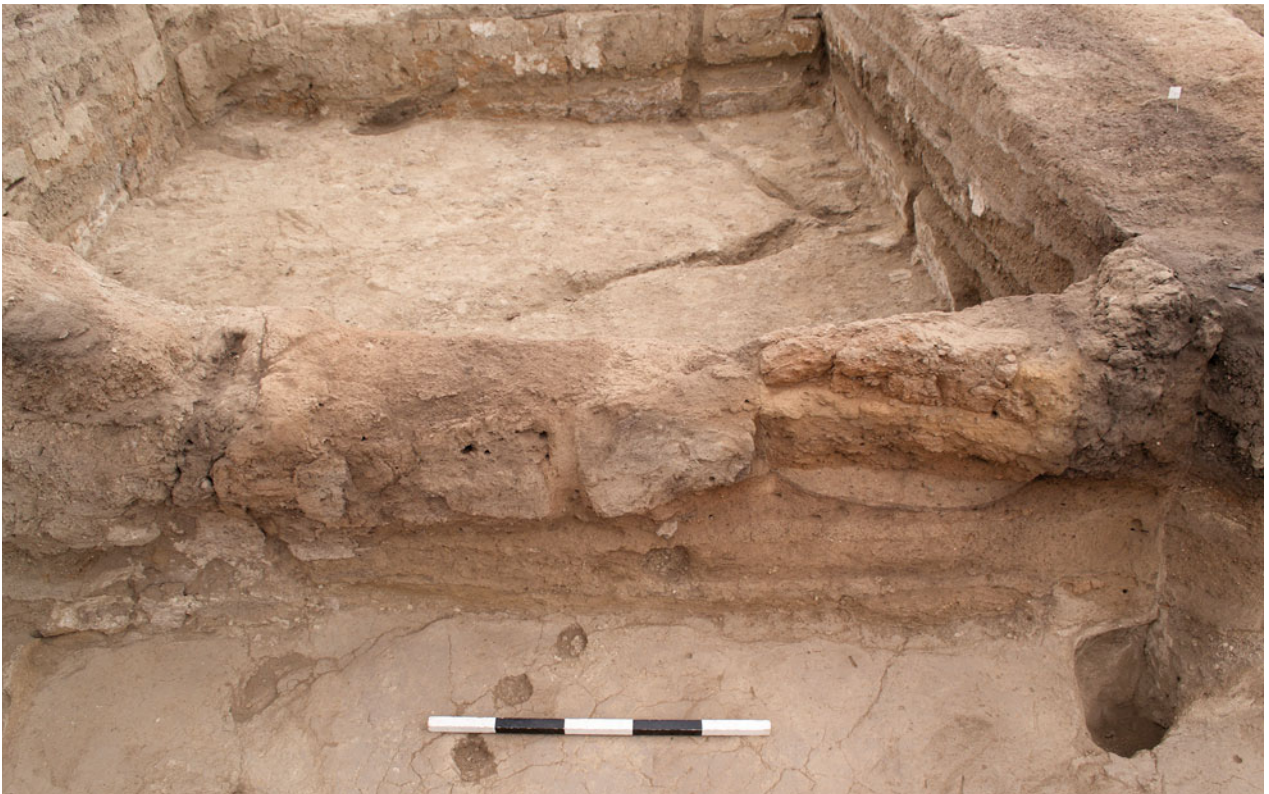
Figure S21.15. Blocking of access hole F.7761 within wall F.7774. This blocking, F.1626, lies behind a truncated oven, F.1485.