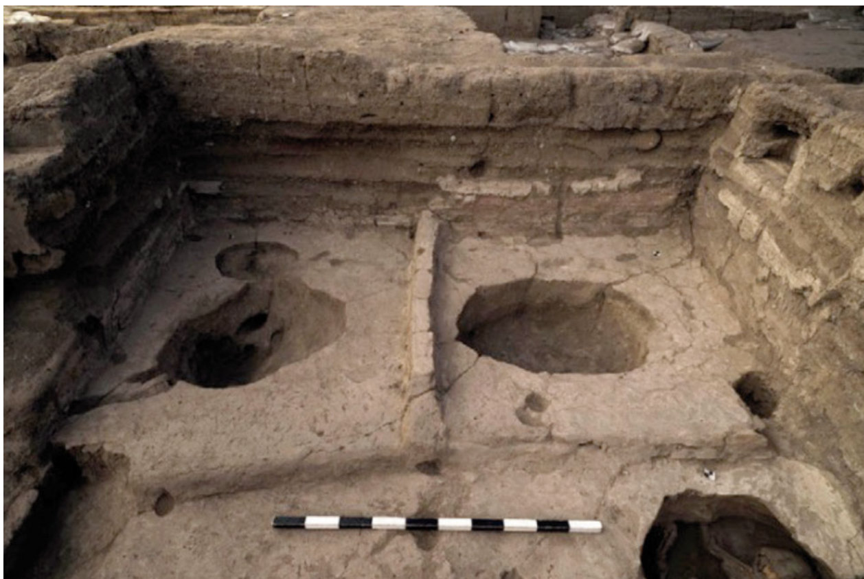
Figure S21.3. Northern platforms F.8524 and F.8525, differentiated from each other with a kerb, in B.167. Facing north.