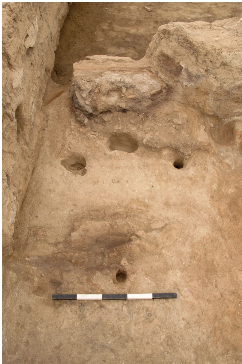
Figure S21.13. Severely truncated oven F.2195. Facing south.