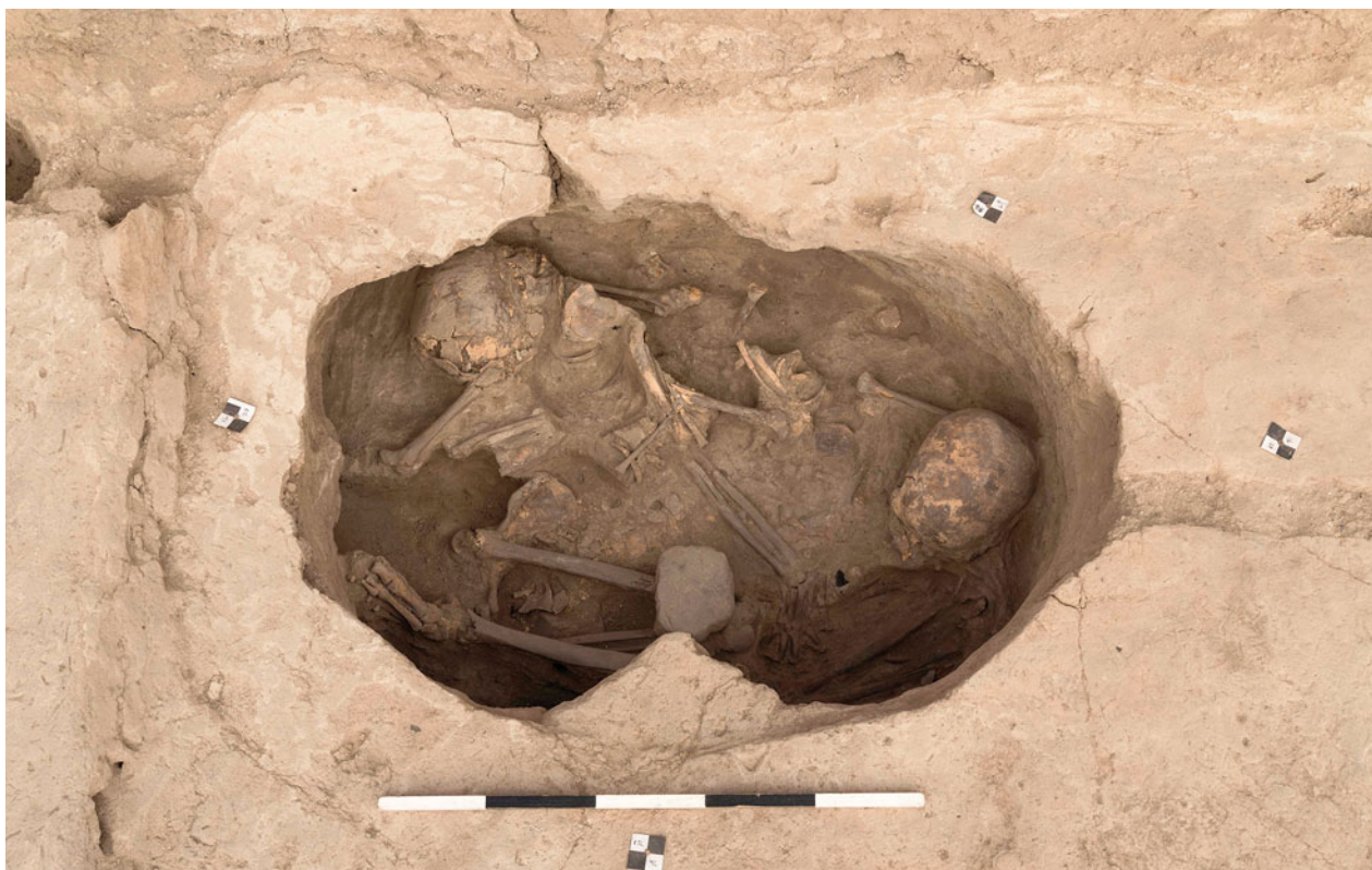
Figure S21.5. Burial F.8521, which contained primary burial of an adult female, skeleton (23827) and the primary disturbed skeleton of juvenile (23837). Facing west.