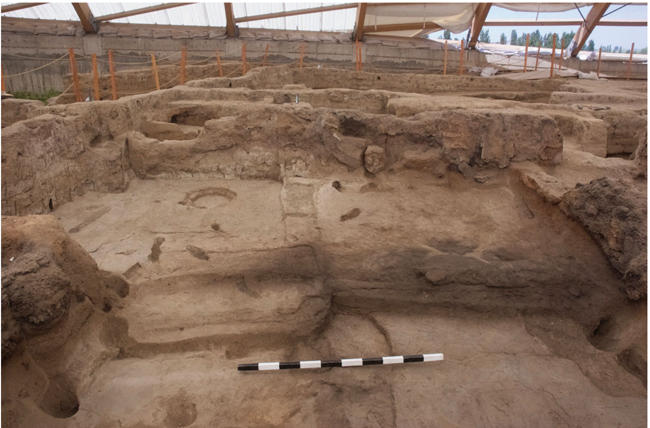
Figure S21.12. Overview of the western activity area at the end of B.52 Phase 3. Step F.7642 is substantially reduced in size, and the plaster renderings have added considerable height to the area. Above platform F.7637 is plaster floor (21392) and above platform F.7637 is plaster floor (21397)