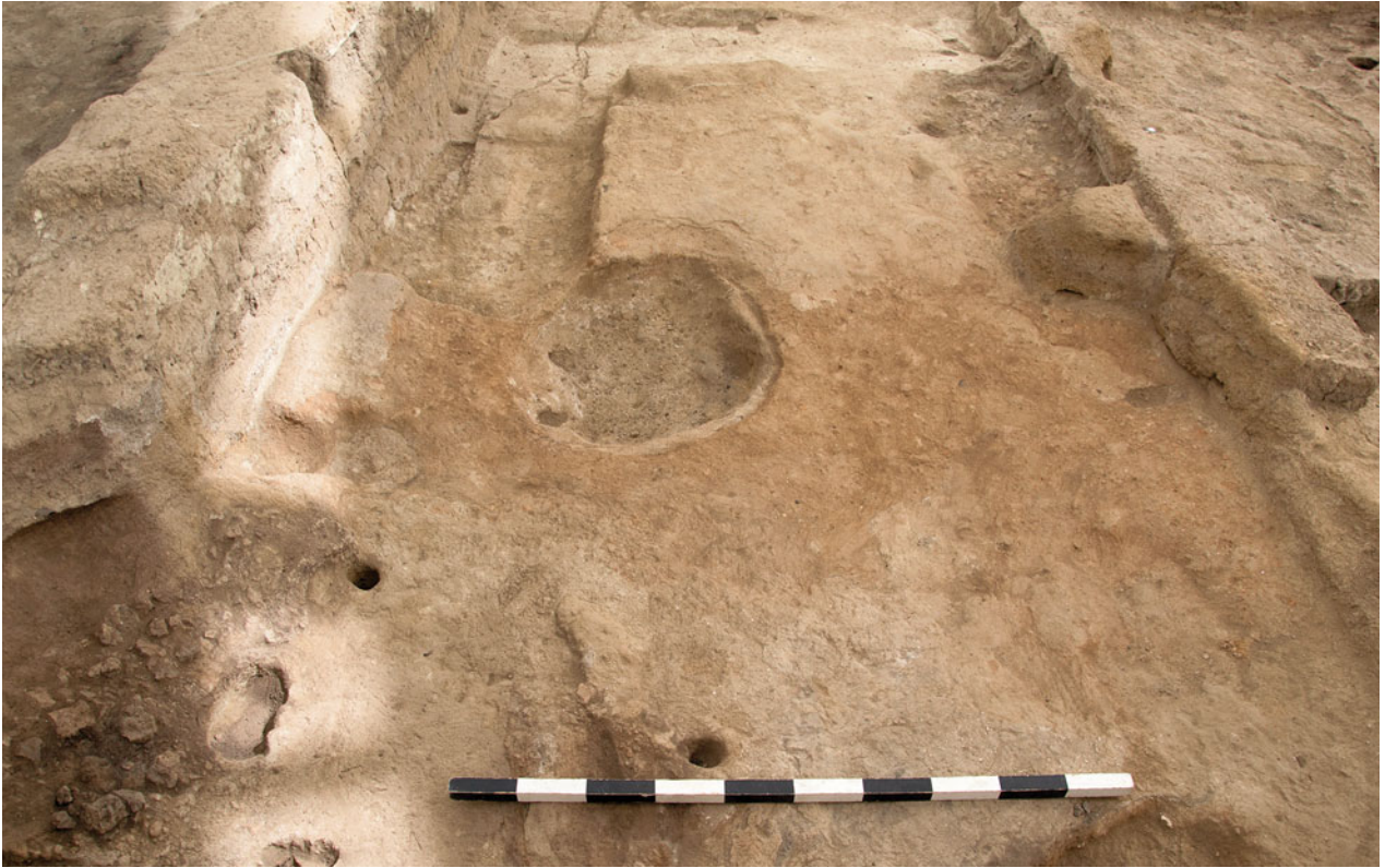
Figure S21.14. Overview of Sp.576 during B.52 Phase 3. The following renovation phase severely truncated the features in this room for this phase. Facing south.