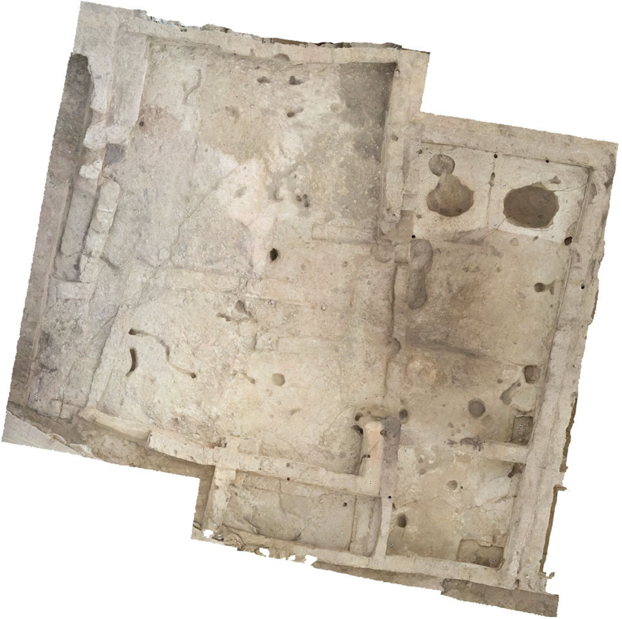
Figure S21.1. Orthophoto of B.163 (Jason Quinlan).