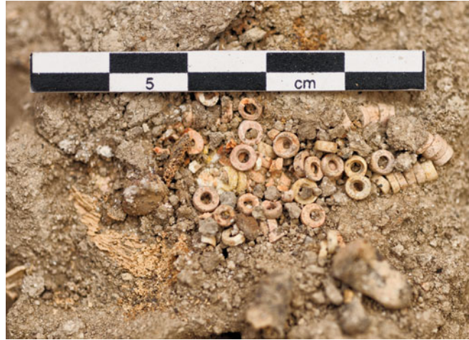
Figure S21.16. Detail of beads 30518.x1 and x2 found associated with skeleton (30532).