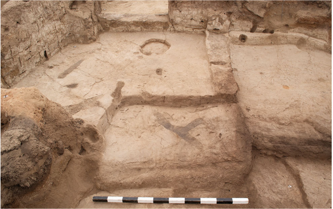
Figure S21.11. Floors (22236) of platform F.7637. Facing west.