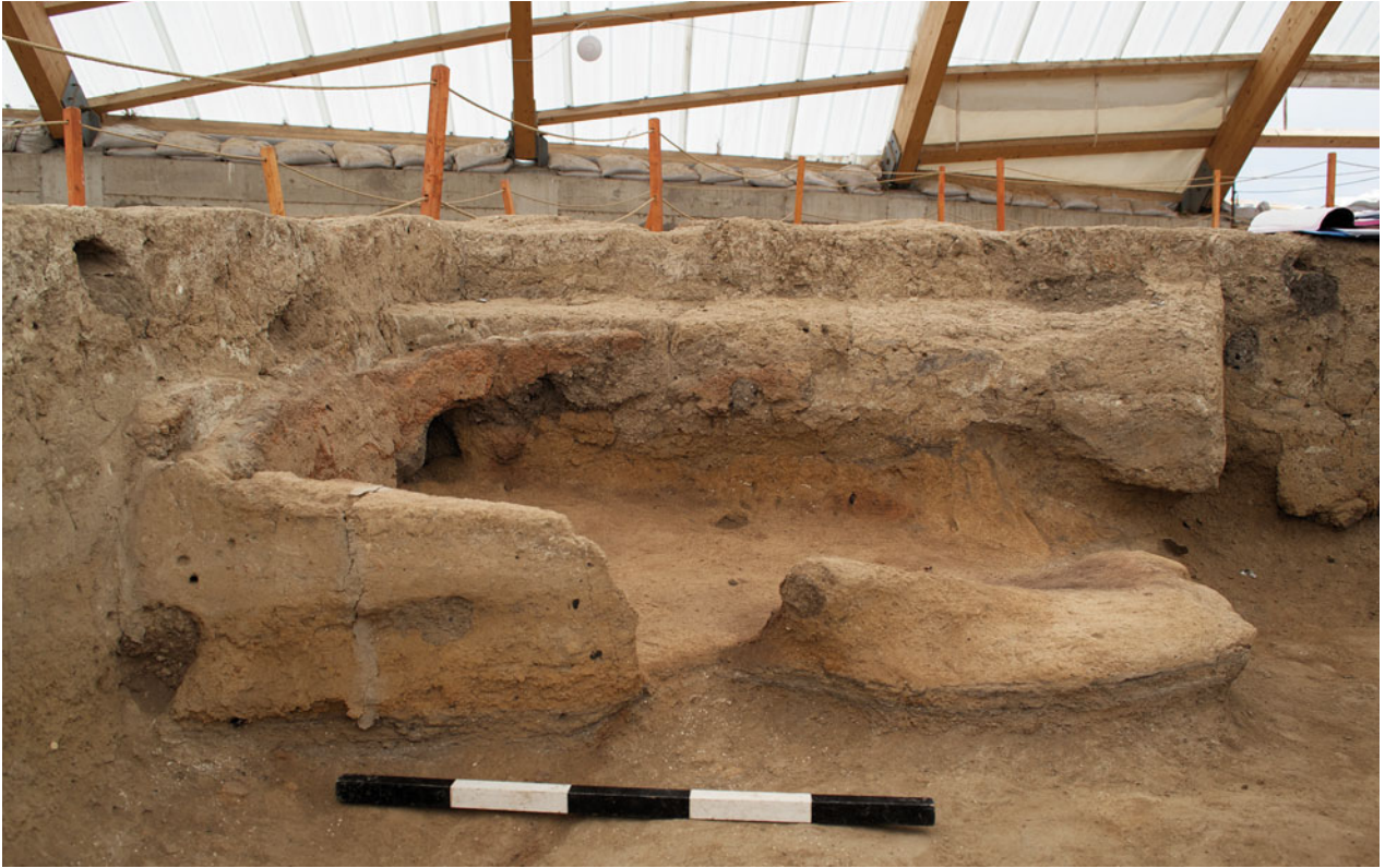
Figure S21.20. Oven F.4060, superstructure (16772) prior to excavation. Facing west.