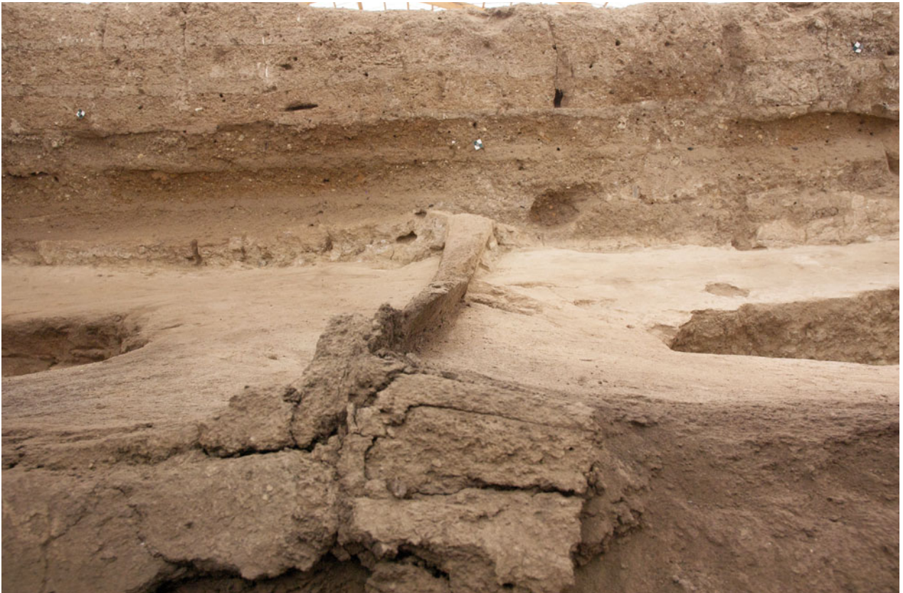
Figure S21.17. Detail of plaster floors (30507) abutting kerb F.3693, which clearly had been constructed above floors (21120) (photograph by Jason Quinlan).