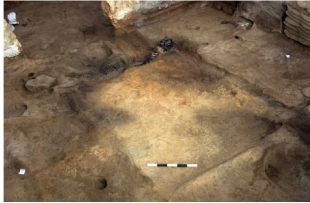
Figure S22.21. Central floors (19502).