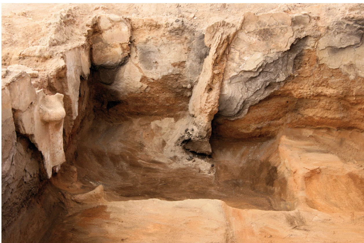
Figure S22.37. Collapse of the entry ladder structure at the beginning of the 2010 excavation season.