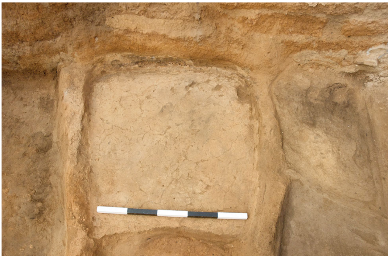
Figure S22.36. Oven F.3603.