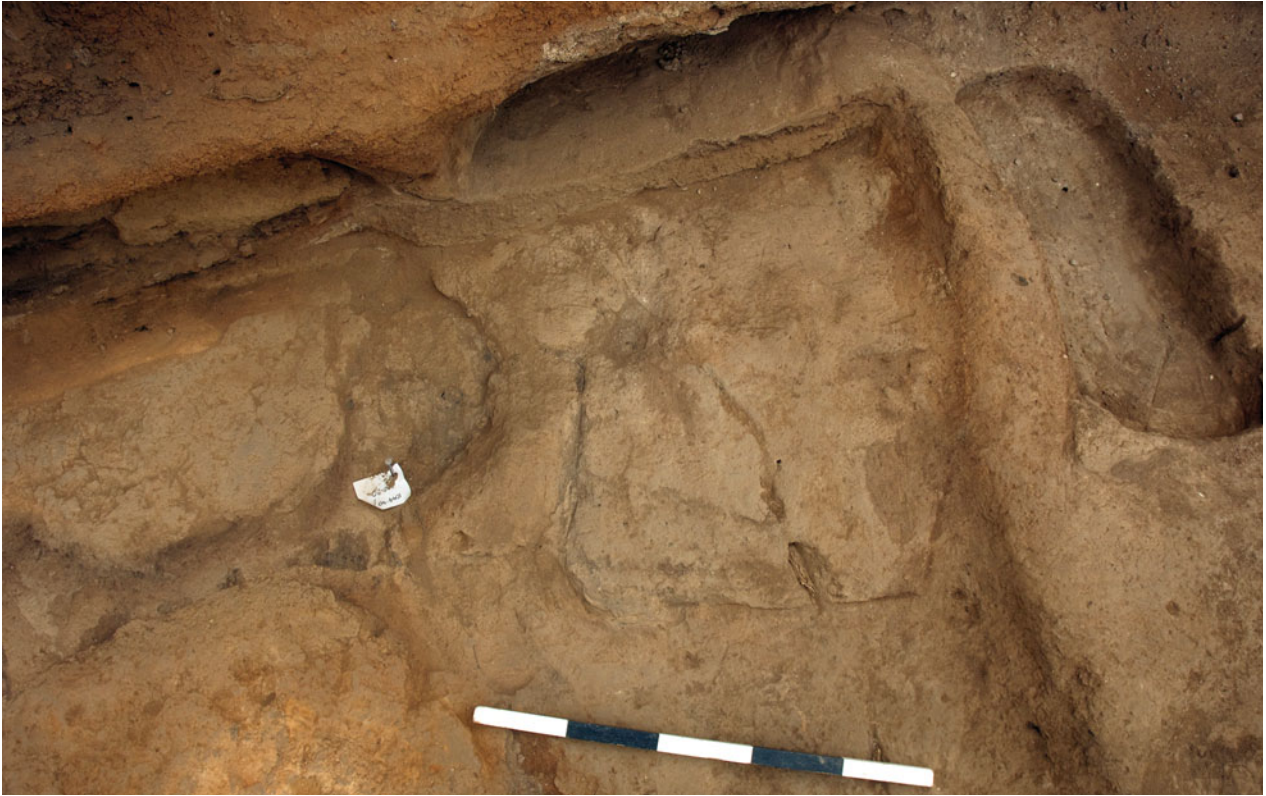
Figure S22.23. Oven F.3608. The oven is cut on its eastern end by the construction of oven F.7108.