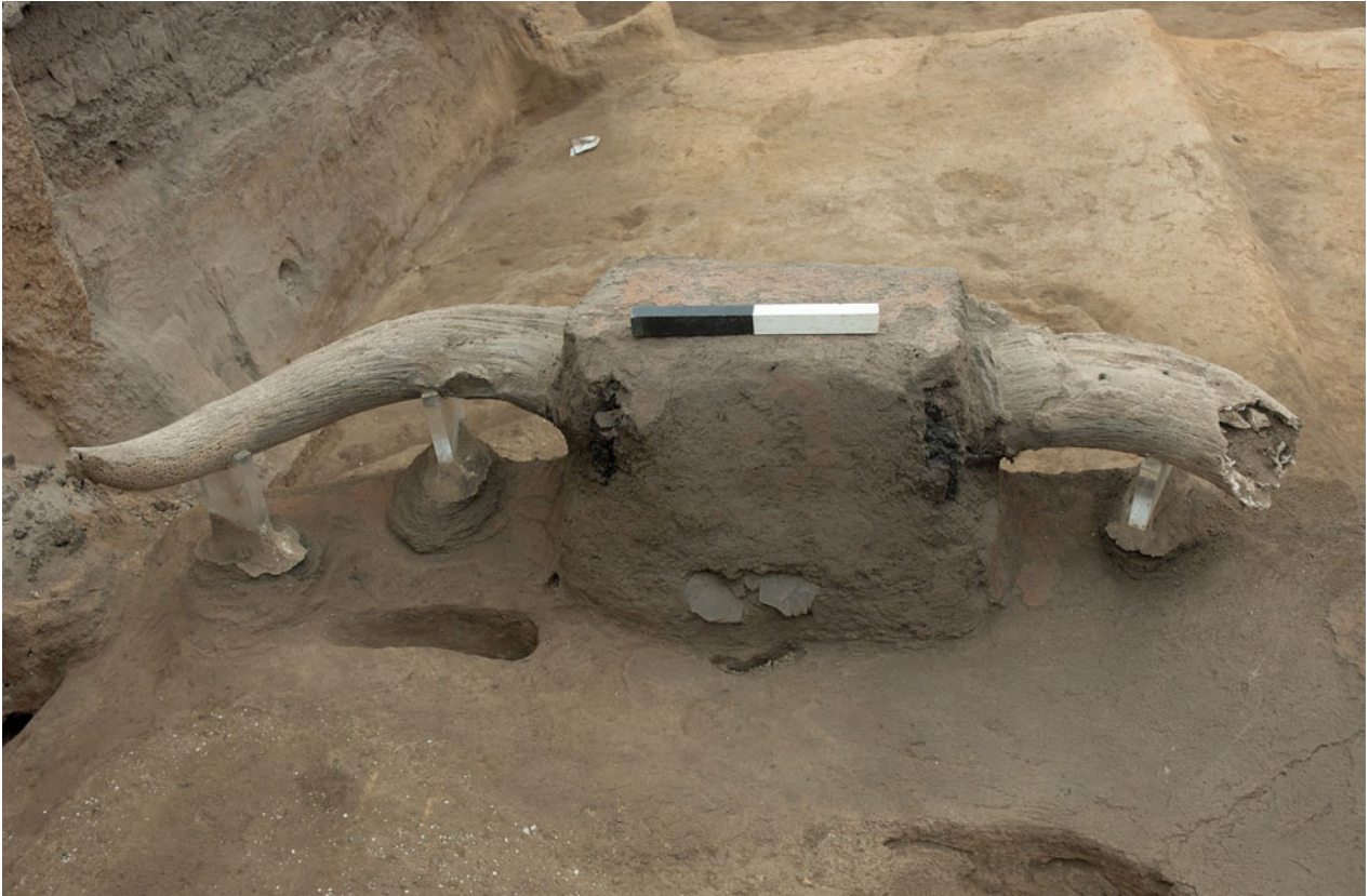
Figure S22.40. Traces of red paint can be seen on the pedestal as well as platform (photograph by Michael House).