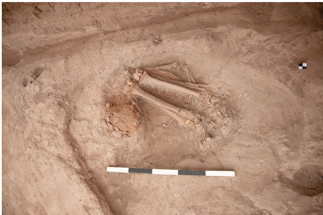
Figure S22.13. Burial F.7333, skeleton (22026).