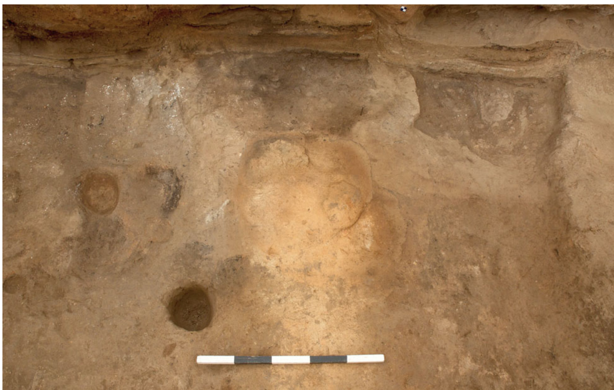
Figure S22.11. Hearth F.8132, set immediately in front of oven F.7583, to the northeast of oven F.7308, also in the image. The circular cut for F.7308 is clear, as are its remaining floors.