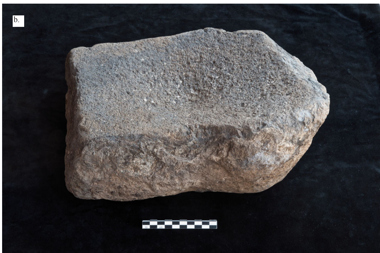
Figure S22.20. Quern stone (17547): (a) in the centre of the southwestern activity area; (b) post-excavation.