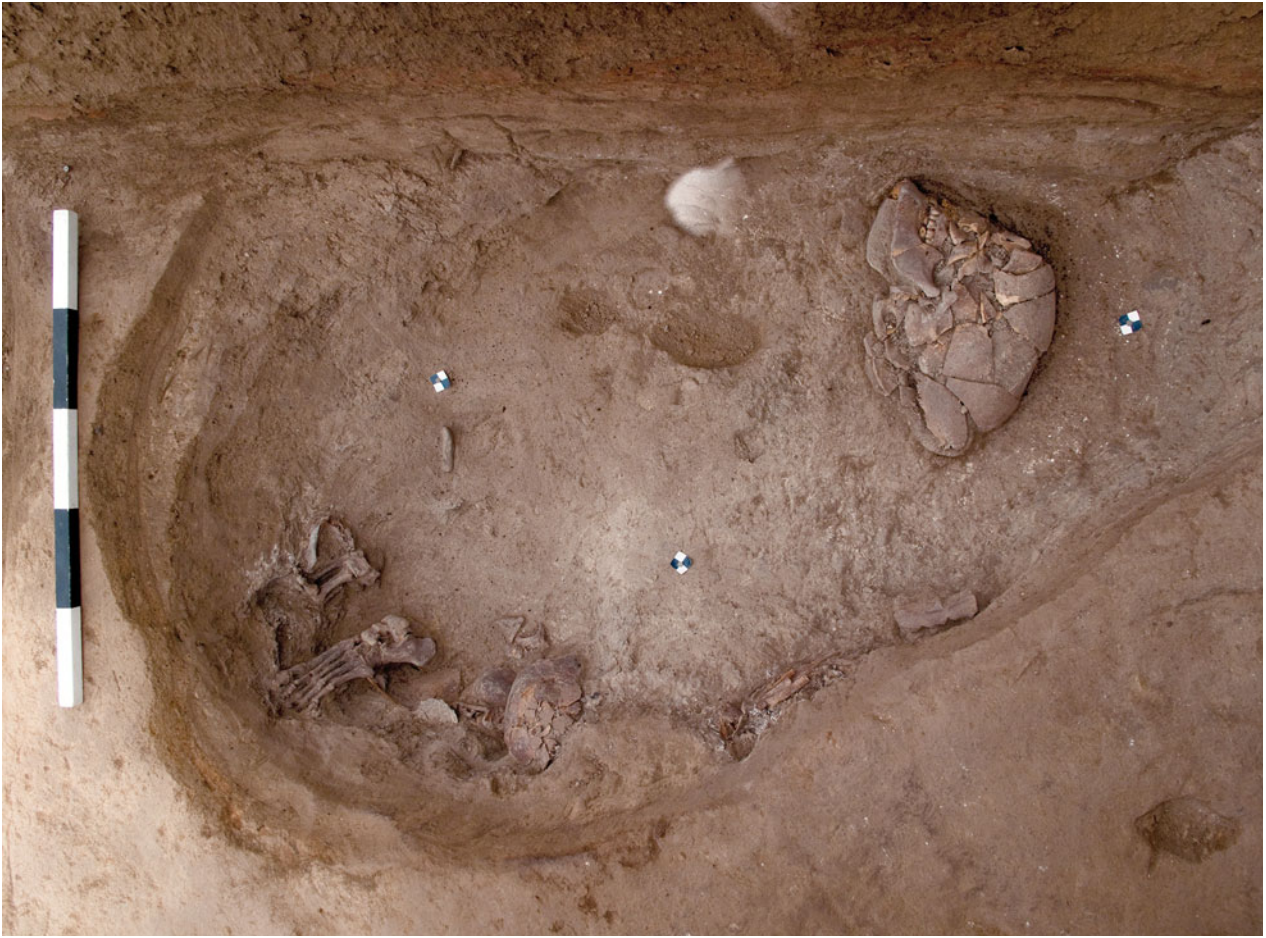
Figure S22.34. Burial F.3600 with primary disturbed adult skeleton (19038). Facing north.