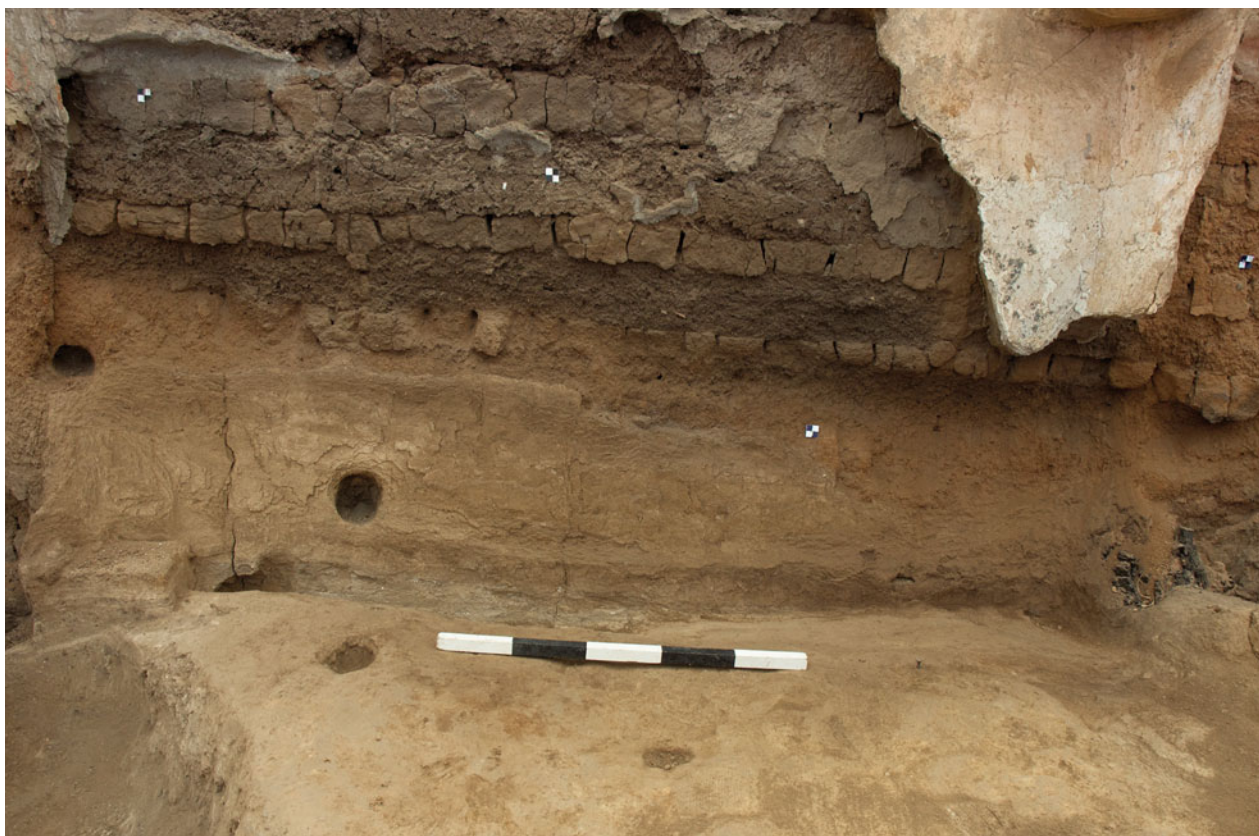
Figure S22.12. Remnants of plaster (19545) on east wall of B.77.