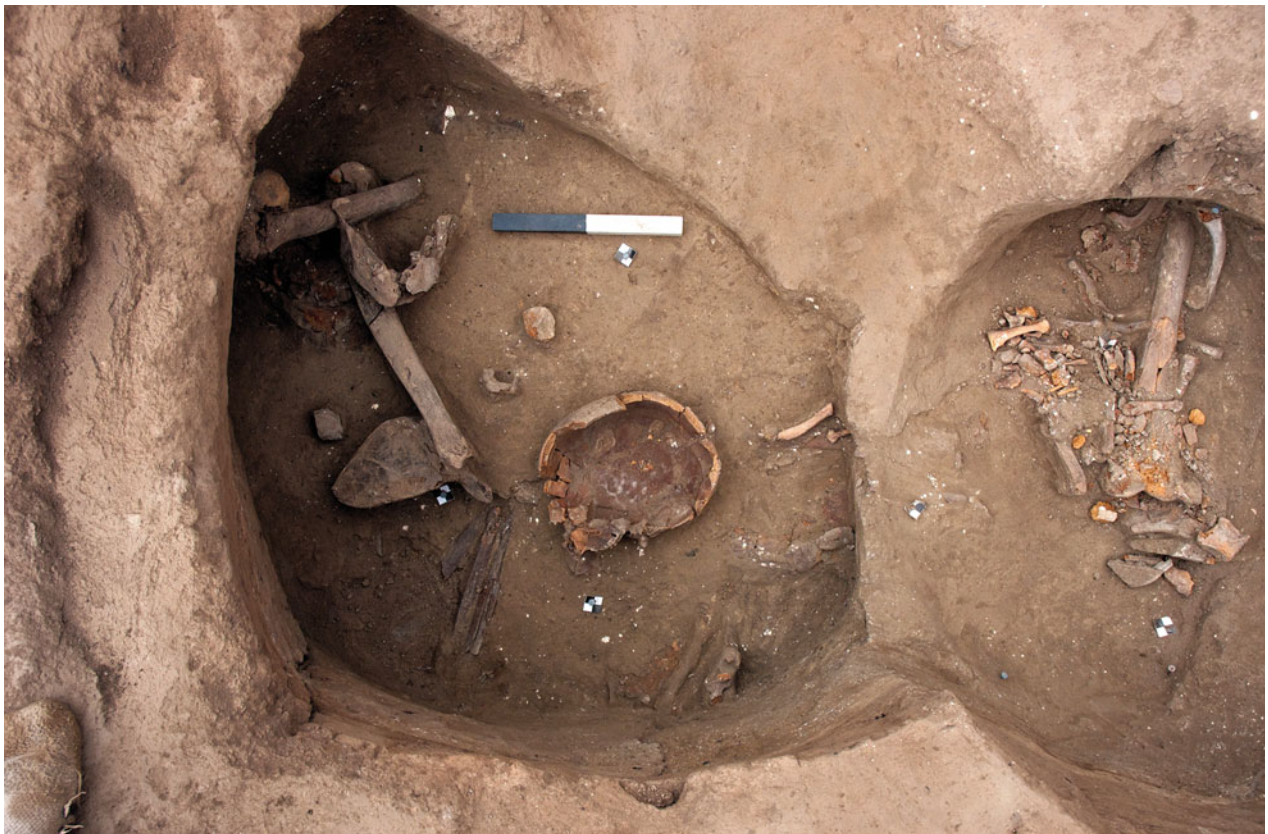
Figure S22.7. Burial F.3616 during the 2010 excavation campaign, facing north.