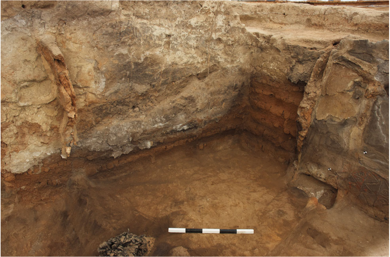
Figure S22.32. The remnants of bin F.6050 after its excavation in 2011.