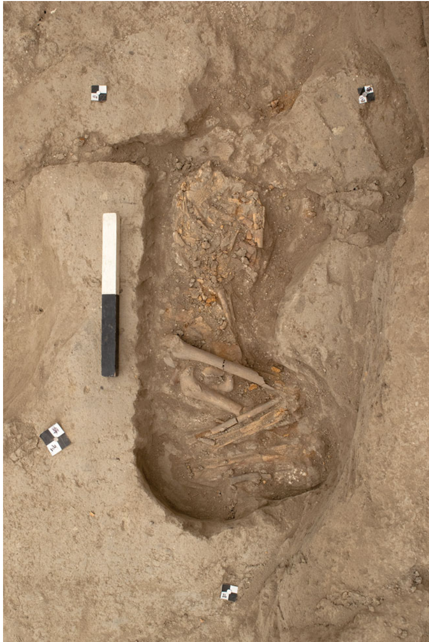
Figure S22.5. Burial F.7860, with skeleton (21681). Facing north.