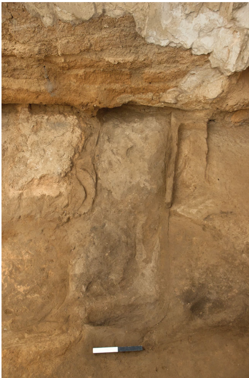
Figure S22.31. Bin structure F.3605 in the southern activity area.