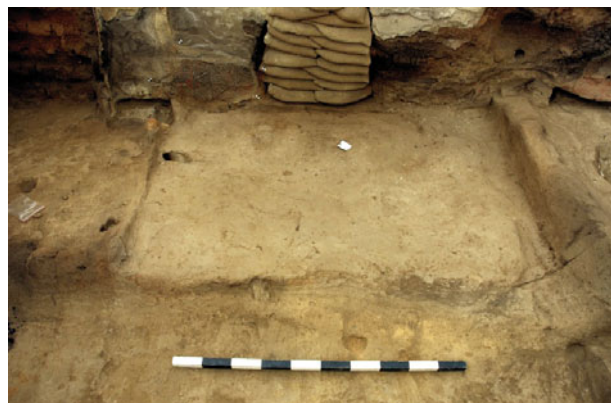
Figure S22.26. Platform F.6062, floors (19524).