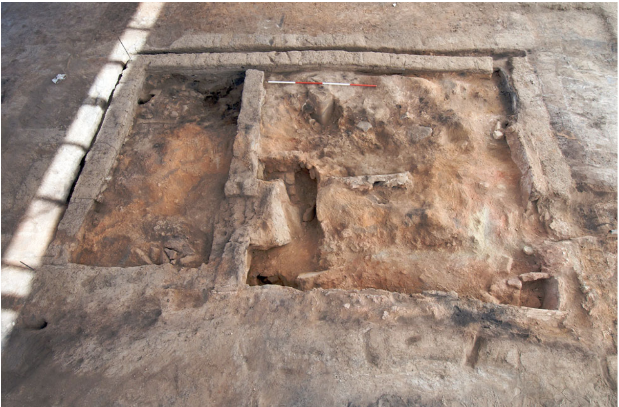
Figure S22.41. The burnt infill of B.77 as partially excavated in the 2008 field season. Facing north.