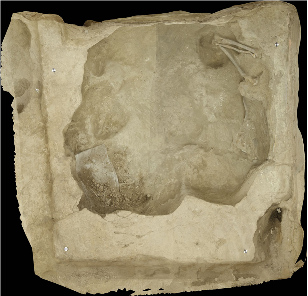
Figure S22.14. Orthophoto of burial F.7137, skeleton 30549 in the northeastern platform.