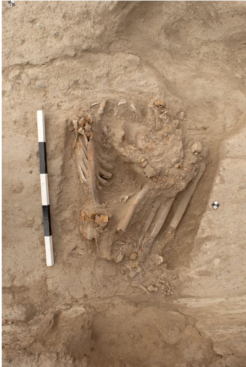
Figure S22.17. Burial F.7857, skeleton (21668), facing south.