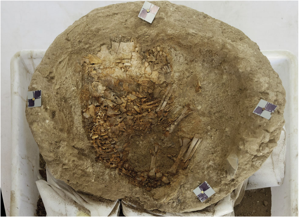
Figure S22.27. Burial F.3642 after excavation in the laboratory.