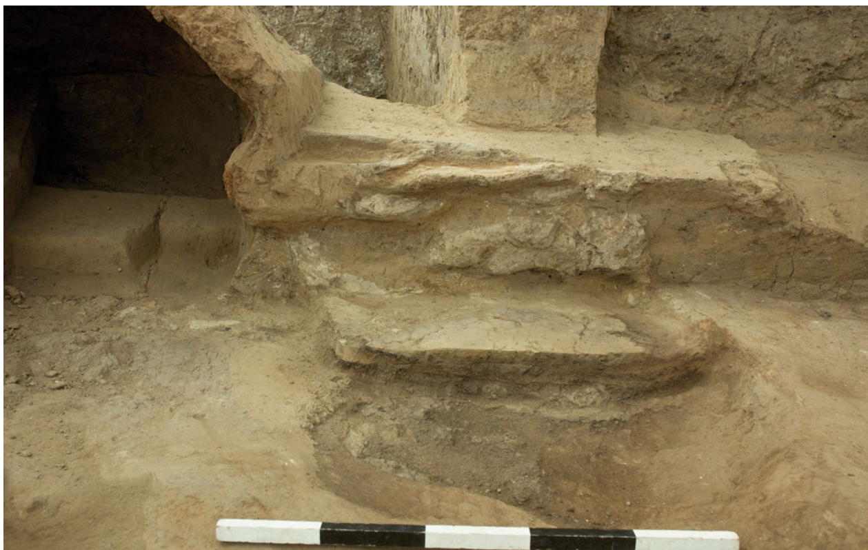
Figure S22.10. Oven F.7308, facing south. The oven was truncated by later activities, although its circular cut was preserved as can be seen in the image.