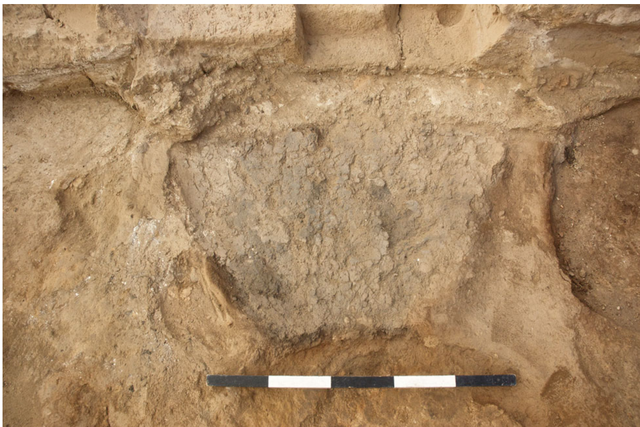
Figure S22.4. Oven F.7583 with floor (22064). Facing south.