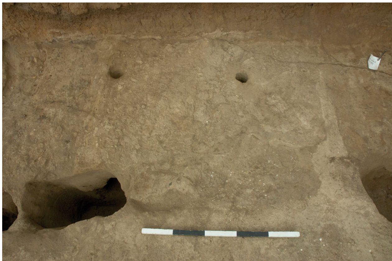
Figure S22.9. Bin/basin F.7148, facing west.