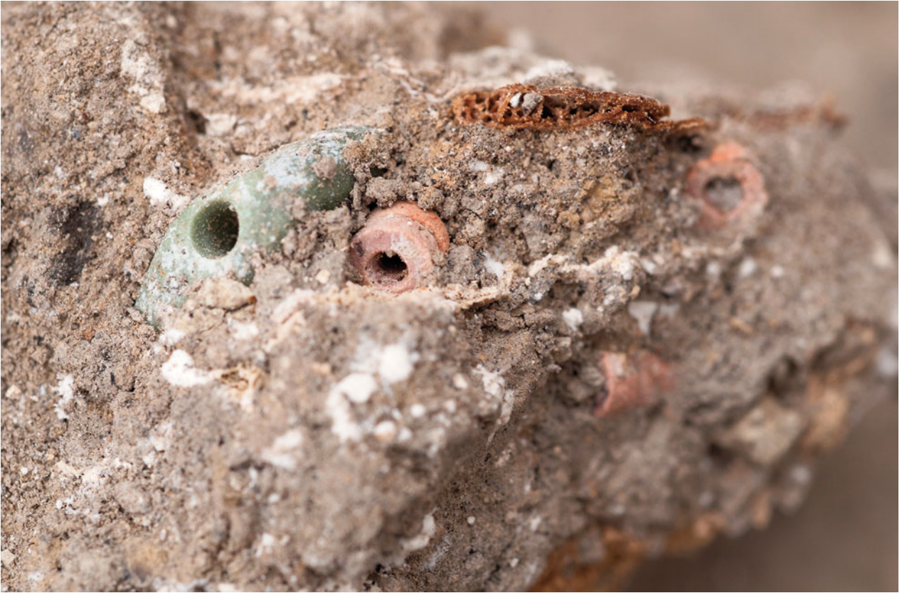
Figure S22.6. In situ positioning of some of the beads recovered from burial F.7860.