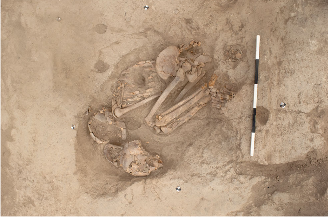
Figure S22.18. Burial F.7853. Facing north.