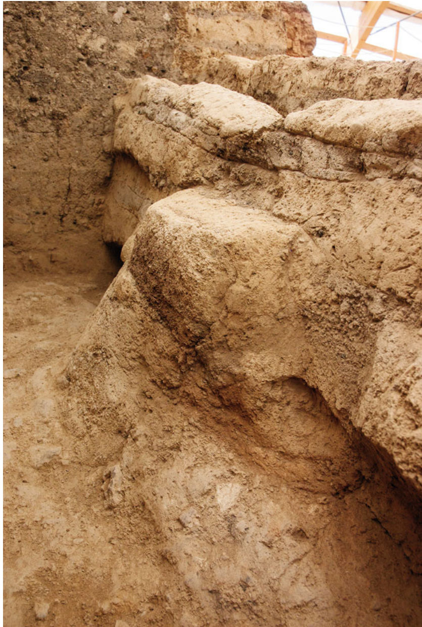
Figure S22.30. The dome of oven F.7108 from the back, during the excavation of the northern wall of B.108. The wall clearly respects the superstructure of the oven.