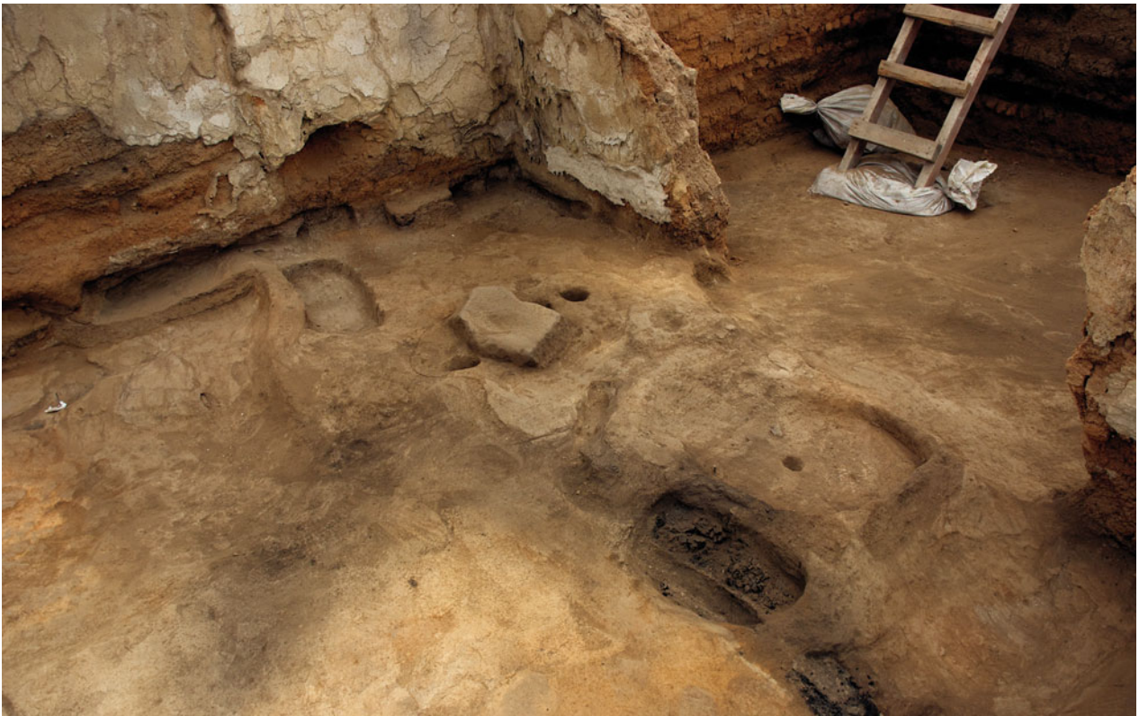
Figure S22.24. Overview of the southwestern activity area including oven F.3616 at the eastern end, abutted by basin F.8136. To the west is basin F.3610. Quern stone (17547) is still in use.