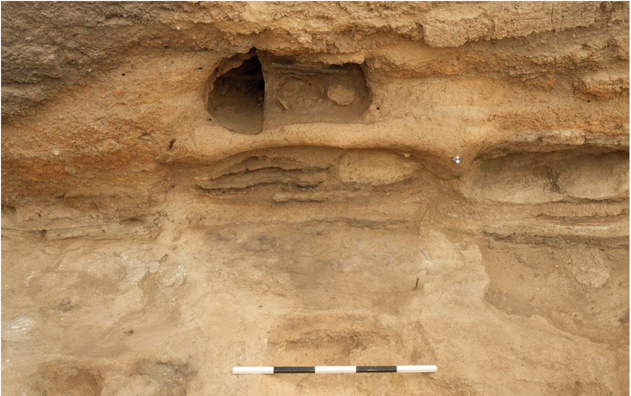
Figure S22.28. The 'discovery' of oven F.7108 in 2011, before it was excavated in 2012 and 2013. The fill of the oven was partially excavated in 2011. The oven floor in front of the oven is that of oven F.3621 that F.7108 truncated.