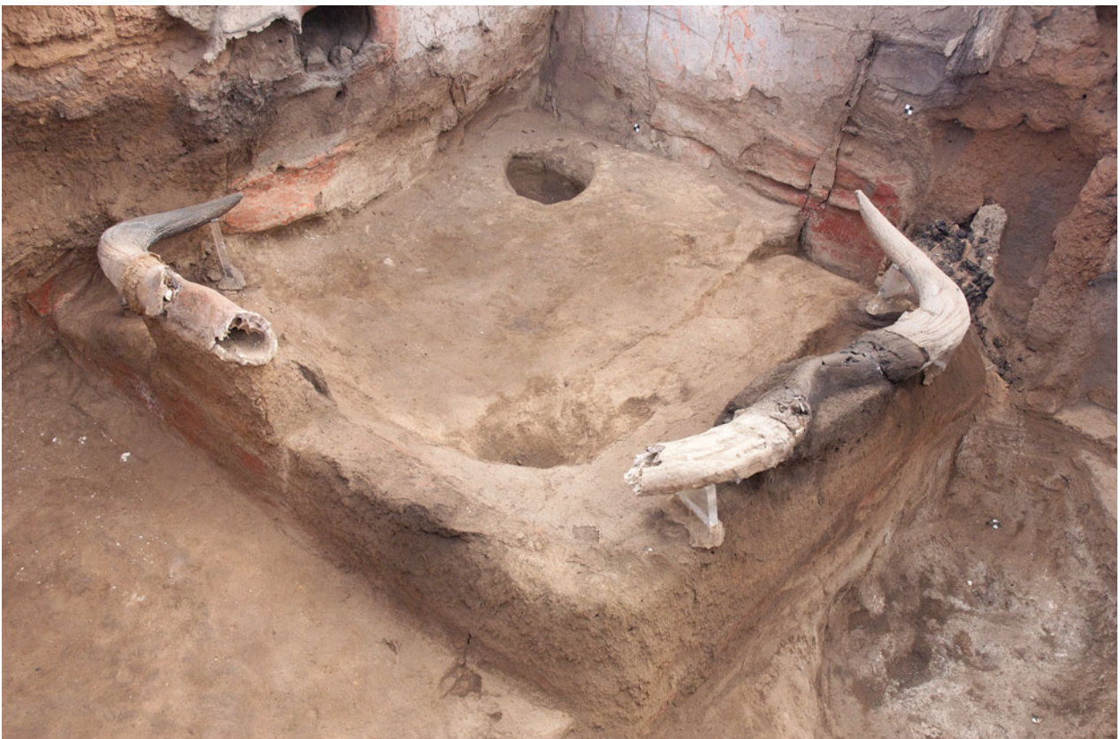
Figure S22.33. The horned pedestals in 2010, slowly eroding away and showing their cranial cores.