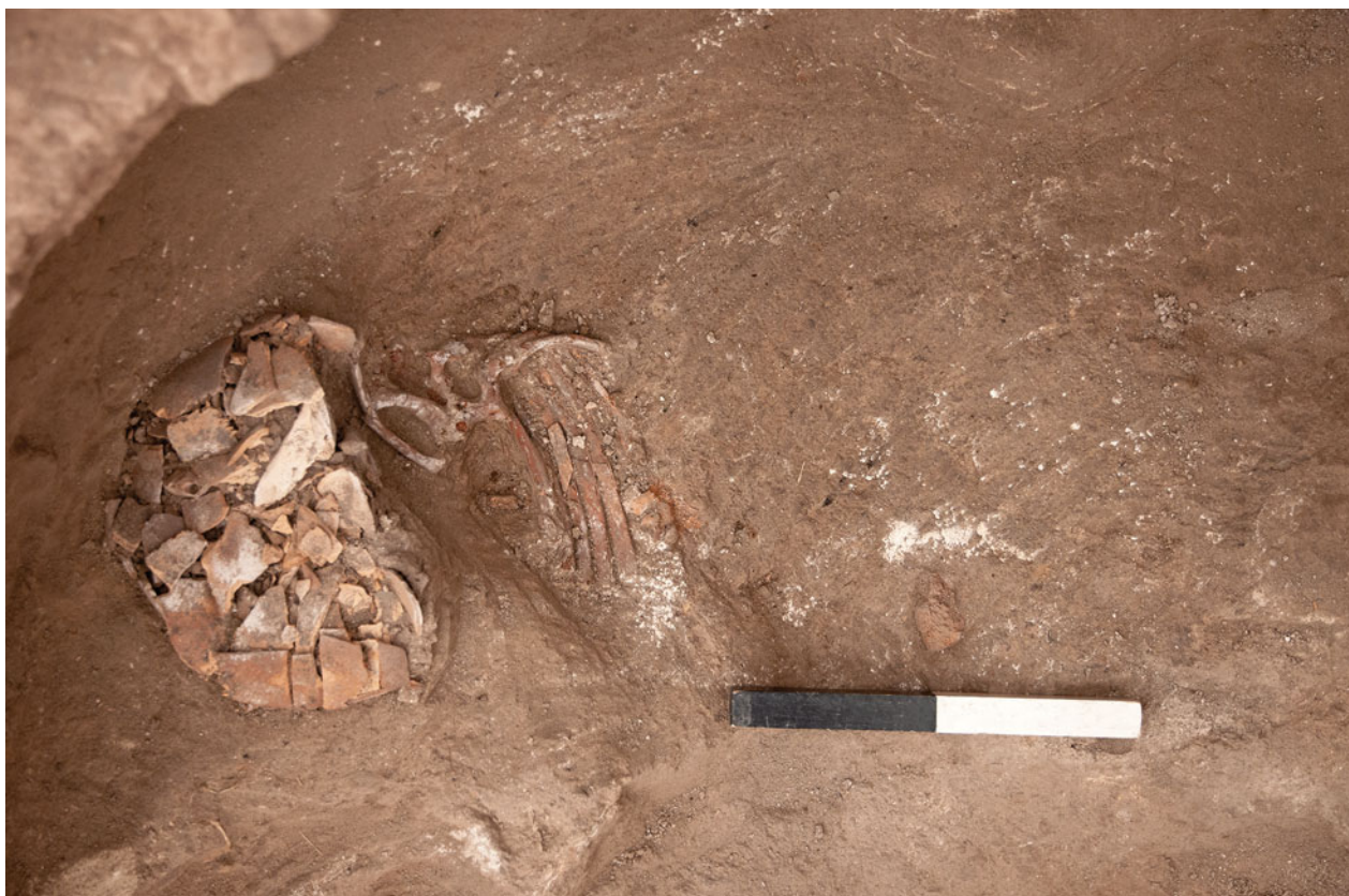
Figure S22.15. Burial F.7132, skeleton (19557). Facing north.