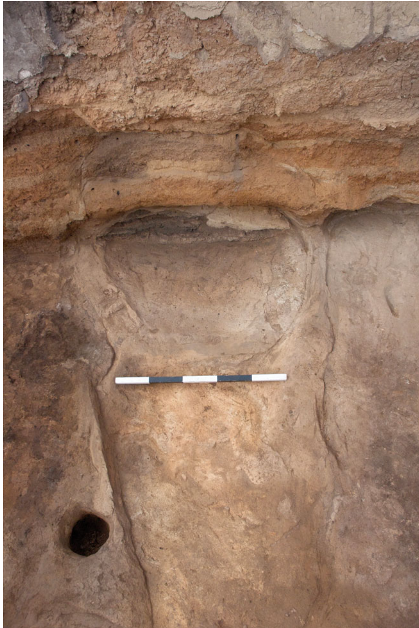
Figure S22.19. Oven F.3621, with its latest use surface (19088).