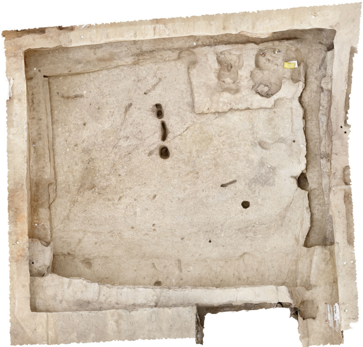
Figure S22.1. Orthophoto of Sp. 602 with outline of B.77 walls.