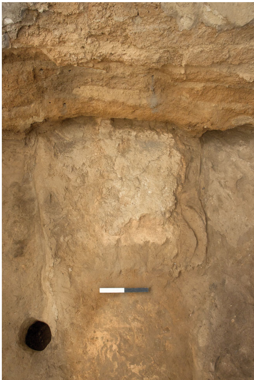
Figure S22.29. Oven floor surface (19072), the latest floor surface of oven F.7108, was actually partially excavated in 2010.