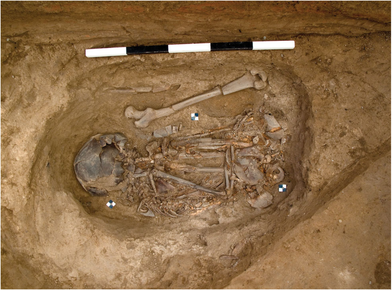
Figure S22.35. Burial F.3601 with primary adolescent (19022). Facing north (photograph by Scott Haddow).