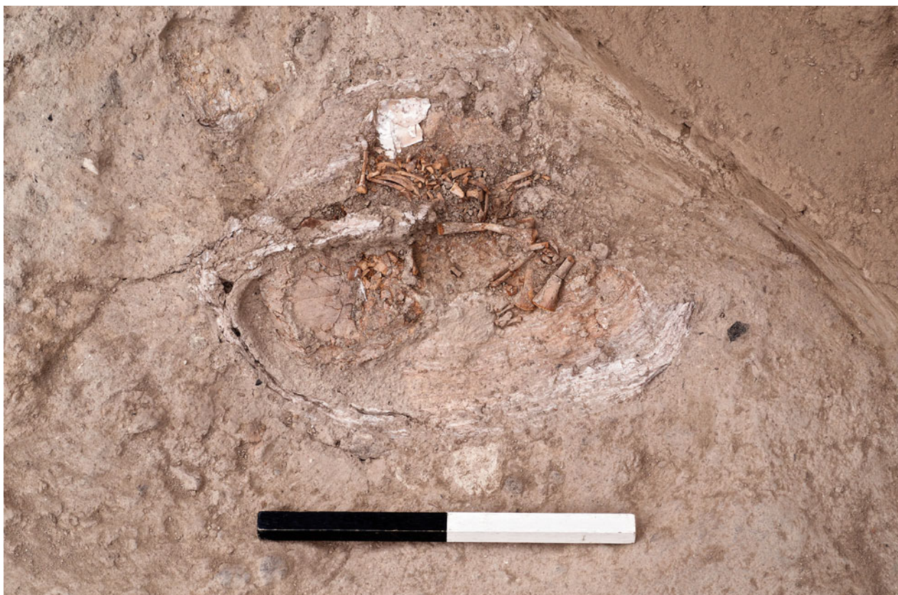
Figure S22.16. Burial F.7859 of neonate (21678).