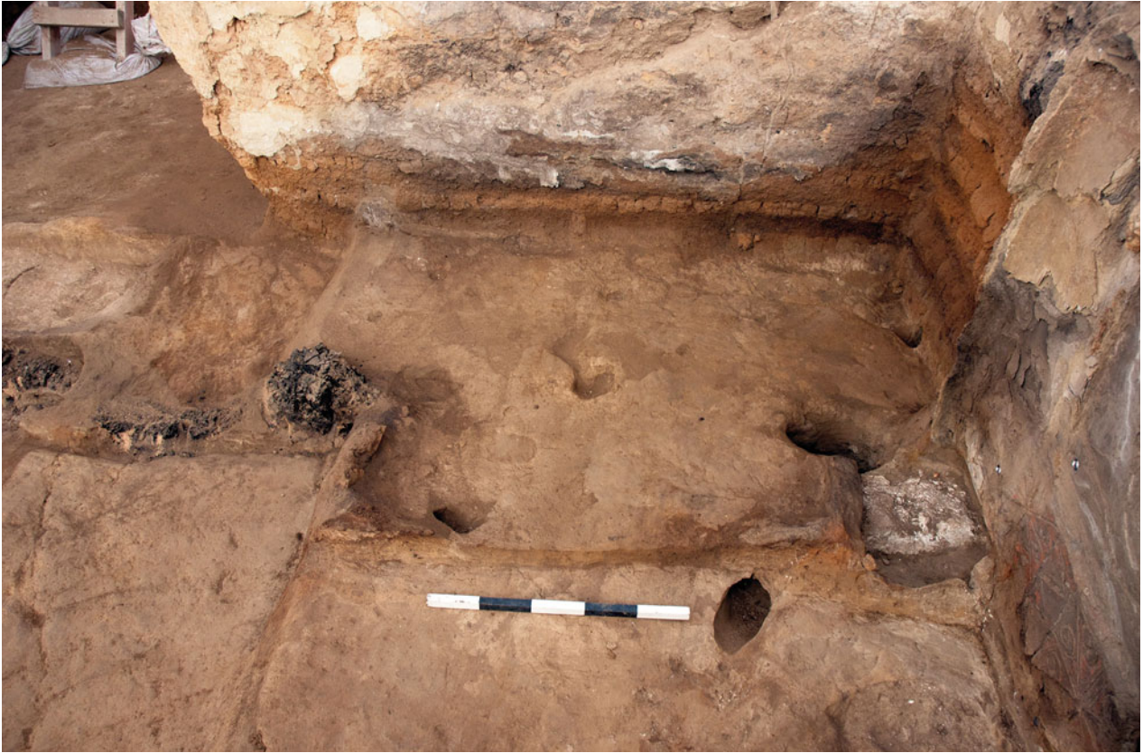
Figure S22.25. Platform F.3611, facing west, with make-up (19519).