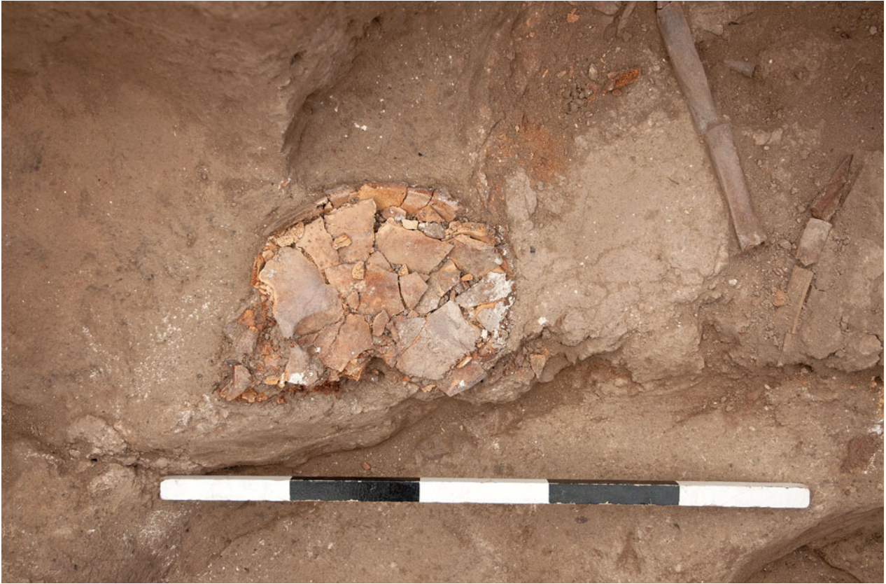
Figure S22.38. Cranium (20864).