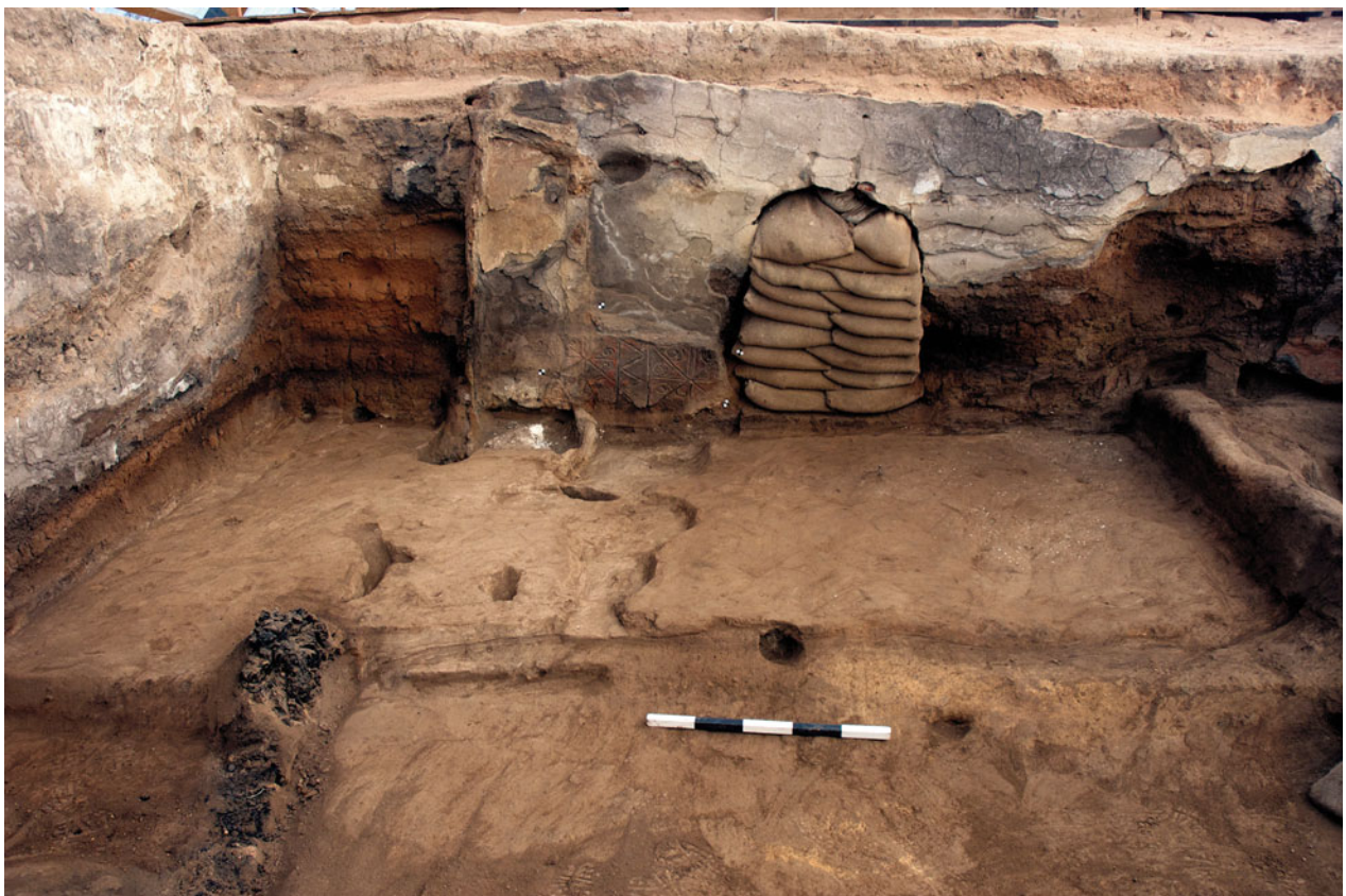
Figure S22.22. Platform makeup (19532) during mid excavation.