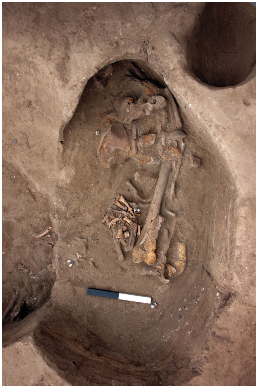
Figure S22.39. Skeleton (19535) within burial F.3697. Facing north..