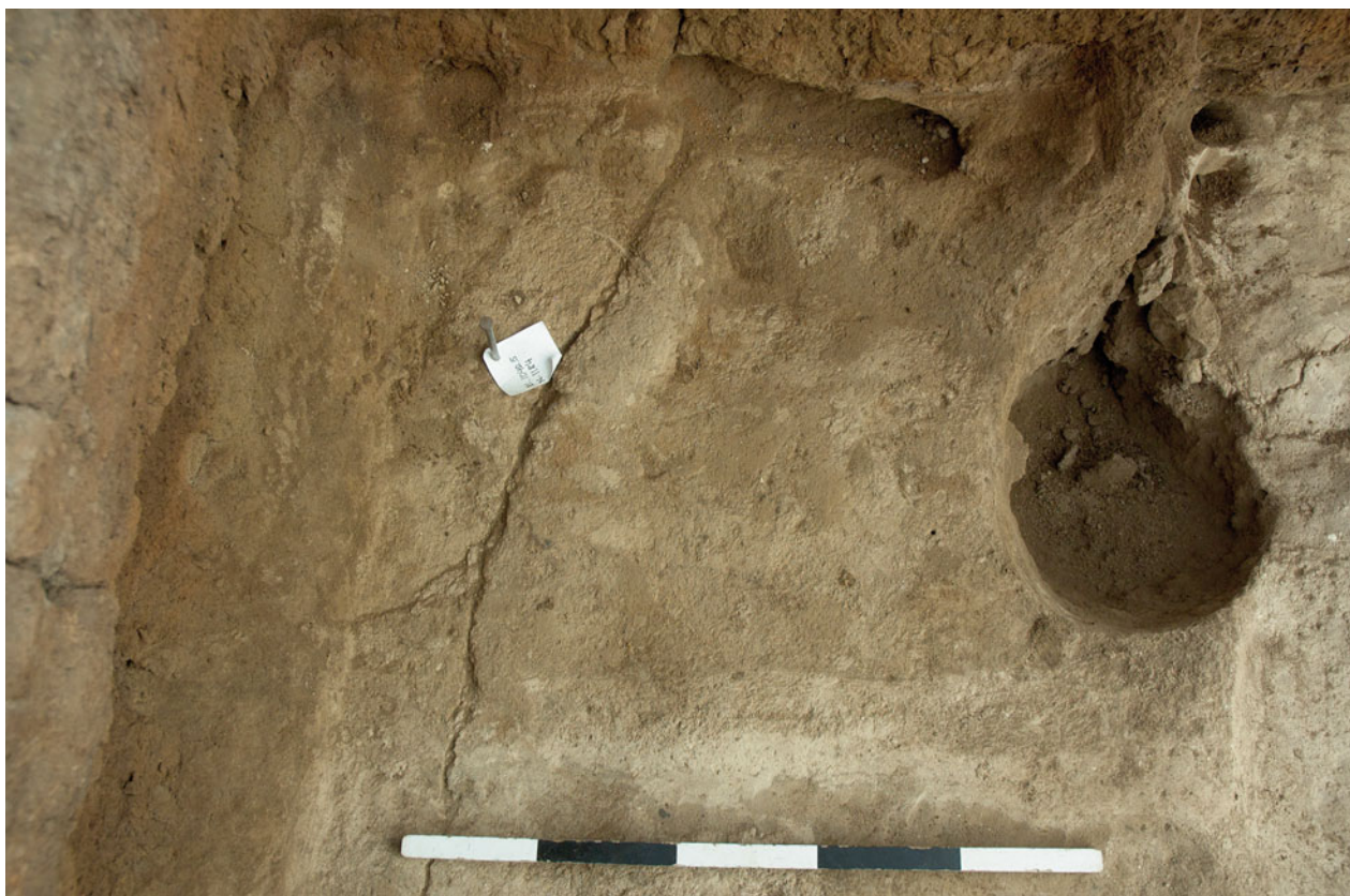
Figure S22.8. Bin F.7603, with its truncated wall (30174) extending from partition wall. Facing north.