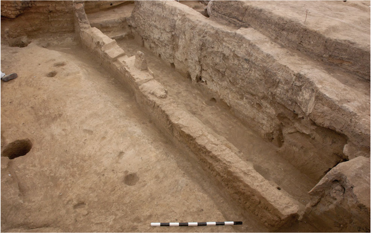
Figure S22.2. The partially excavated southern wall F.3096 clearly sits within a shallow but wide foundation trench F.7591. The wall is north of B.132's still-standing partition wall. Facing southeast.