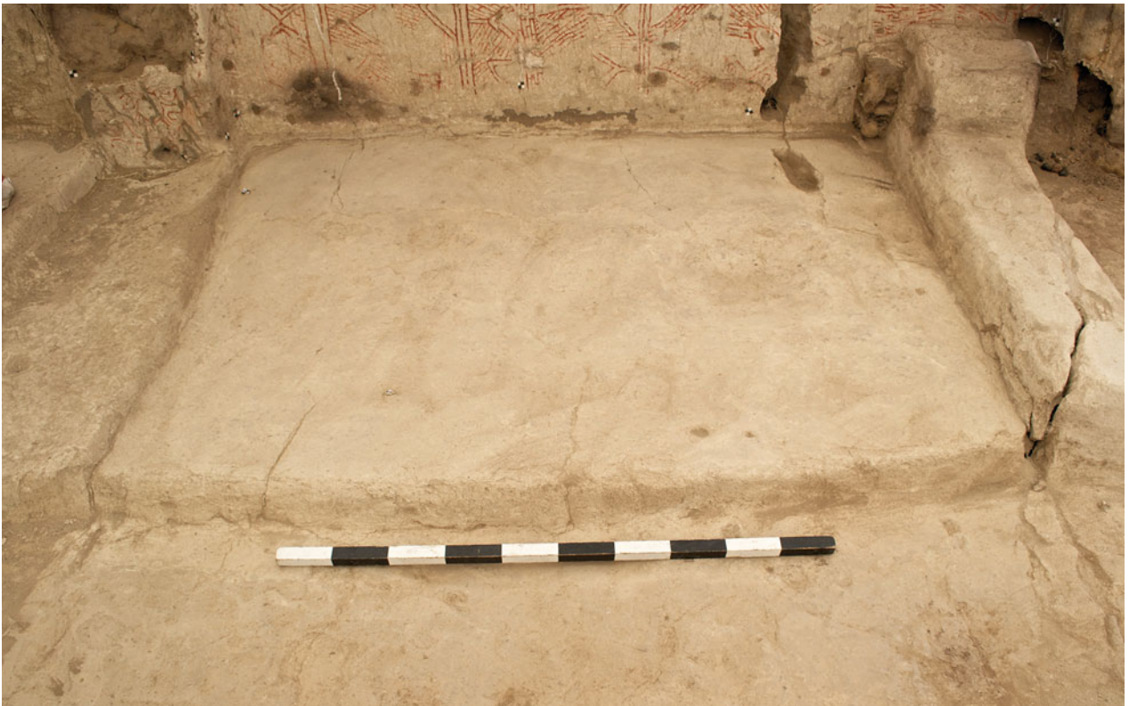
Figure S11.32. East-facing photograph showing the platform surface (20029) including slumps relating to underlying burial sequences.