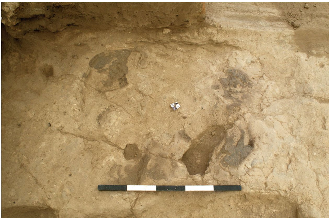
Figure S11.19. South-facing photograph of oven structure, F.7412.