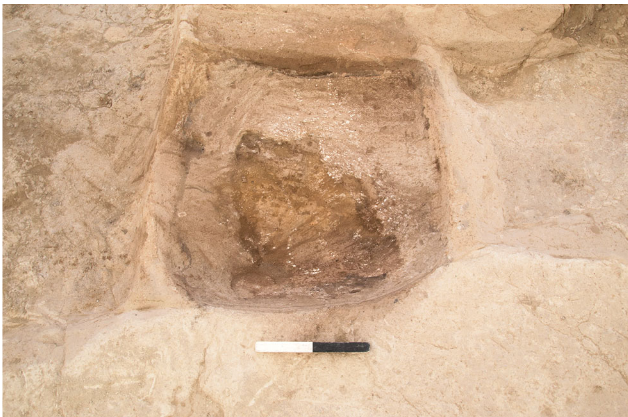
Figure S11.10. South-facing photograph showing structured hearth F.7402.