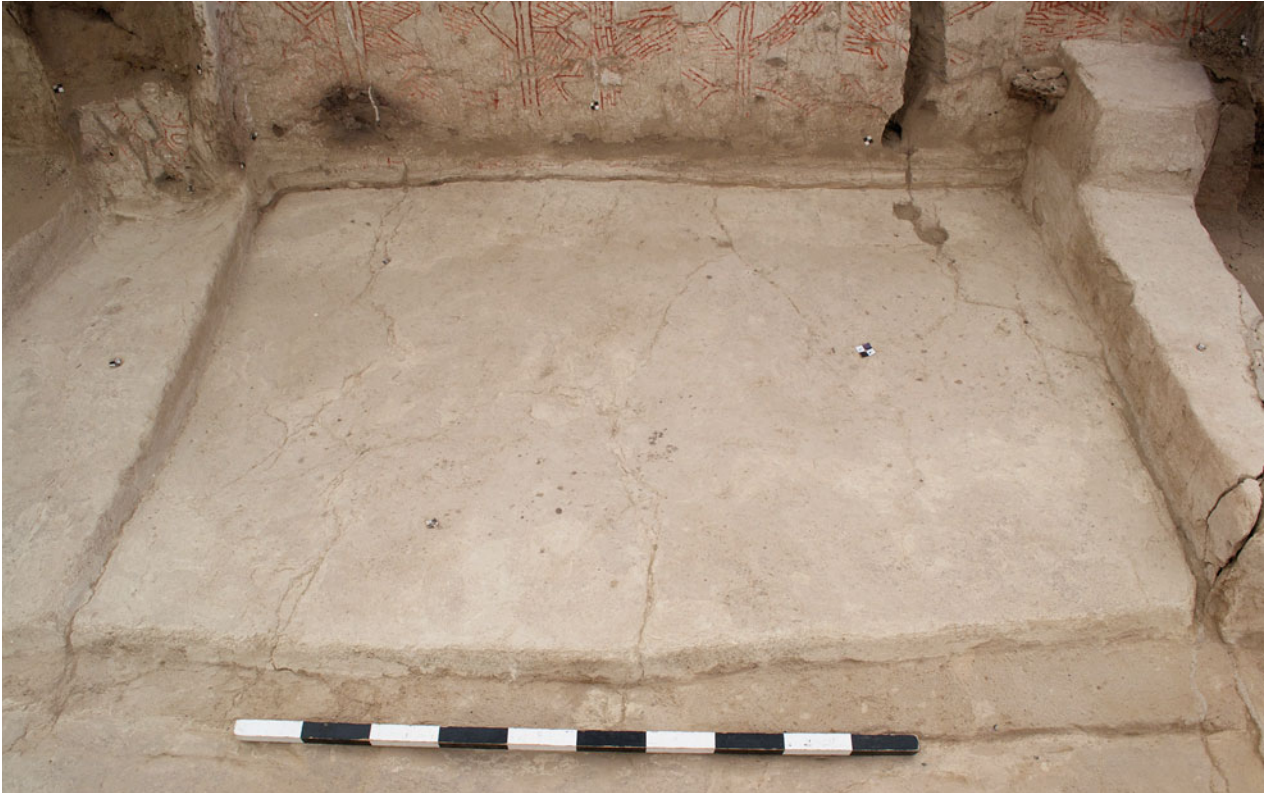
Figure S11.13. West-facing photograph of the central platform area F.3440 before excavation of the burial sequence.