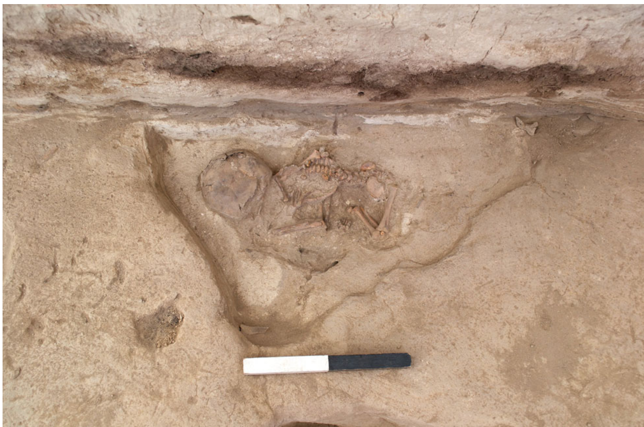
Figure S11.17. North-facing photograph of burial F.7406.