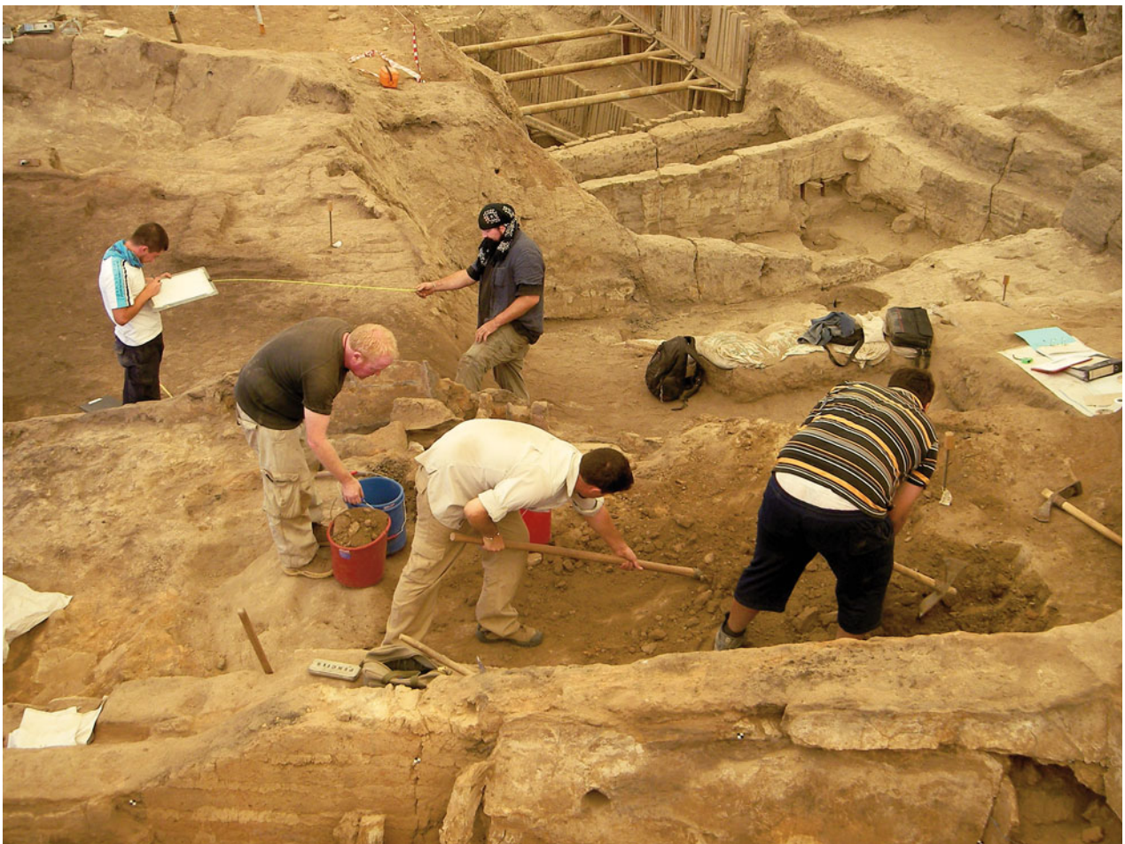
Figure S11.1. Working shot of B.80 under excavation.