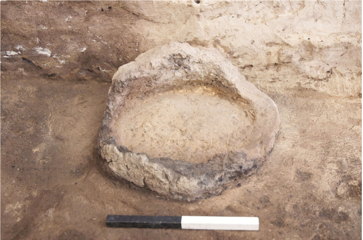
Figure S11.41. East-facing photograph detailing crude clay container (18957).