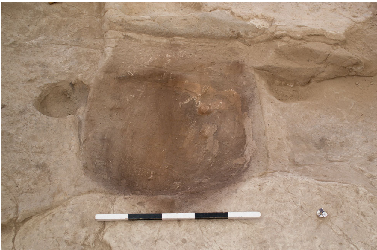
Figure S11.27. South-facing photograph of structured hearth, F.7402.