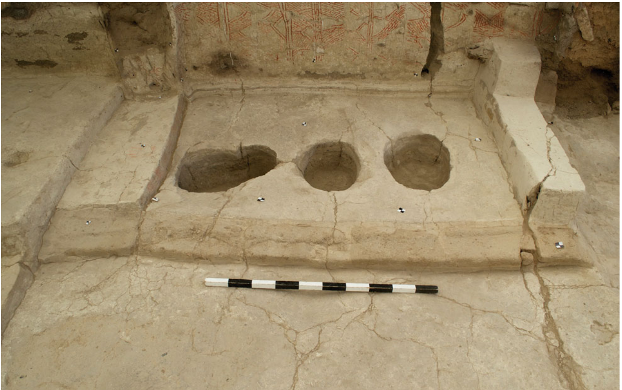
Figure S11.14. West-facing detail of the brick boundary (22416) of the eastern platform; note also the three burial pits, from left: F.7407, F.7408, F.7409.