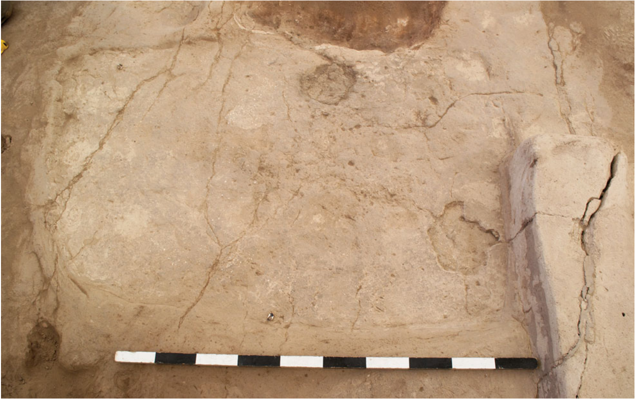
Figure S11.29. East-facing photograph of sunken floor in the central area (21722) also showing pit cut which contained groundstone (21725), with hearth F.7402 at top of image.