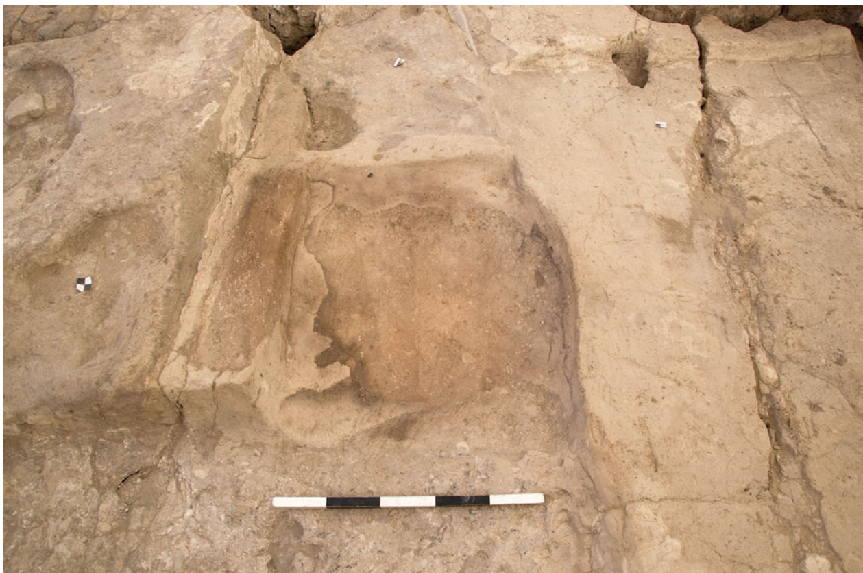
Figure S11.8. West-facing photograph showing hearth F.7426.