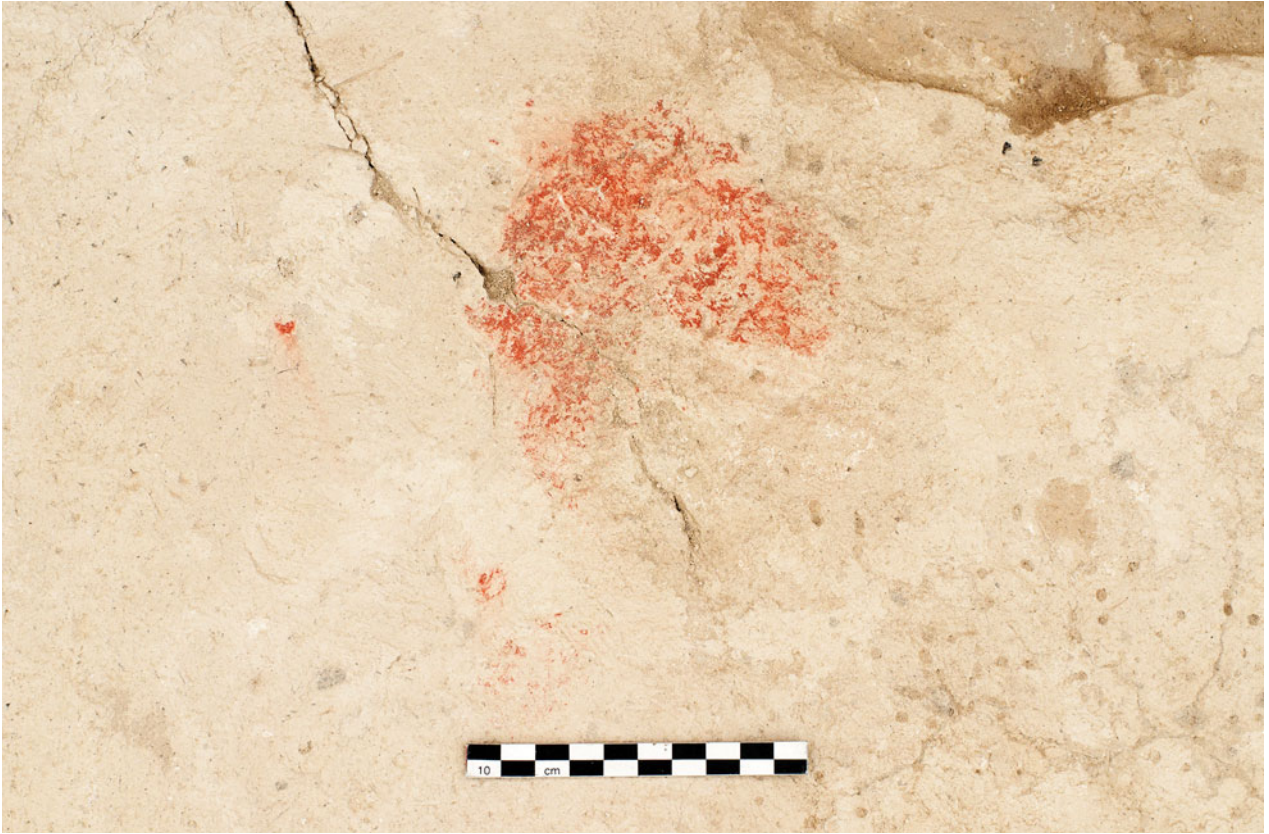
Figure S11.25. East-facing photograph detailing the red pigment 'spill' (20079).