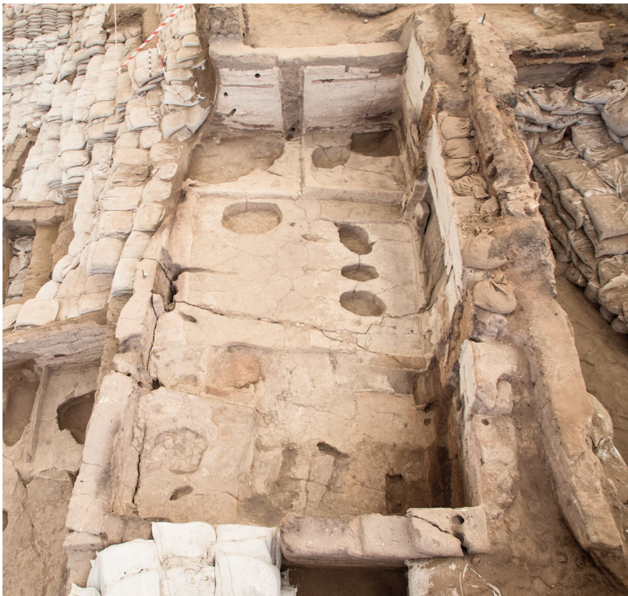
Figure S11.3. North-facing overview of B.80 with most of the earliest makeup layers in Sp.135 (21281) exposed; note the layout of in situ posts: two each (opposing) on the west and east walls respectively and one on the north wall (there was no southern counterpart).