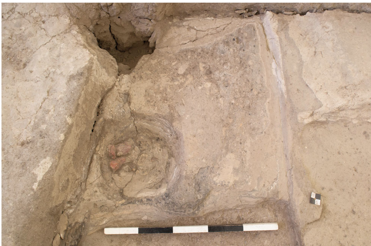
Figure S11.11. West-facing photograph showing platform F7423 and associated pit (F.7432) containing ochre cluster (21243).