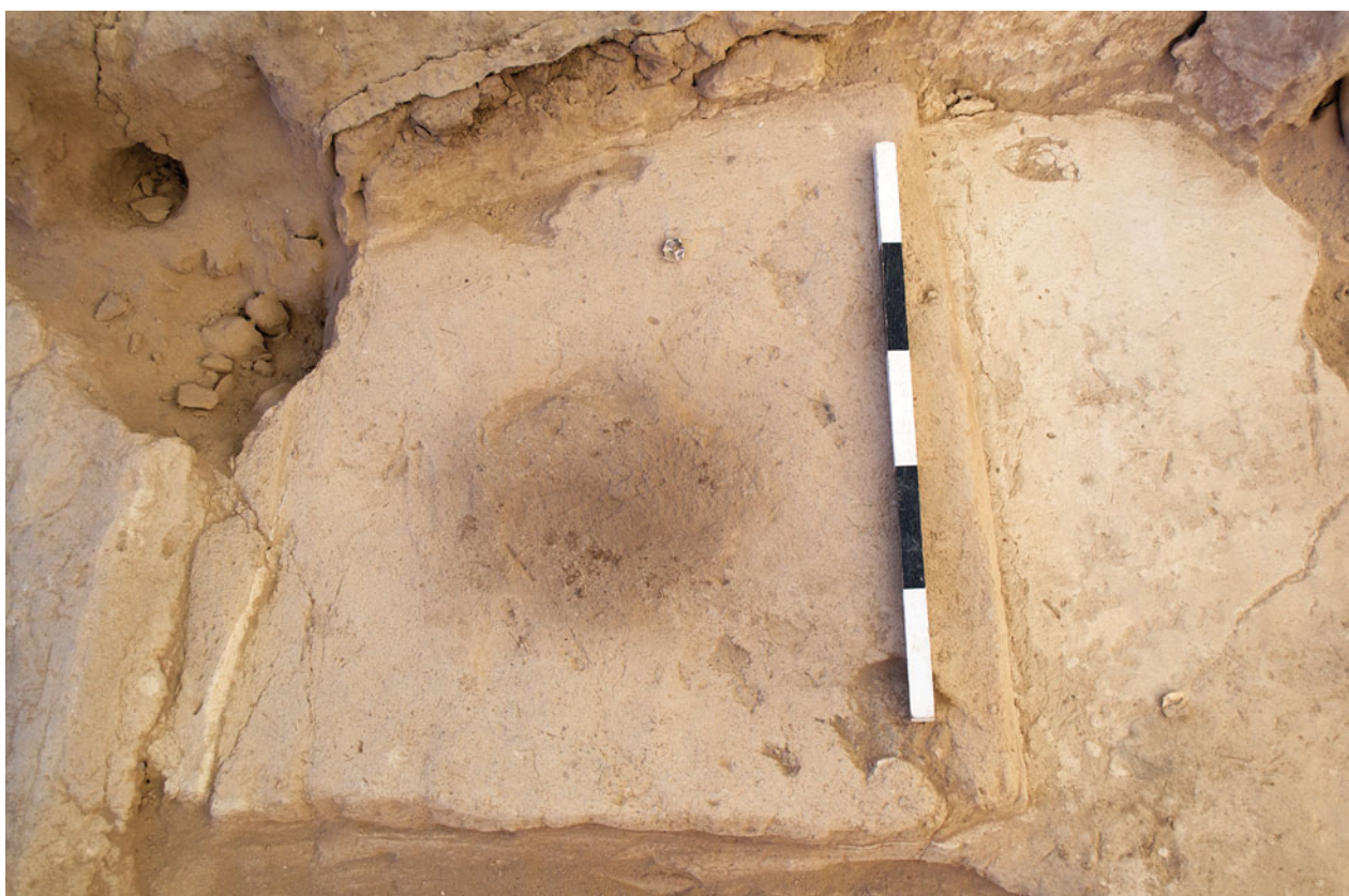
Figure S11.24. West-facing photograph of in situ burning (21752) with associated hearth F.7402.