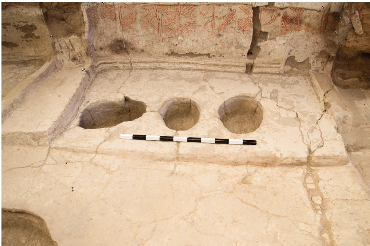
Figure S11.6. West-facing photograph showing east central bench (F.7410) plaster: 19193.