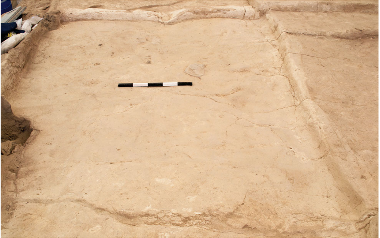
Figure S11.33. North-facing photograph showing central floor make-up (18982).