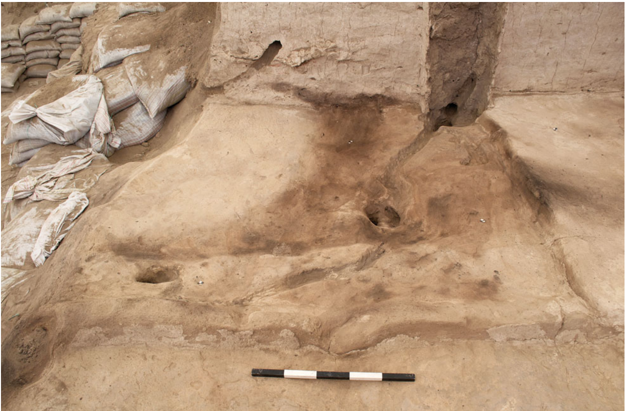
Figure S11.26. North-facing photograph showing final surface (18981) and post-depositional features affecting F.3442.