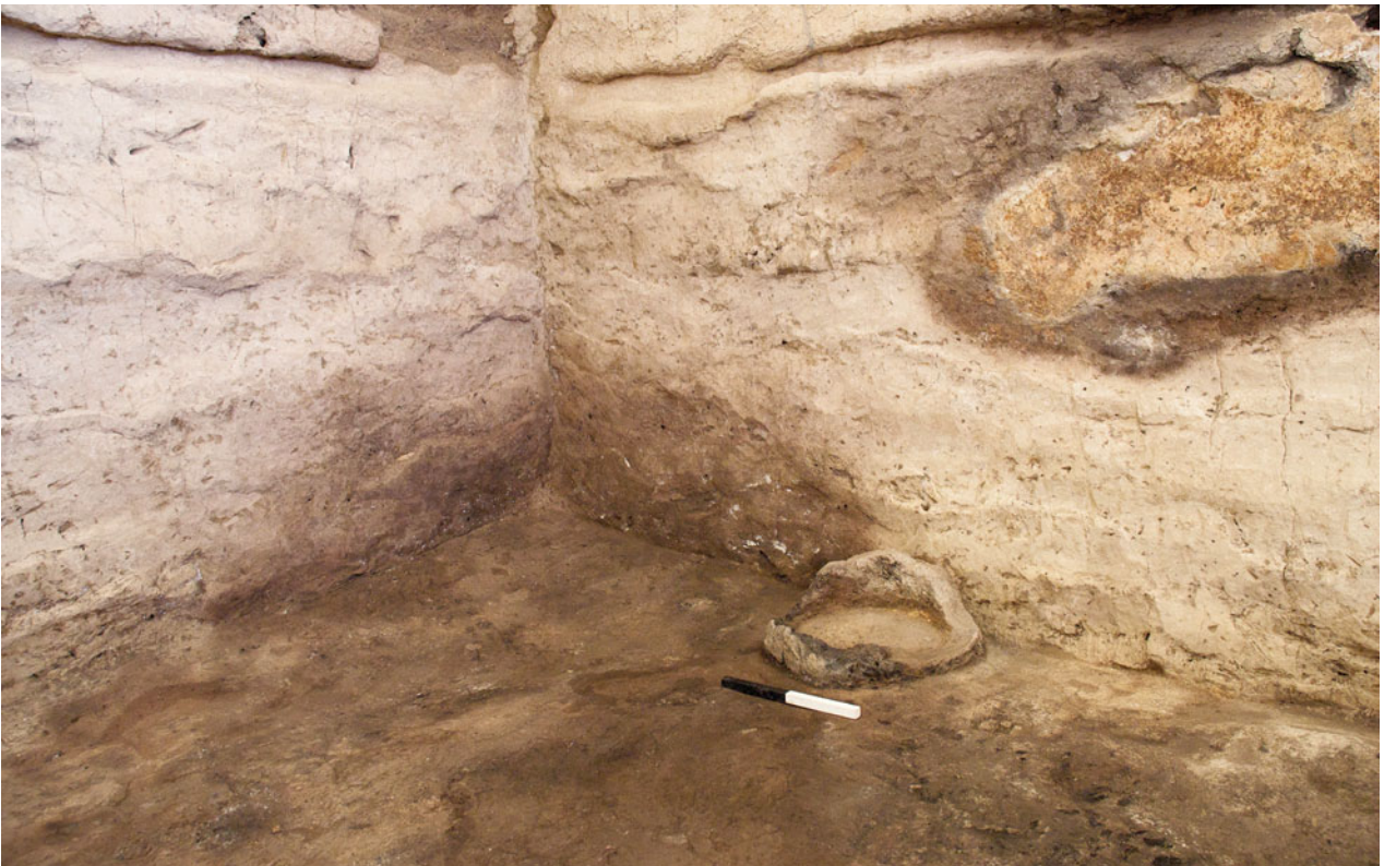
Figure S11.40. Northeast-facing photograph showing crude clay container (18957) which was associated with burnt seed clusters, (18945), (18949) and (18952), situated in abandonment deposit (18945).