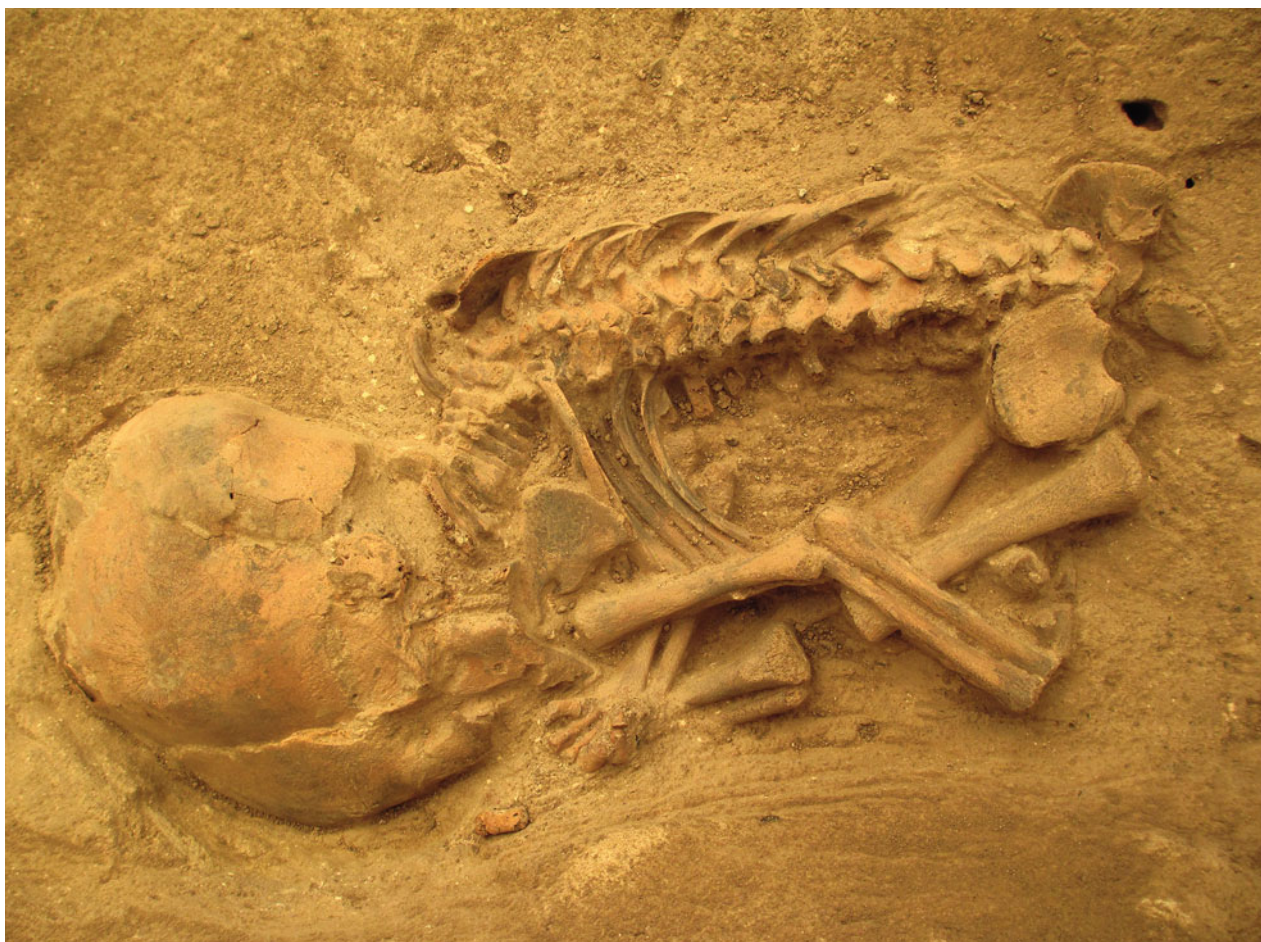
Figure S11.16. North-facing photograph of burial F.7405.