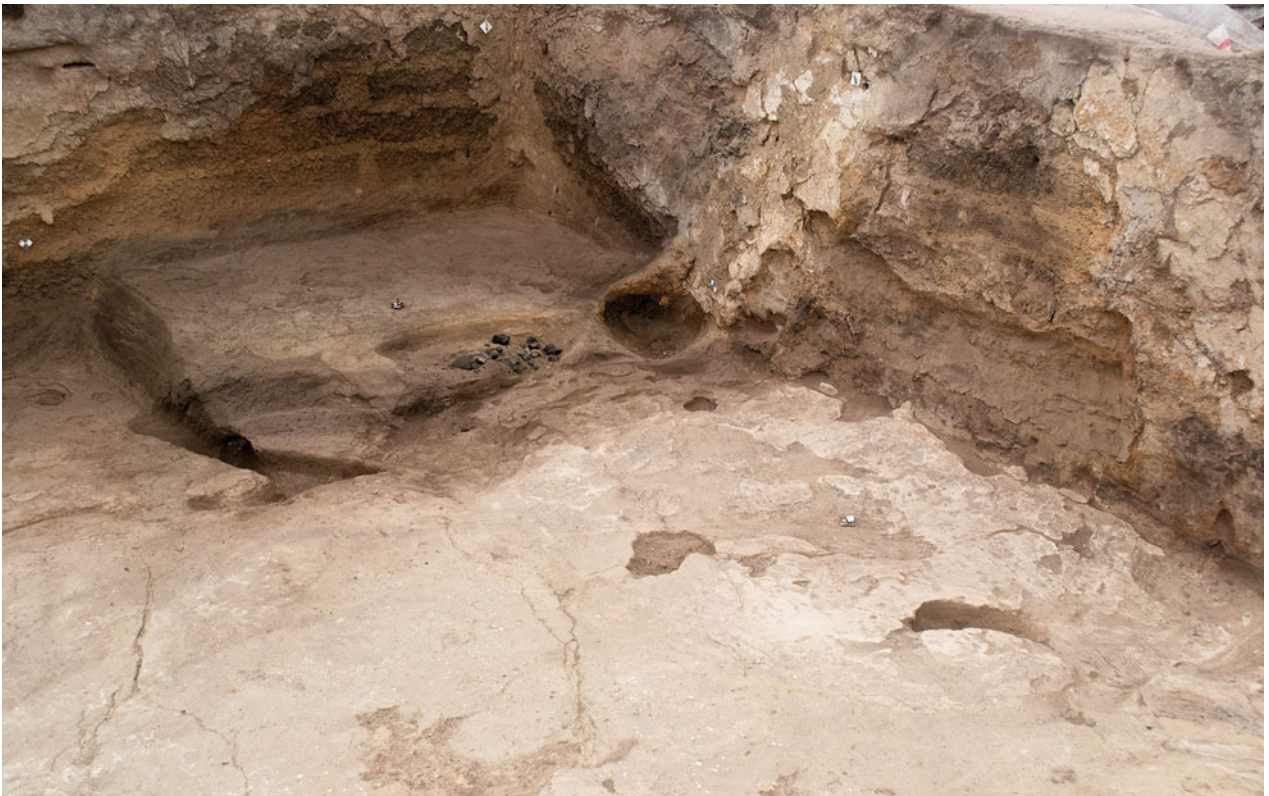
Figure S11.30. Southeast-facing photograph of floor sequence and oven preparation surfaces (20053, 20054 and 20058), with ladder platform in the background (photograph by Mateusz Dembowskiak).