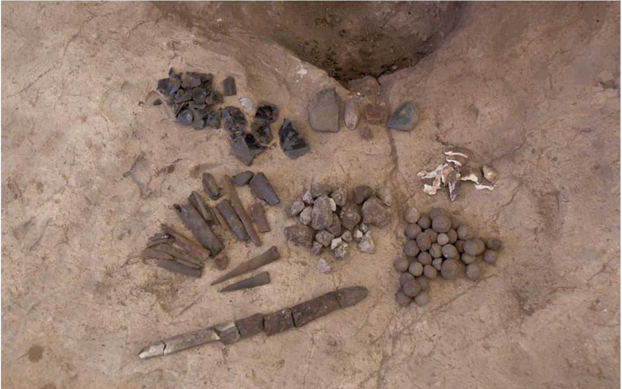
Figure S11.39. West-facing photograph showing the mixed cluster of bone tools, mini clay balls and obsidian (18940) laid out at the base of the post hole post-excavation.