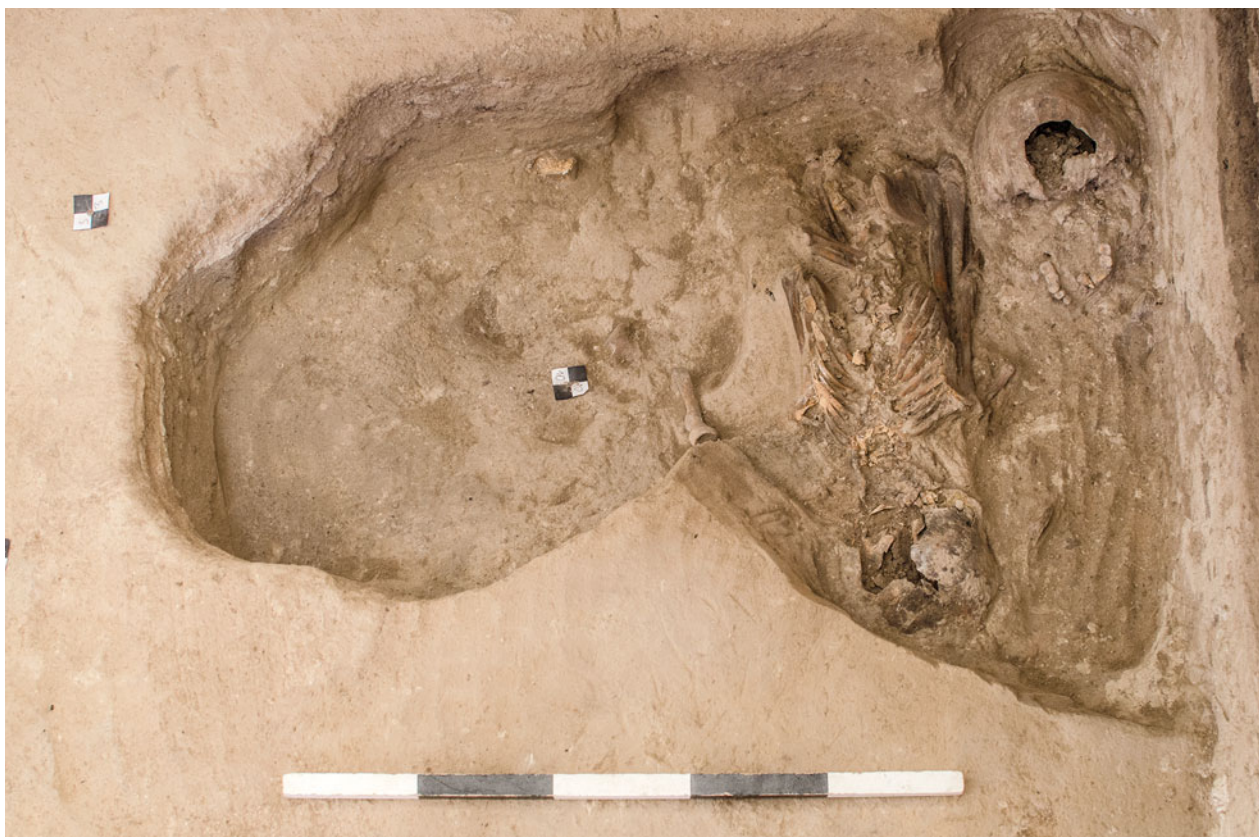
Figure S11.18. North-facing photograph of burial F.7419.