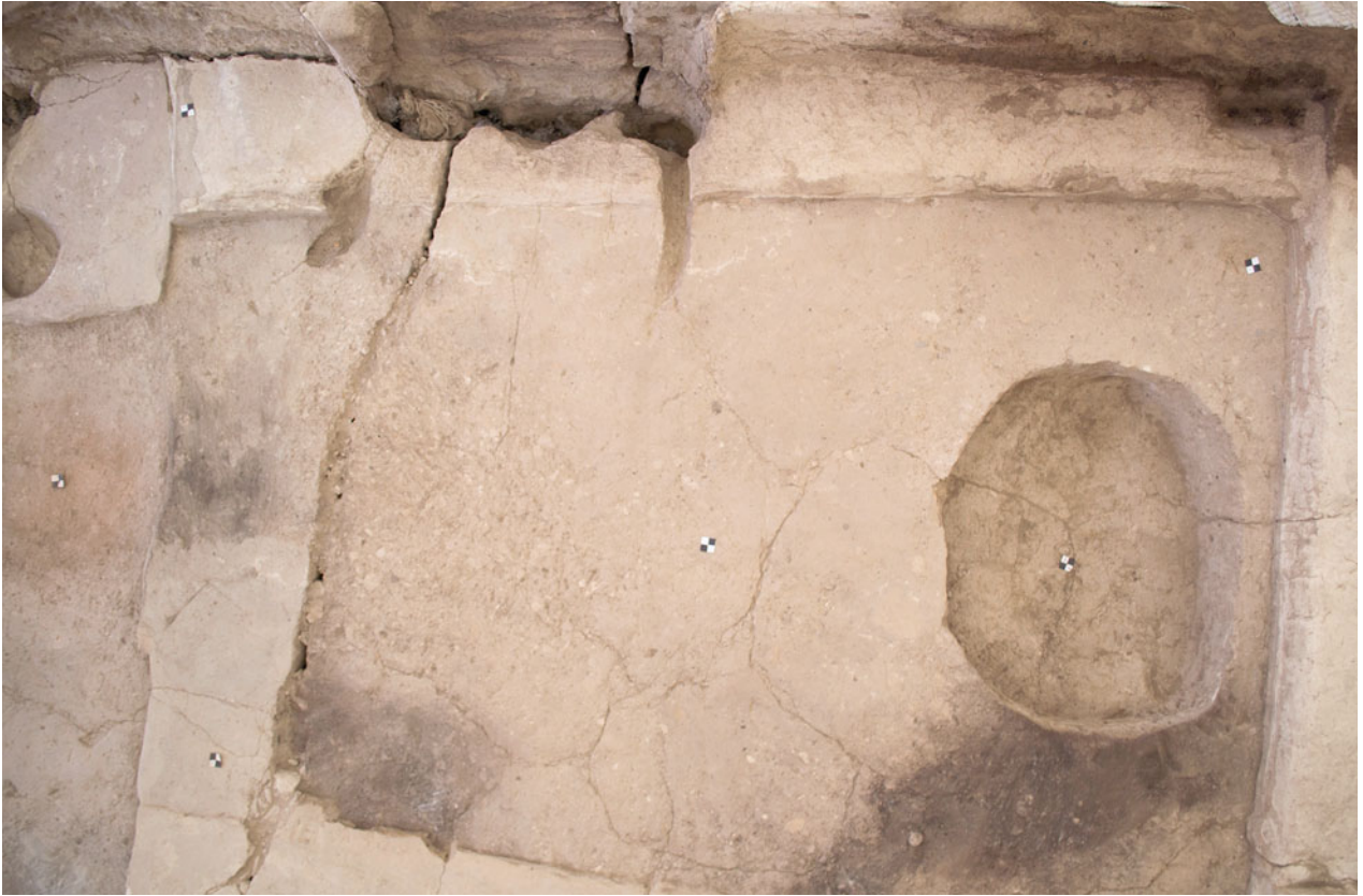
Figure S11.4. West-facing photograph detailing early make-up deposit in central space and the western curb in Sp.135 (top of image); note the group of three western postholes cutting through.