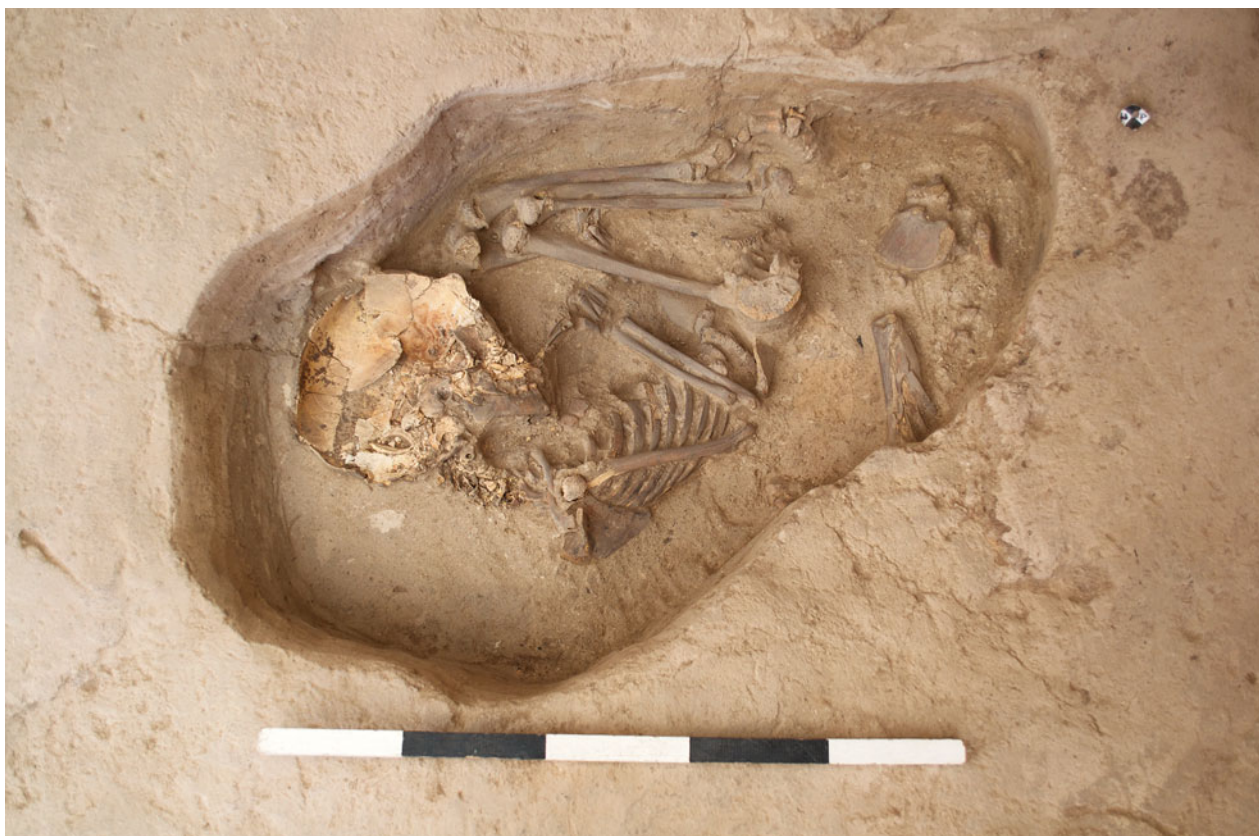
Figure S11.21. North-facing photograph of burial F.7404.