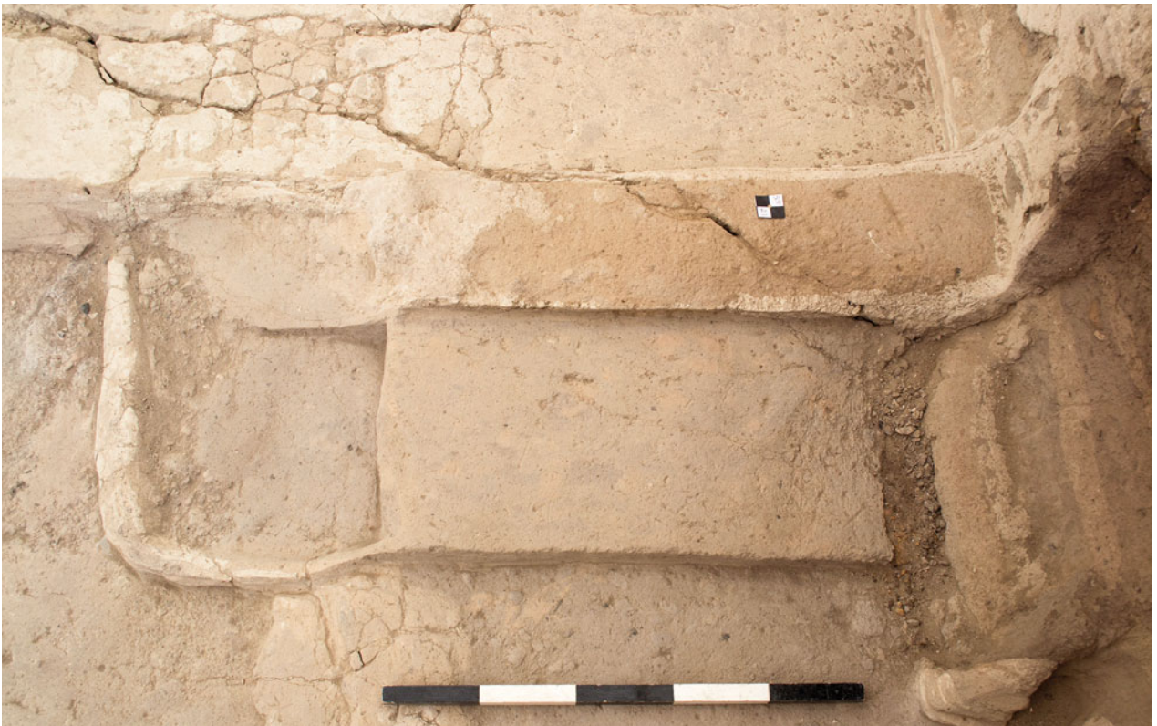
Figure S11.5 North-facing photograph showing mudbrick core (21263) of bench 'F.7249' and adjacent F.7435 in Sp.135.