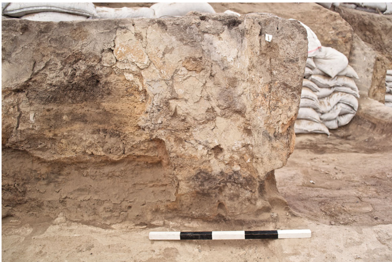
Figure S11.2. South-facing photograph showing detail of the internal dividing wall of B.80 (F.5037/F.5038).