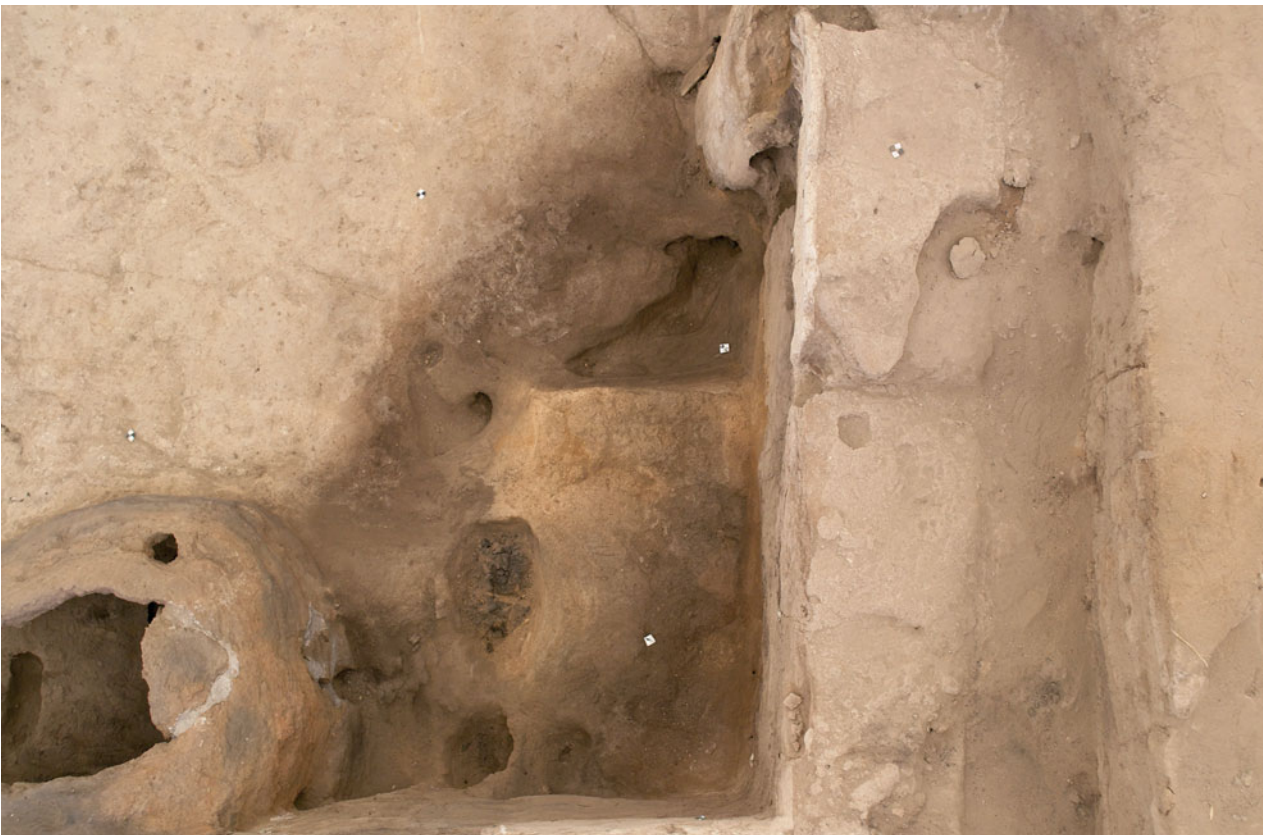
Figure S11.36. North-facing photograph of charred floor sequences (18977 and 20016) associated with the ladder platform F.7401.