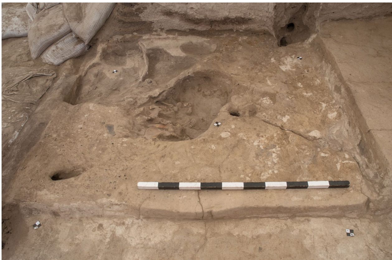
Figure S11.9. North-facing photograph showing make-up deposit 19155.