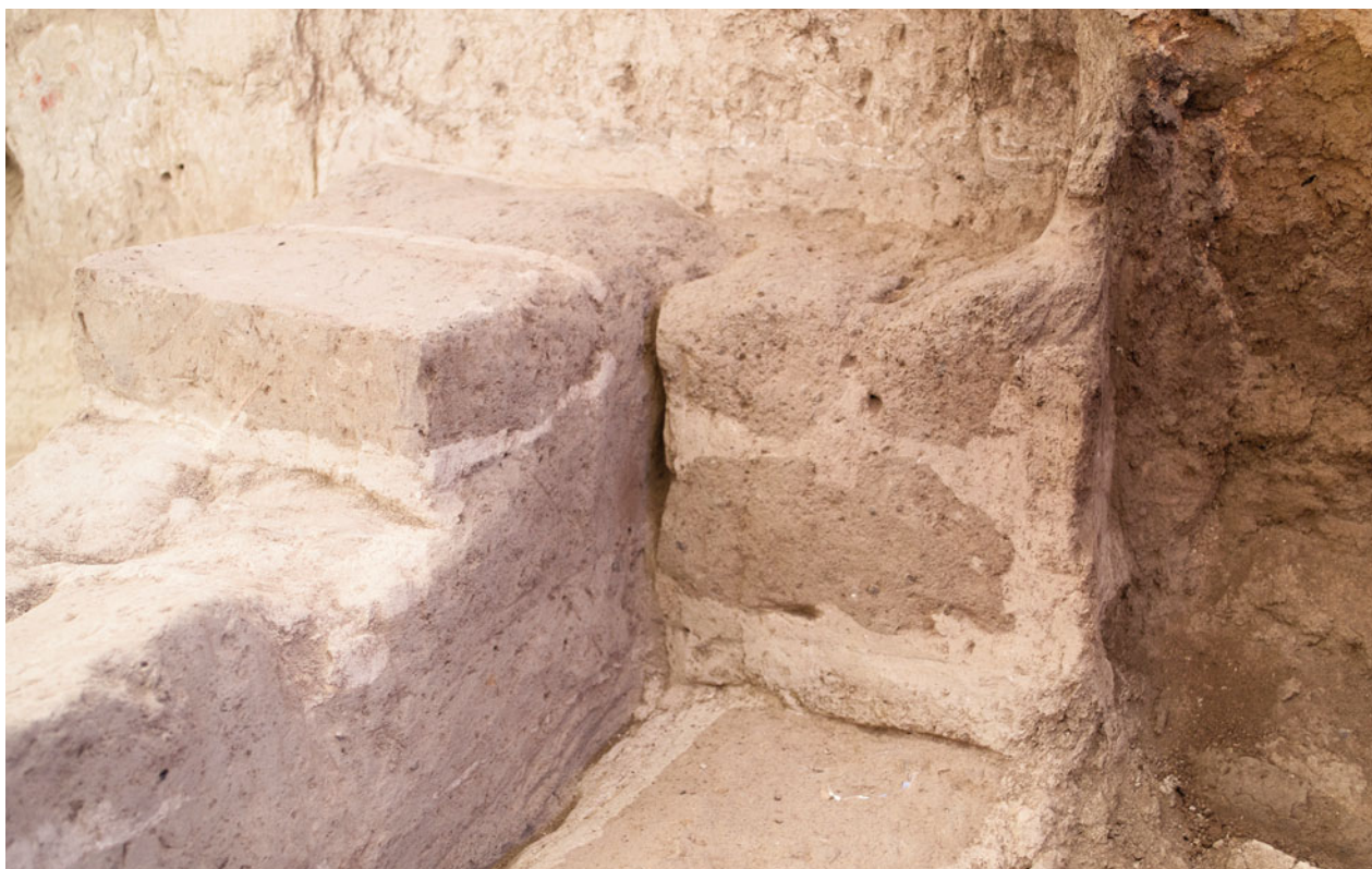
Figure S11.15. Northeast-facing photograph showing brick modification to bench structure (F.7416).