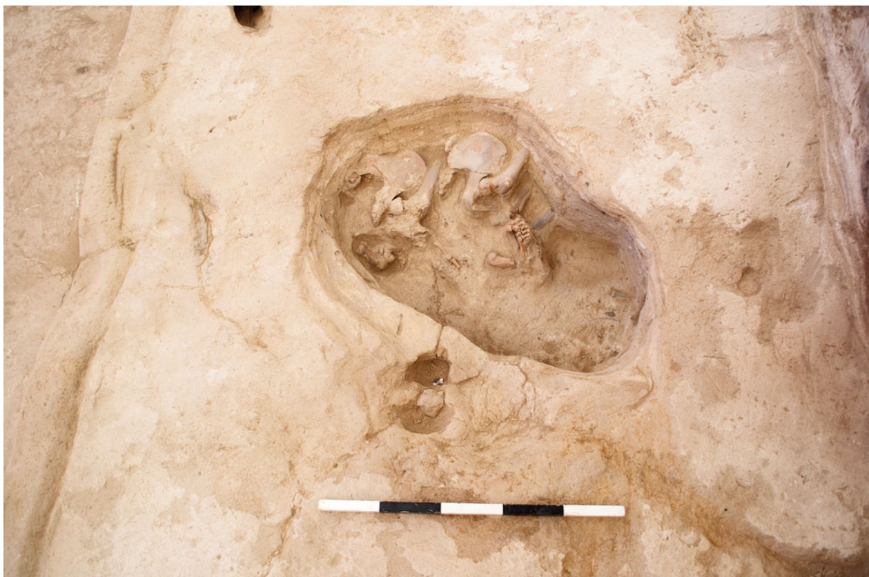
Figure S11.22. North-facing photograph of burial F.7400.