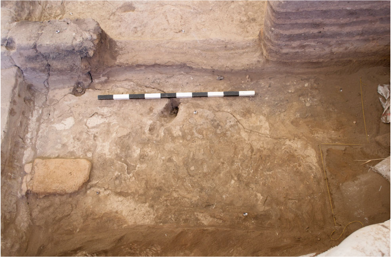
Figure S11.31. North-facing photograph of upper dirty floors (21739) in Sp.373.