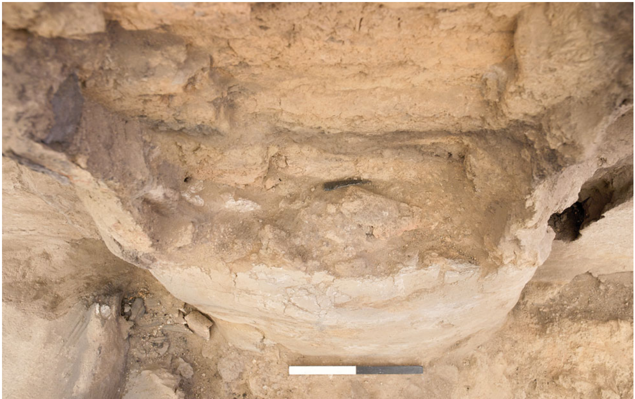
Figure S11.38. East-facing photograph showing the denticulated obsidian blade associated with the abandonment of post F.3428 (18939).