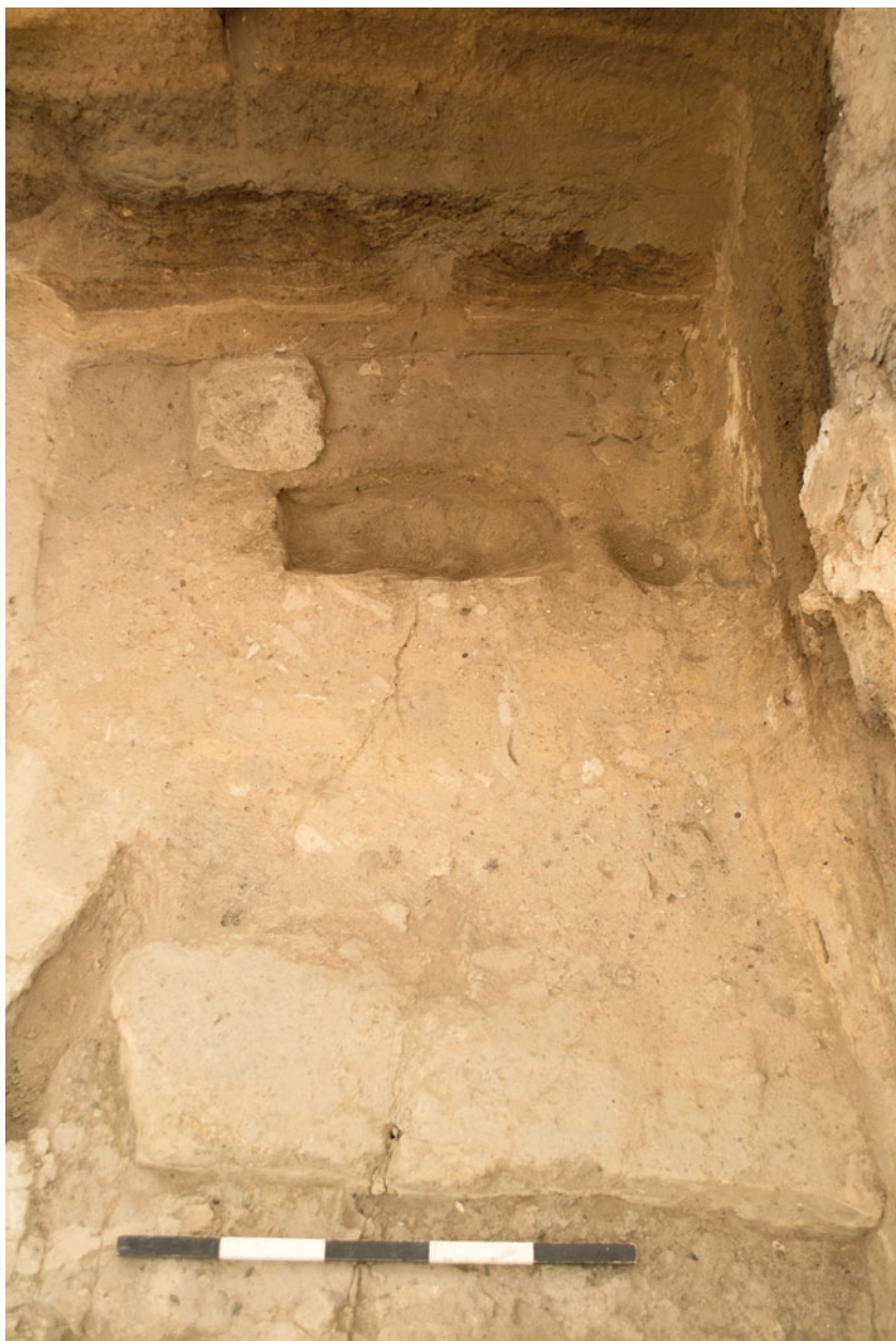
Figure S11.12. East-facing photograph showing earliest incarnation of the ladder platform F.7425 with detail of the ladder cut (19180).