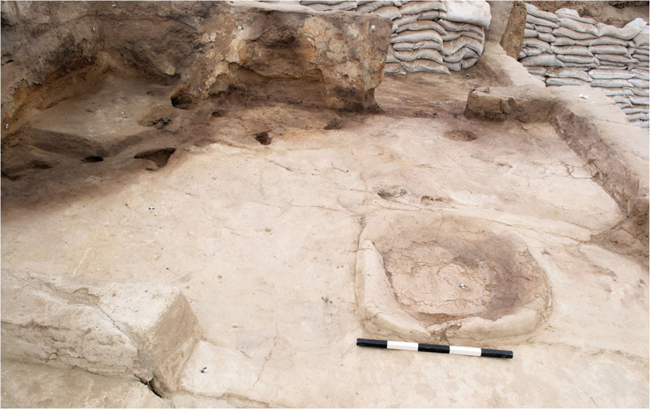
Figure S11.35. South-facing photograph of dirty floor (20038), south of hearth F.3436 at the southern end of Sp.135.