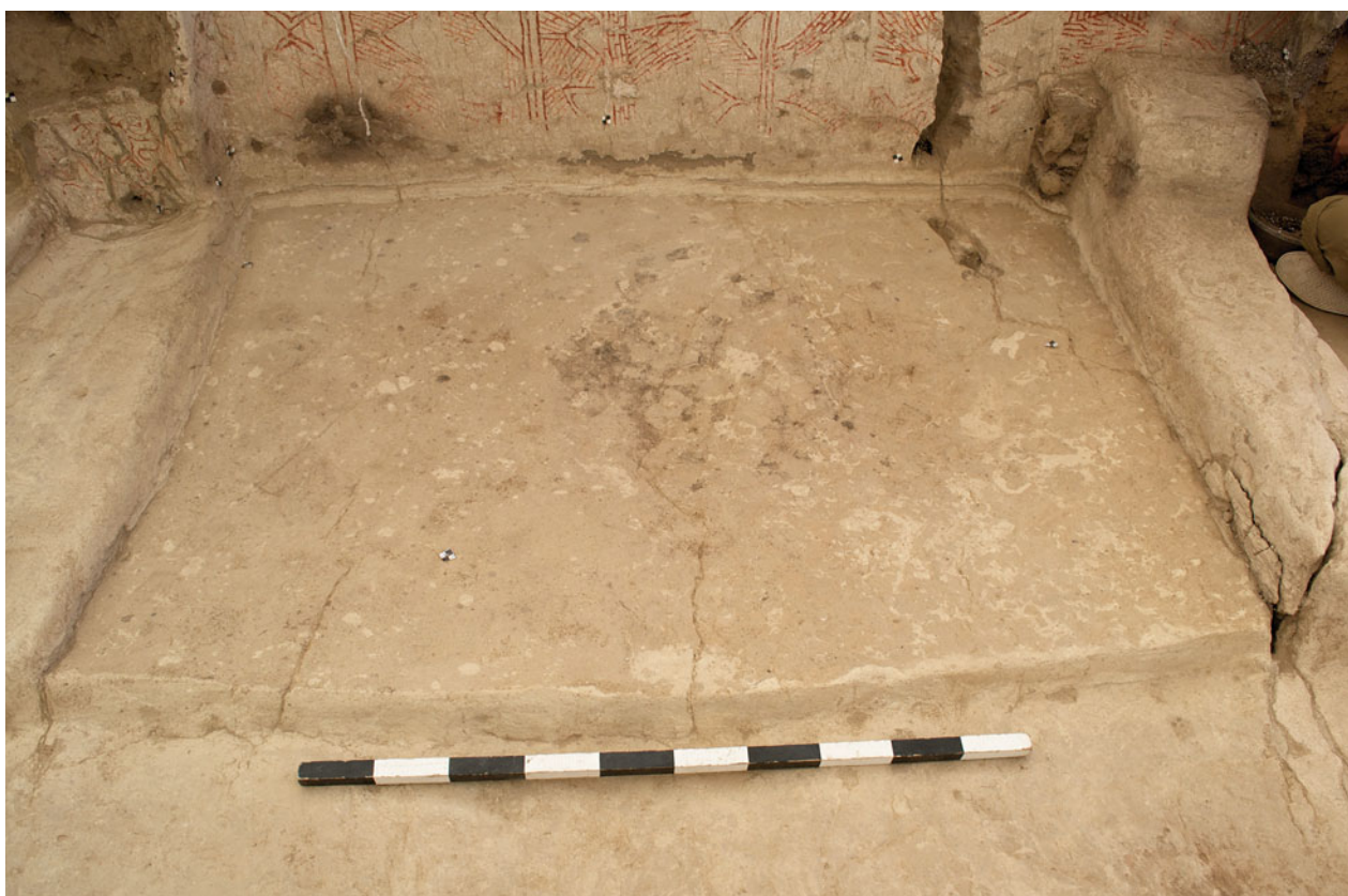
Figure S11.20. East-facing photograph of platform surface (20089), sealing earlier burial F.3440.