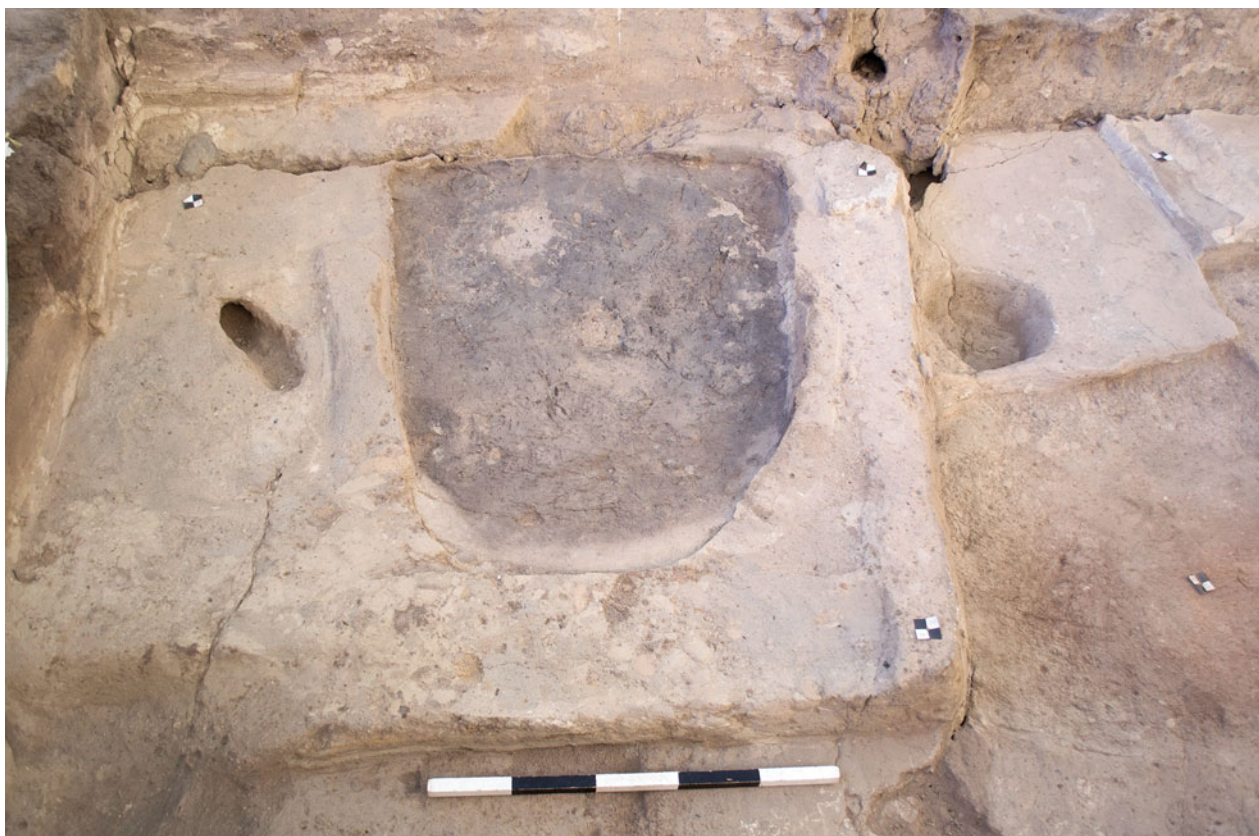
Figure S11.7. West-facing photograph showing oven F.7433.