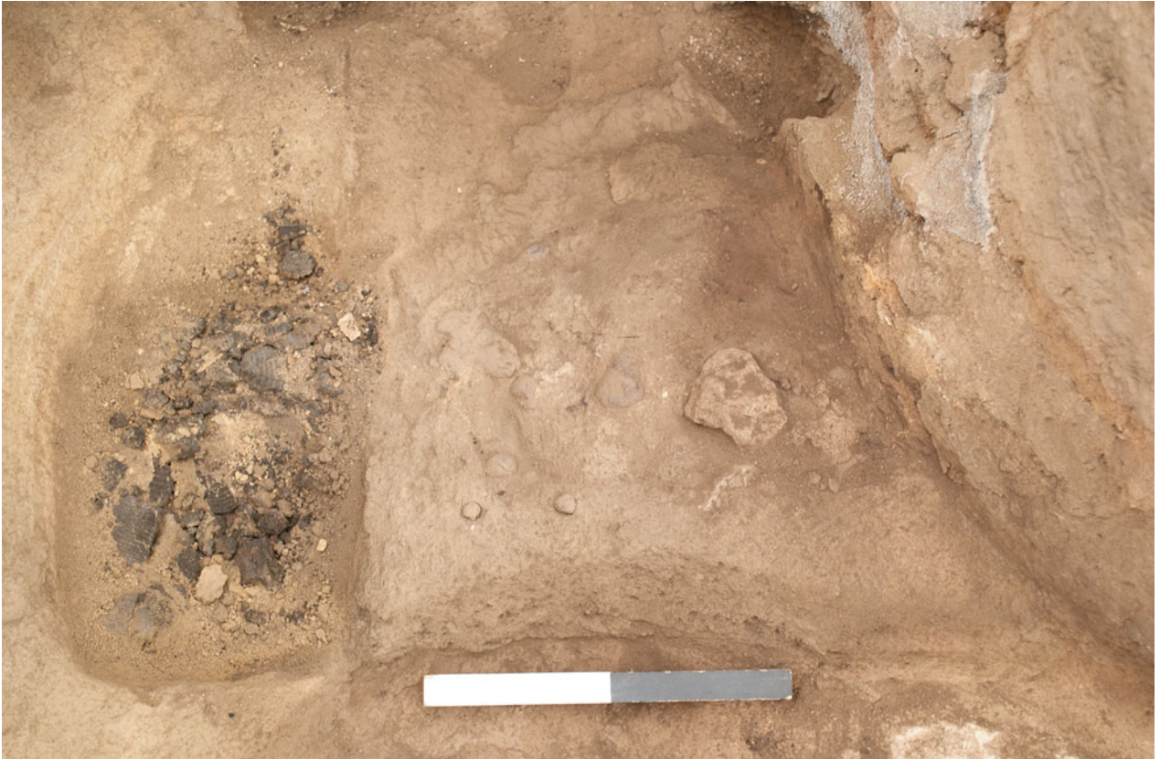
Figure S11.37. South-facing photograph detailing cluster of bone and mini clay balls (20020) situated between the ladder platform and oven.