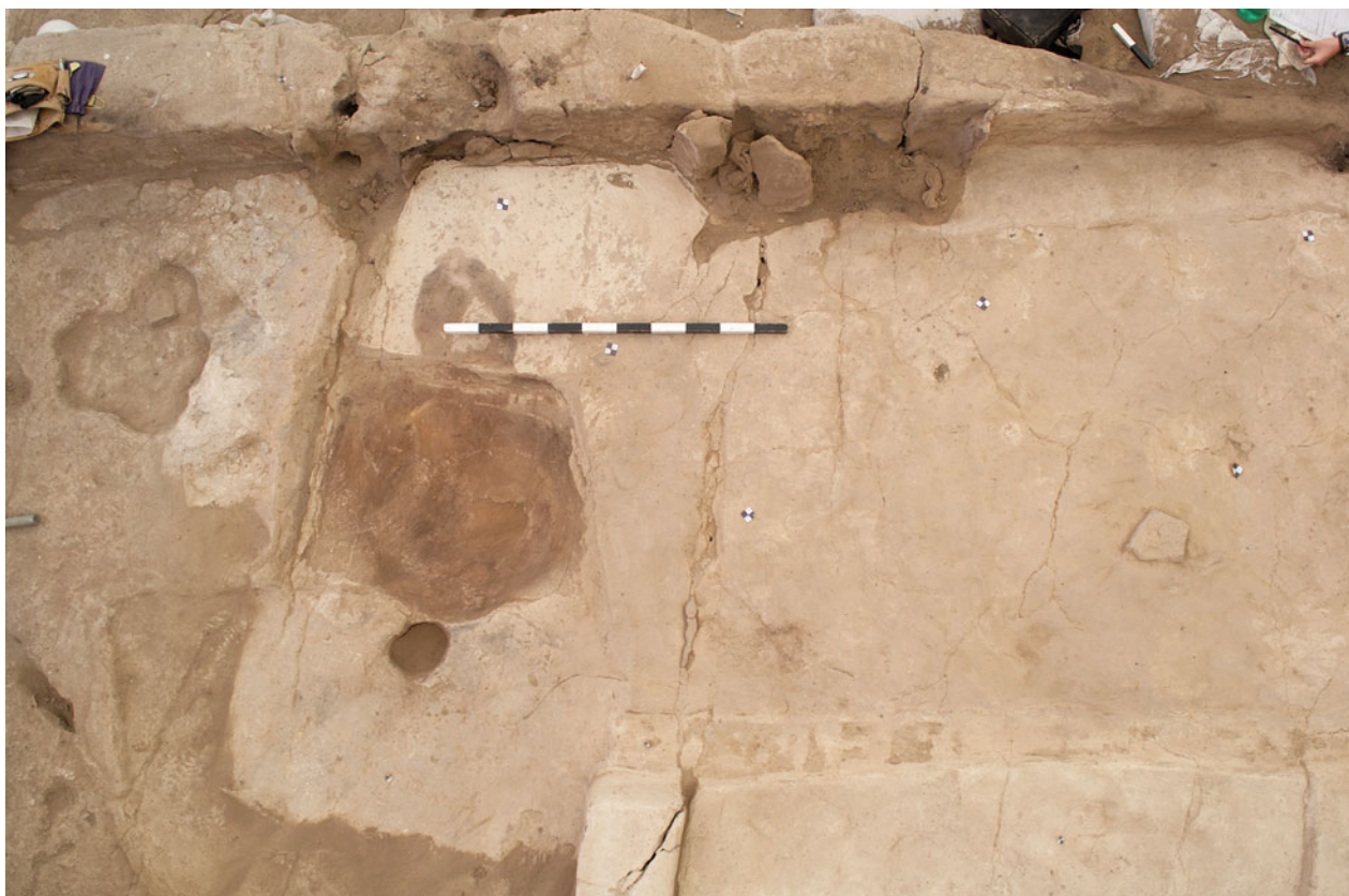
Figure S11.23. West-facing photograph of plaster floor (21758).