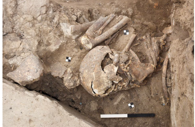
Figure 16.26. Northwest-facing photograph showing burial F.3458 skeleton (19224) and isolated human cranium (19235) found within infill deposit (19226) (photograph by Çatalhöyük Research Project).