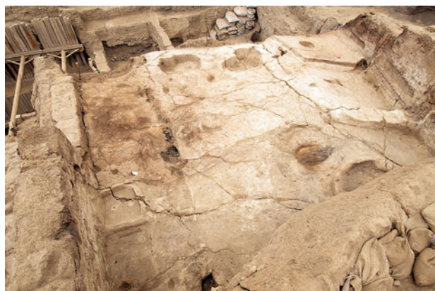
Figure 16.4. Northeast-facing photograph showing overview of the some of the earliest exposed occupation level of B.97.