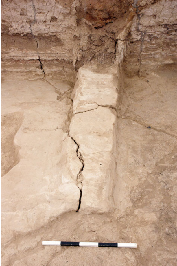
Figure 16.19. East-facing photograph of bench F.3456.