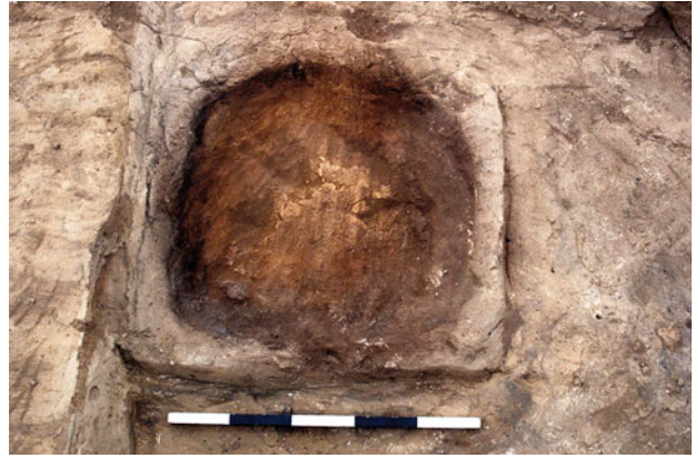
Figure 16.20. North-facing photograph showing hearth F.3530.