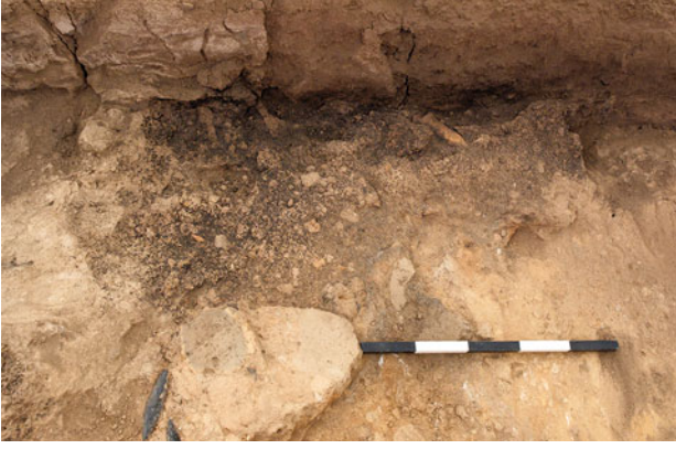
Figure 16.25. West-facing photograph showing charred grain cluster (19238).