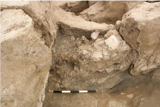
Figure 16.27. South-facing photograph showing burial cut (19225) and midden dumping in southeast corner of B.97.