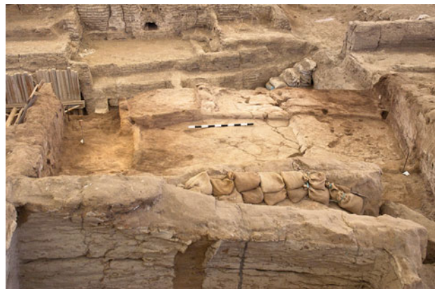
Figure 16.22. North-facing photograph showing overview of the building at abandonment including localised burning in its western half, possibly associated with the destruction of the partition wall.