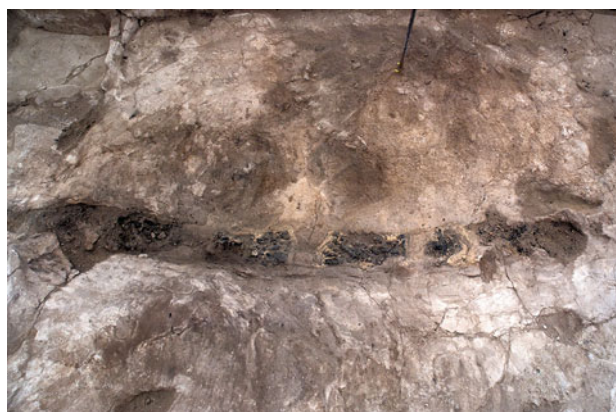
Figure 16.7. West-facing photograph showing burnt posts in partition wall F.3527.