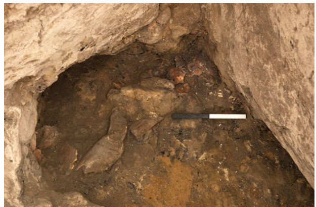
Figure 16.24. East-facing photograph showing the infill material (19245) in the southeast corner.