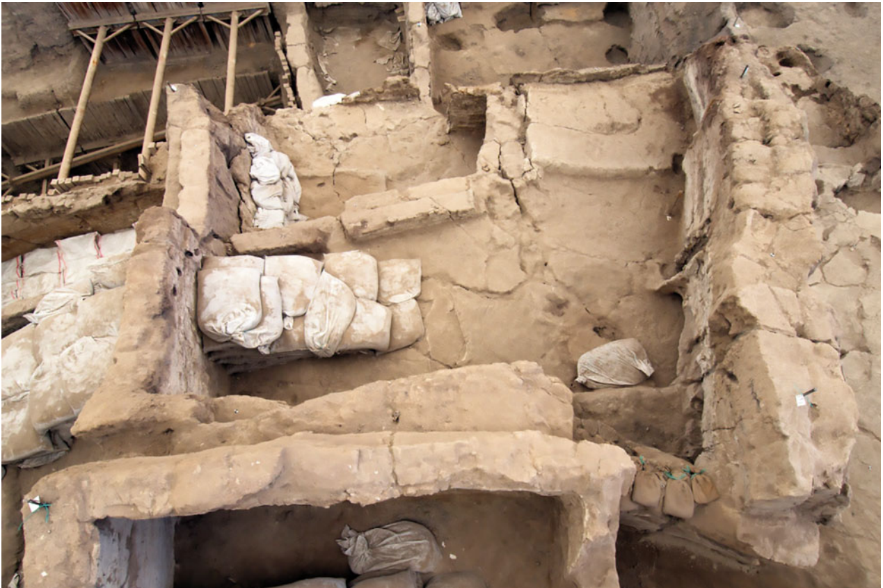
Figure 16.1. North-facing overview of B.97 post-excavation, with B.130 situated in the northwest corner.