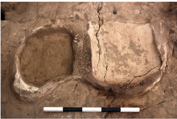
Figure 16.17. East-facing photograph showing bin F.3538.