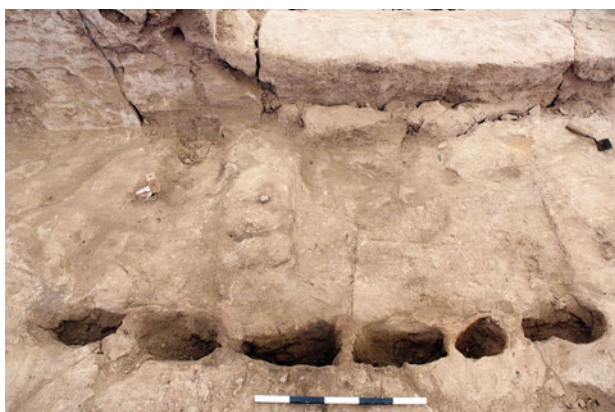
Figure 16.6. West-facing photograph showing detail of postholes that form the earliest construction event of partition wall F.3527.