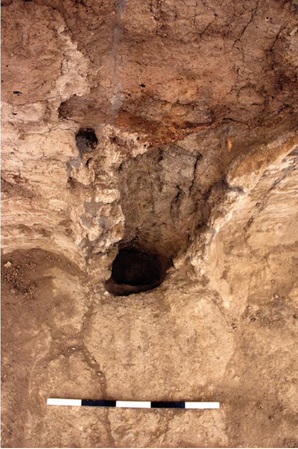
Figure 16.9. East-facing photograph showing detail of posthole, F.3556 (photograph Çatalhöyük Research Project).