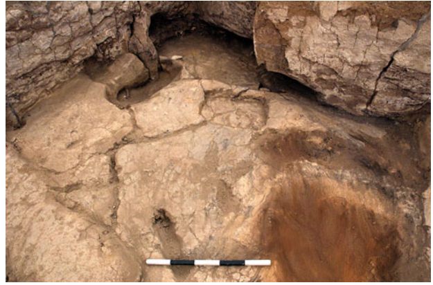
Figure 16.16. Southeast-facing photograph showing overview of the southeast corner of the space with ladder scar (18674).