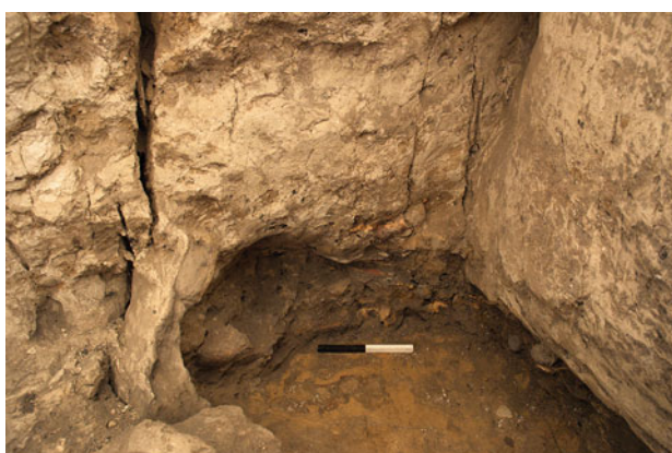
Figure 16.8. Southeast-facing photograph showing detail of niche in southern end of the eastern wall (photograph by Darko Maričević).