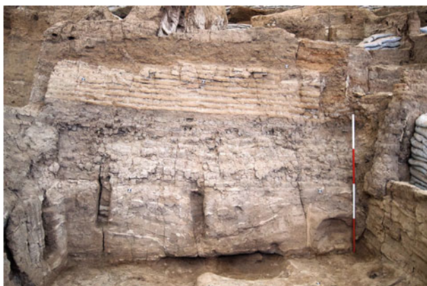
Figure 16.3. South-facing photograph showing overview of the large section including B.24's southern wall and B.130.