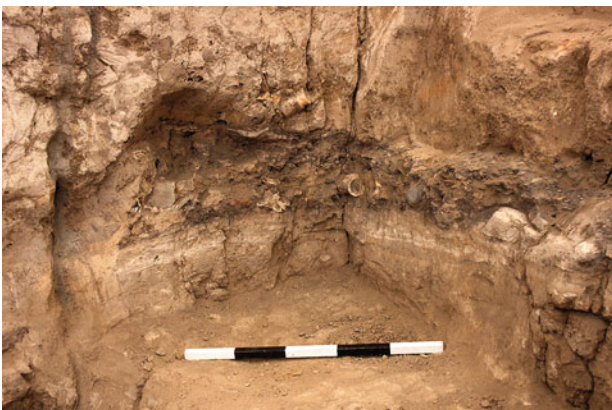
Figure 16.23. Southeast-facing photograph showing detail of midden material (20374) in the southeastern corner of the building.