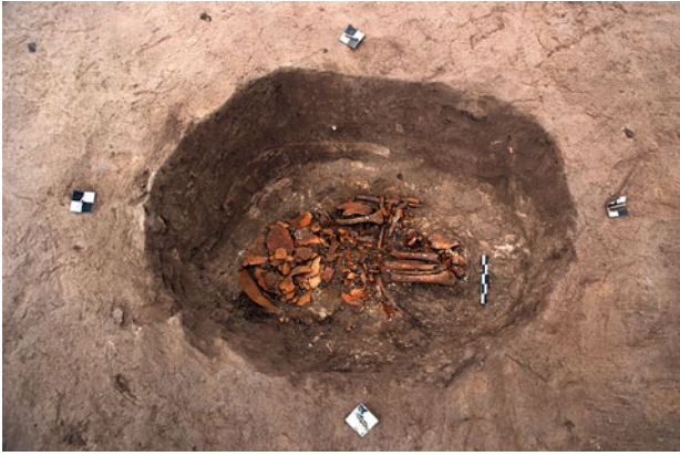
Figure 16.15. North-facing photograph showing detail of basket burial F.3542.