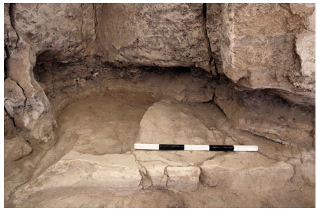
Figure 16.18. South-facing photograph showing bin (18665).