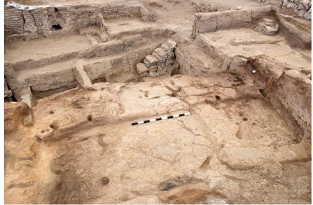
Figure 16.12. Northeast-facing photograph showing overview of benches and platforms in the northeastern corner of Sp.365, including F.3454, F.3457 and F.3547, post scar F.3451 and the north-central platforms, F.3455 and F.3459.