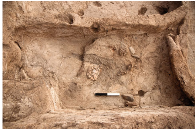
Figure 21.40. Burial F.7334 within the fill of platform F.7122. No cuts could be associated with the disturbed infant skeleton which seems to have been placed on the floor of platform F.2177, within the division created by F.7316 and F.7315. Facing south.