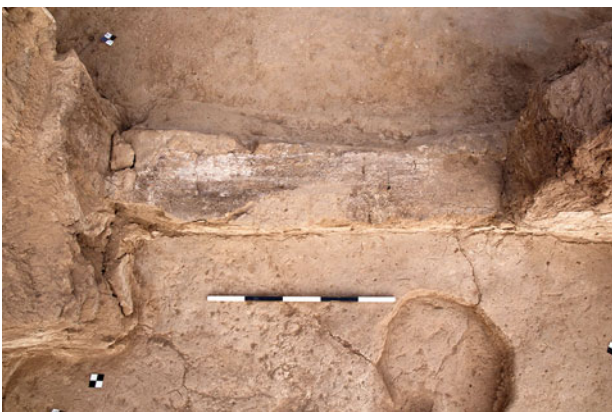
Figure 21.16. Wooden beam (22234) in passageway F.7754.