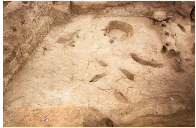
Figure 21.33. Overview of southwestern platform F.2177 with bench F.2118 and floors (30519). Facing west.