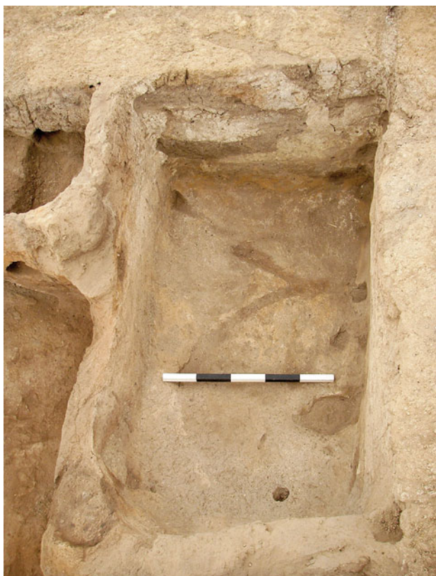
Figure 21.18. Bin F.2003 in 2008, after its fill had been completely removed. Facing east.