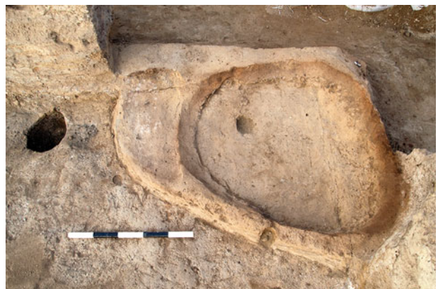
Figure 21.17. Remnants of superstructure (23420) of oven F.8504 in the southwestern corner of Sp.576. Facing south. The slight depression by the mouth of the oven would have been a hearth area. Immediately to the left of the fire installation is pit F.8503, which is likely where the entry ladder rested.