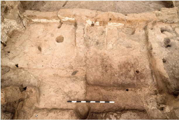
Figure 21.14. West-facing photograph of western activity area with platforms F.7637, F.7638 and bench F.8507.