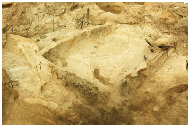
Figure 21.35. Overview of the two partitioned spaces created by the construction of divisions F.7315 and F.7316 on top of platform F.2177.