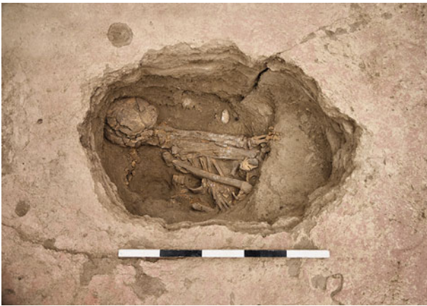
Figure 21.39. Burial F.7112 of middle adult female (20655), facing north.