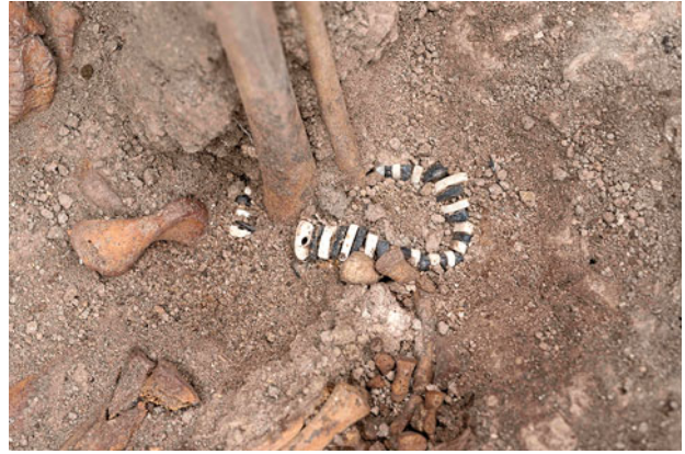
Figure 21.11. Detail of the bead anklet found with infant (23805) within burial F.8516.