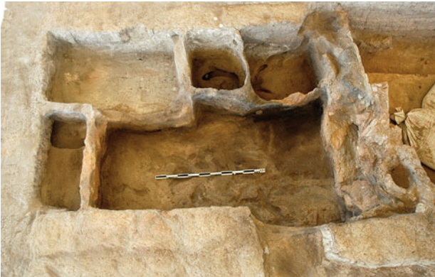
Figure 21.4. Space 93 in Building 52 showing bins.