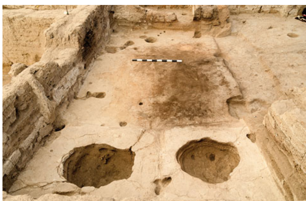
Figure 21.22. The eastern end of Space 94, with platforms F.7605 and F.7617 and floors (23468), (34461) and (21393). The fire damage from the building's closure seeped deep into the central floor area, as evident from the burnt central region. Facing south.