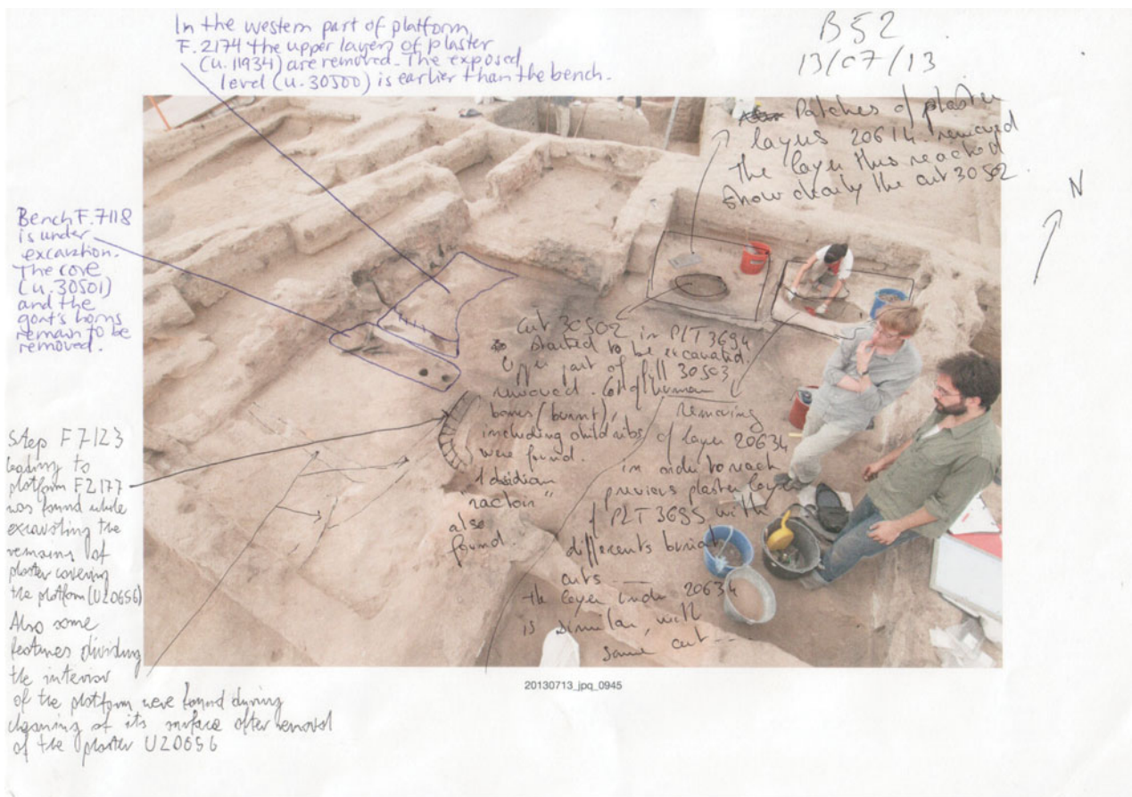
Figure 21.34. Daily sketch by Rémi Hadad showing burial cuts in north of the main room and some of the relationships around bench F.7118, including the appearance of divisions in the southwest platform F.2177 (see fig. 21.35).