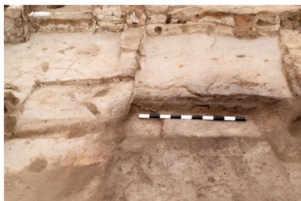
Figure 21.23. The western activity area in B.52 Phase 3. Facing west.