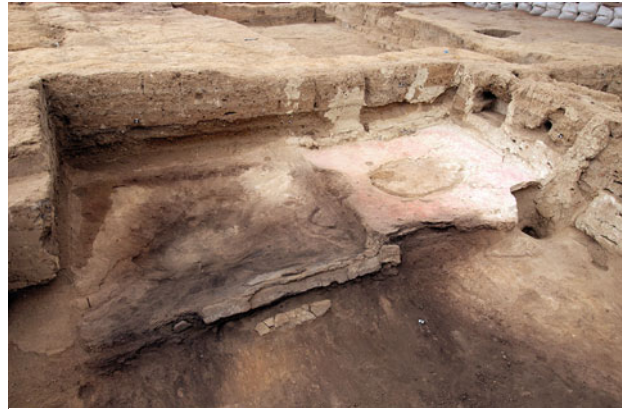
Figure 21.38. Red-painted plastered floor (30504) on northeastern platform F.3695, clearly truncated by cut F.7121 and burial F.7122.