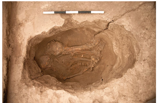
Figure 21.31. Burial F.7120 within platform F.3695. Facing north.