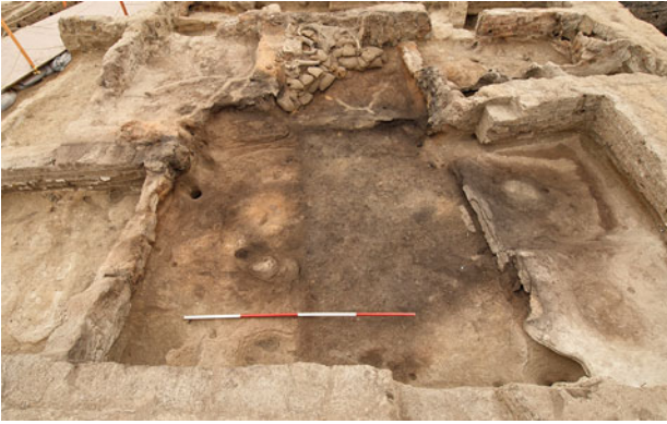
Figure 21.3. Overview of Space 94, pre-excavation 2013. The erosion on the surfaces of the platforms and the undercutting of the walls is clearly evident.