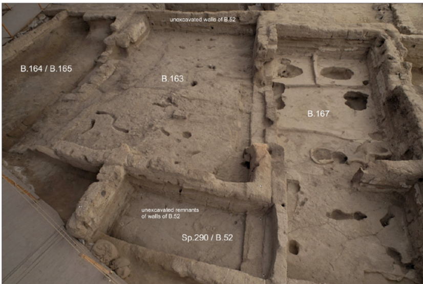
Figure 21.7. Overview of B.163, B.165 and B.167.