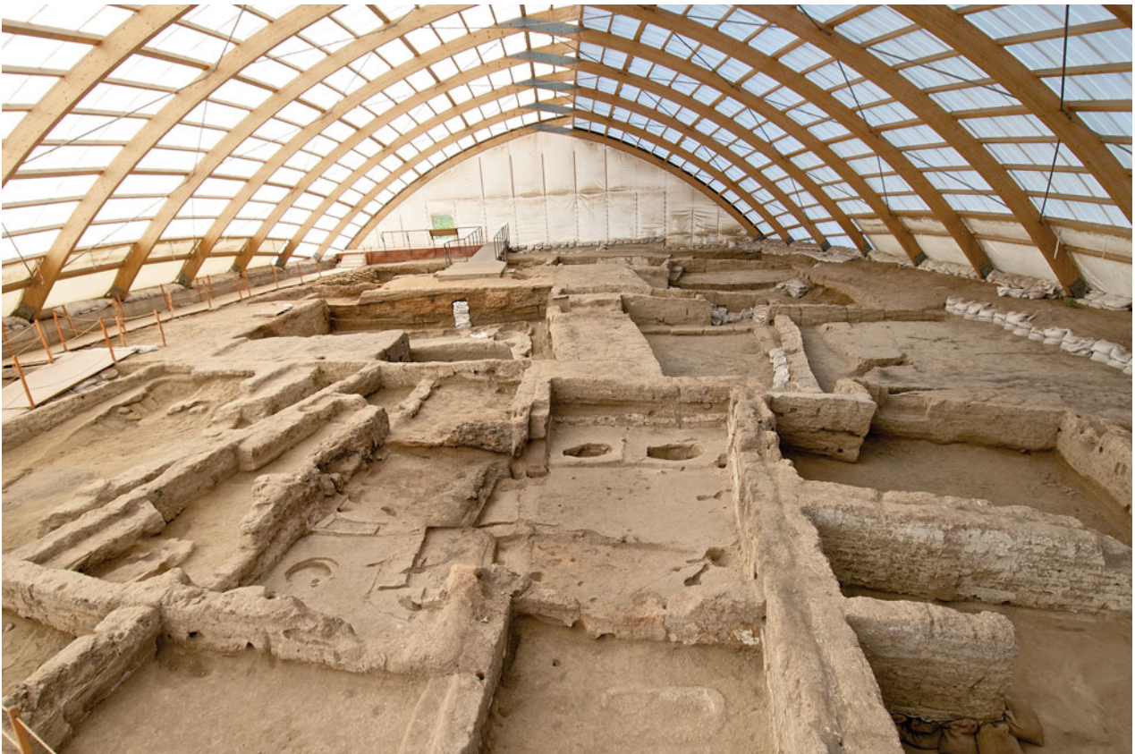
Figure 21.1. Overview of Building 52 within the North Shelter.