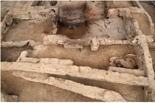
Figure 21.37. Overview of Sp.91/92 at the beginning of the 2015 excavation season, prior to the excavation of wall F.2185. Oven F.4060 sits prominently at the south-western end of the space.