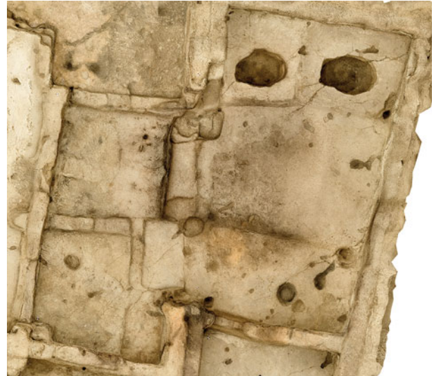
Figure 21.26. Orthophoto of Sp.94 with all the post scars (orthophoto by Jason Quinlan).