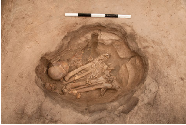
Figure 21.42. Middle adult male (30514) within burial F.7127. Facing north.