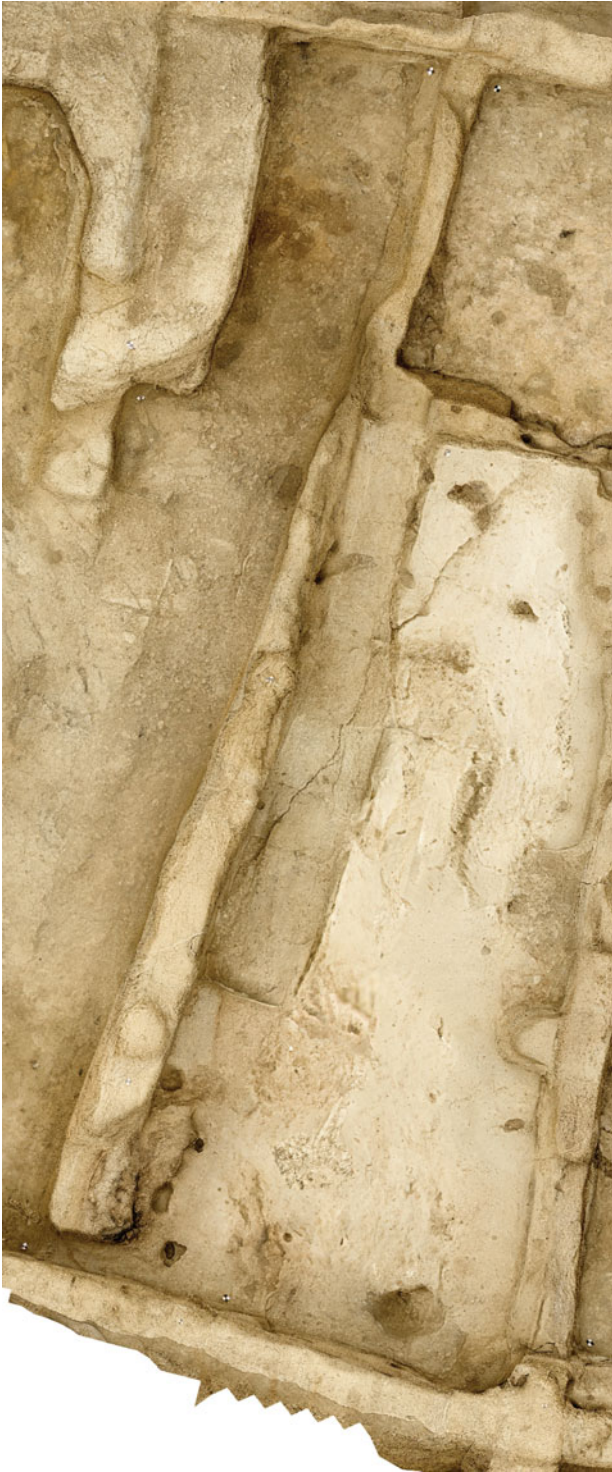
Figure 21.27. Orthophoto of foundation trench cut (31402) for the construction of wall F.2183. The southern end of wall F.2140 is also truncated by the construction of the southern wall of Sp.90, F.2139, which was bonded to F.2183. The foundation trench for F.2139 was recorded on the southern side of F.2139 as cut (16755) in 2008.