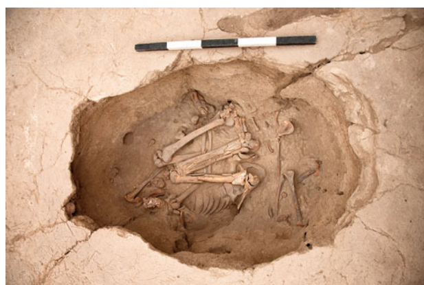
Figure 21.21. Burial F.7606 of young adult female (21526) within platform F.7605, facing north.