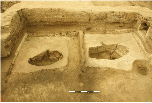
Figure 21.32. Overview of the northern activity area in Sp.94. To the left is platform F.3694 and truncation F.7323. To the right is platform F.3695 and kerb F.3693. Facing north.