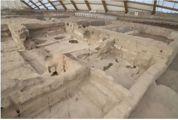
Figure 21.9. Building 167 at the end of the 2017 excavation season.