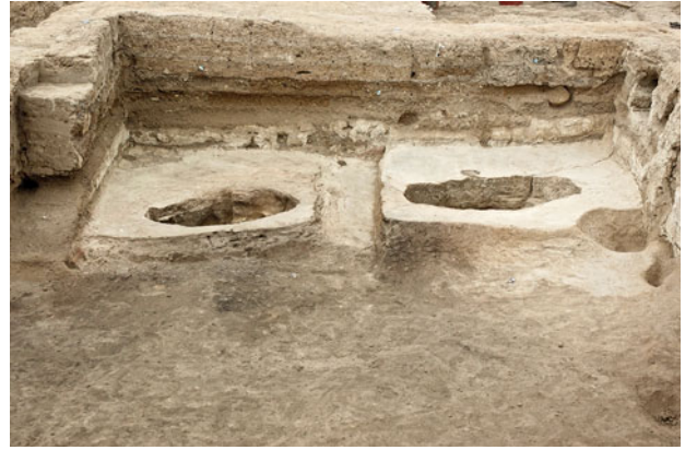
Figure 21.28. Platforms F.3694 and F.3695, B.52 Phase 4.2.