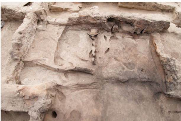
Figure 21.41. Overview of the western activity area within Sp.94 at the end of B.52 Phase 5.2. Access F.2109 is in line with the short-lived mini-platform created by the filling of divisions F.7315 and F.7316.