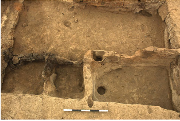
Figure 21.24. Bins F.2005 and F.2004, immediately south of F.2003. Facing west.