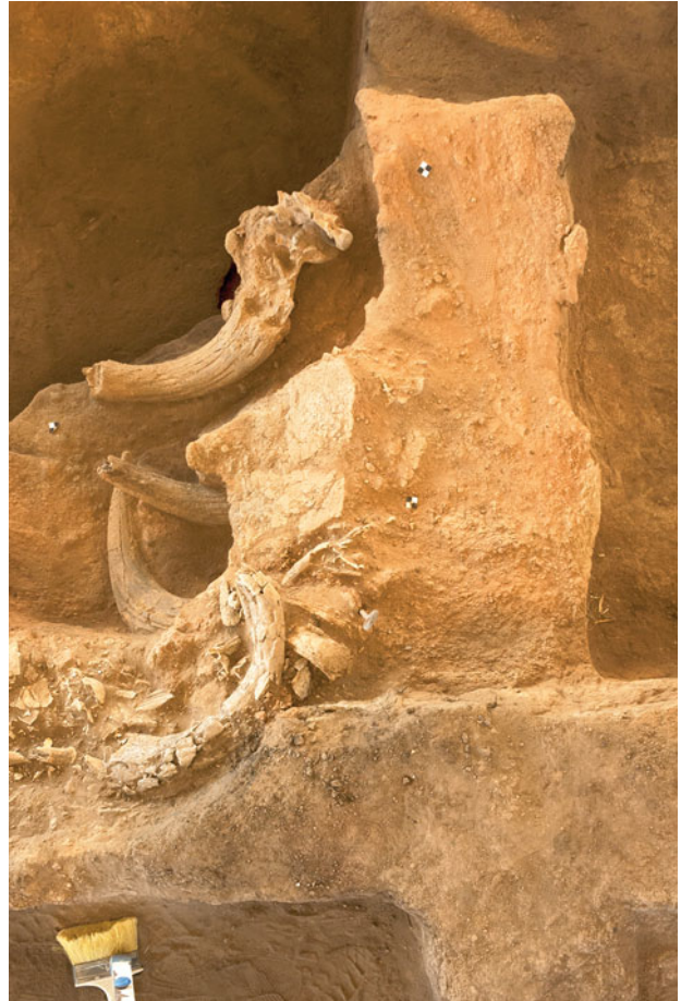
Figure 21.45. Bench F.2021 in 2005. The collapsed horns were clearly attached to the top of the bench. Facing east.