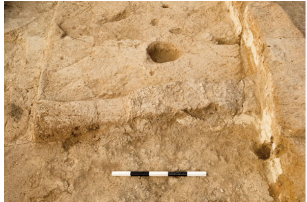
Figure 21.15. Bench F.8507, with extension (23439) and core (23440). Facing south.