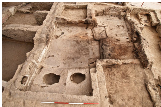
Figure 21.20. Overview of Sp. 94 at the end of B.52 Phase 3. Facing south.