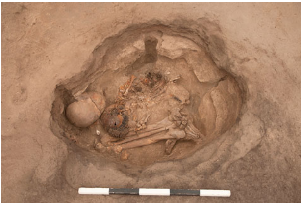
Figure 21.43. Combined image showing some of the skeletons placed on adult within burial F.7127.