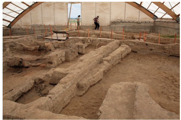
Figure 21.29. Wall F.2183 cutting wall F.2140. Facing south.