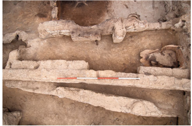
Figure 21.5. Spaces 91 and 92 showing oven.