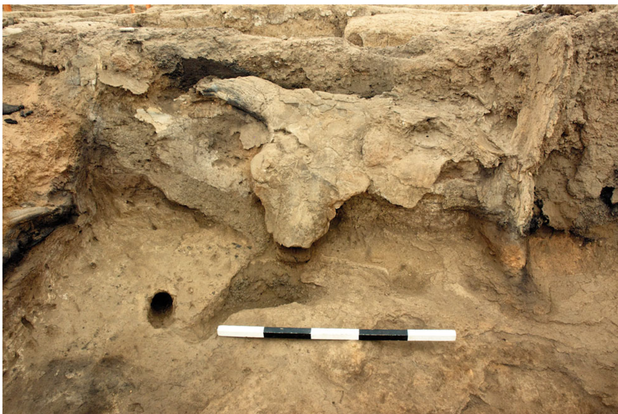
Figure 21.36. Bucranium (11963) before lifting, in 2013. Facing west.