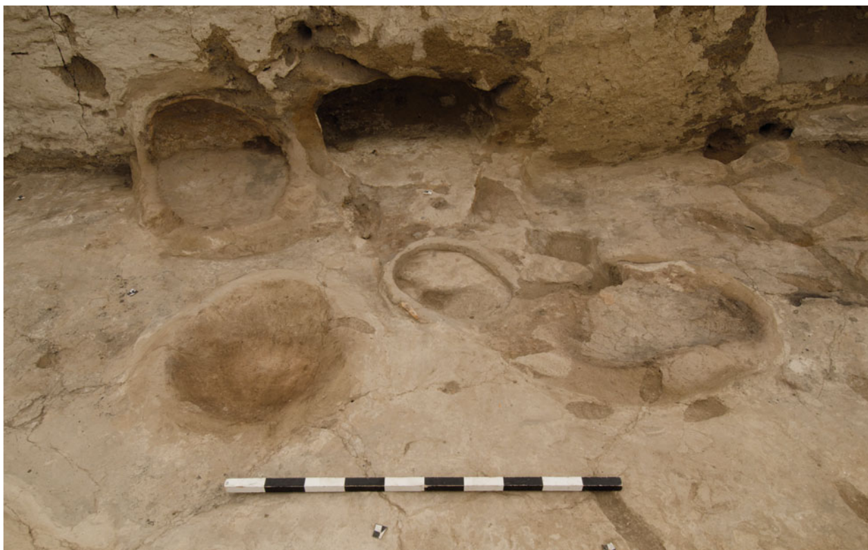
Figure S31.16. South-facing overview of the southern activity area. The far-left oven is F.7854 and next to it niche F.7855. To the front left is hearth F.7871, with bin F.7867 in the centre and to the right oven F.7868.