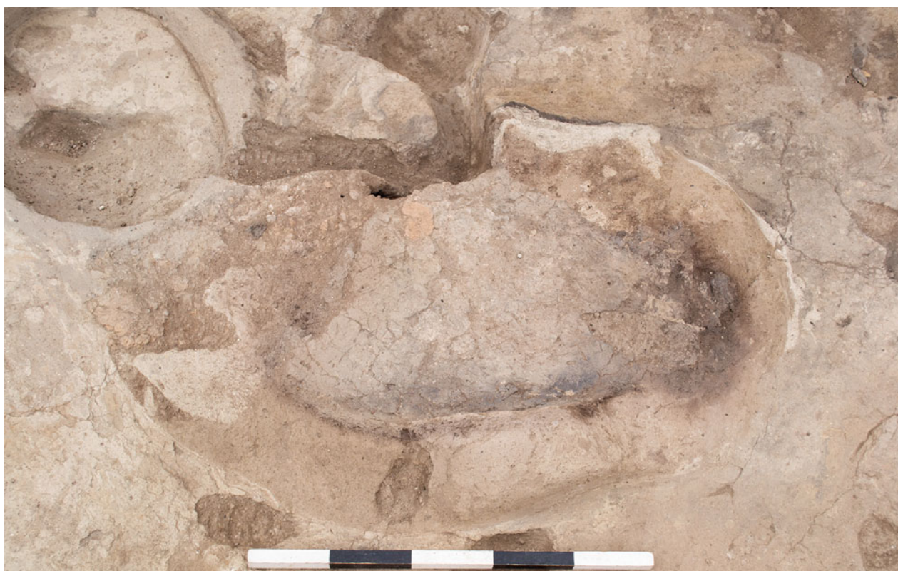
Figure S31.17. East-facing view of severely truncated fire installation F.7868.