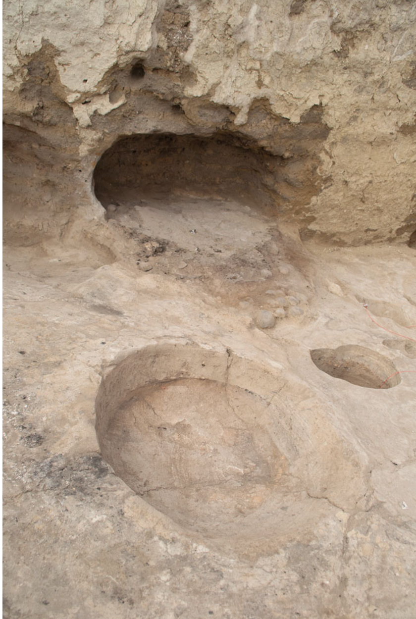
Figure S31.7. Hearth F.7871 with rim (32703) and oven F.7732 in the background.