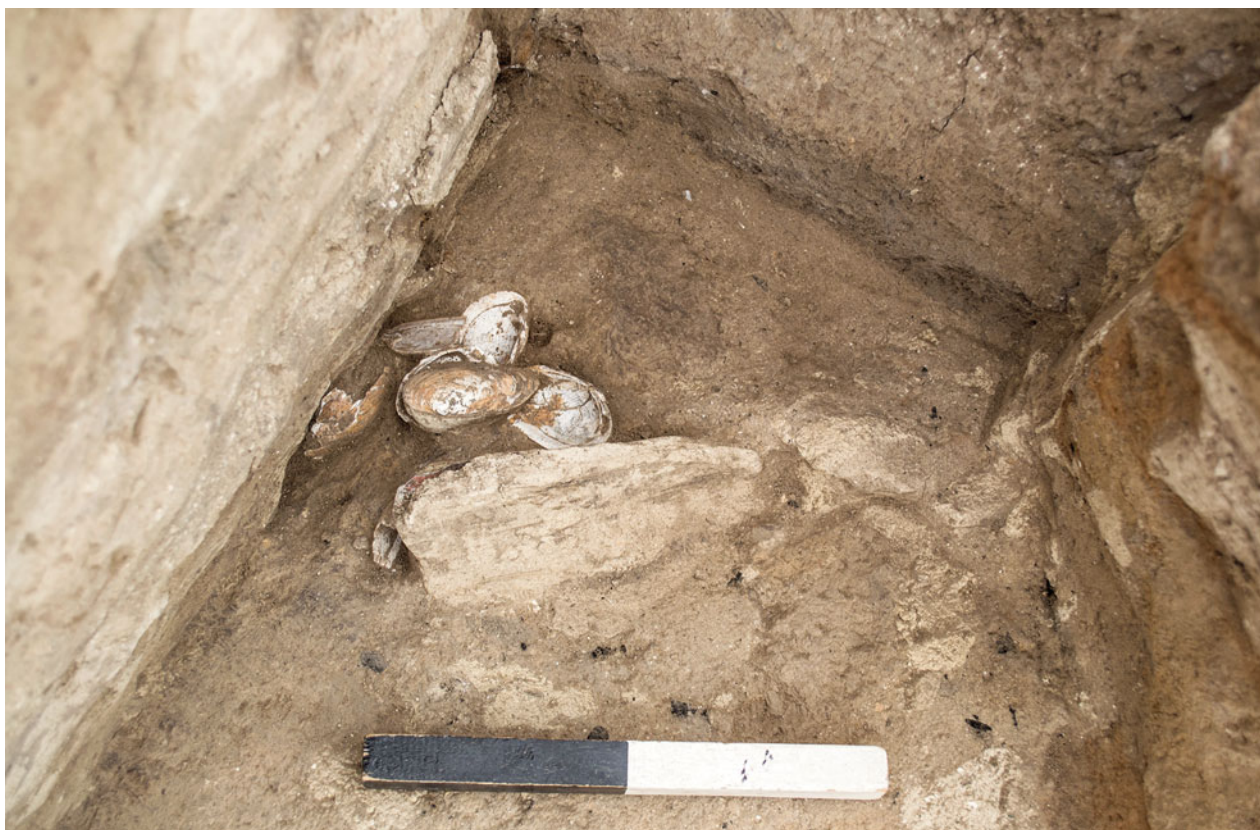
Figure S31.23. A group of Unio shells within cluster (31585).