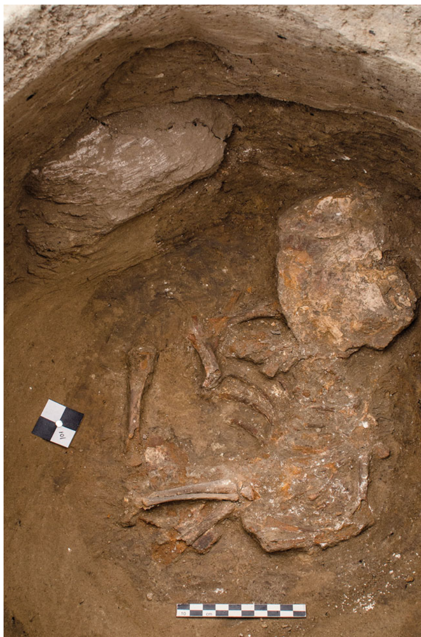
Figure S31.15. North-facing view of burial F.7738. A basket imprint abuts the edge of the cut for skeleton (32043).