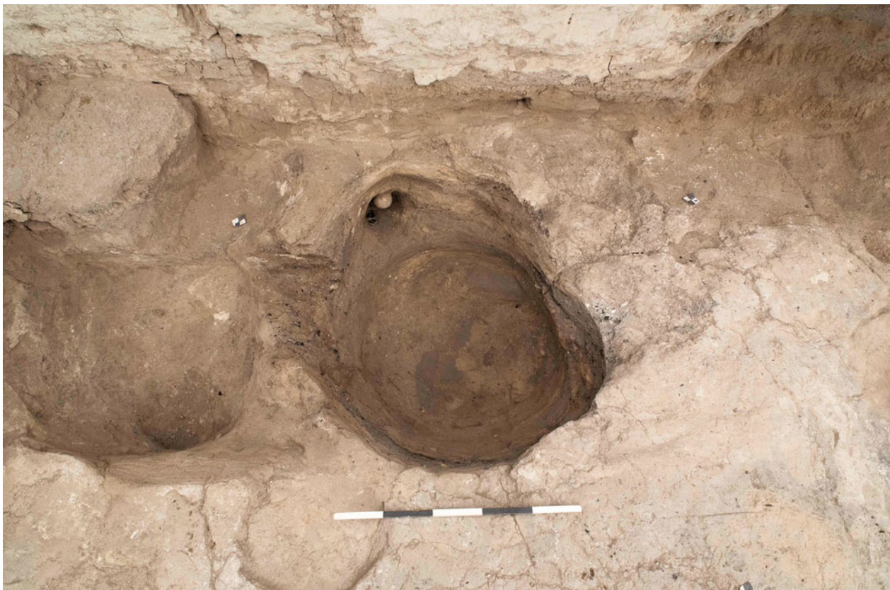
Figure S31.6. Pit F.8330 with cluster (32775) on the side of its cut.