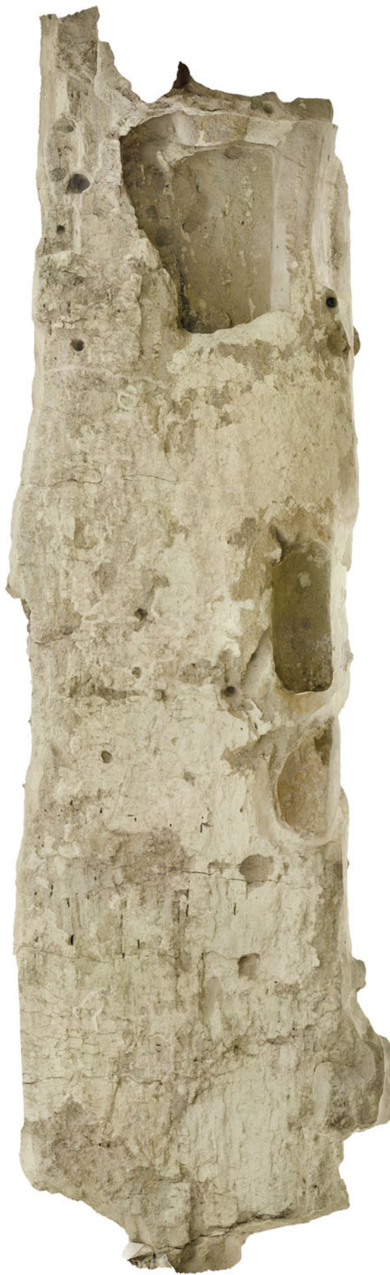
Figure S31.1. Orthophoto of the southern wall of Sp. 633/531 (based on a 3D model made by Jason Quinlan)