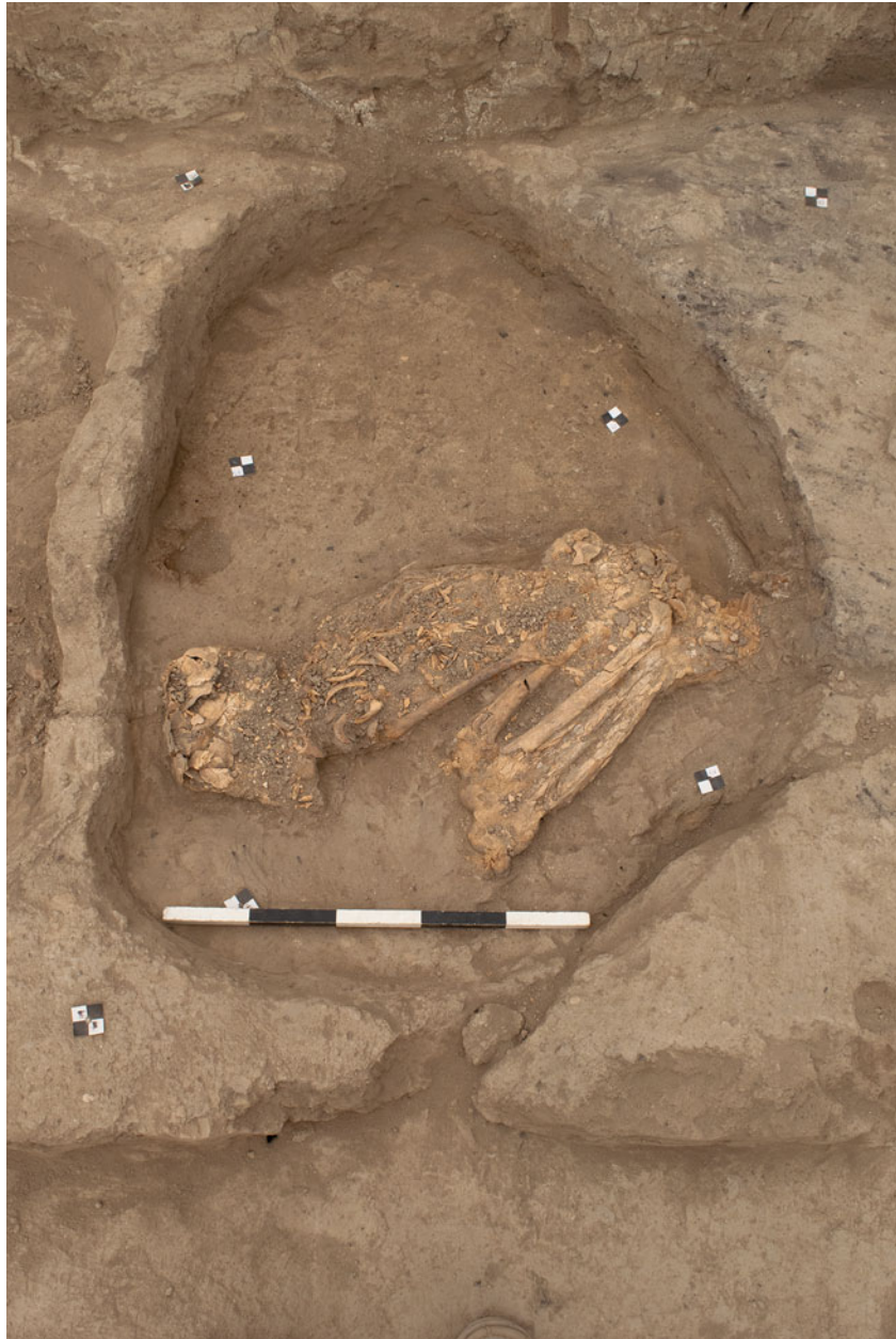
Figure S31.28. North-facing view of burial F.7864 of skeleton (21691).