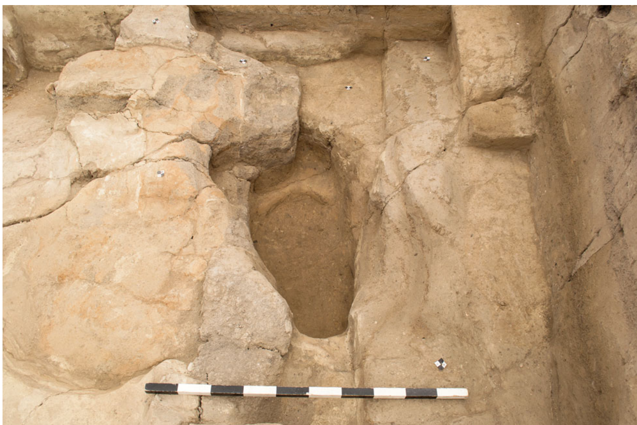
Figure S31.24. North-facing view of cut (31582) for post-retrieval pit F.7725.