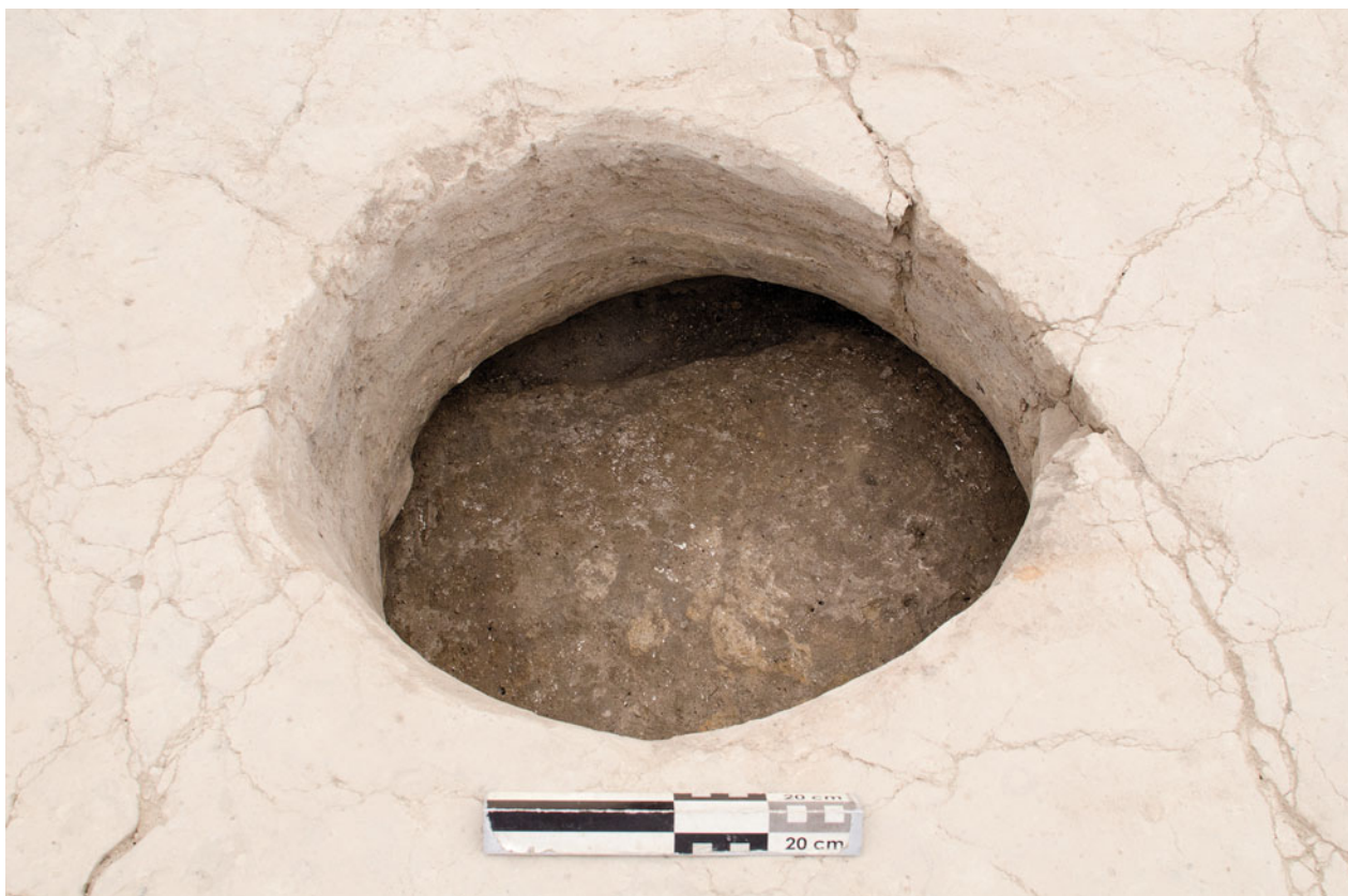
Figure S31.14. Central post hole F.7740.