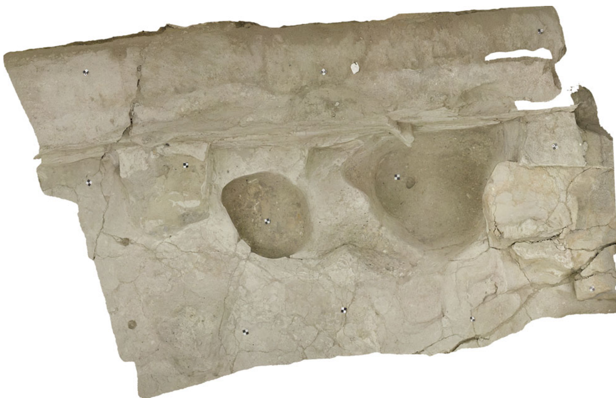
Figure S31.22. Orthophoto of post retrieval pit F.7724 (pit to the right).