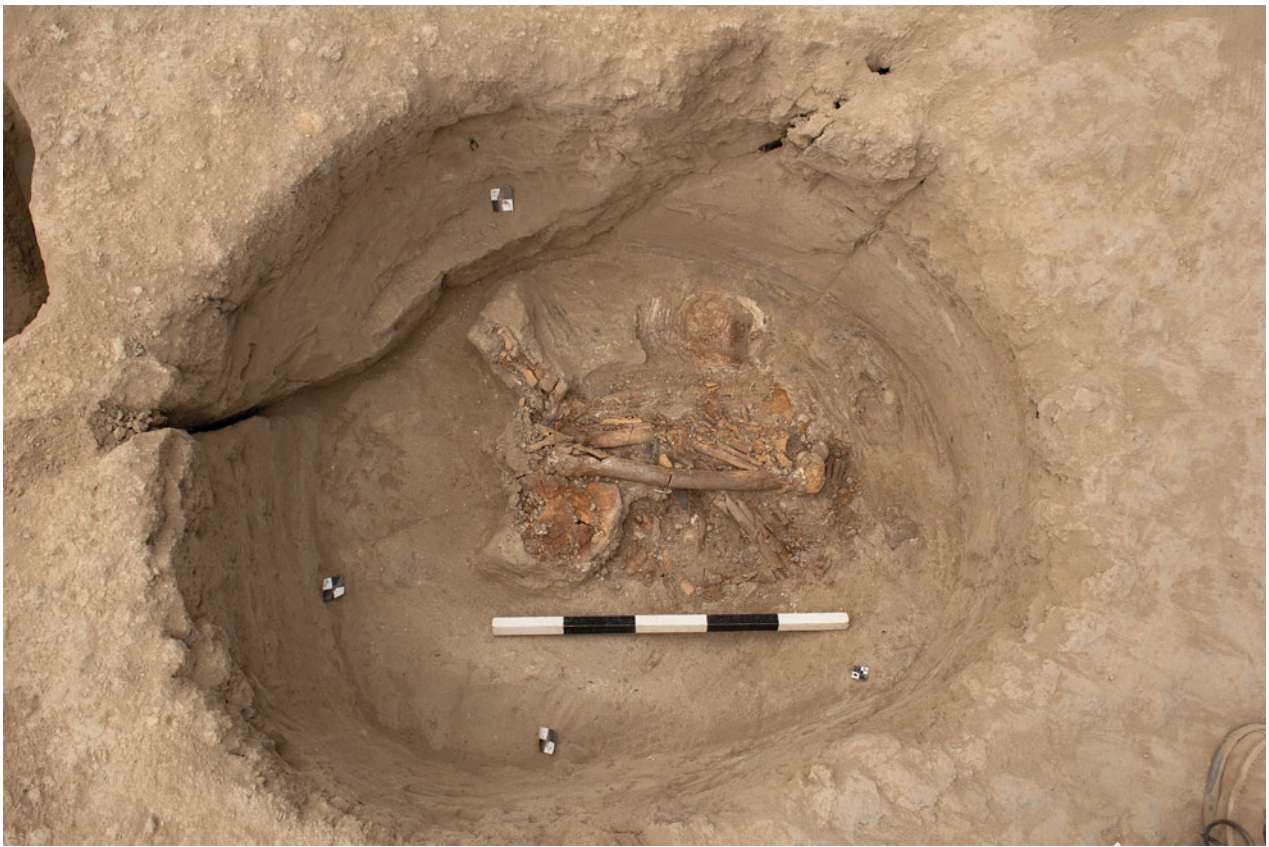
Figure S31.29. Burial F.7834 of adult female skeleton (21672).