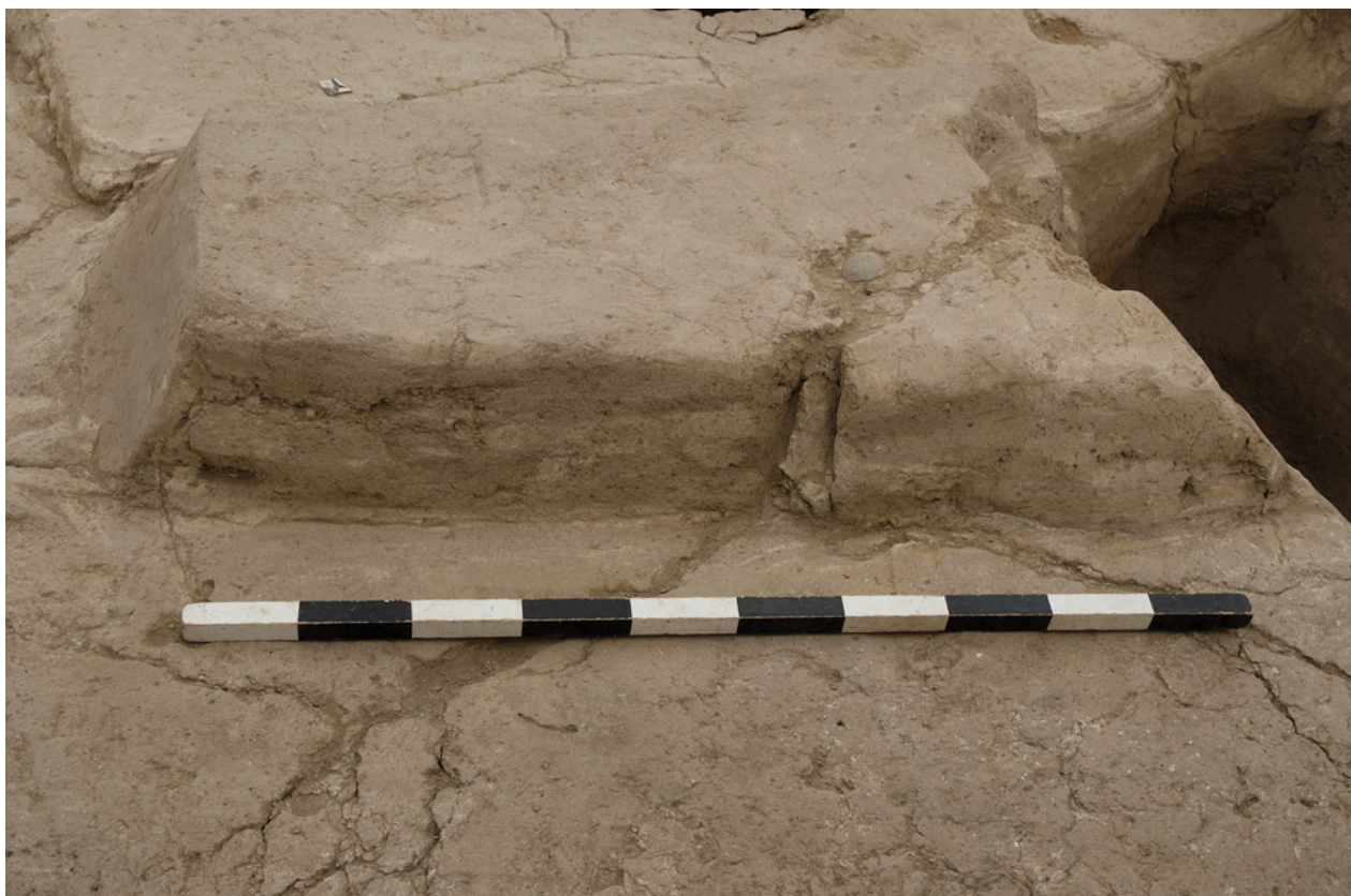
Figure S31.8. North-facing view of make-up (32740) of bench F.7879.