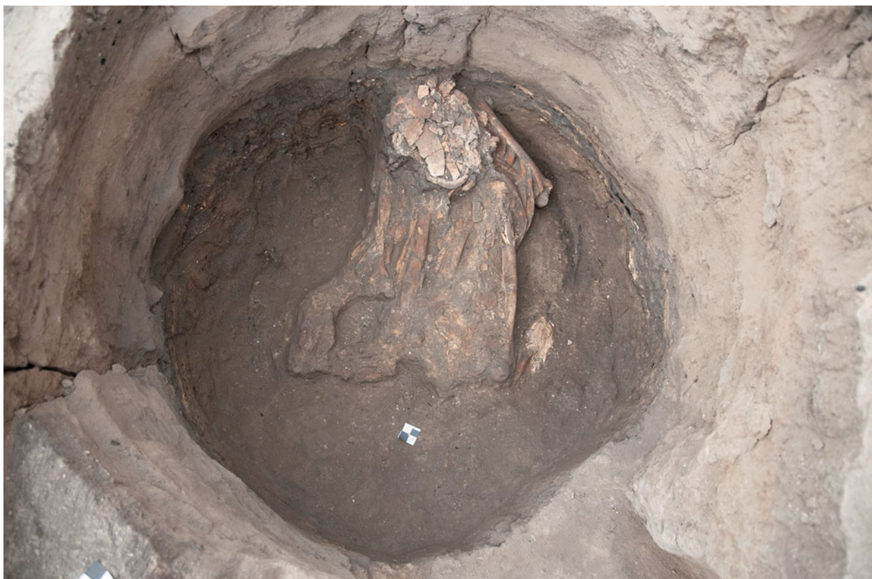
Figure S31.10. South-facing view of burial F.8319 within platform F.7733.