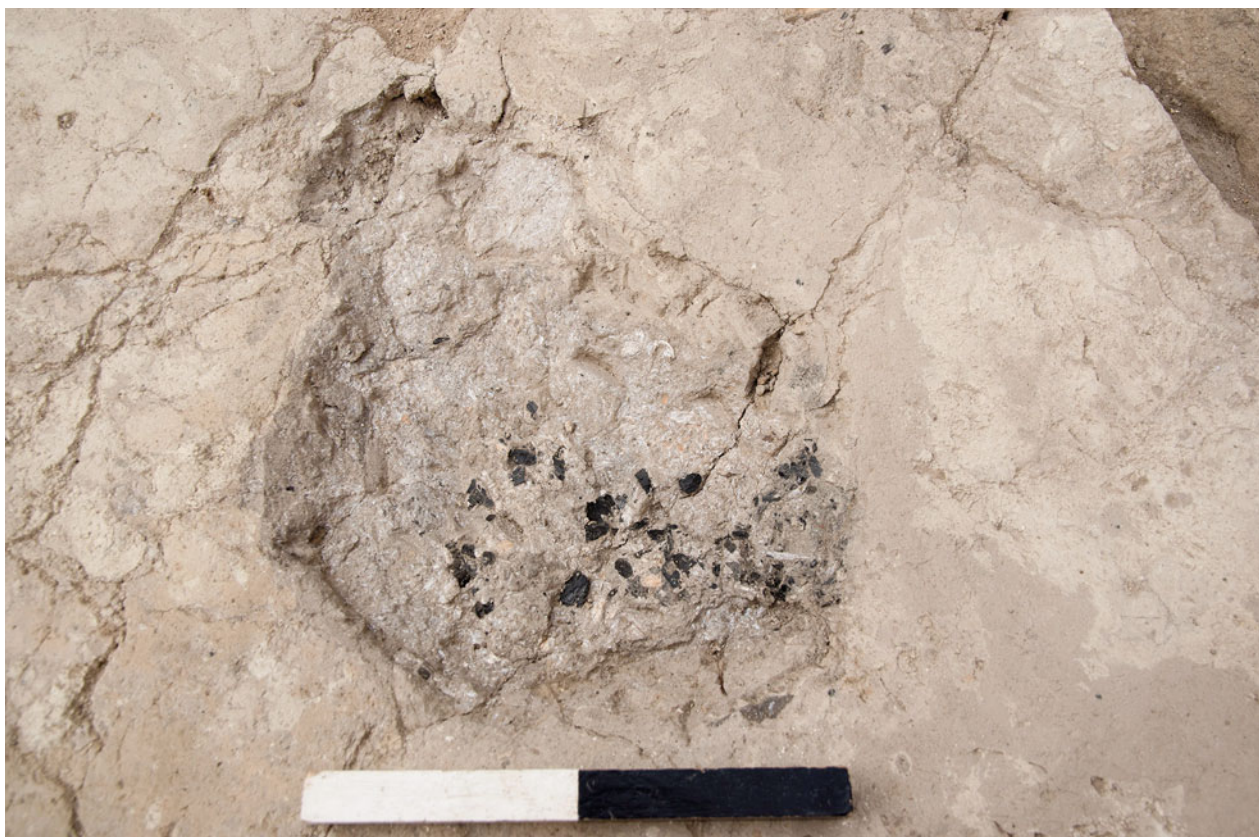
Figure S31.5. A shallow depression lined by phytoliths, F.8323 (photography by Duygu Ertemin).