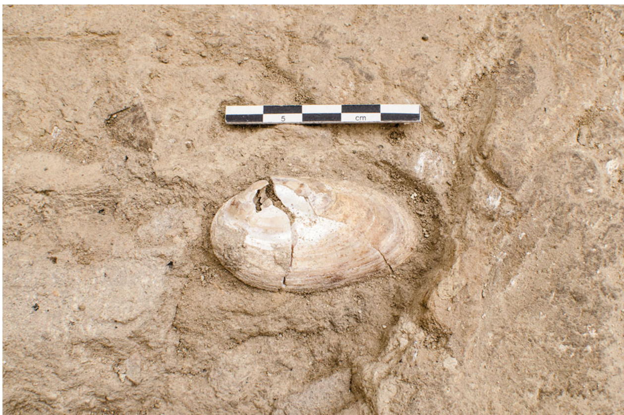
Figure S31.19. Shell 30575.x1 placed immediately under bin F.7139.