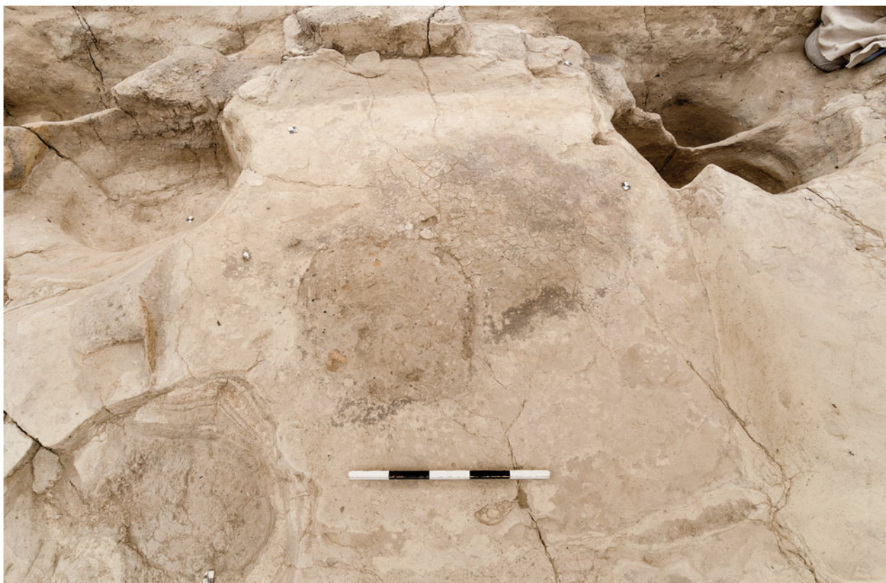
Figure S31.18. Burnt layer (32038) on platform F.7734, immediately next to burial fill (32040).