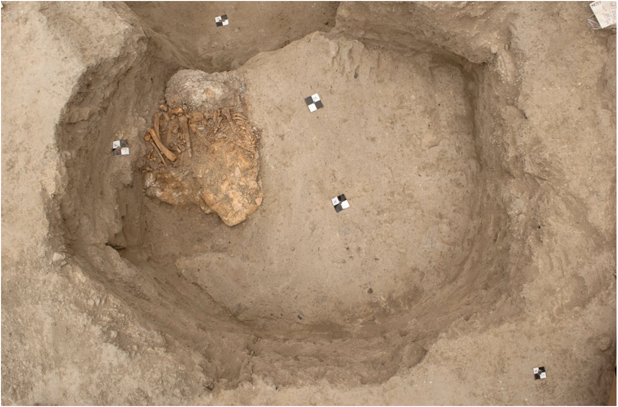
Figure S31.26. North-facing view of burial F.7633 of infant (21676).