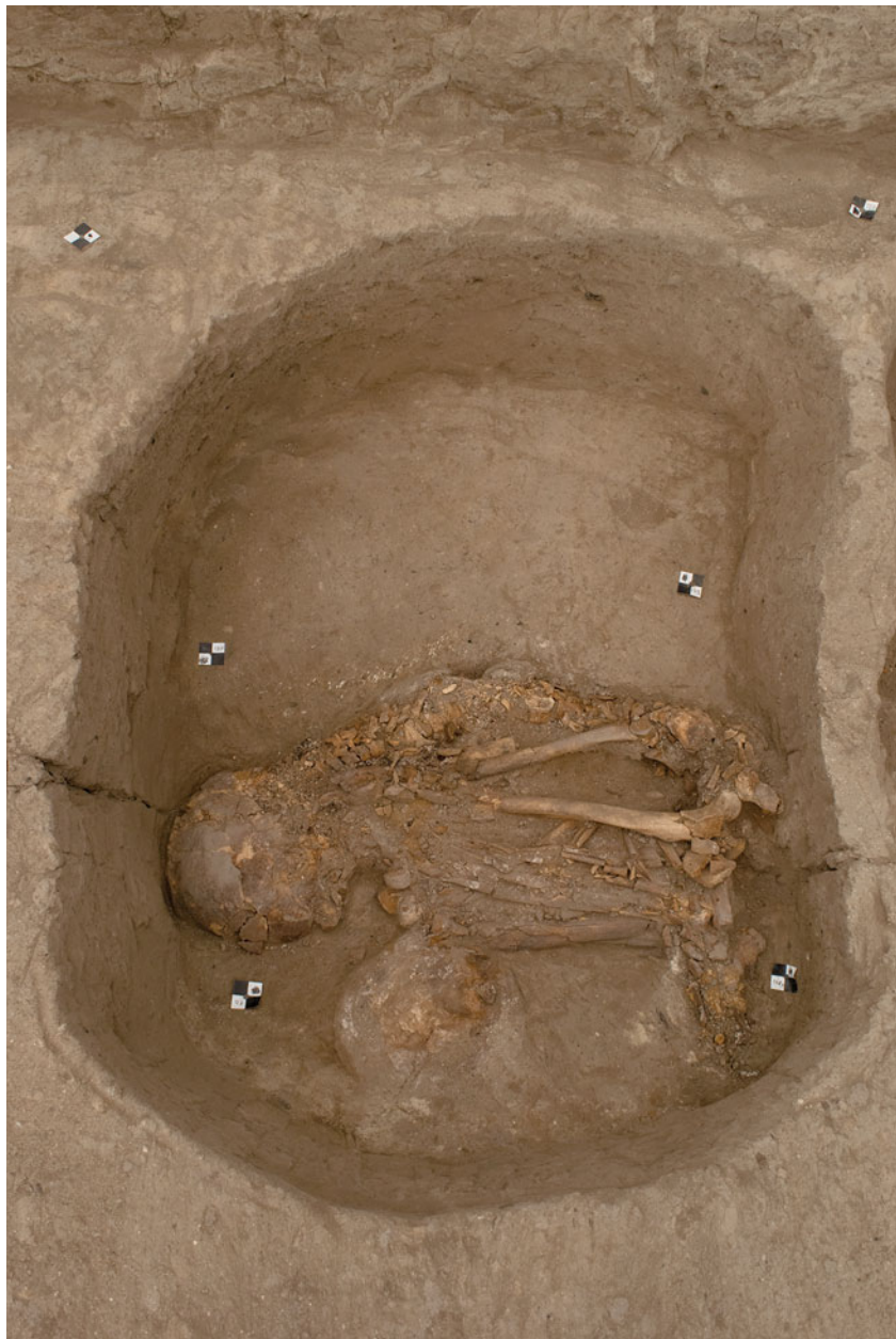
Figure S31.27. North-facing view of burial F.7863 of adult female (21687).