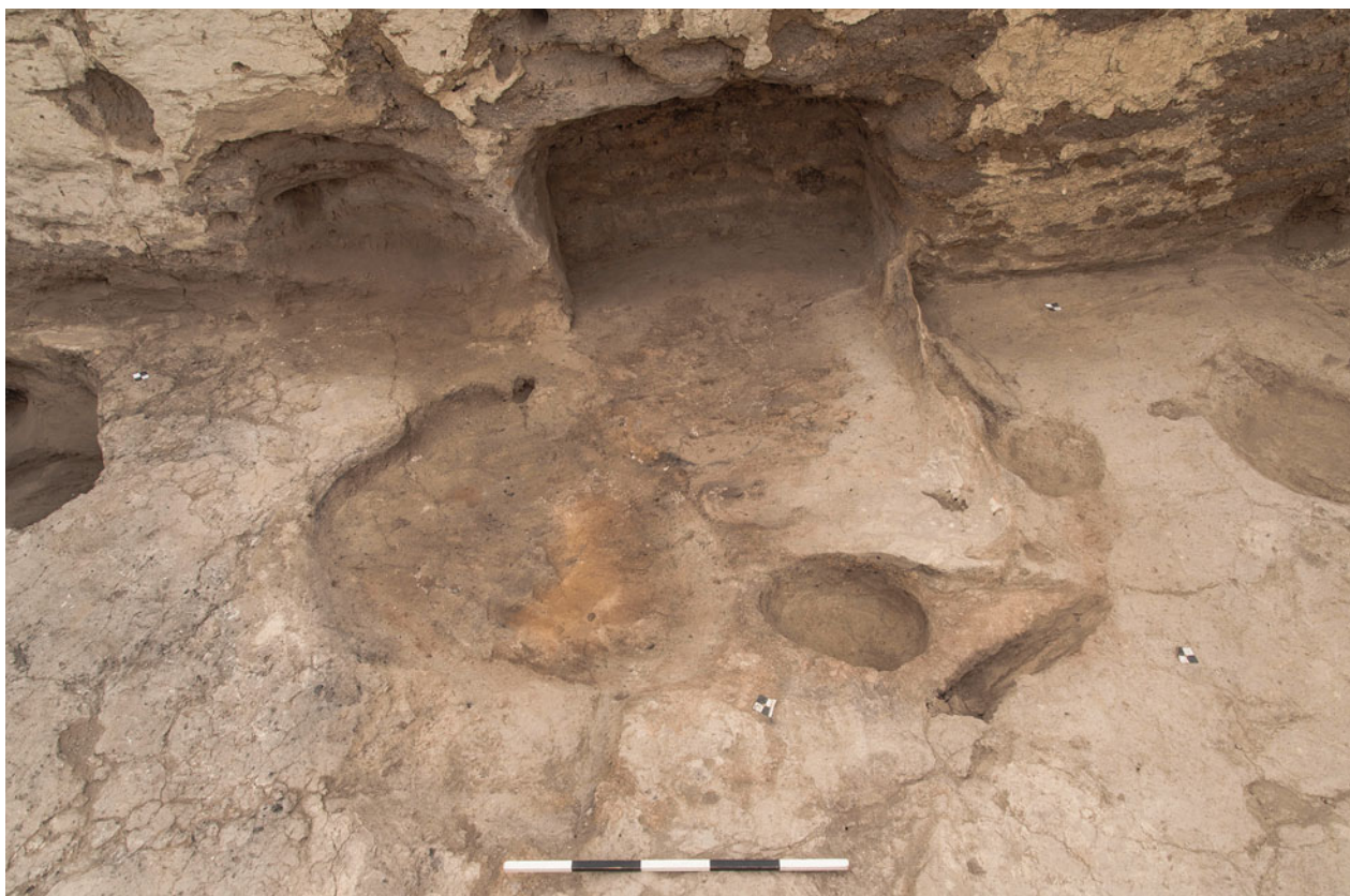
Figure S31.2. South-facing view of hearth F.8327 by the southern wall of Sp.633.