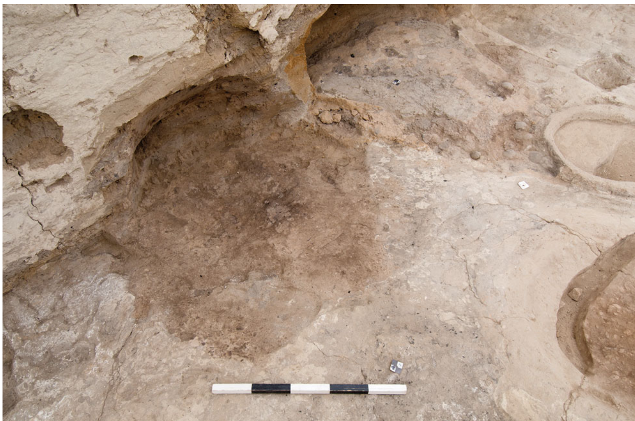
Figure S31.13. Fire-spot F.7741.