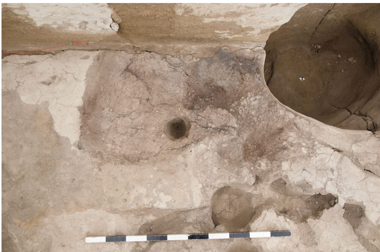
Figure S31.3. West-facing view of floor of oven F.8318 abutting the western wall of Space 531, F.7346.