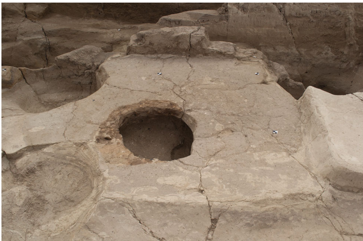
Figure S31.11. East-facing view of make-up (32083) on platform F.7734. The orange deposit lining cut (32087) for burial F.7747 is packing (32088).