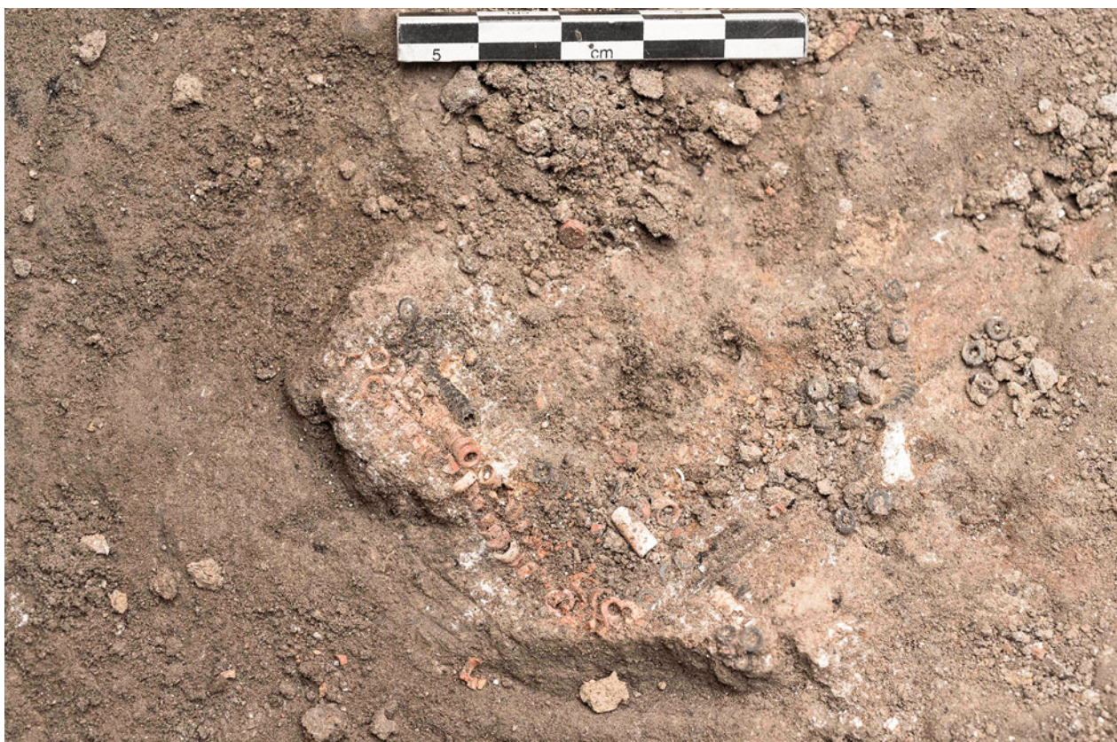
Figure S31.9. Rows of beads in situ within the fill of burial F.8331, by right wrist, recorded as 32767.x9, x12 and x13.