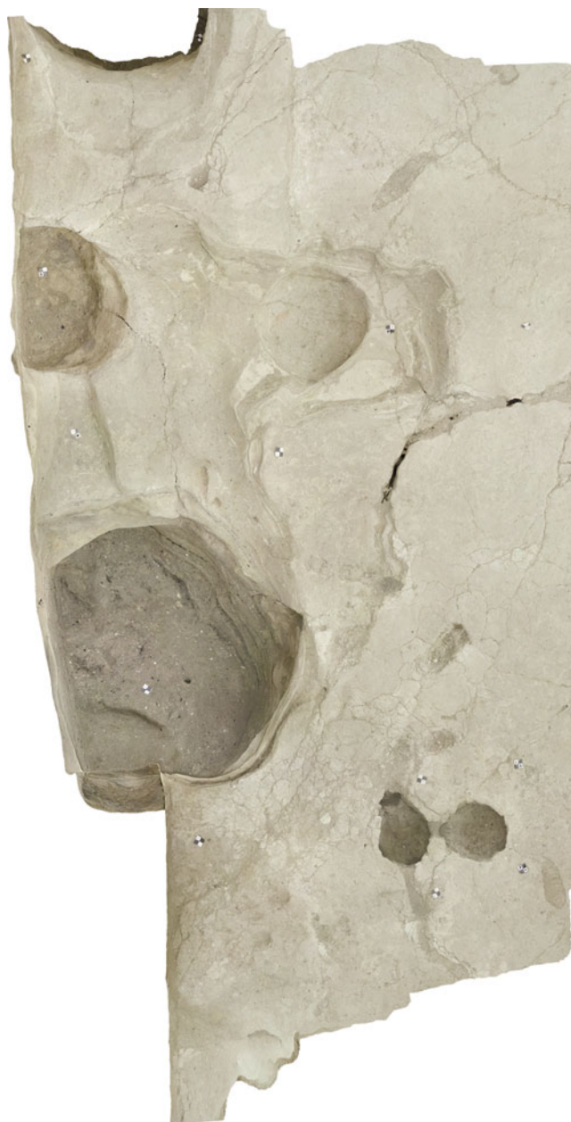
Figure S31.20. Orthophoto of post-retrieval pit F.7873 (orthophoto from a 3D model created by Jason Quinlan).