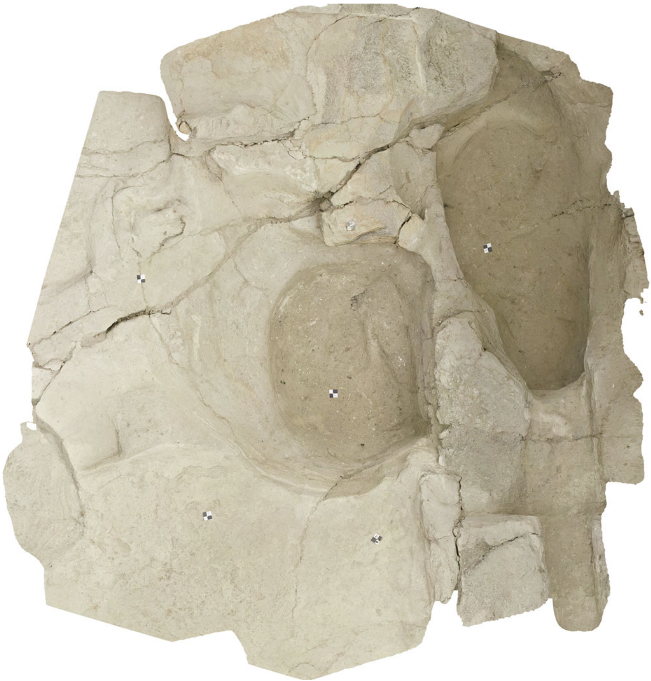
Figure S31.25. Orthophoto of post-retrieval pit F.7870 with F.7725 to its east (orthophoto from a 3D model created by Jason Quinlan).