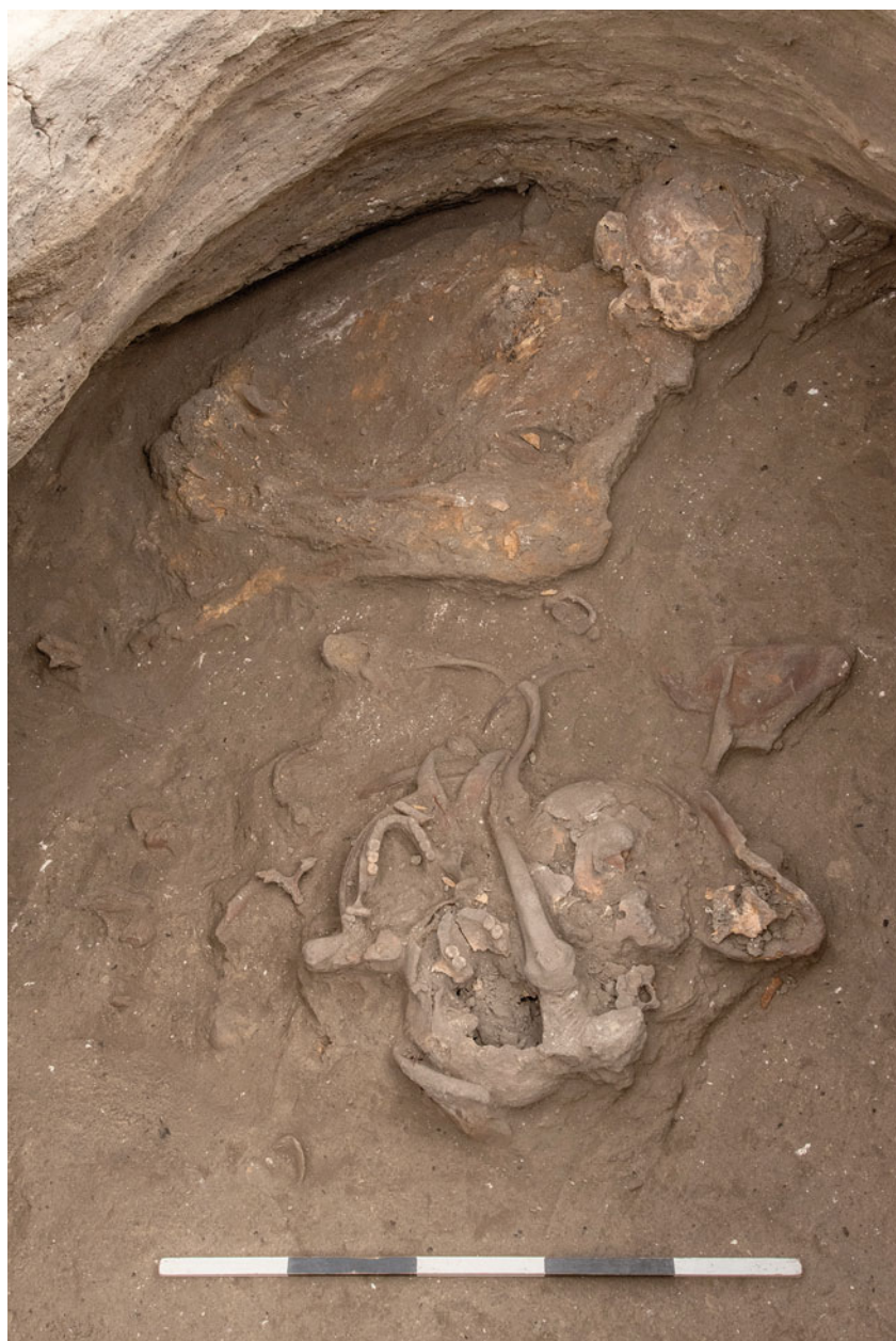
Figure S31.12. North-facing view of burial F.7747.