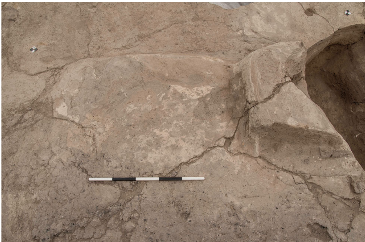
Figure S31.4. North-facing view of bench F.7879, with its core (32794) and remnants of plastered surface (32784).